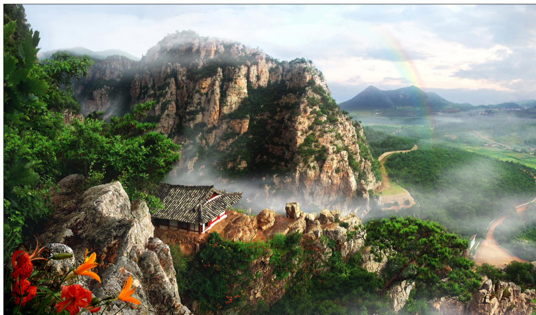
A rainbow appears over the Hyon Temple on Mt Jangsu.

The mountain was also called Mt Hongak in spring, Mt Chongak in summer, Mt Phungak in autumn and Mt Paegak in winter for its beautiful