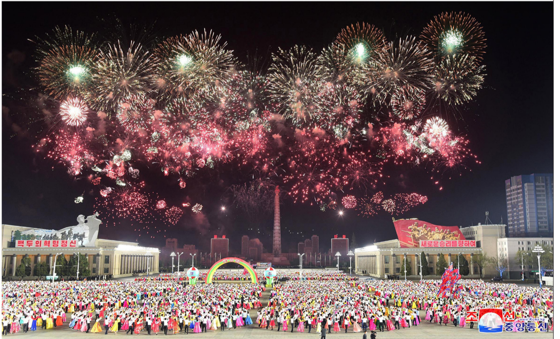
A variety of celebrations take place to mark the Day of the Sun including the national photo exhibition, national pencil drawing and calligraphy festival, art performances and fireworks display.