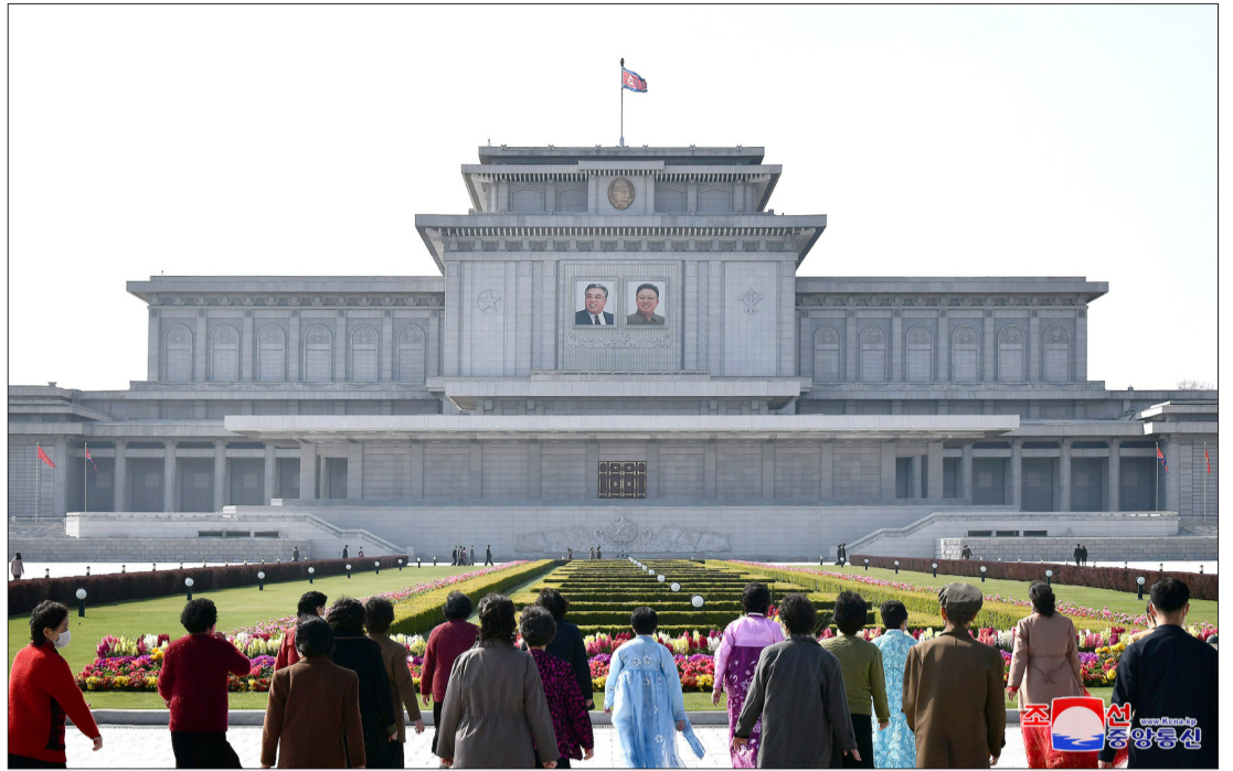
People from all walks of life visit the Kumsusan Palace of the Sun to pay homage to the great leaders.

Officials and members of the women's union held dance parties at the plaza of the Arch of Triumph on April 15.