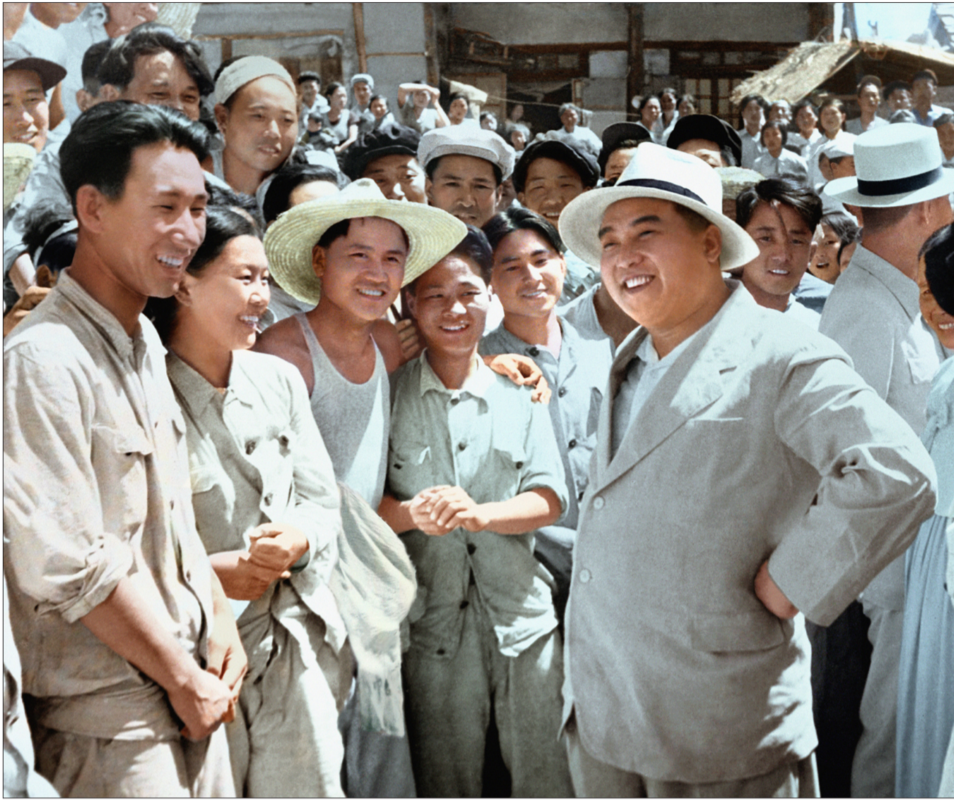
President Kim Il Sung meets with university students engaged in the construction of Pyongyang in June 1957.

with long colourful furs at the feet. After learning about its annual amount of egg laying, he said that a good hen is a good layer and a fine-looking hen is of no use, adding that he would come there every day if there were any prolific layers, even though they