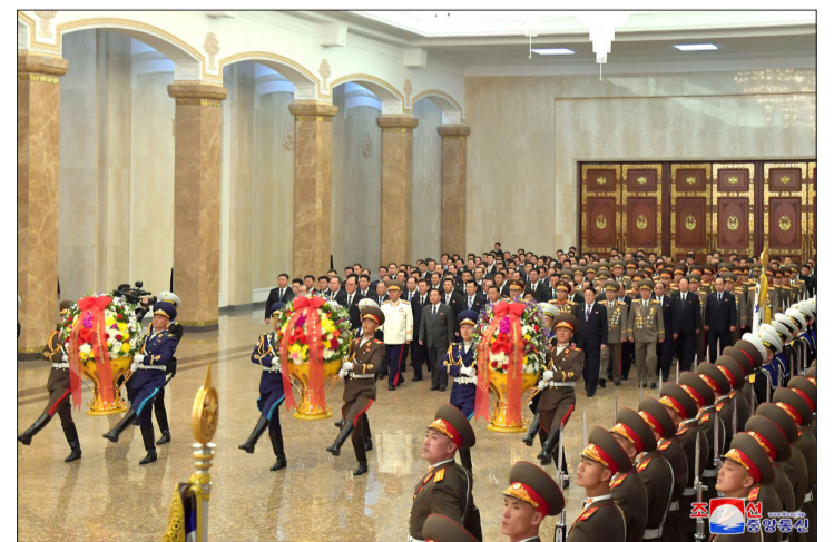
Members of the Party central leadership body visit the Kumsusan Palace of the Sun to mark the 109th anniversary of the birth of President Kim Il Sung.

The members of the leadership body of the Party Central