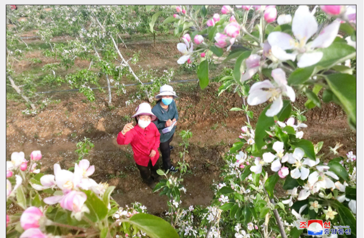
Farmers smile at blossoms on apple trees at the Taedonggang Combined Fruit Farm.

are carrying on the work of improving the quality of water turbines according to phased and annual plans.