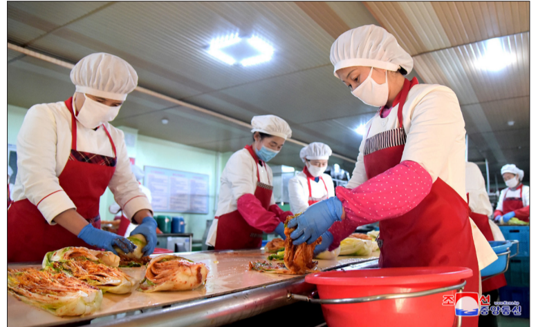
Employees put seasonings into bok choy at the Phyongchon Kimchi Factory.

Kimchi produced by the Phyongchon Kimchi Factory in Pyongyang are now much sought after by the residents in Phyongchon District.