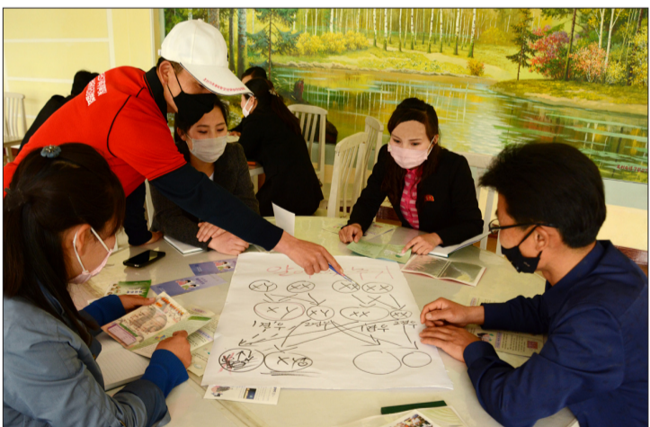
KFP&MCHA gives training to build up the ranks of volunteers.

Last year the Korean Family Planning & Maternal and Child Health Association drew up the guidelines for implementing national family planning in cooperation with the Ministry of Public Health of the DPRK. The guidelines highlight the issues of guaranteeing clients' sexual and reproductive health rights (SRHR) and quality of care.