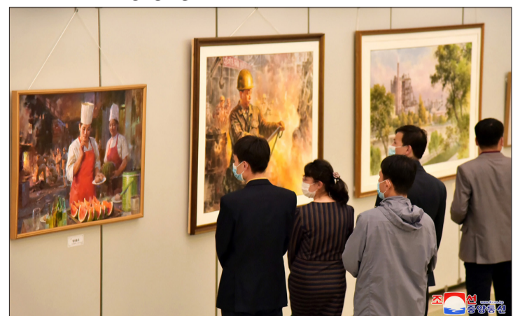
A national art exhibition of budding artists opens at the Okryu Exhibition Hall in Pyongyang on May 11.