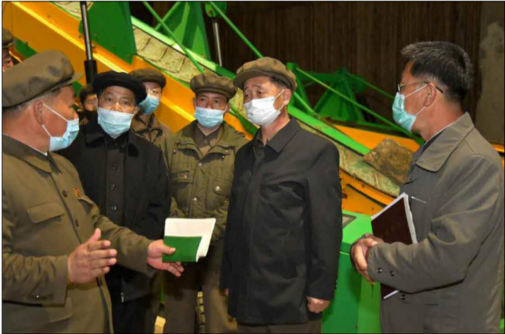
Premier Kim Tok Hun (second right) is told about production at the Samjiyon Potato Farina Factory.

Premier Kim Tok Hun, who is member of the Presidium of the Political Bureau of the Central Committee of the Workers' Party of Korea, inspected different places of the City of Samjiyon.