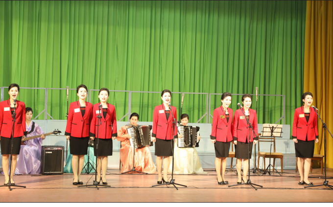
Saleswomen at Pyongyang Department Store No. 1 perform as part of their artistic activities.