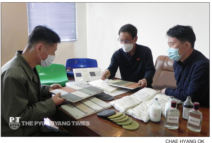
Researchers work on a variety of building materials at the North Hamgyong provincial building materials institute in the effort to satisfy the local needs.

and discharges oxygen, while mussels behave the other way round. Trepang and scallops eat kelp leaves falling from above and their excrement becomes manure needed for the growth of kelp.