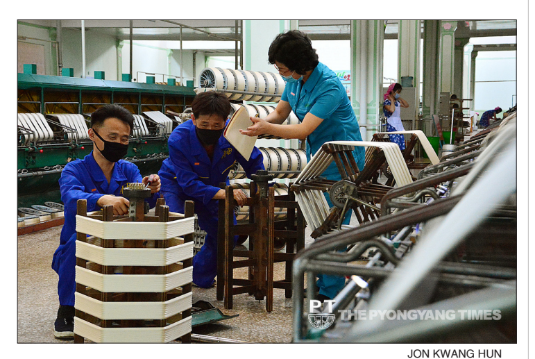
Employees discuss how to ensure domestic production of a reeler at the Pyongyang Kim Jong Suk Silk Mill.

based on accurate calculation and take an active part in its implementation. Therefore, valuable technical findings they create every month play a decisive role in reducing costs and boosting production.