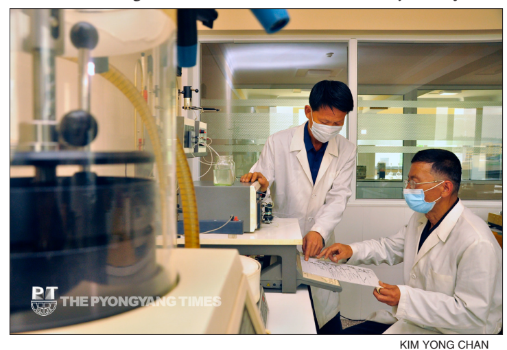
Researchers work at a lab of the Plant Protection Science Institute under the Academy of Agricultural Science.