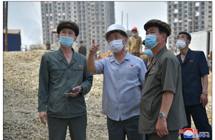
Premier Kim Tok Hun (centre) inspects a construction site of 10 000 flats in Pyongyang.

Premier Kim Tok Hun, who is also member of the Presidium of the Political Bureau of the Central Committee of the Workers' Party of Korea, inspected the construction sites of 10 000 flats in Pyongyang.