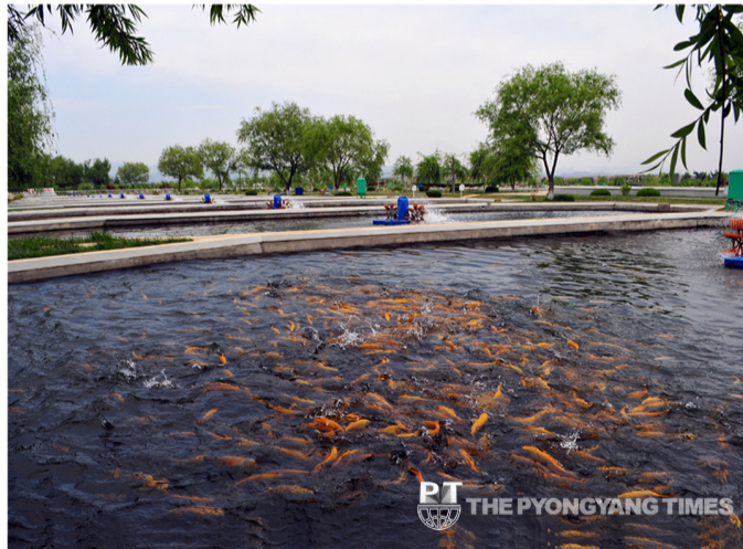
RYANG KUM CHOL