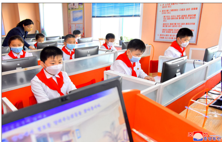
Pupils at Ryomyong Primary School in Taesong District, Pyongyang, learn how to use computers with the help of their teacher.