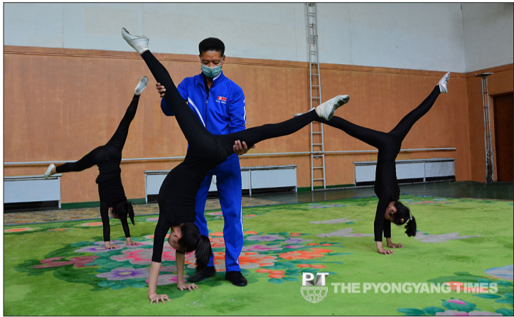
CHAE MYONG RIM

An instructor teaches students elementary acrobatic skills at Pyongyang Acrobatic School of the National Acrobatic Troupe.