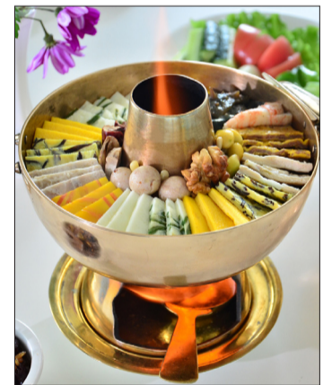
PANG UN SIM / KUMSUGANGSAN