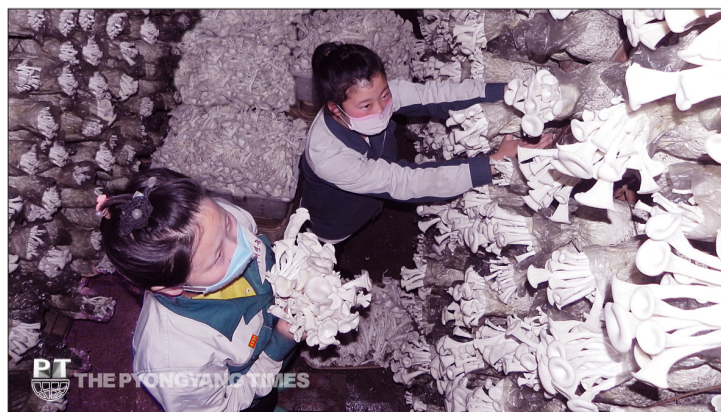
Two employees pick mushrooms at the Nampho City Mushroom Farm.