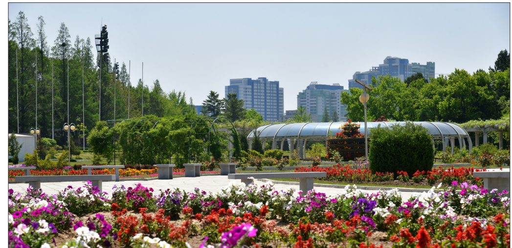
From left: Mansudae fountain-flower park. Roses in full bloom add more beauty to Pyongyang.