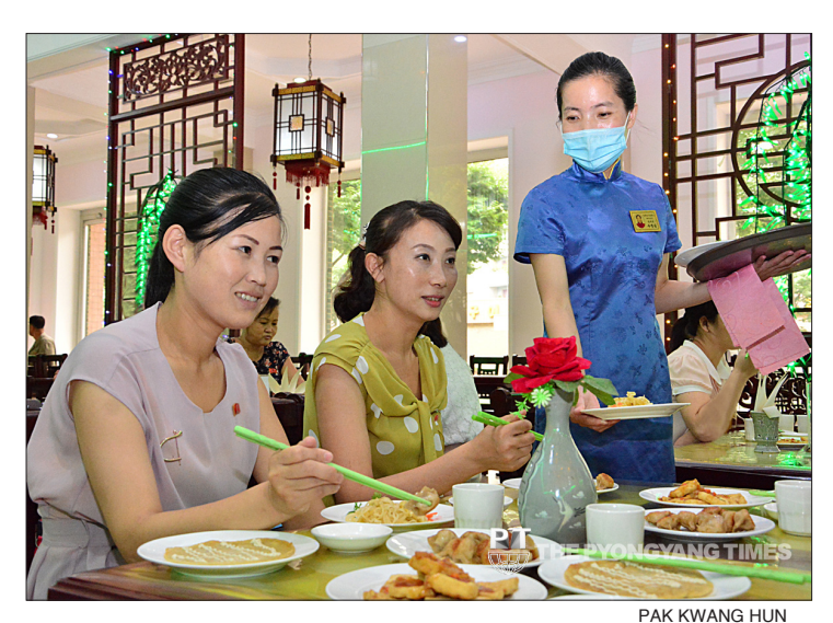
Diners have lunch at the Zhajiang House in Changgwang food alley.

Over 20 restaurants stand side by side on both sides of Changgwang Street of Pyongyang, which serve different kinds of dishes including traditional and world cuisines.