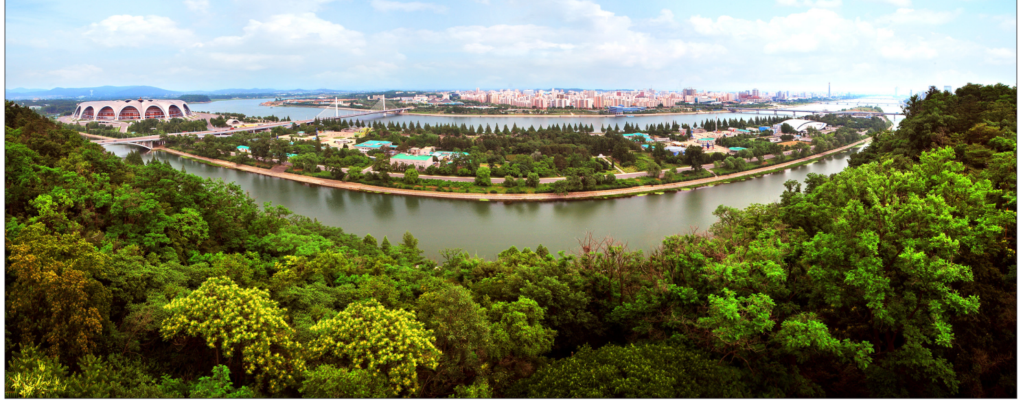
A panoramic view of Rungna Islet from Pyongyang's Moran Hill in luxuriant foliage.