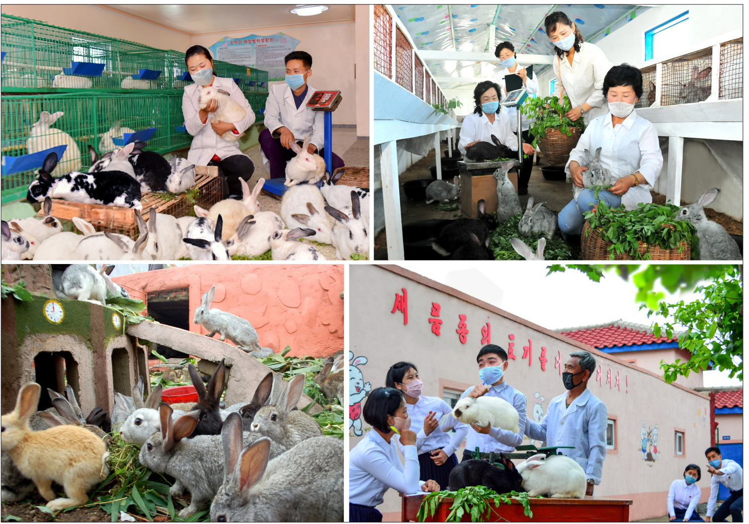
Rabbit-raising is in vogue across the DPRK at farms, establishments, families and schools.

It regularly sterilizes rabbit coops with flame, ultraviolet rays and indigenous microorganisms and takes thorough antiepizootic measures by applying preventive medicines made by