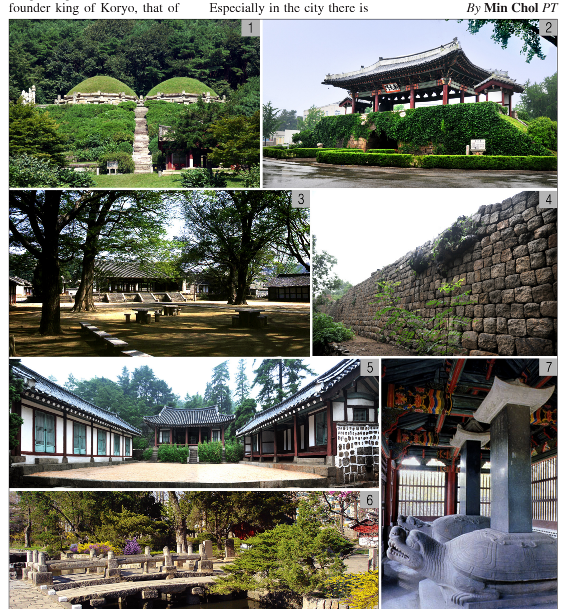
1. Mausoleum of King Kyonghyo. 2. South Gate in Kaesong. 3. Koryo Songgyungwan. 4. Part of walled city of Kaesong. 5. Sungyang Confucian School. 6. Sonjuk Bridge. 7. Monuments to Fidelity of Jong Mong Ju.

There are many other historical sites in Kaesong, such as the Kaesong Chomsongdae Observatory, Sonjuk Bridge, Monuments to Fidelity of Jong Mong Ju and Myongrung Cluster. Twelve of them were inscribed in the world cultural heritage list in 2013 as representative heritage elements testifying to the culture and history of Koryo.