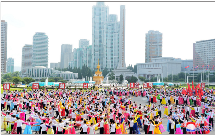
Youth, students and women's union members hold dancing parties respectively on August 25 at the plazas in front of the April 25 House of Culture and the Arch of Triumph in Pyongyang.