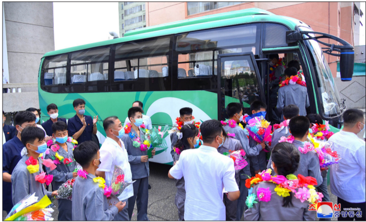
Volunteers to the livestock farming base in the Sepho area are given a hearty send-off.

Brilliant feats of Korean young people who displayed matchless heroism and self-sacrificing spirit in national defence and socialist construction have clearly been etched in the over 70-year history of the development of the DPRK.