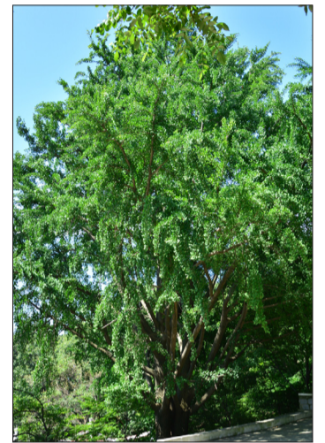
AN YONG CHOL