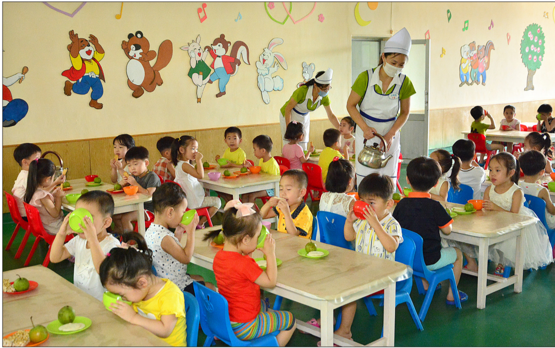
RA PHYONG RYOL / KOREA TODAY