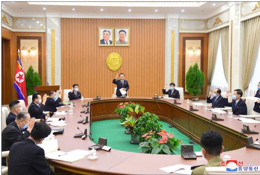
The 16th Plenary Meeting of the 14th Standing Committee of the Supreme People's Assembly of the DPRK is held at the Mansudae Assembly Hall in Pyongyang on August 24.

The 16th Plenary Meeting of the 14th Standing Committee of the Supreme People's Assembly of the DPRK was held at the Mansudae Assembly Hall in Pyongyang on August 24.