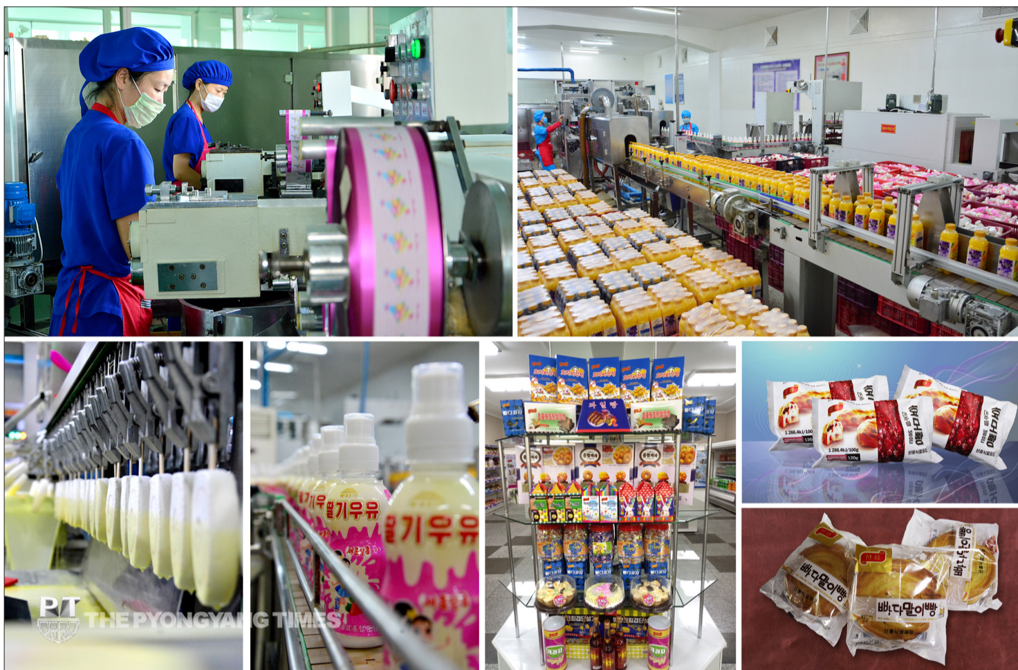
The Sonhung Foodstuff Factory and O-il General Health Drink Factory produce various kinds of foods.

The general foodstuff factories in each province also