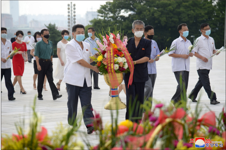
Working people in Pyongyang visit the statues of President Kim Il Sung and Chairman Kim Jong Il on Mansu Hill to pay tribute to the great leaders to mark the 61st anniversary of Chairman Kim Jong Il's first field guidance to the revolutionary armed forces.

Officials, service personnel and working people visited the statues of President Kim Il Sung