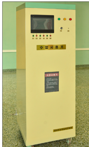
Hydraulic pressure testing device developed by the Pyongyang Electronic Medical Appliances Factory.