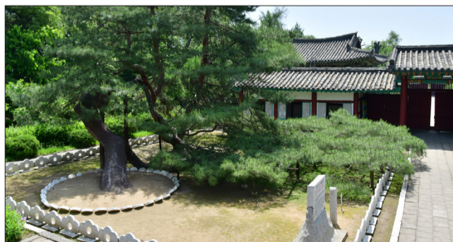
Pinus densiflora form in Hamhung.

are lots of twigs covered with green needles at the tips, forming a beautiful tray-shaped crown which is 13.8 metres in diameter.