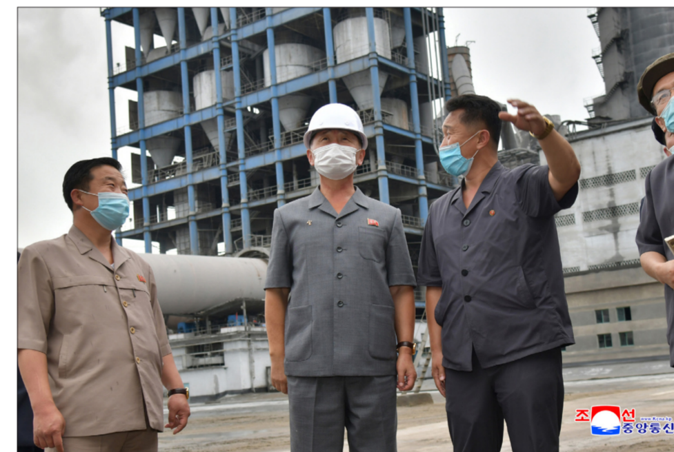
Premier Kim Tok Hun (second from left) looks round the Suncheon Cement Complex.