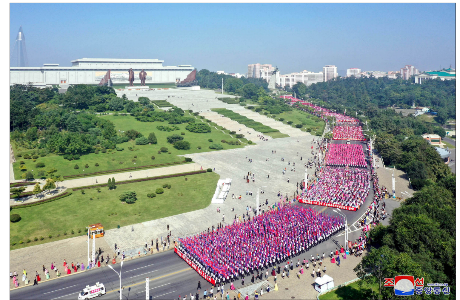
Columns of demonstrators march past the statues of President Kim Il Sung and Chairman Kim Jong Il on Mansu Hill in Pyongyang on September 9 to celebrate the 73rd anniversary of the DPRK.