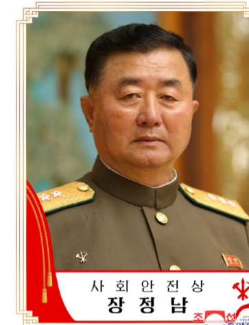
Jang Jong Nam, minister of Public Security