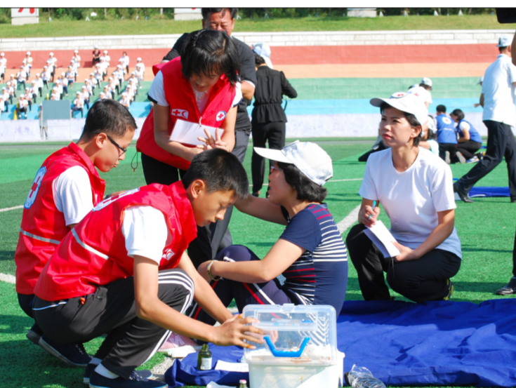
Young Koreans attend the First Aid Event of Red Cross Youth in 2017.

It has selected the theme for this year's World First Aid Day as "Be a first aid hero at school