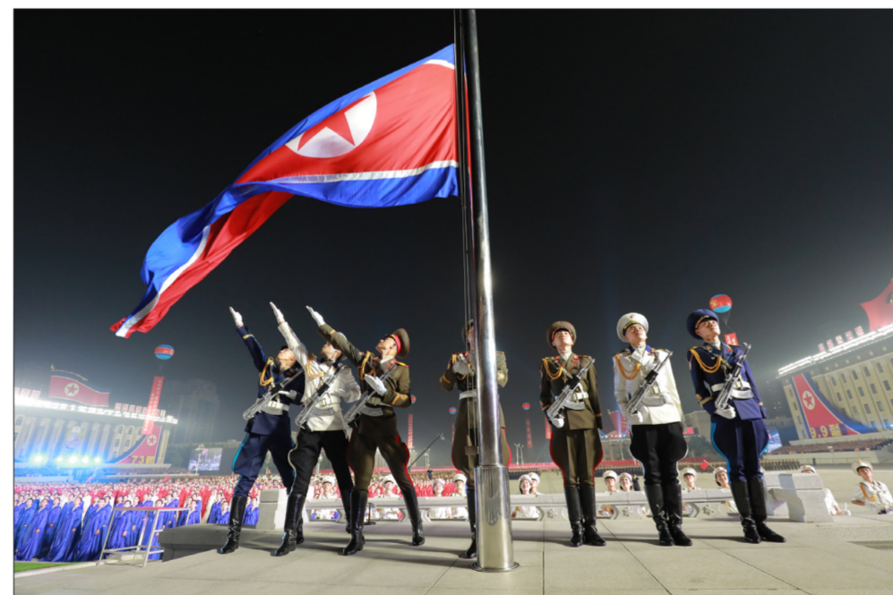
SEE PAGE 3

Entering the square first led by the lead car of the commander of the