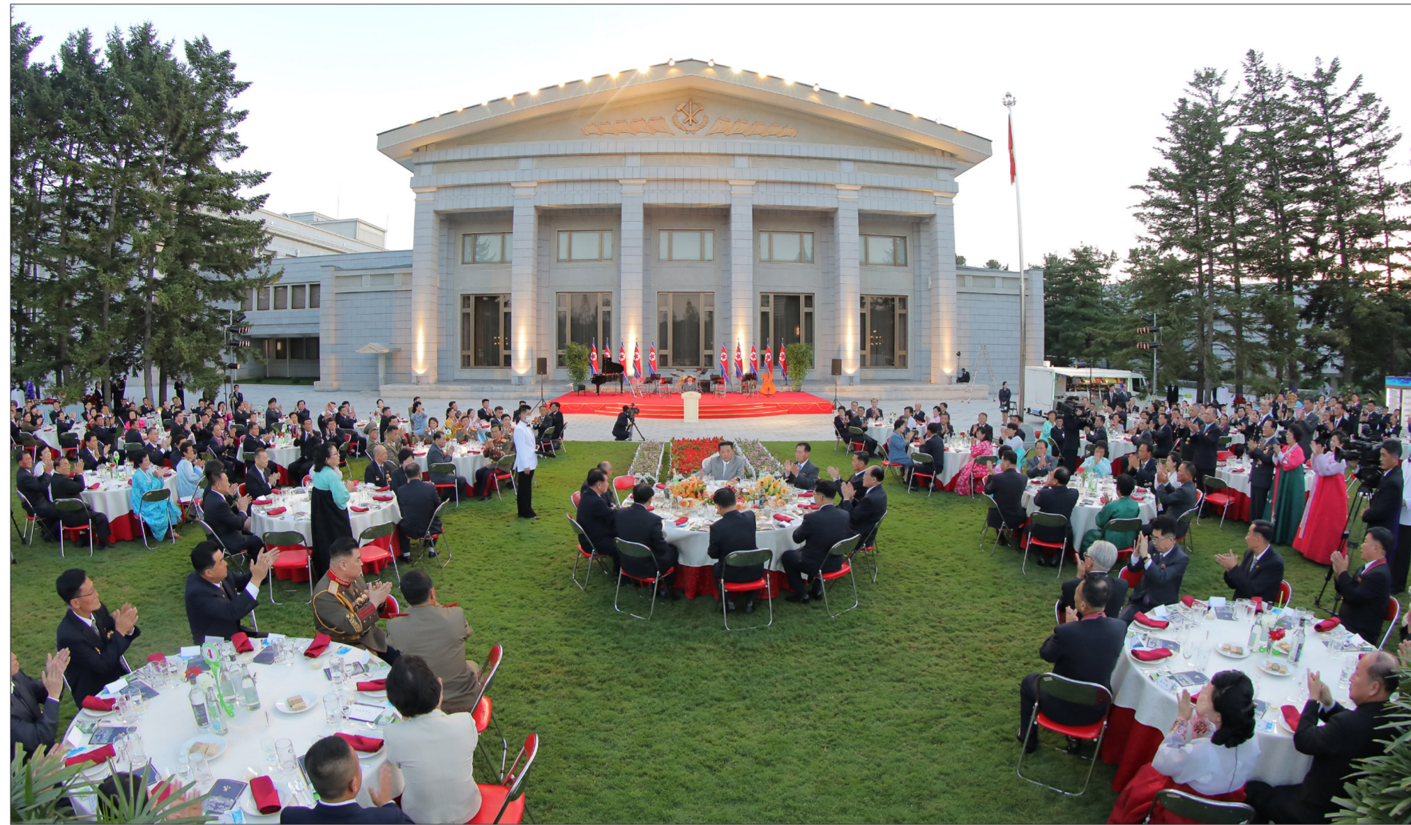
FROM PAGE 7

though they did what they ought to do for the motherland.