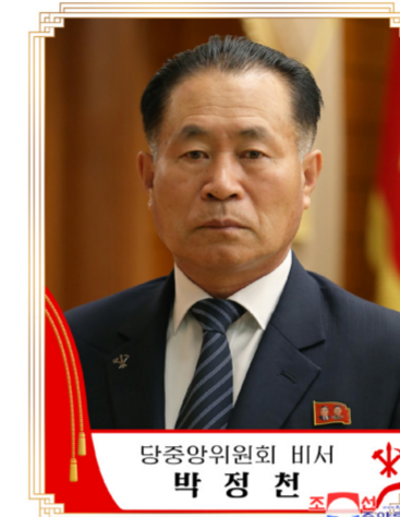
Pak Jong Chon, secretary of the WPK Central Committee