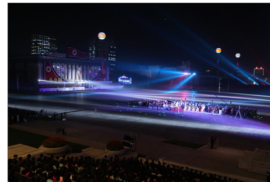
SEE PAGE 4

There were also the column of the State Academy of Sciences, and that of men of culture and art and sportspersons made up of those artistes, moviemen