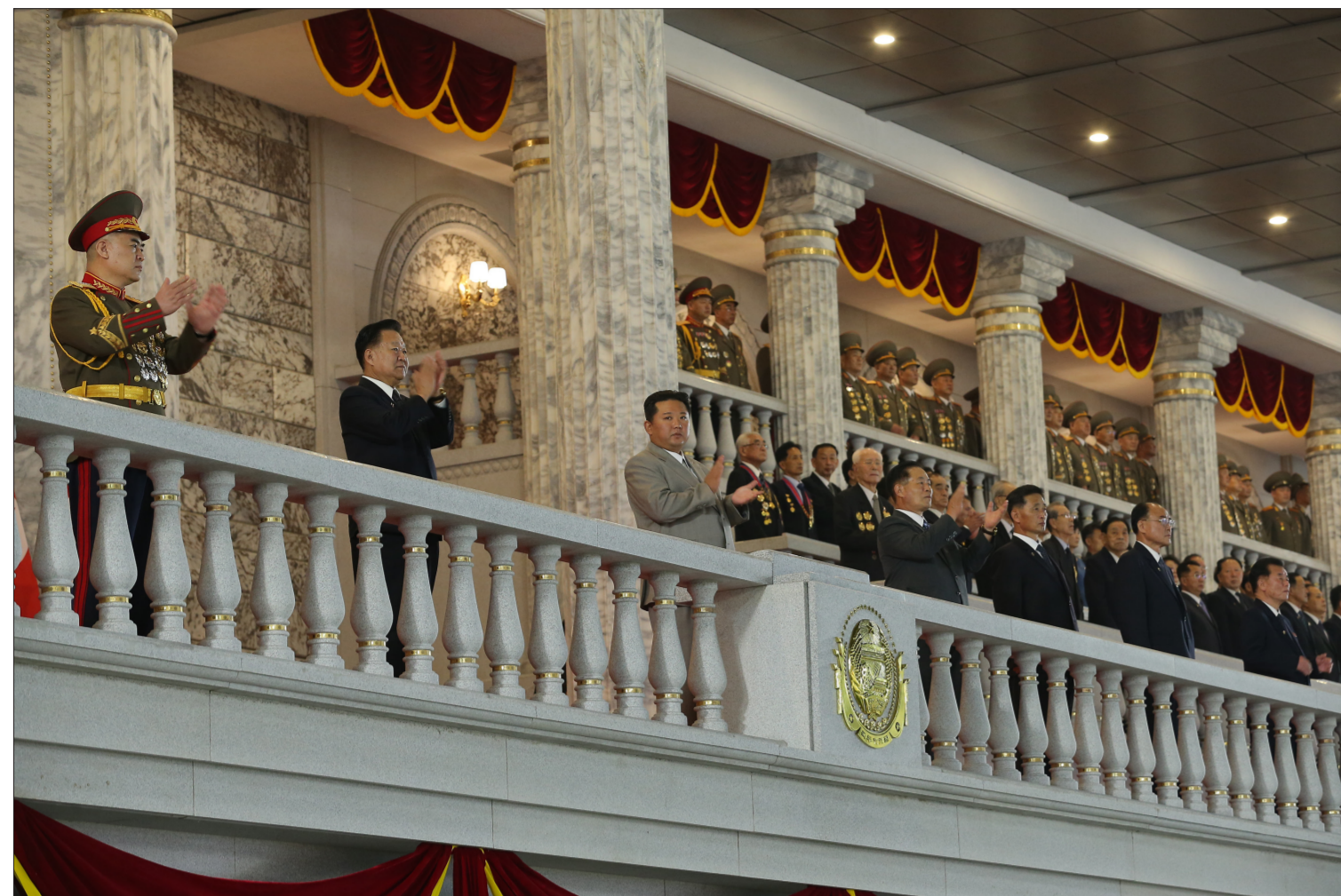
FROM PAGE 1

Ryong Hae, member of the Presidium of the Political Bureau of the WPK Central Committee, first vice-president of the State Affairs Commission of the DPRK and chairman of the Standing Committee of the Supreme People's Assembly, Jo Yong Won, member of the Presidium of the Political Bureau and secretary for Organizational Affairs of the WPK Central Committee, Kim Tok Hun, member of the Presidium of the Political Bureau of the WPK Central Committee and premier of the DPRK Cabinet, and Pak Jong Chon, member of the Presidium of the Political Bureau and secretary of the WPK Central Committee.