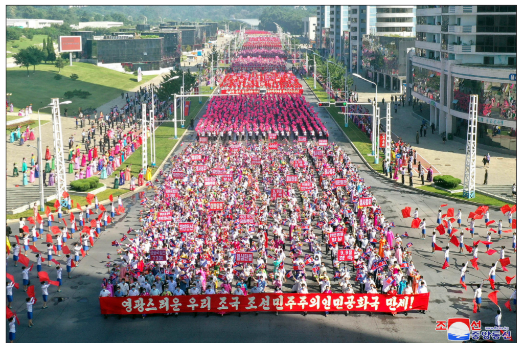
Participants in a mass demonstration march towards Kim Il Sung Square holding red flags, slogan boards and placards.