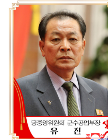
Yu Jin, director of the Department of the Munitions Industry of the WPK Central Committee