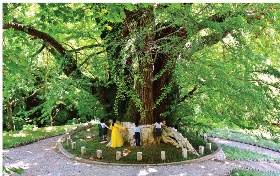
Several people put their open arms together around a 15-metre-round ginkgo tree that is 2 140 years old.