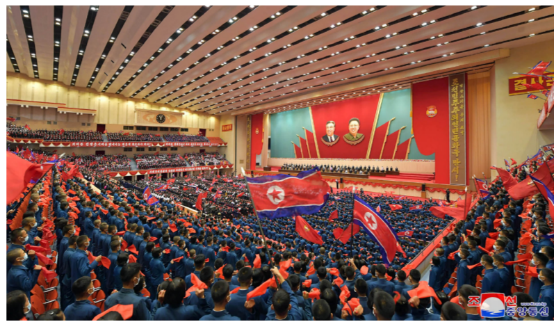
Young people who volunteered to work in the difficult and challenging sectors vow to demonstrate the mettle of the socialist patriotic youth after receiving the letter of congratulation from General Secretary Kim Jong Un.