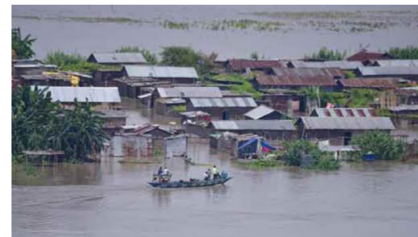
Houses partly submerged by flash flood in India.

Dozens of people were killed by lingering intense heat and over 8 000 others suffered from heatstroke in different parts of Japan.