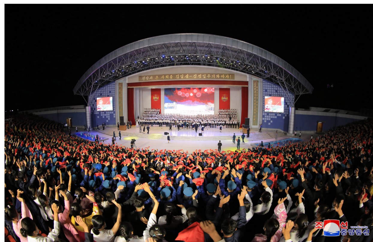
The participants in Youth Day celebrations have a good time enjoying art performances and riding amusement facilities.

revolutionary drama, opera and music and dance performance given by the artists of central artistic troupes at different theatres in the capital city, especially the Pyongyang Grand Theatre, East Pyongyang Grand Theatre, Ponghwa Art Theatre and National Theatre. They enjoyed a good time