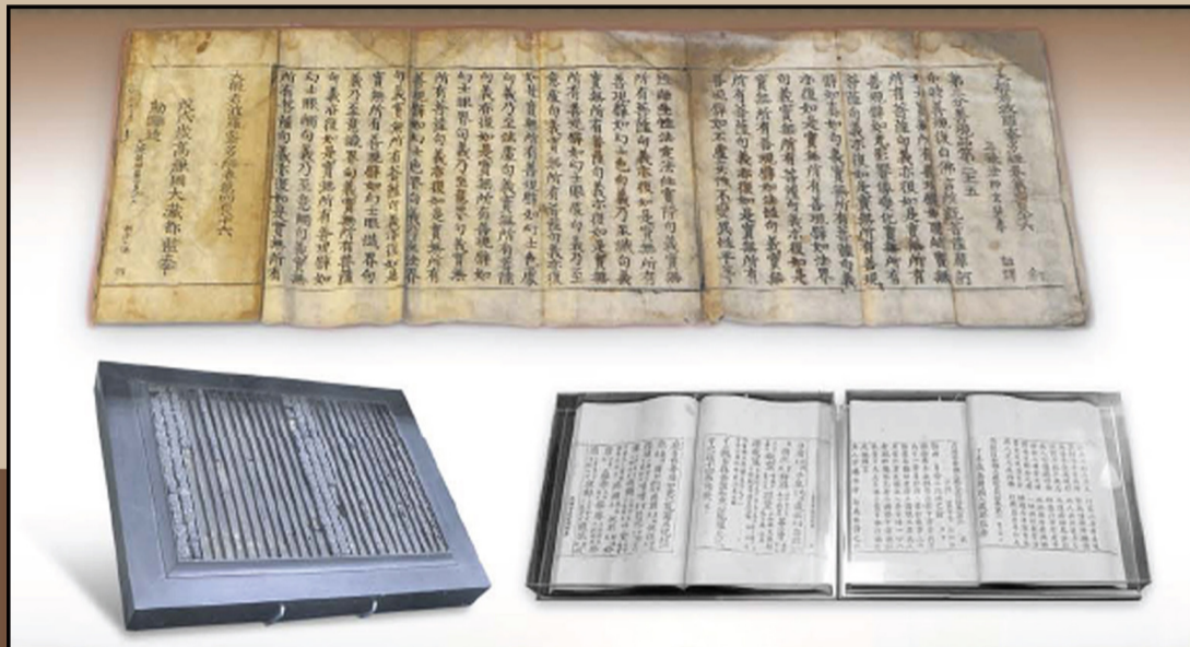
KONG YU IL / PICTORIAL KOREA