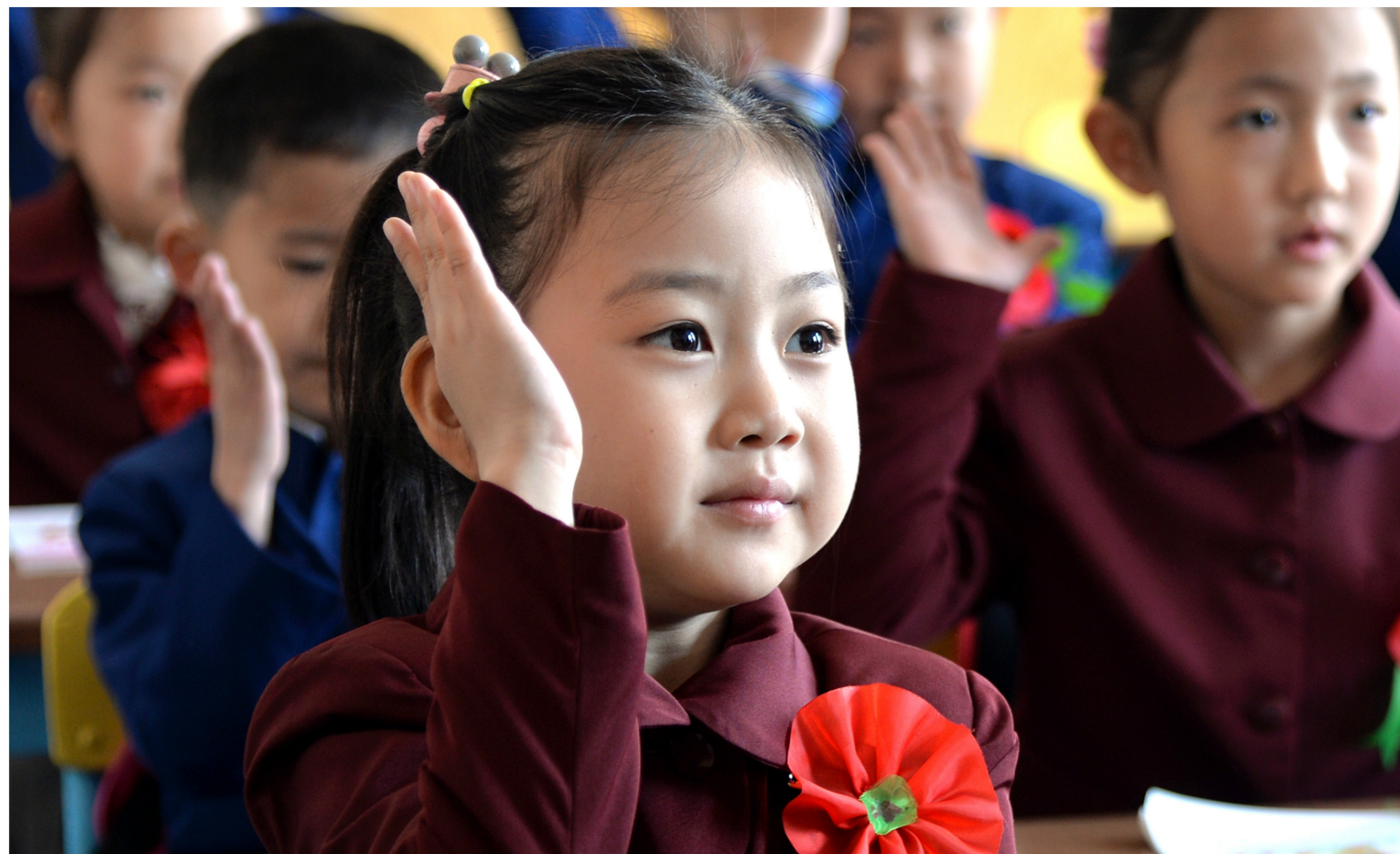
Pupils at Kim Song Ju Primary School attend the first lesson for the 2018 new school year. The universal 12-year compulsory education was taken into force across the country in 2017.