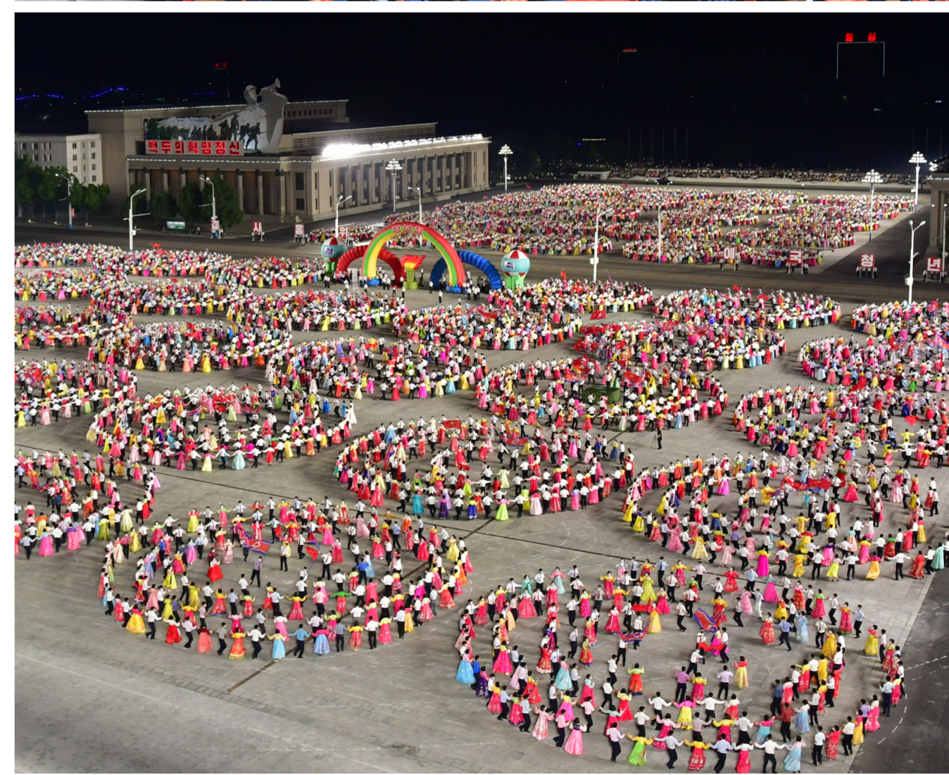
A gala evening of youth and students takes place at Pyongyang's Kim Il Sung Square on August 28.