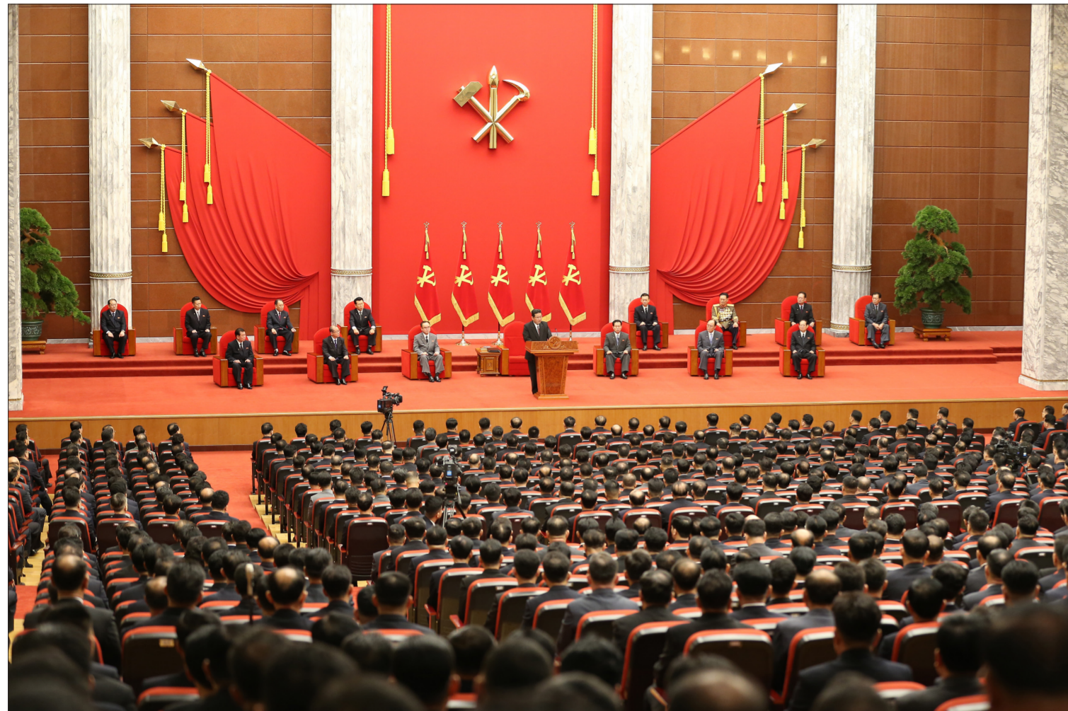
FROM PAGE 7