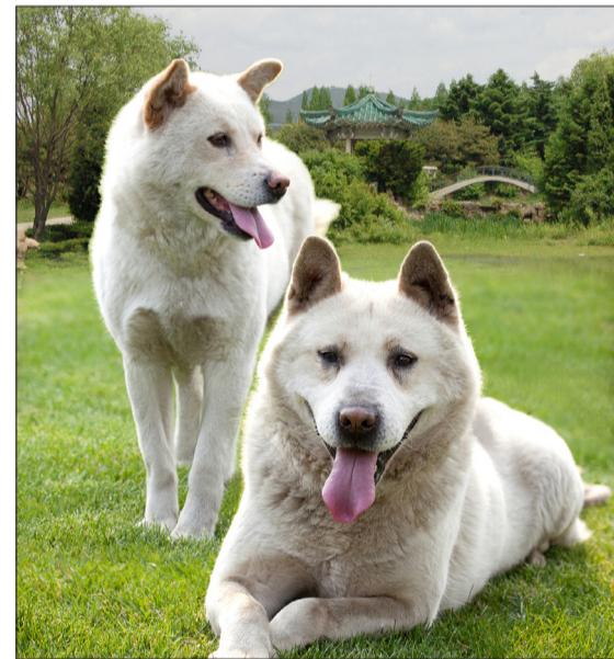
Phungsan, national dog of the DPRK.

Phungsan dog has been designated as a living monument of the DPRK and national dog to be under good protection.