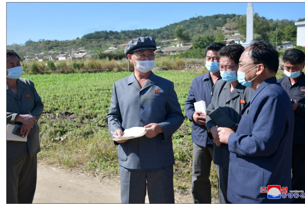
Premier Kim Tok Hun (second from left) acquaints himself with farming at Chojang Cooperative Farm in Kwaksan County.