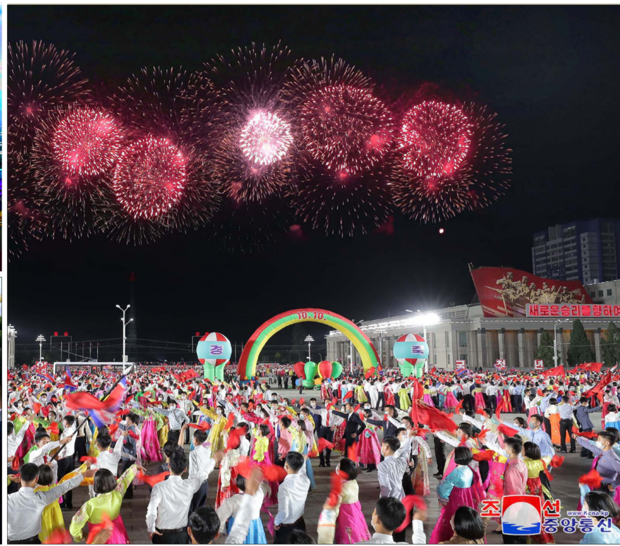
People from all walks of life pay floral tribute at the statues of President Kim Il Sung and Chairman Kim Jong Il on Mansu Hill in Pyongyang and artistic performances are given in different parts to celebrate the 76th birthday of the Workers' Party of Korea. Young Koreans dance to merry tune amid fireworks display at Kim Il Sung Square in Pyongyang to rev up festive mood.