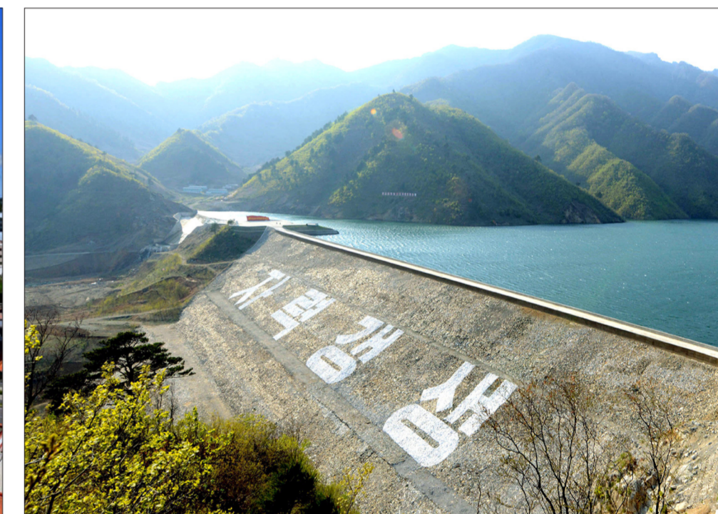
File photos show a new type of tramcar, shoes produced at the Wonsan Leather Shoes Factory, the dam of the Wonsan Army-People Power Station, part of renovated City of Samjiyon, and a flying microlight to name a few of the achievements over the past decade.