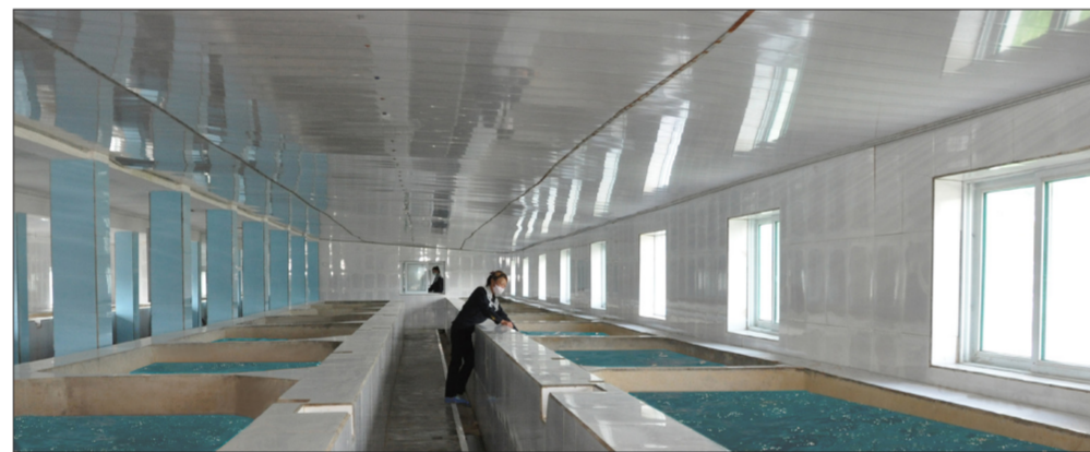
The Rinsan Catfish Farm mass-produces catfish by adopting advanced methods.