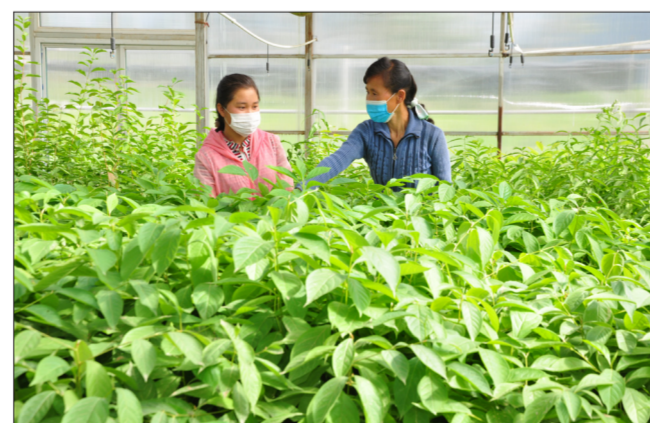
Workers tend tree saplings in a sapling greenhouse of the Rinsan County Forest Management Station.

The station turned out tens of thousands of tree saplings this year alone.