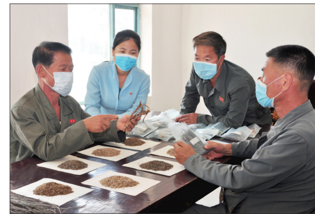
Employees discuss how to increase the varieties of herbs at the Rinsan Herb Farm. The herb garden of the farm.