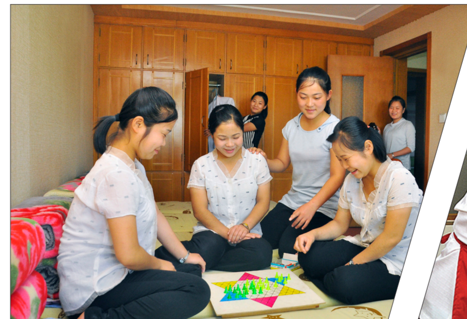
Girl weavers play a board game and prepare dinner at the hostel of the Pyongyang Kim Jong Suk Textile Mill.