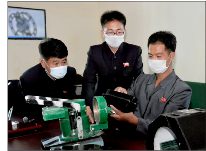
Technicians of the Kim Jong Thae Electric Locomotive Complex discuss how to improve the quality of braking device.

Besides, they introduced dozens of other technical innovation plans including the remodelling of ventilator of axle box, the installation of automatic temperature sensor of an annealing furnace and the manufacture of gear assembling and disassembling jig of passenger car.