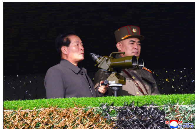
A live-fire competition of artillery sub-units under KPA mechanized units is held under the supervision of Pak Jong Chon, member of the Presidium of the Political Bureau and secretary of the Central Committee of the Workers' Party of Korea.

Pak Jong Chon was greatly satisfied with the competition results.