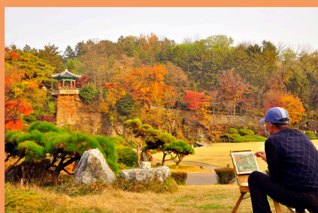
Related story, p9