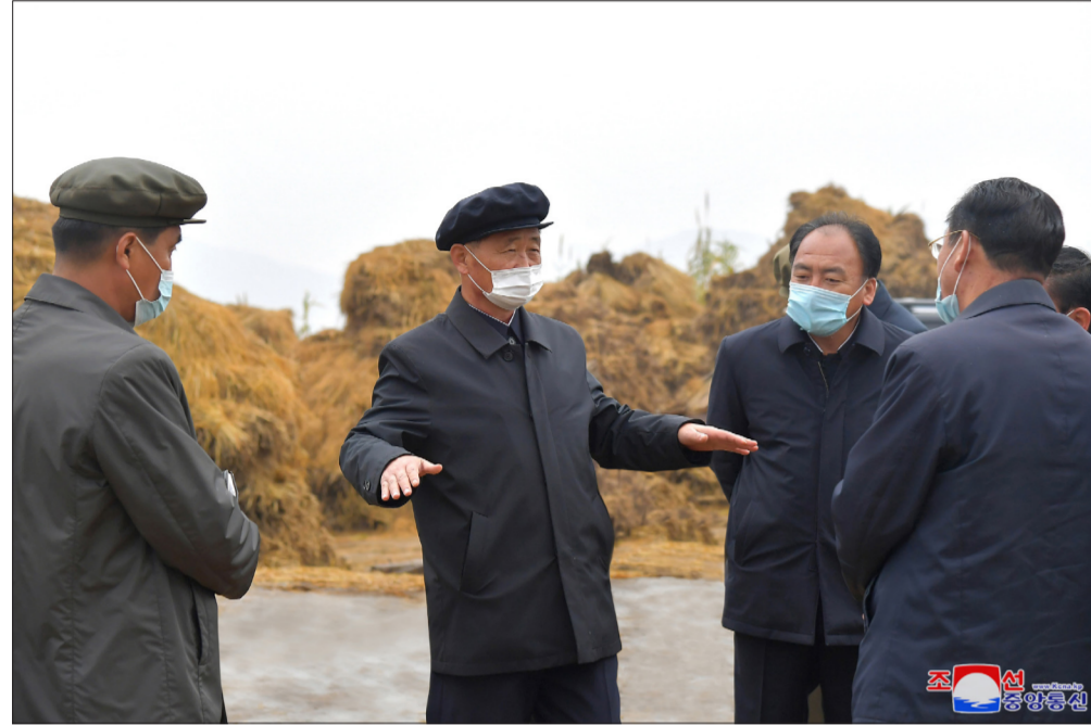
Premier Kim Tok Hun (second from left) looks round the Jonggok Cooperative Farm in Paechon County.