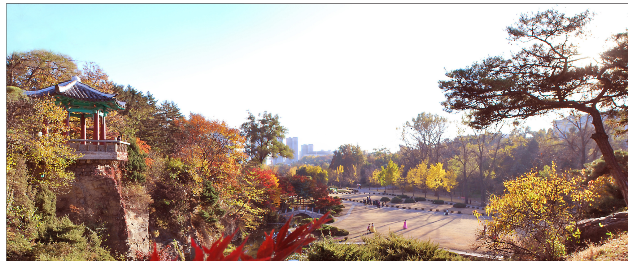
The scenery of Moran Hill with autumn tint of golden, red and green draws citizens.