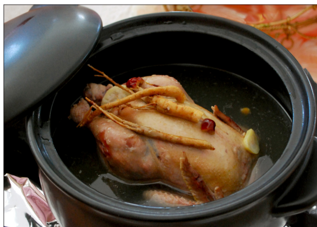
Samgyethang, special dish of Kaesong.

It has long been known as a nourishing food as it is effective for the treatment of anorexia, dyspepsia and anaemia.