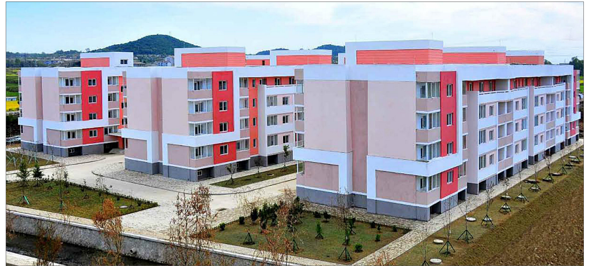
Newly-built houses in the Rimhung-dong area of Taesong District, Pyongyang.