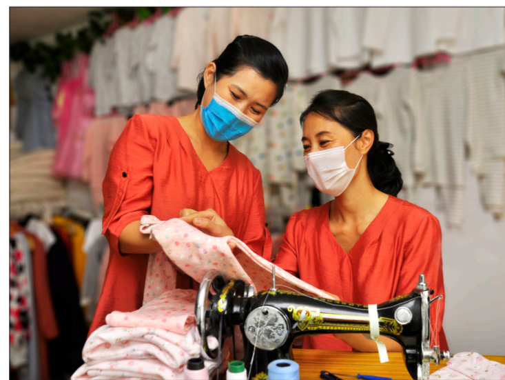
Children's wear is produced at the Tongdaewon District housewives' workteam management station.

such endeavour," said the director of the station. The ornamental toy animals the Saesallim-dong housewives' workteam made with colour paper cuttings were highly appreciated in the show held this November.