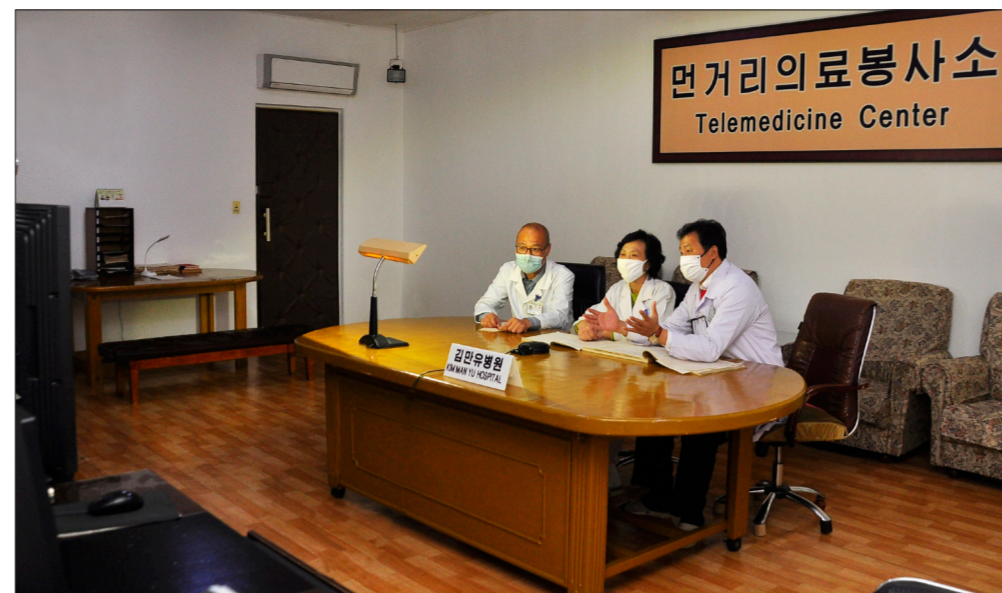
Doctors provide telemedicine at the Kim Man Yu Hospital.

A few years ago, a case who fell into coma was taken to the Onsong County People's Hospital in North Hamgyong Province after he got a heavy bruise on his brain due to an accidental fall.