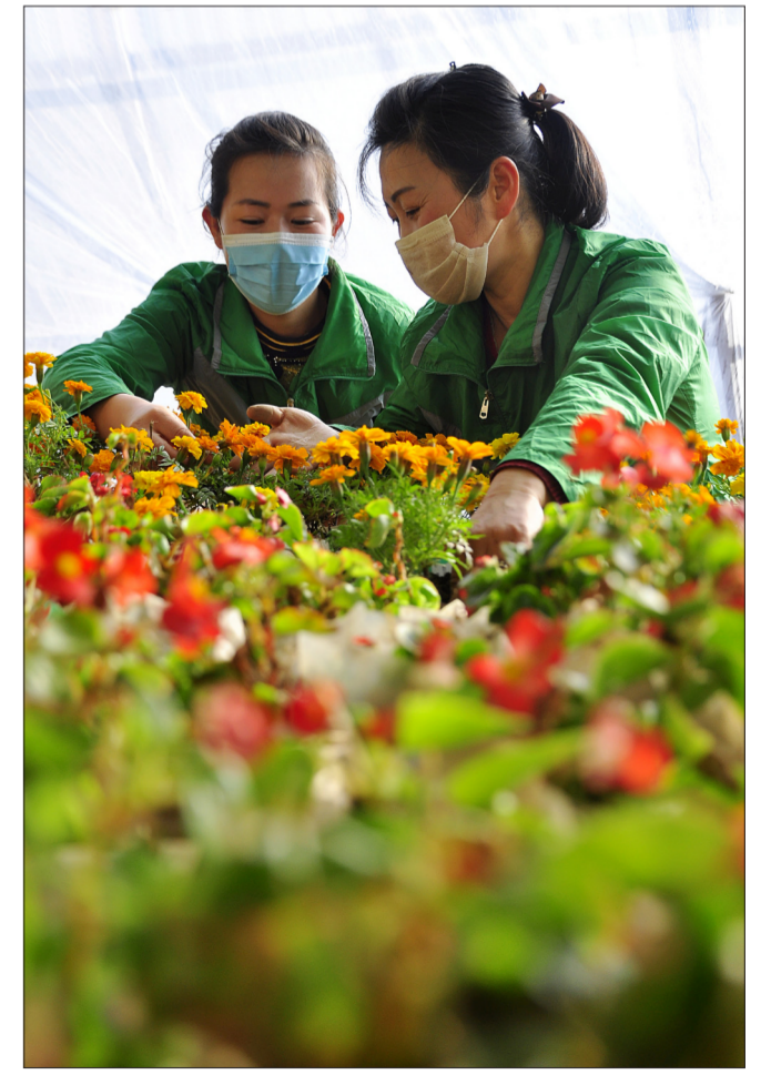
Employees tend flowering plants for decorating streets.