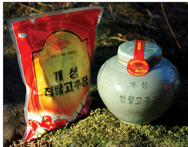
Kaesong peppered bean paste made with glutinous rice.

Though many original and excellent new dishes are invented according to the requirements of the developing times and demands of people, ubiquitous bean paste soup houses are always crowded with customers and the soup is everyone's favourite.