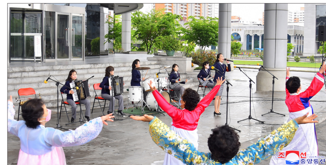
Snapshots show mass-based cultural and artistic activities.

As seen above, the Korean people have adorned the first year of the five-year plan for national economic development with victories, while singing songs full of confidence and optimism.