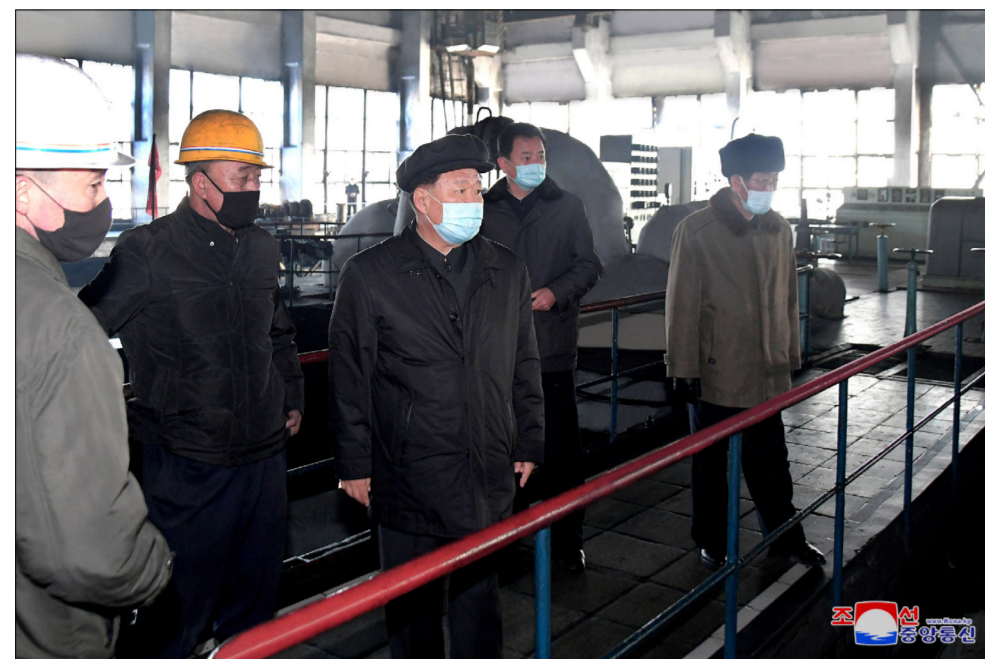
Choe Ryong Hae (centre), chairman of the Standing Committee of the DPRK Supreme People's Assembly, inspects the Pyongyang Thermal Power Station.