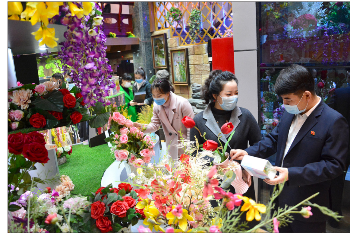
Visitors choose the flowers they like at the flower exhibition house in Ryugyong-dong No. 1, Pothonggang District, Pyongyang.

The flower exhibition house is a world of flowers in midwinter, and the beautiful flowers the visitors buy bring them fresh hopes and emotions in the new year.