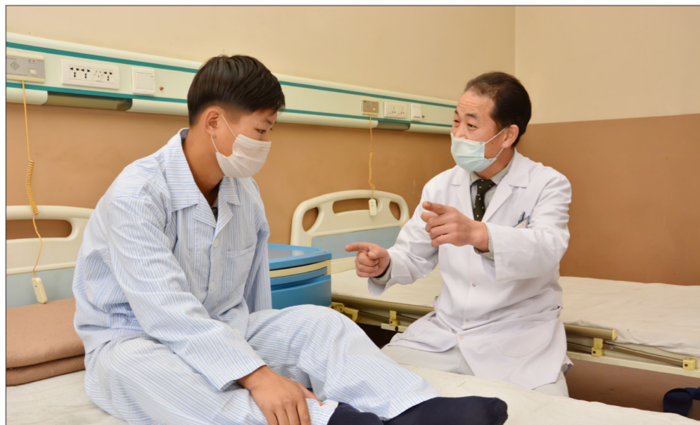
HONG KWANG NAM / THE PYONGYANG TIMES