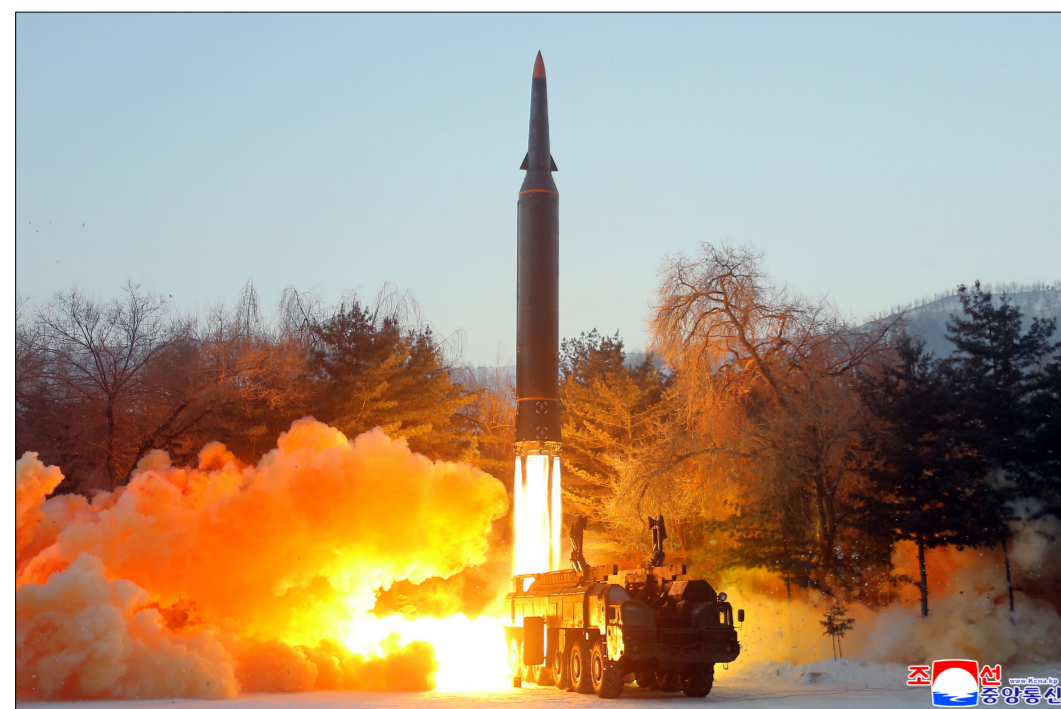
The DPRK Academy of Defence Science test-fires a hypersonic missile on January 5.

to the target azimuth in the flight distance of the hypersonic gliding warhead and precisely hit a set target 700 kilometres away. The reliability of the fuel ampoule systems was also verified under the winter weather conditions. The test launch clearly demonstrated the manoeuvrability and stability of the hypersonic gliding warhead combining the multi-stage pull-up and the strong lateral movement.