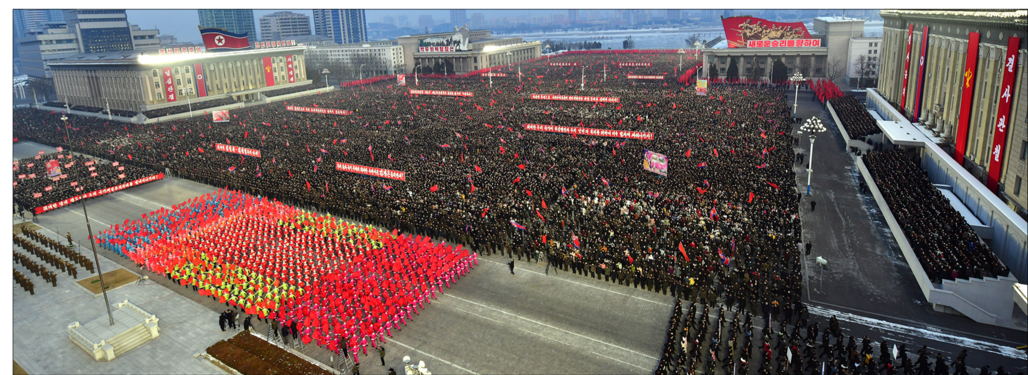
AN CHOL RYONG / PICTORIAL KOREA

The railway transport sector of the country has buckled down to increased transport from the first day of this year. Thanks to the devoted efforts of railway workers, the Ministry of Railways carried out its first day's transport plan at 106.9