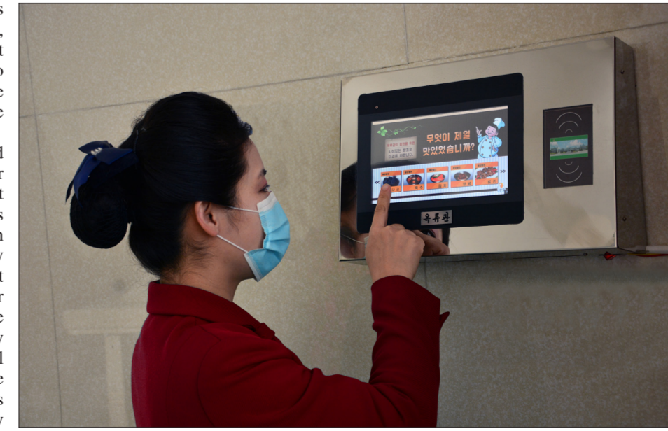
The informatization level of service is improved at the Okryu Restaurant.