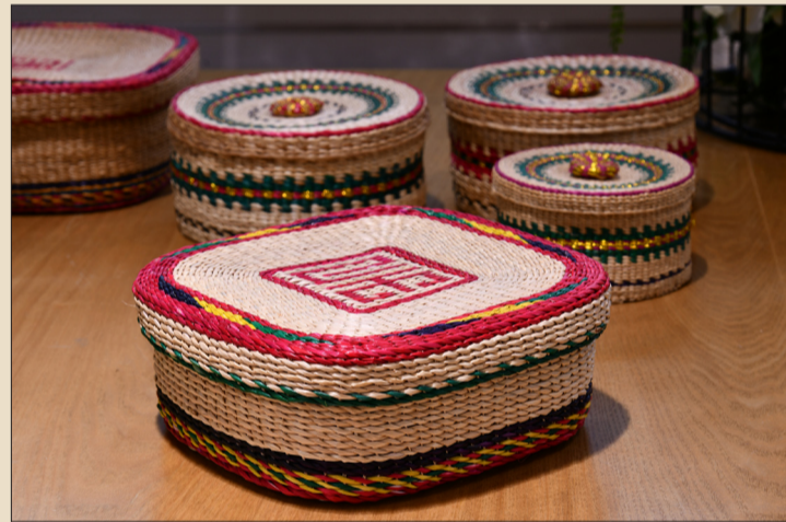
Cushions made of straw.

They used different cushions according to seasons: straw cushions in summer and cloth cushions in cold winter.