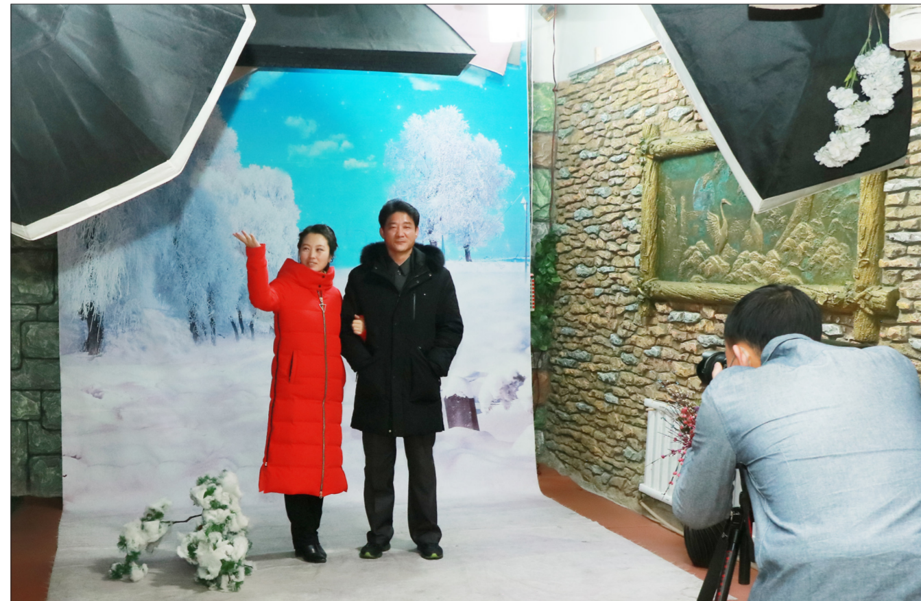
Customers pose for the camera at the photo shop of the Korean Central History Museum.