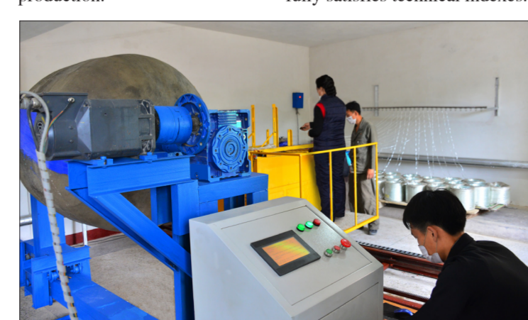
Employees operate machines to produce glass fibre reinforced plastic pressure vessels.

After establishing the production process of the vessel, the company has buckled down to research into the home production of its main materials and the process of its serial production.