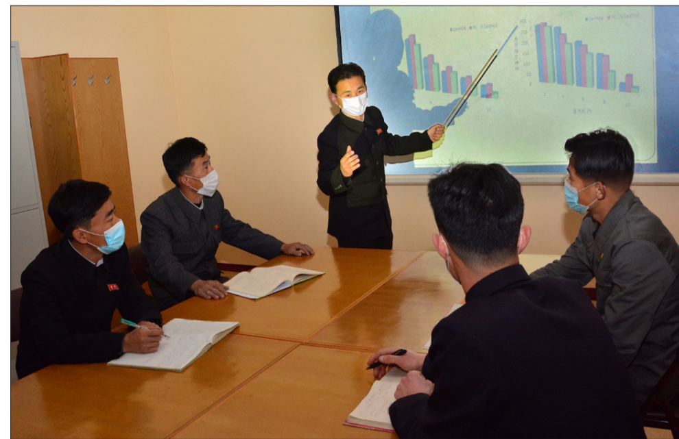
Researchers pool wisdom and efforts to ensure the domestic production of building materials