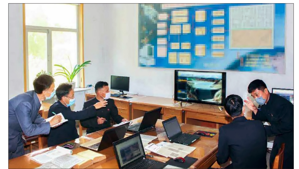
A discussion is held over newly-developed national integrated calamity management information system.

They also added to the system various tools for