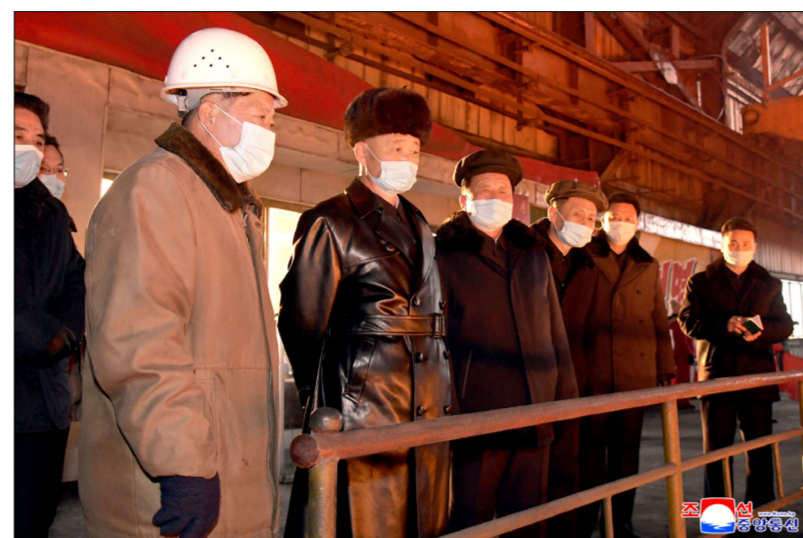
Premier Kim Tok Hun (fourth from left) at the Hwanghae Iron and Steel Complex.