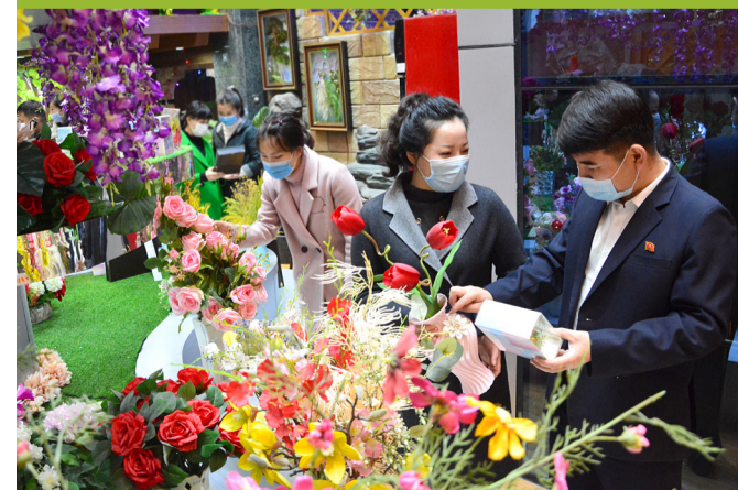
Related story, p9