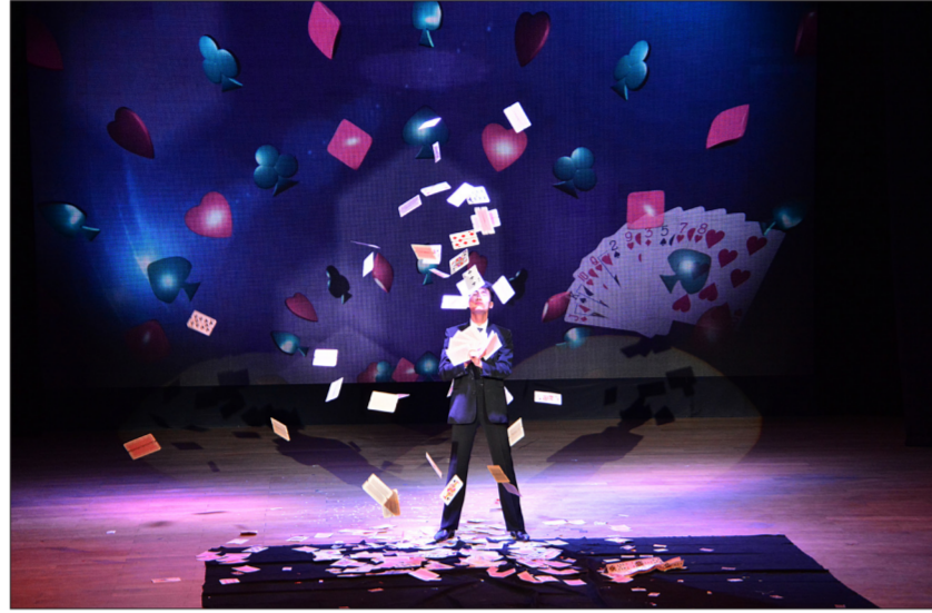
Scenes from a magic performance given by conjurers of the National Circus.