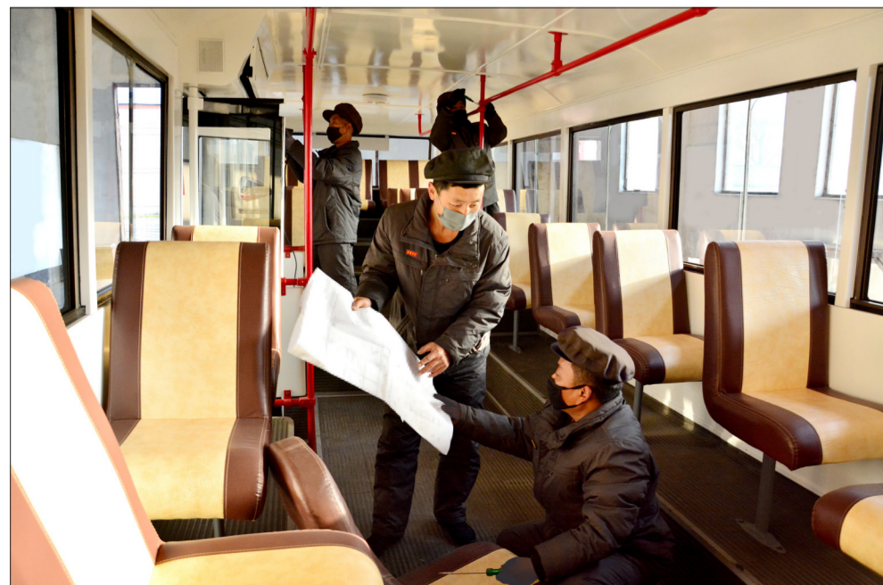
Workers assemble internal fittings of a bus at the Pyongyang Bus Factory.

time of tramcars," said the chief engineer. The factory has also laid a foundation for producing the friction piece brake and brake valve at the bogie. In that course it introduced over 10 technical innovation plans. In addition, it concentrates on melting and moulding to produce castings needed for a new model of bus.