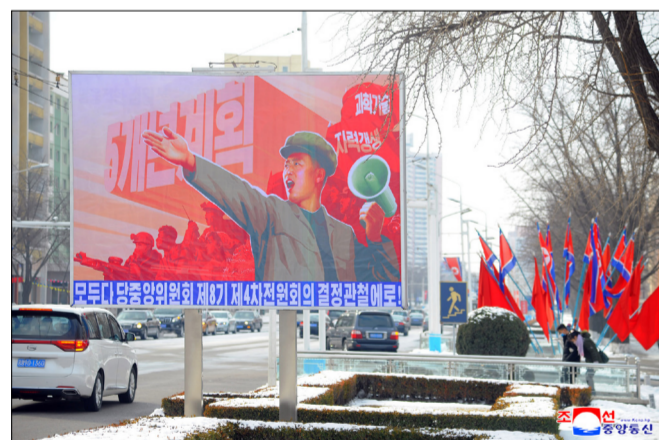
Posters and slogans posted on streets inspire people to carry out the decisions of the Fourth Plenary Meeting of the Eighth Central Committee of the Workers' Party of Korea.