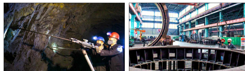
A surge is effected in production at different economic sectors including the metallurgical and coal industries.

The Chonnac, Anju, Kujang and Hamnam area coal-mining complexes are waging a dynamic struggle to produce more coal. Building-materials production units in all parts of