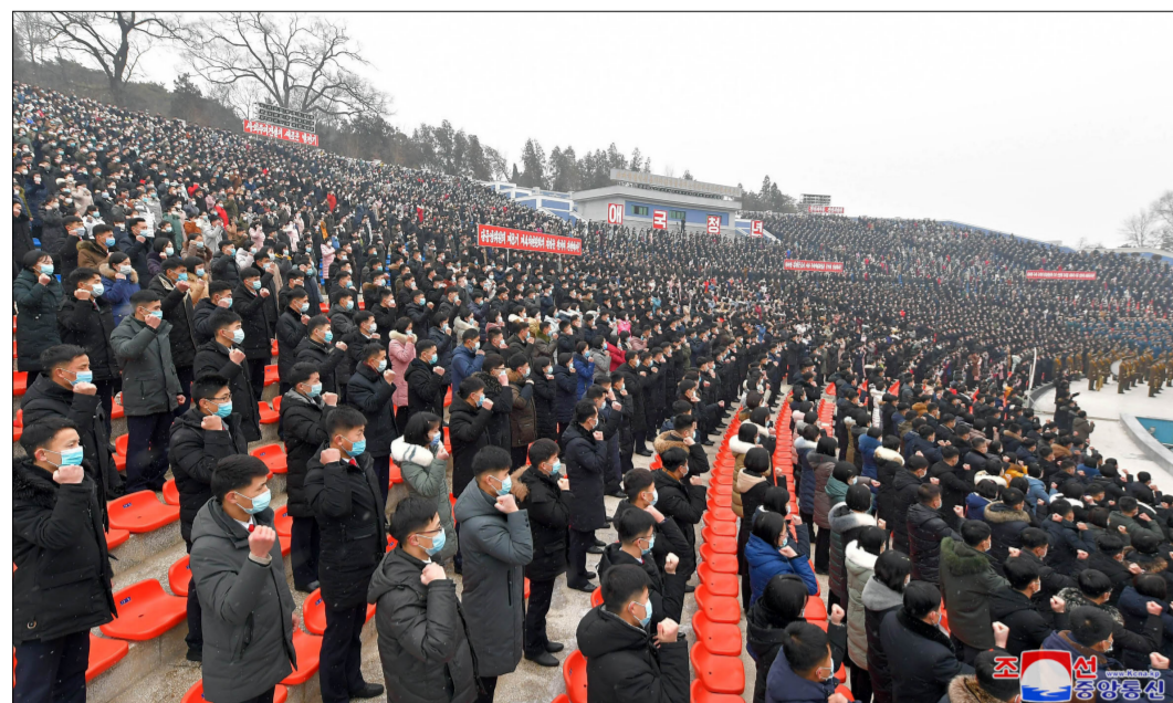
A meeting is held by young people to vow to implement the decisions of the Fourth Plenary Meeting of the Eighth Central Committee of the Workers' Party of Korea in Pyongyang.