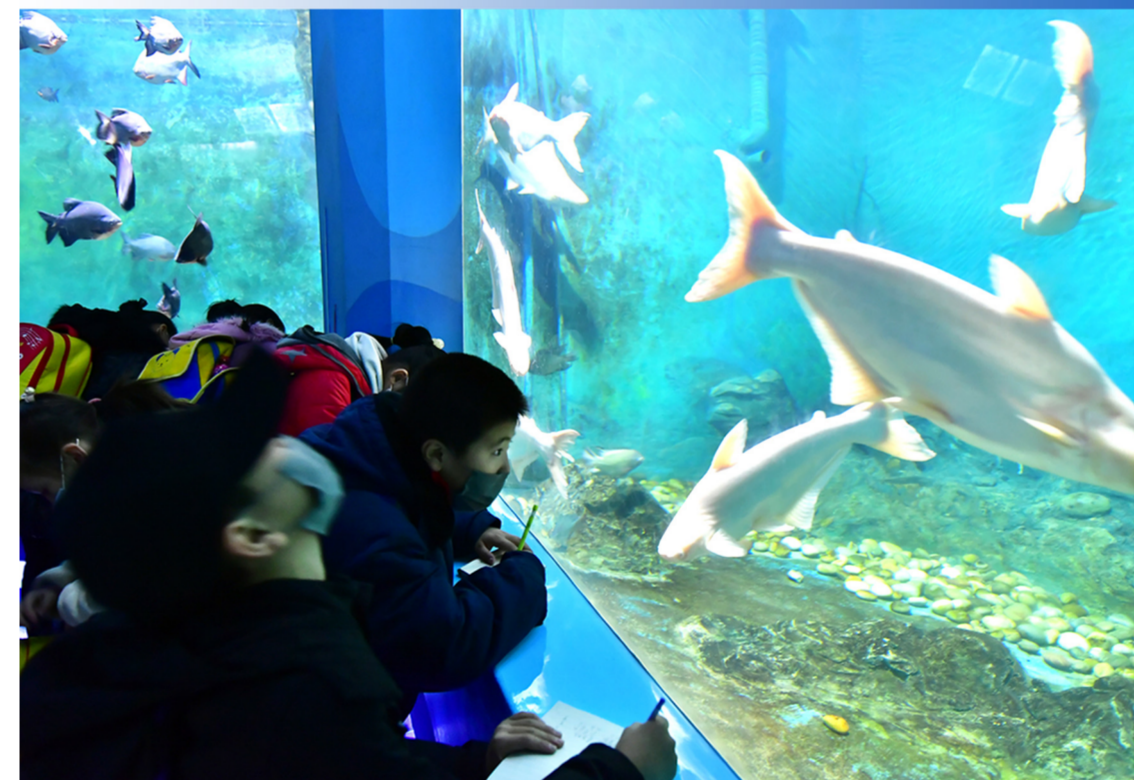
Visitors show keen interest in the underwater creatures at the aquarium of the Central Zoo.