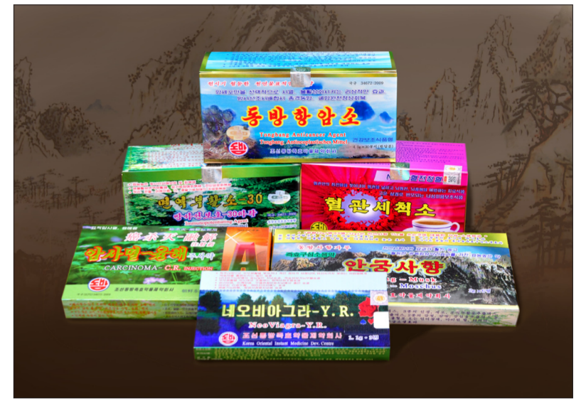
Winners of the December 15 Medal of Quality produced by the Korea Oriental Instant Medicine Development Centre.

chromatographical device and an ultraviolet spectrophotometer, and makes the production processes free from germ and dust using a fine particle meter and an airflow and wind gauge. Angunguhwangwan and Uhwangchongsimhwan have remarkable effects in the treatment of brain hemorrhage, cerebral thrombosis and cerebral contusion, the removal of fever and the reduction of blood pressure, Kwibihwan is highly effective in the treatment of various symptoms caused by nervous weakness including cardiac neurosis, sleep disturbance and amnesia and that of metrorrhagia and Ryukmihwan