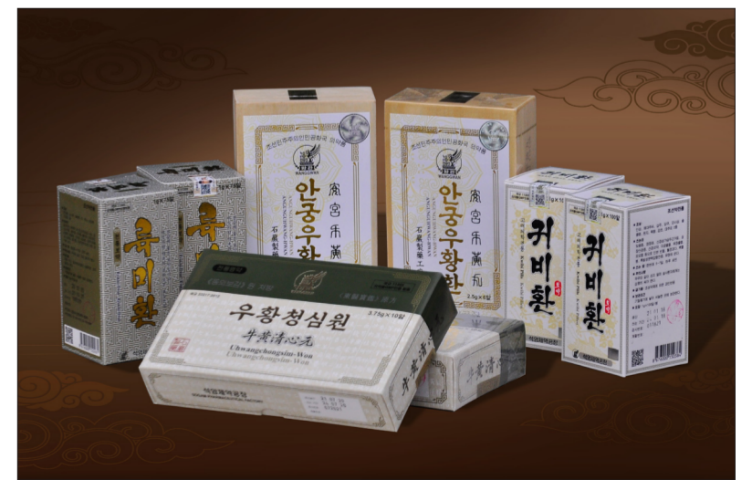
Winners of the country's top quality medal manufactured by the Sogam Pharmaceutical Factory.

resuscitating and awakening time of patients with cerebral thrombosis and cerebral hemorrhage and restores them to health. Completed after 13-year-long research, the blood vessel washing agent is an essential health food for everyone who is over 40 years old. It has special effects on the treatment of hyperlipemic cerebral arteriosclerosis, cardiovascular diseases and hepatitis and beauty treatment of women. Tongbang anticancer agent is a selective molecule-trace anticancer medicine and NeoViagra Y.R. helps old people recover from sexual dysfunction, neuralgia, pain in the joint, hypertension and heart diseases and regain physical vigour. According to Director Ryu Il Nam, candidate academician and People's Scientist, these medicines have been registered in public health institutions at home and in different countries including China, Russia and Ukraine and was awarded the top quality medal of the country last year.