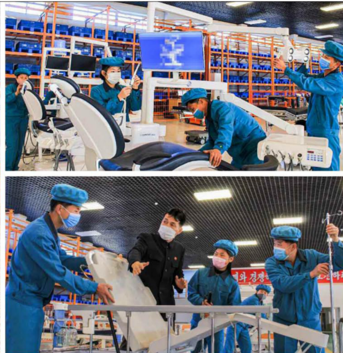
JU TAE HYOK / RODONG SINMUN