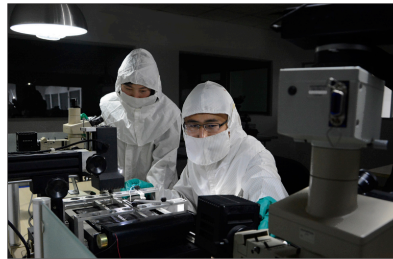
The venue of the tenth congress of the youth league in April 2021 (top). Young people dedicate their wisdom and energy in major fields of socialist construction.