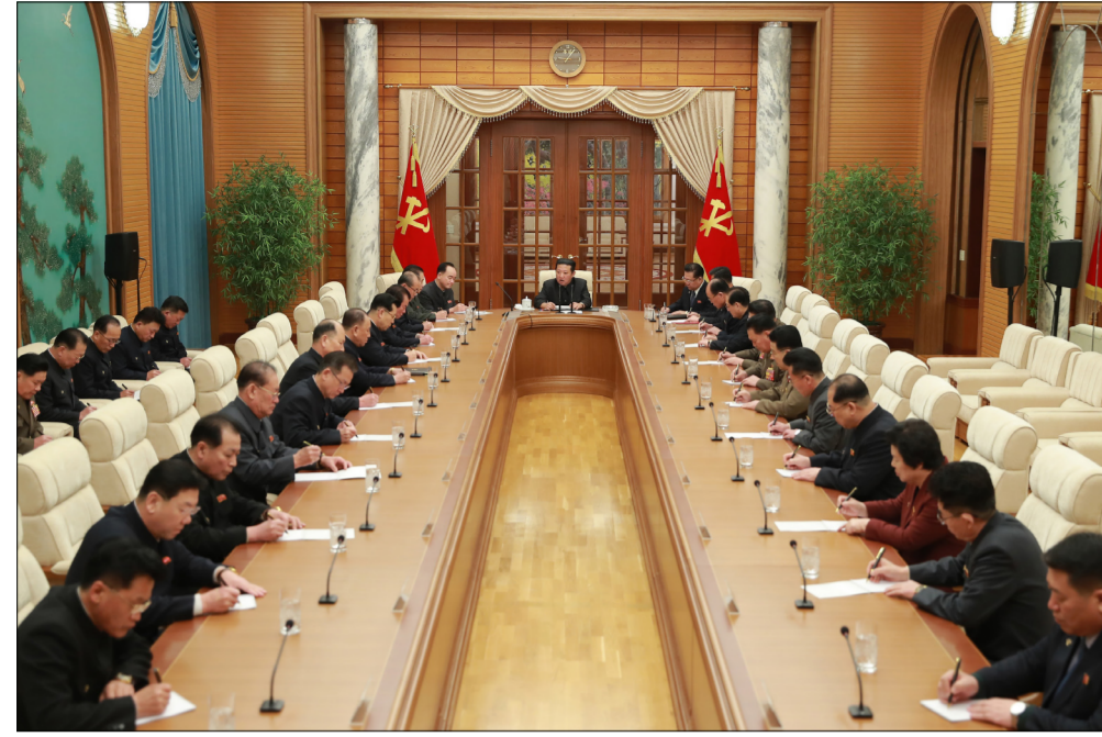
FROM PAGE 1

splendour the 110th birth anniversary of the great leader Comrade Kim Il Sung and the 80th birth anniversary of the great leader Comrade Kim Jong Il".