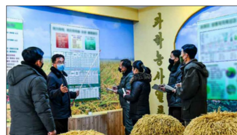
Agricultural workers strive to increase per-hectare yields.