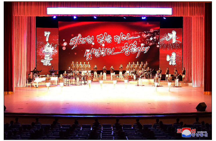
A performance is given by the central youth artistic motivational team in the Central Youth Hall in Pyongyang.