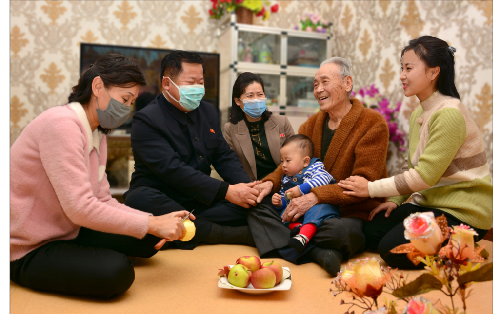
Officials of the Pompit materials supply company chat with a war veteran.

At present, lots of such domestic animals as pig and chicken are grown in the