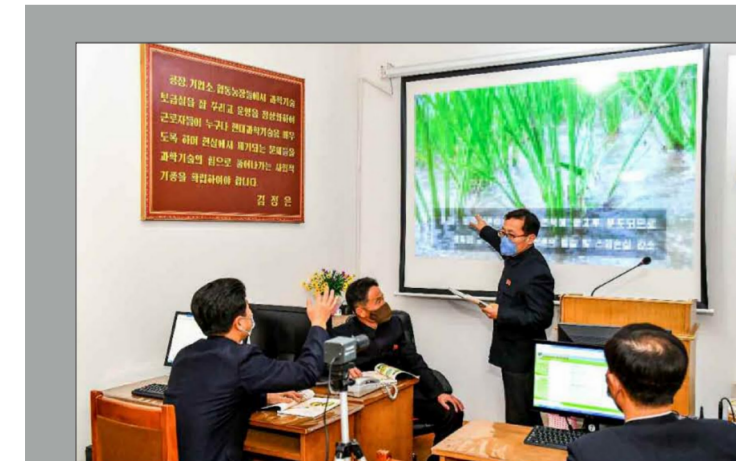
Officials discuss how to provide efficient online question and answer service for diffusing farming techniques at the Ministry of Agriculture.