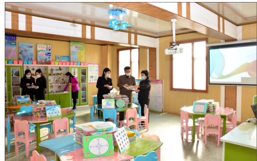
Officials from the educational department of the South Pyongan Provincial People's Committee explore the way to provide better educational conditions.