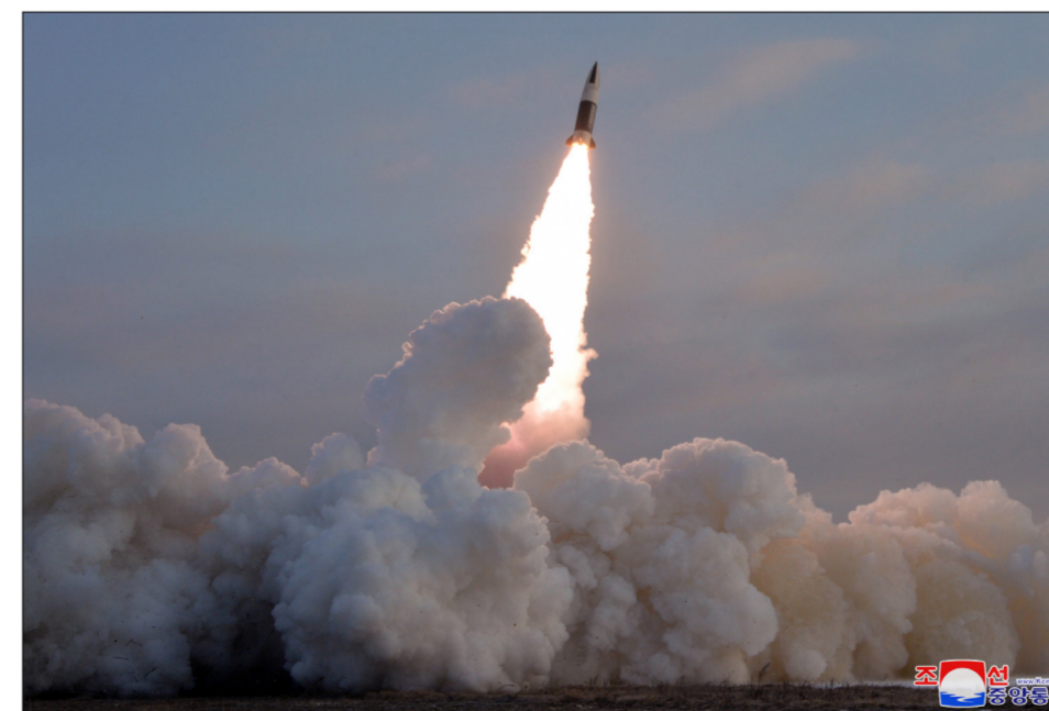
A tactical guided missile is test-fired for verification on January 17. That day two tactical guided missiles were launched and accurately hit the set target.