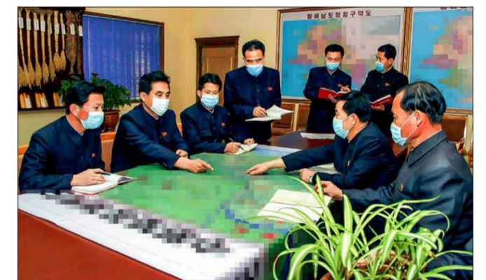
Officials of the South Hwanghae Provincial Rural Economy Committee get together to discuss how to increase grain production.

is that it organizes work scrupulously to bring about practical innovations with science and technology as the main motive power for agricultural development.