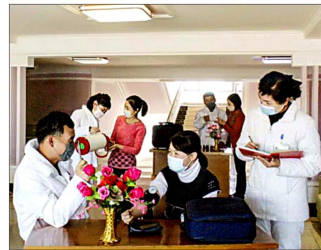
Medical workers from the Kim Man Yu Hospital are engaged in outreach health service for employees of the Pyongyang Kim Jong Suk Textile Mill.