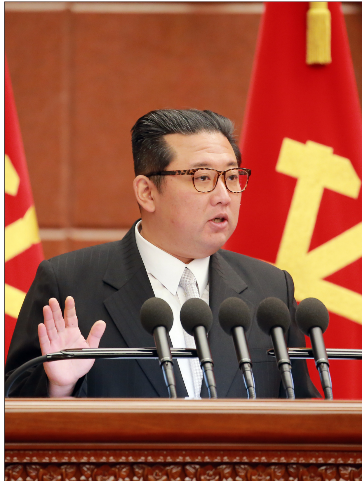
FROM PAGE 1

forth at the Party Congress, the work done year after year holds vital and important significance both in the light of the developmental stage of socialist construction and the realistic conditions and situation of the Party and state, the General Secretary noted that through the plenary meeting they will all face heavy yet responsible agony while becoming aware of the strategic importance of the next year's work which will just be as huge and important as this year's.