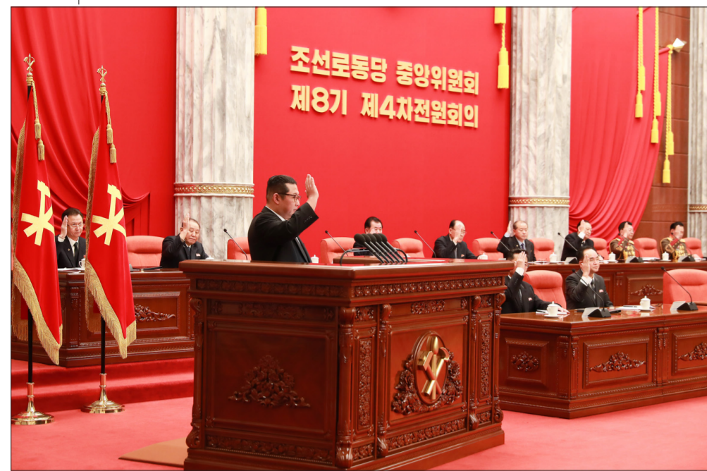
FROM PAGE 5

determined to realize under whatever conditions, in order to provide rural inhabitants with wonderful living environment with nothing to envy in the world and to achieve the overall development of the country.