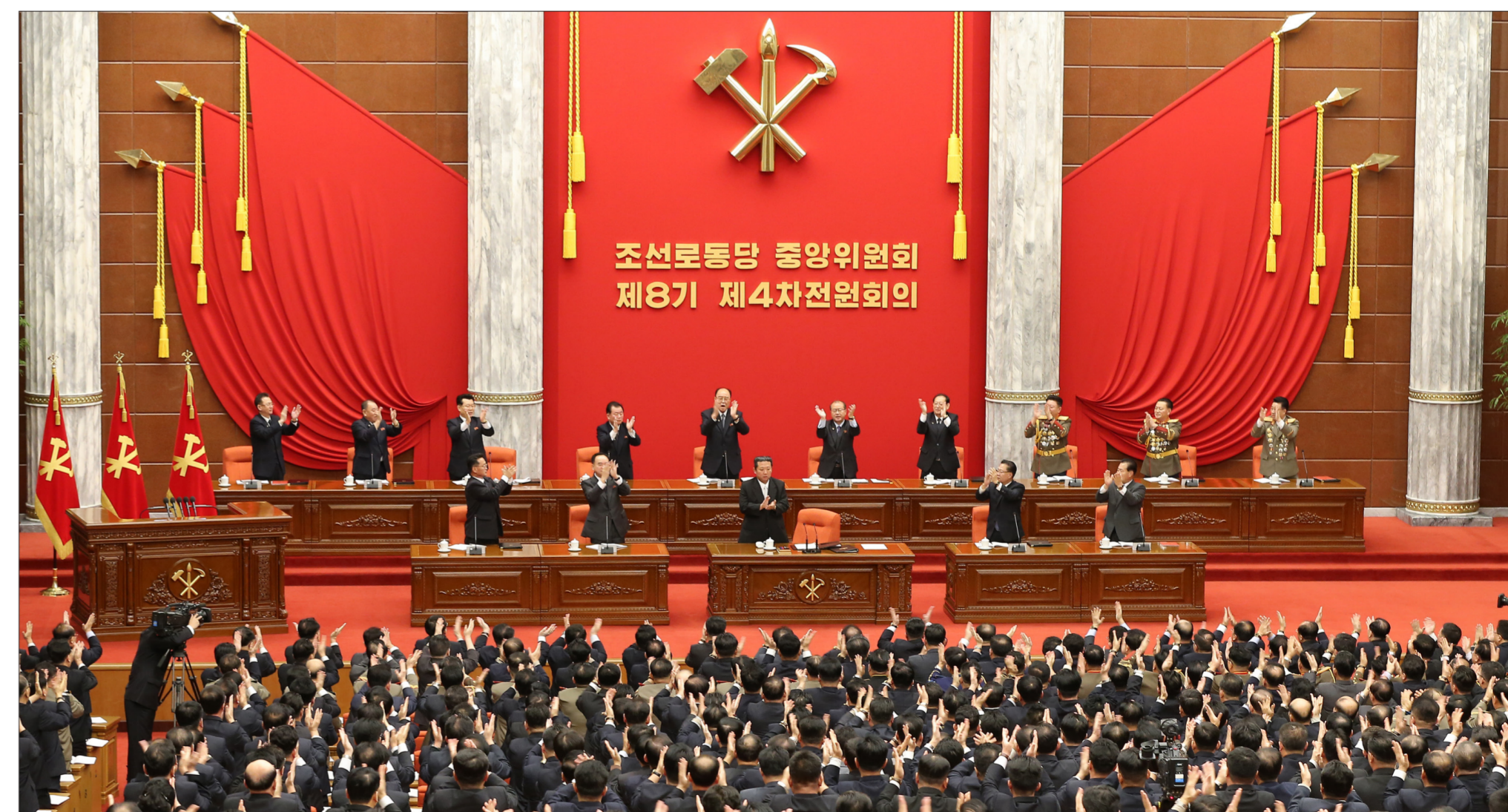
SEE PAGE 8

The General Secretary expressed conviction that sure victory is in store for the historic work to certainly put the country's agriculture on the track of steady development and bring about great changes of rural communities as