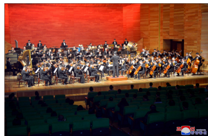
A variety of performances are given to mark the New Year.