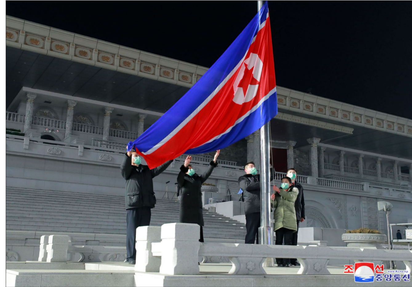
A flag-hoisting ceremony takes place at Kim Il Sung Square on January 1 2022.

members of Kim Il Sung's nation and Kim Jong Il's Korea. Exemplary worker, farmer, intellectual, young man and student of the capital city solemnly spread out the flag of the DPRK and it was slowly hoisted up amid the playing of the national anthem. At that significant moment, everyone paid their respects to the national flag. Gorgeous fireworks were displayed in the nocturnal sky over Pyongyang along with the fluttering flag of the DPRK, adding to the festive mood.