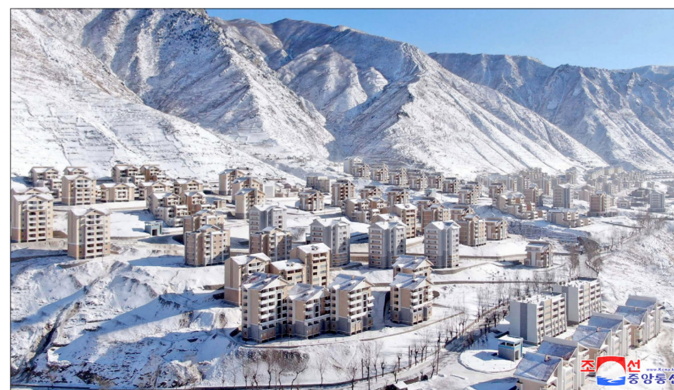
Multi-storey apartment houses spring up in the Komdok area.

Officials visited those who moved into new houses equipped with all excellent living conditions to congratulate them.