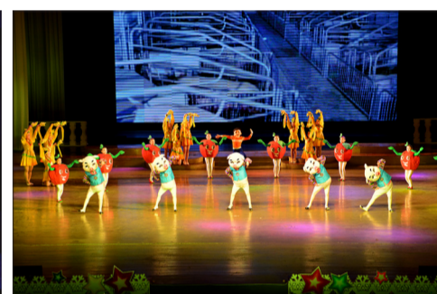
The New Year celebration of schoolchildren is held at the Mangyongdae Schoolchildren's Palace in Pyongyang on January 1 2022.