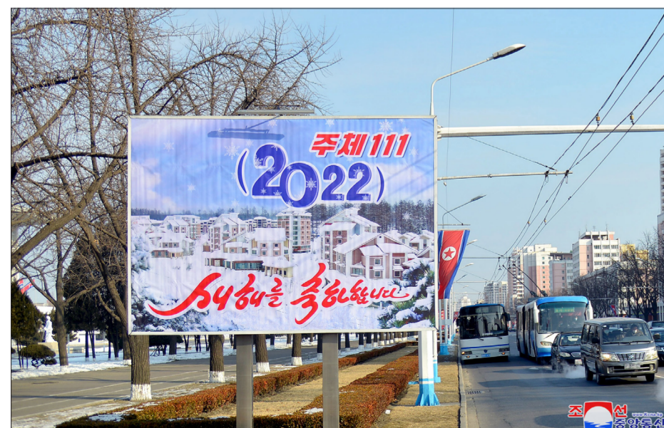
Pyongyang citizens are happy to greet the New Year.