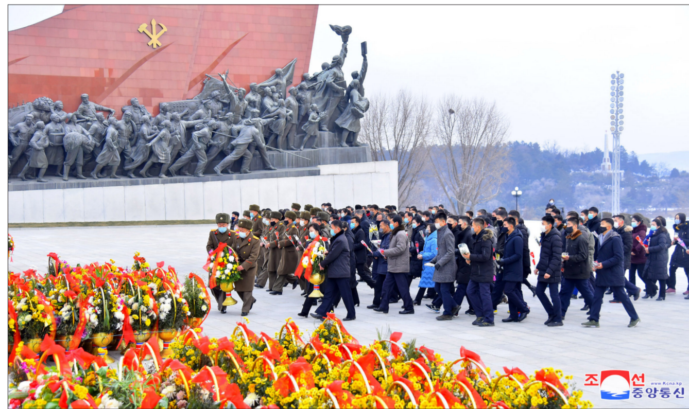
People of all walks of life visit the statues of President Kim Il Sung and Chairman Kim Jong Il on Mansu Hill to pay floral tribute to them on the occasion of the New Year 2022.