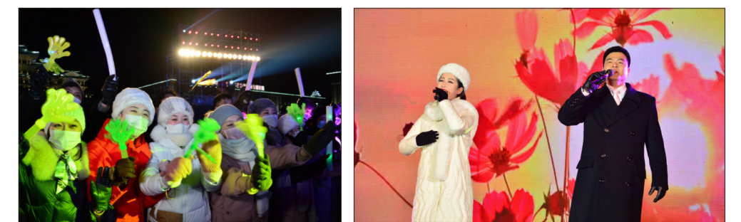
Celebratory performance is given at Kim Il Sung Square to mark the New Year 2022.