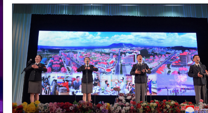
A joint performance is given by Samjiyon City and Construction Division 216 mobile artistic motivational teams.