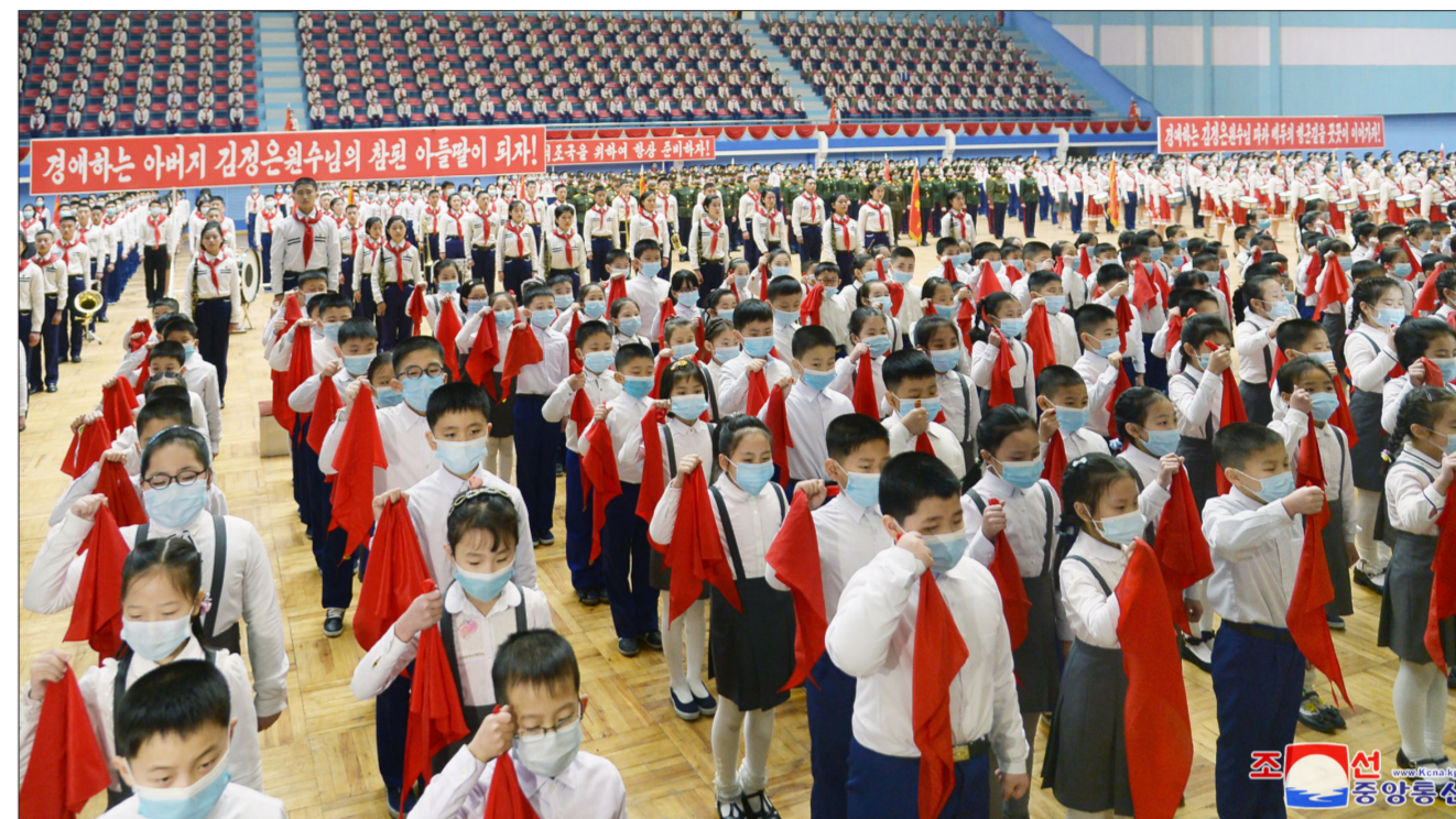
A joint national meeting of the Korean Children's Union organizations is held in Pyongyang in celebration of the 80th birth anniversary of Chairman Kim Jong Il.