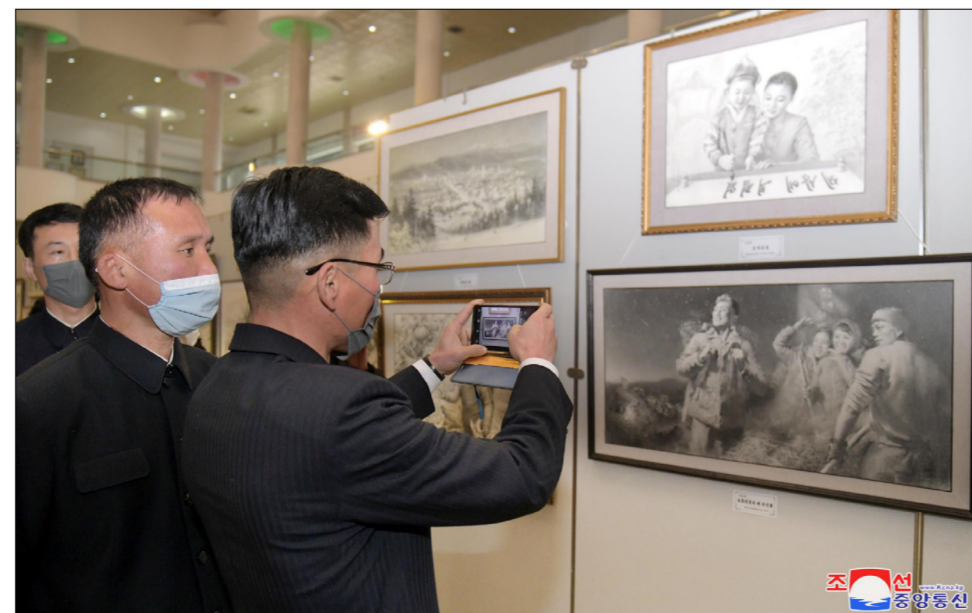
Hundreds of excellent artworks are on display at the national sketch and calligraphy festival.

KCNA A national sketch and calligraphy festival opened as part of the national art festival "Career of Patriotic Devotion" for celebrating the Day of the Shining Star. An opening ceremony took place at the Okryu Exhibition Hall on February 11, which was attended by Jo Kyong Jun, deputy department director of the Central Committee of the Workers' Party of Korea, officials concerned, creators and working people in Pyongyang. Minister of Culture Sung Jong Gyu made an opening address. After the opening ceremony was over, participants looked round sketches and calligraphic works on show.