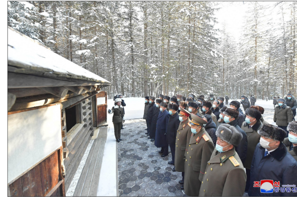
Senior Party, government and military officials visit Chairman Kim Jong Il's birthplace in the Paektusan Secret Camp on the occasion of his 80th birth anniversary.