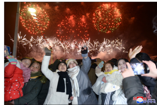
Residents see the wonderful display of fireworks in the City of Samjiyon in celebration of the Day of the Shining Star.

The sound of fireworks shook the centre of the earth like a stirring thunder heralding a new victory of socialism and colourful fireworks spluttered in the sky above the City of Samjiyon.