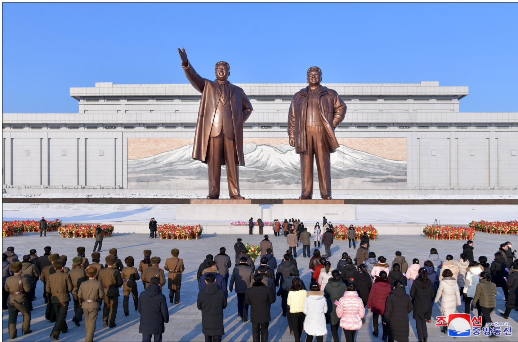
Service personnel and people visit the statues of President Kim Il Sung and Chairman Kim Jong Il on Mansu Hill to pay homage to them.

Flower baskets and bouquets in the name of the KPA and PSF units, institutions and industrial establishments were laid at