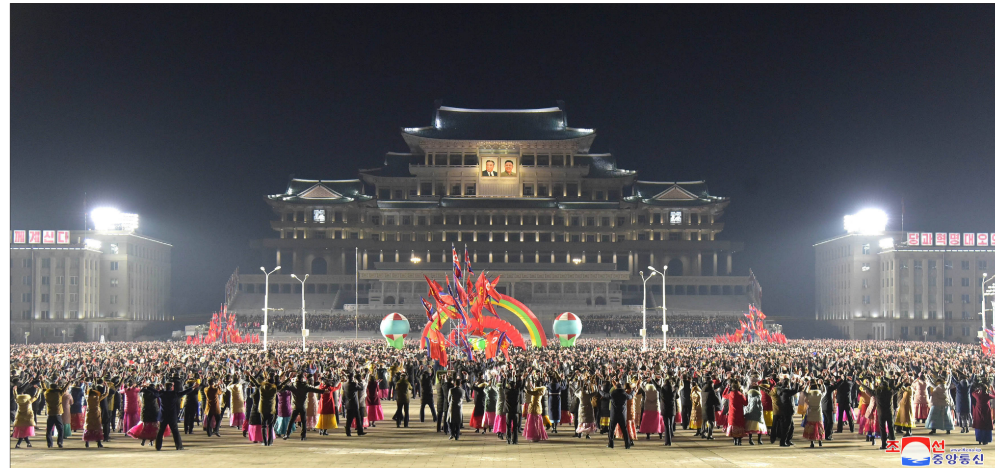
Youth and students dance merrily as fireworks go off to light up the sky in celebration of the Day of the Shining Star.