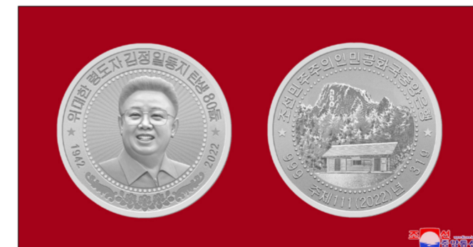
Front and back of commemorative gold coin (top) and silver coin (above) minted to honour the 80th birth anniversary of Chairman Kim Jong Il.