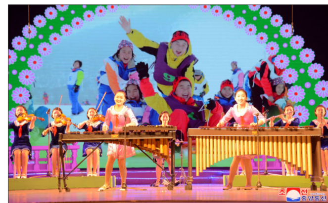
An art performance is given by art group members of the Mangyongdae Schoolchildren's Palace and Pyongyang Students and Children's Palace.