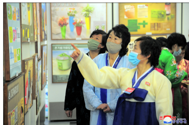
On display at the industrial design exhibitions are new designs and products conducive to economic and cultural development and improvement of people's life of relevant areas.

KCNA Industrial design exhibitions in celebration of the Day of the Shining Star are running in Pyongyang and the provinces. Industrial artists and amateurs from across the country presented new designs and products conducive to the development of the economy and culture and the improvement of the people's living in their local areas. The exhibitions will run until mid-March.