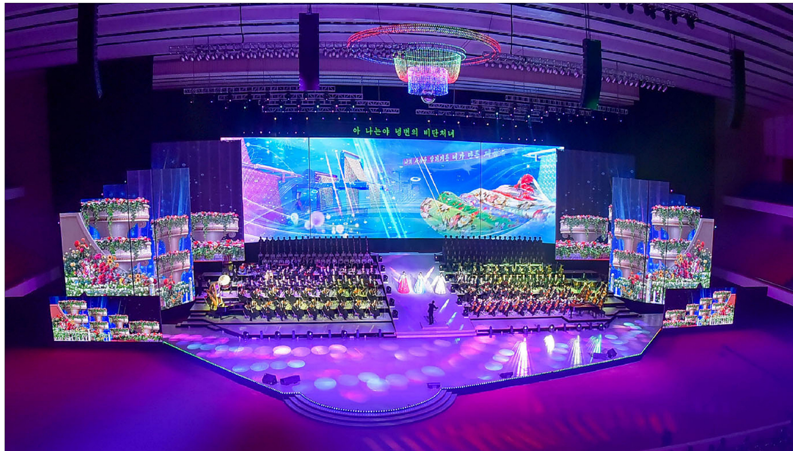
Joint performance given by Samjiyon City, Construction Division 216 mobile artistic motivational teams