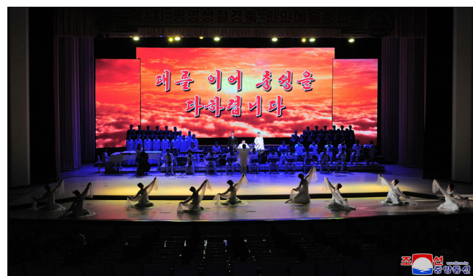
A performance is given as part of the First People's Art Festival in Celebration of the Day of the Shining Star.