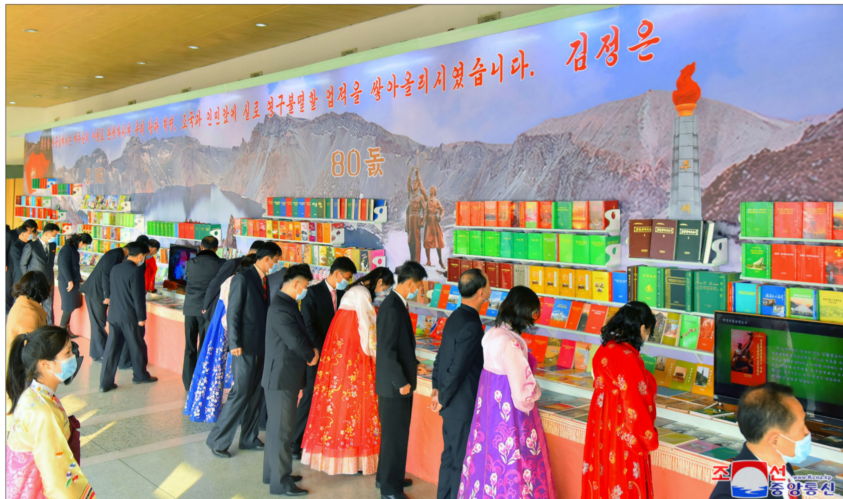
People see the national book exhibition held at the Okryu Exhibition Hall in celebration of the 80th birth anniversary of Chairman Kim Jong Il.