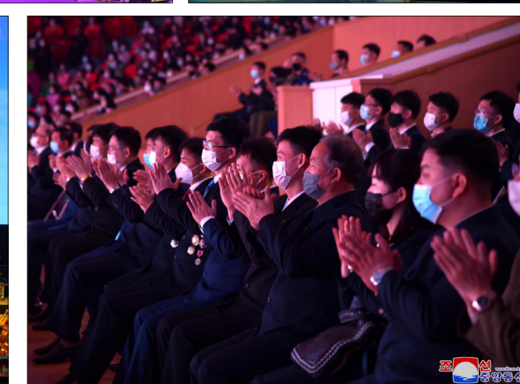
A grand performance in celebration of the 80th birth anniversary of Chairman Kim Jong Il Shine, Jong Il Peak is given at the Pyongyang Indoor Stadium on February 14.