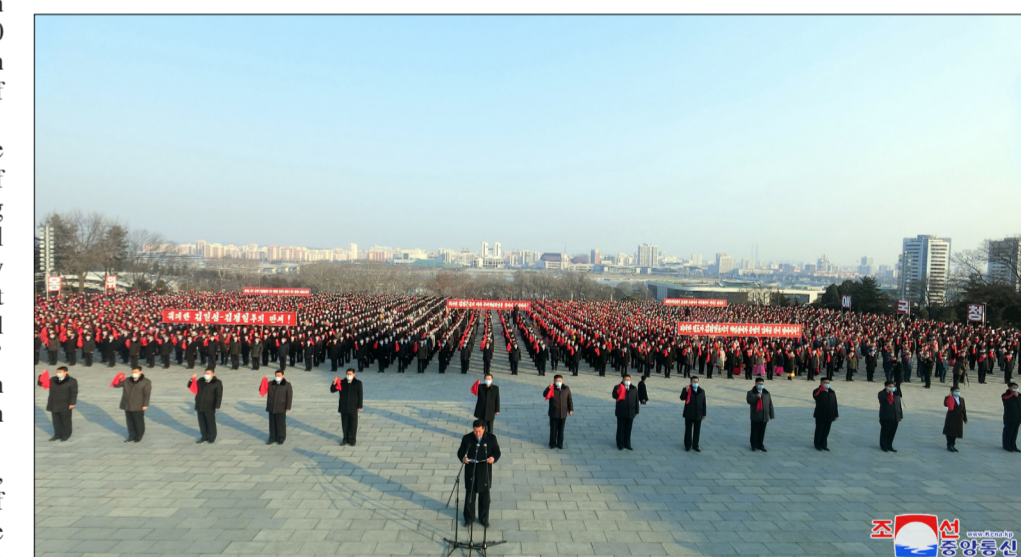
Youth and students get together on Mansu Hill to vow to uphold the leadership of the respected Comrade Kim Jong Un on the occasion of the Day of the Shining Star.