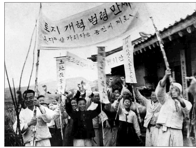
File photo shows peasants hailing the proclamation of the law on agrarian reform in North Korea.