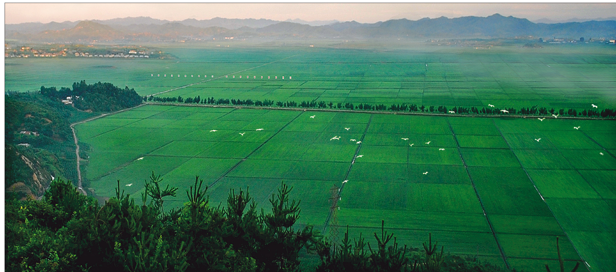
A partial view of Handure Plain rezoned into standardized fields.

When villages boasting modern and distinctive architectural beauty are built in rural communities, epochal changes will be brought about in not only the living environment of agricultural workers but also their ideological consciousness and the level of civilization and the country will undergo a remarkable transformation.