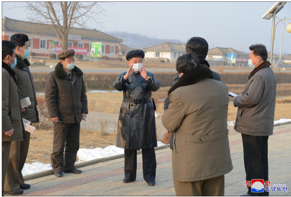
Premier Kim Tok Hun (middle) talks to officials during his inspection tour of the Samjigang Cooperative Farm in Jaeryong County.