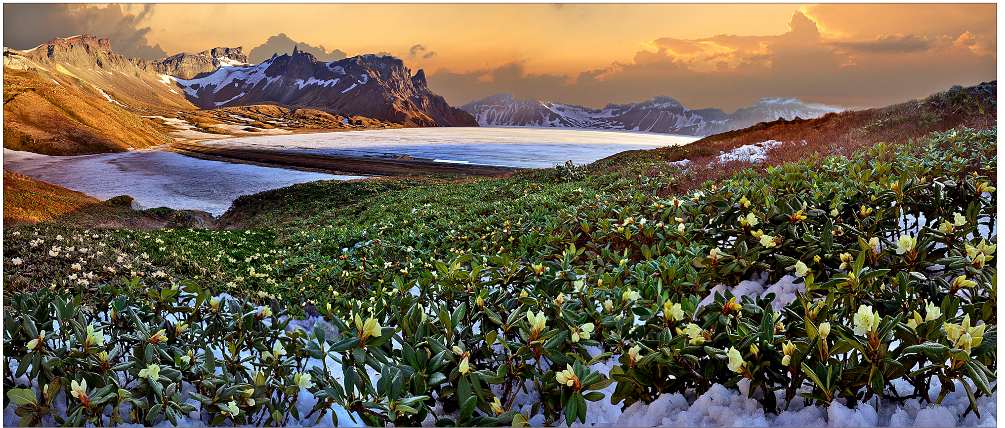
Rhododendron on Mt Paektu is in full bloom in winter, presenting a spectacular view.