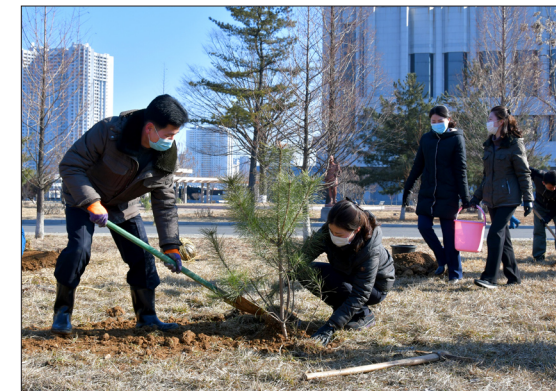
Working people plant trees in all parts of the country to mark Tree-planting Day.

Many others carried out landscaping substantially in their areas and units with trees and saplings of great economic value.