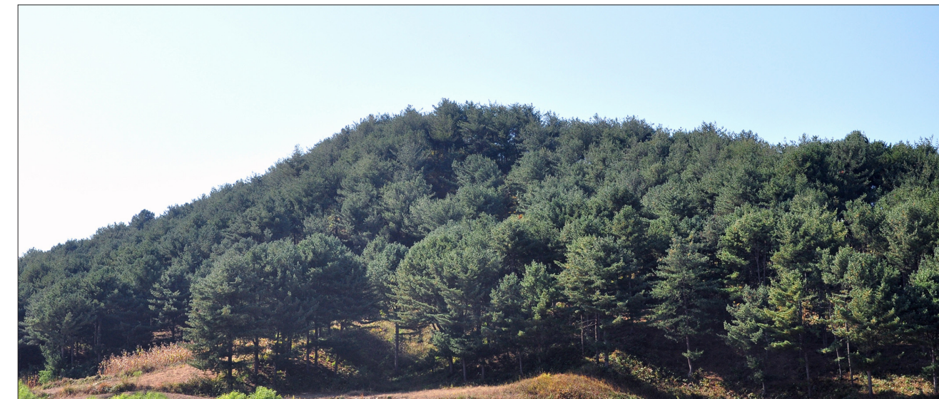
A mountain is covered in thick forest.

With the forest restoration campaign becoming mass-based today, the forest resources of the country are steadily increasing.