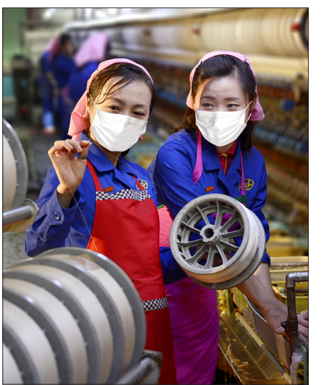
Women workers at the Pyongyang Kim Jong Suk Silk Mill.