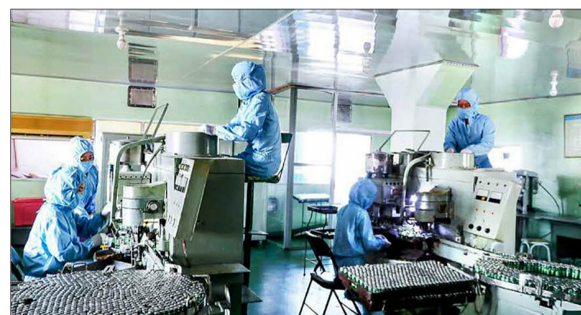
Medicine production is on the increase at the Sinuju Pharmaceutical Factory.

Antibiotics, antimicrobial and other medicines of the factory are favourably commented upon by users