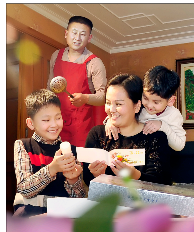
A family is full of joy on International Women's Day. The husband looks on in cooking suit while two sons show a gift set of cosmetics and greeting card to their mother.