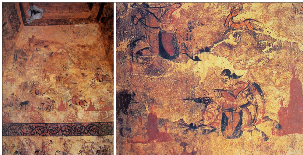
The murals in the Tokhung-ri tomb from the Koguryo period located in Tokhung-dong of Kangso District, Nampho, depict mounted archers in hunt.