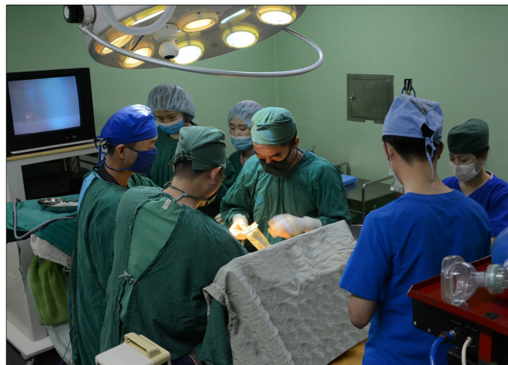
Surgeons of the limb orthopedic surgery department perform syndesmoplasty at the Pyongyang University of Medical Science Hospital.

Researchers of the abdominal surgery laboratory, who already completed methods of laparoscopic surgery for different abdominal diseases, have succeeded in making surgery of children scientific to further widen the domain of laparoscopic surgery. The cerebral nerve surgery and thoracic surgery departments completed a method of operation for hypophysoma without