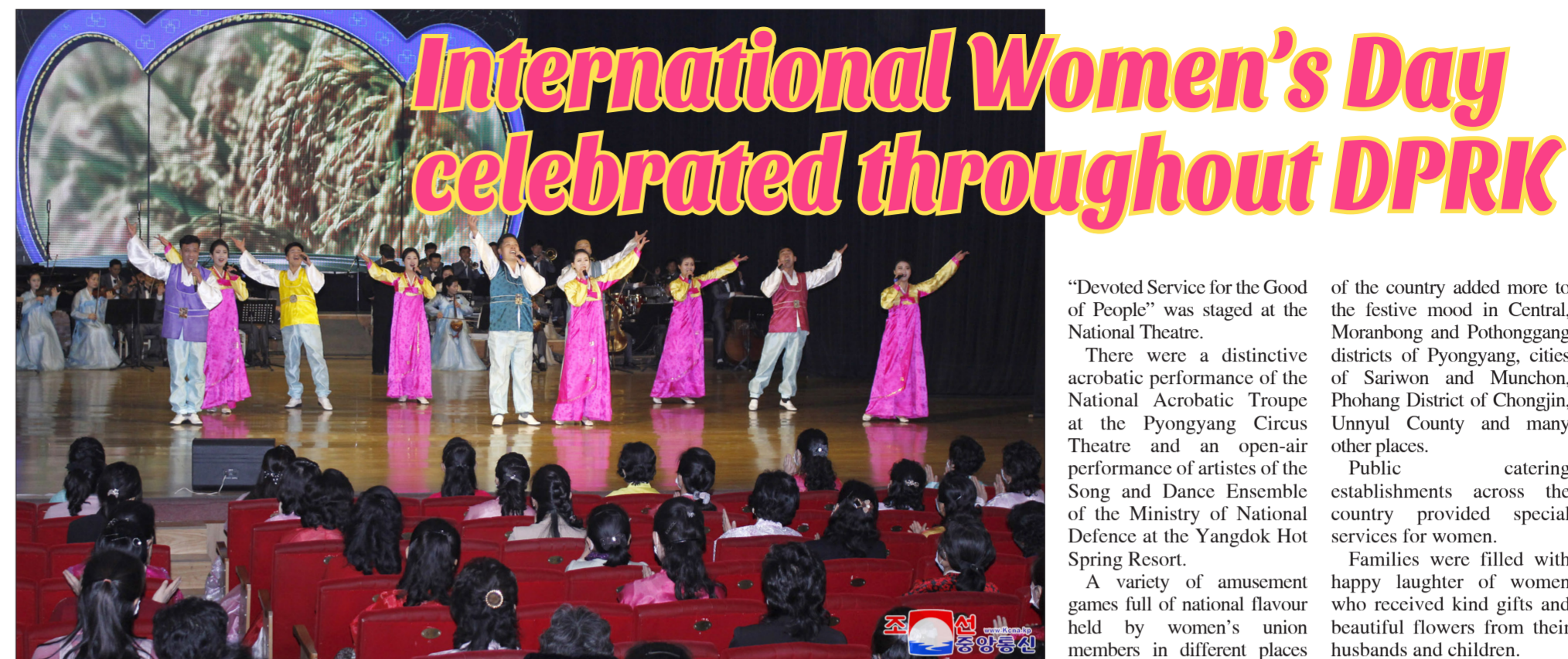
March 8 International Women's Day is significantly celebrated across the country.