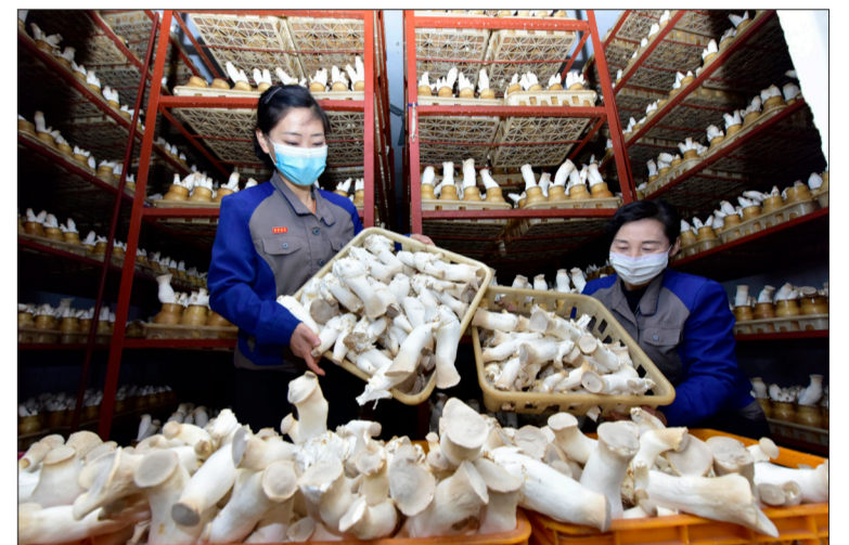
The Ryugyong Mushroom Farm increases mushroom production.

Now, it produces over a dozen species of quality mushrooms including Pleurotus eryngii , Pleurotus ostreatus , Flammulina velutipes and Auricularia polytricha .