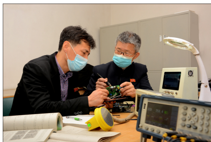
Technicians conduct research to ensure domestic production of medical appliances and facilities.