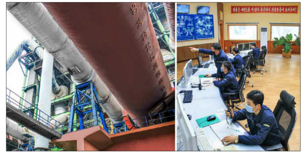
The Sangwon Cement Complex increases the operating rate of facilities with the help of the integrated production system.

The West Pyongyang, Sinsongchon and Sariwon locomotive corps are increasing the transport volume by raising the operation rate of locomotives and employing rational driving methods in accordance with the railway conditions in different sections of their routes. In close collaboration with adjacent railway stations, every freight station quickens the uncoupling of wagons and the formation of