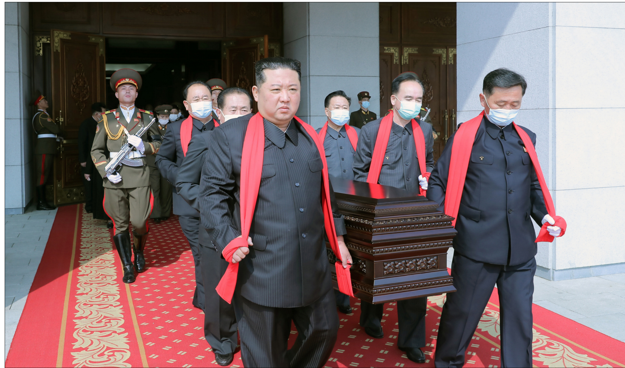
Kim Jong Un carries the coffin out of the house together with Presidium members