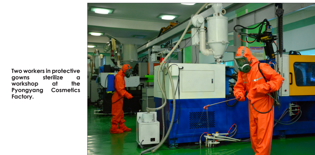
Two workers in protective gowns sterilize a workshop at the Pyongyang Cosmetics Factory.