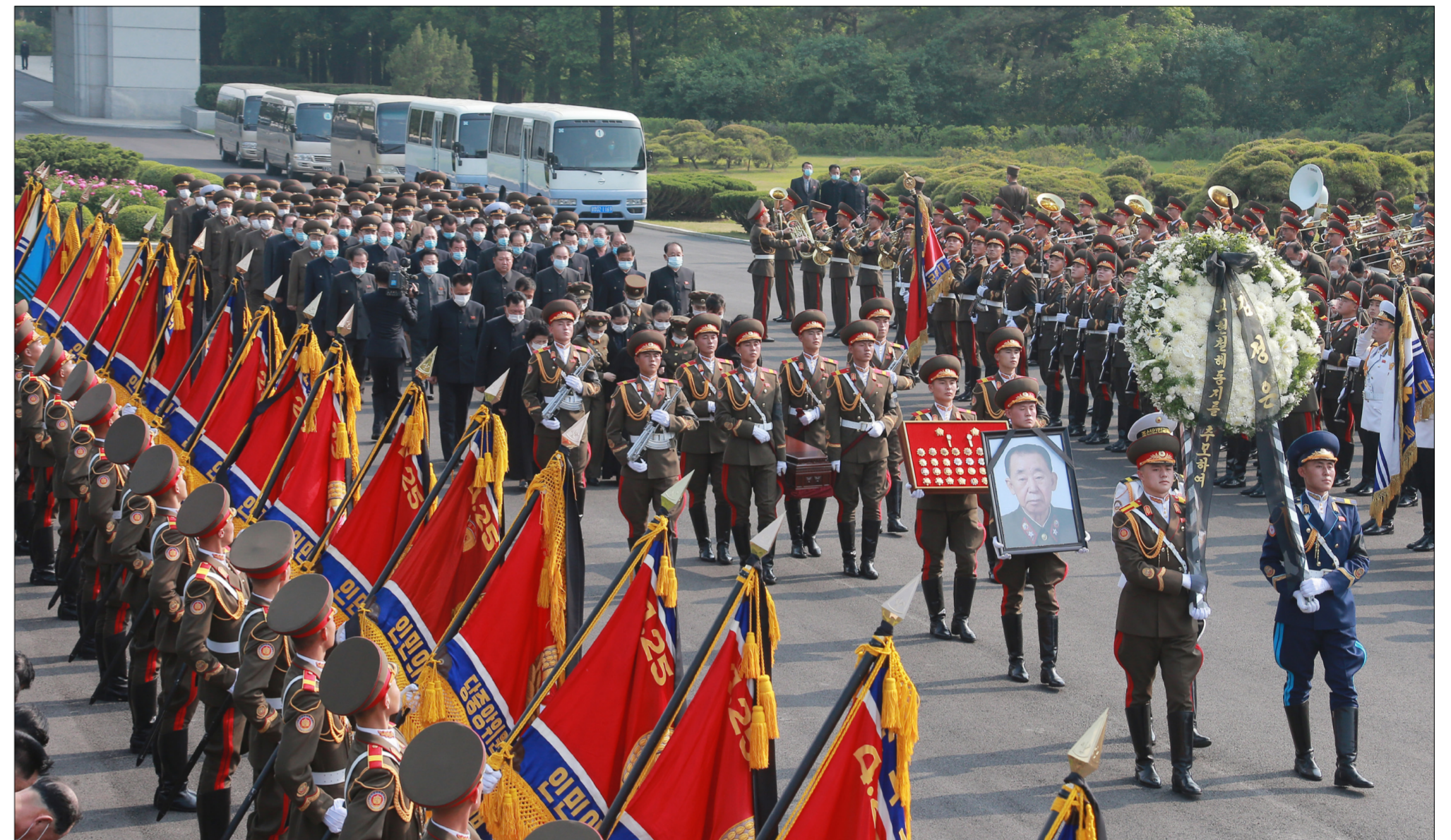
The General Secretary attends funeral ceremony