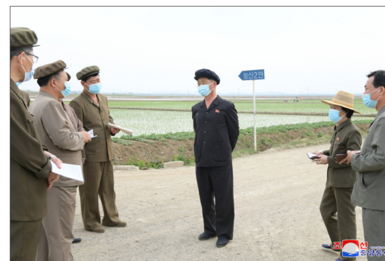
Premier Kim Tok Hun acquaints himself with proceeding farming processes at the Migok Cooperative Farm in Sariwon City.