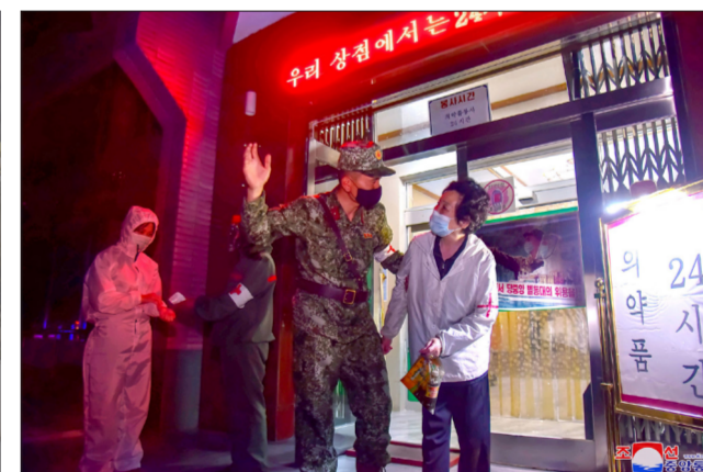
Medics of the Korean People's Army offer 24/7 service to protect people's lives and safety.