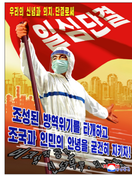
The new poster encourages all people to turn out in the anti-epidemic war.

Many other people, including a researcher of the Academy of Medical Science and a worker at Pyongyang University of Tourism, received similar cartons sent by the General Secretary.