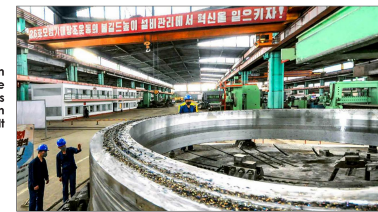
The Taean Heavy Machine Complex steps up the production of custom-built equipment.

The Sariwon and Phyongsong locomotive corps have employed efficient driving methods according to sections and promote mass movements to carry more freight safely every day.