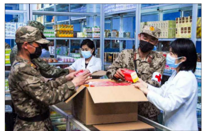
Medics of the Korean People's Army launch into the procurement and supply of medicines upon arrival at pharmacies.

And it refers to various tactics of treatment for different symptoms, accompanying diseases and idiosyncrasies of patients and the criteria for judging treatment effects.