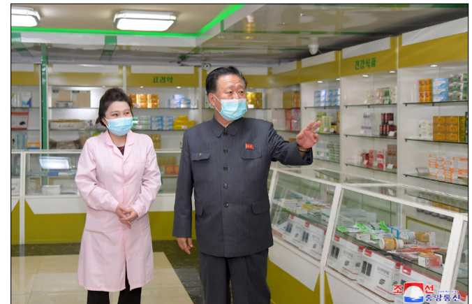
Senior Party and government officials visit pharmacies and medical supplies management stations to learn in detail about the demand for and supply of medicines.