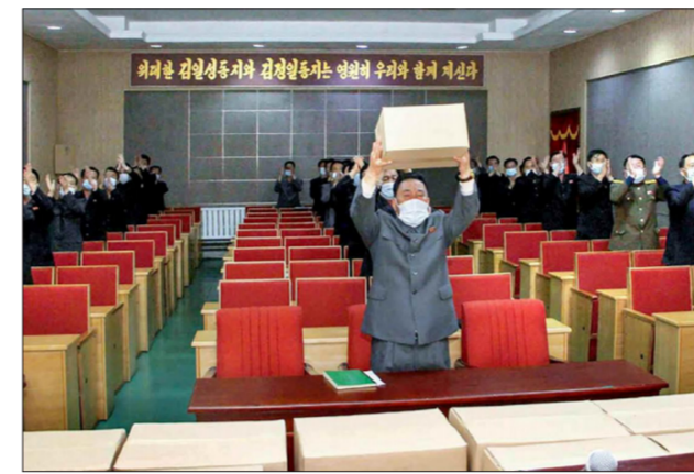
Locals in South Hwanghae Province burst into tears of gratitude as they receive official medicines prepared by General Secretary Kim Jong Un's family and other medicines from officials of the Party Central Committee and their families.