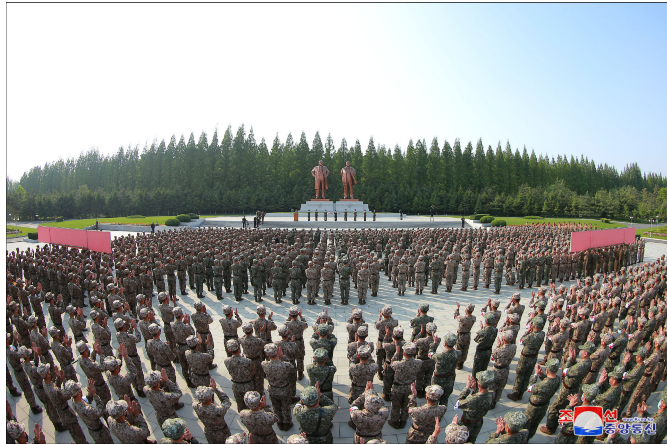
KPA combatants have an oath-taking gathering on May 16 at the Ministry of National Defence to fulfil their responsibilities in the campaign to control the prevailing health crisis in the capital city of Pyongyang.

the special order of the WPK Central Military Commission on urgently committing a contingent of medics of the KPA to the front of emergency anti-epidemic