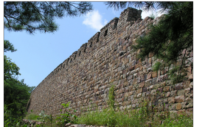
The South Gate of the Taesongsan Fort (left) and a section of the fort (right).