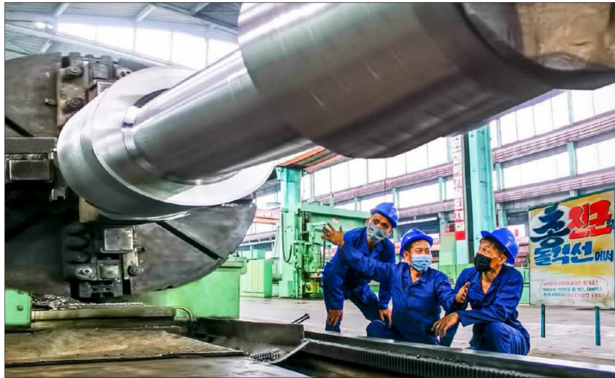
The Taean Heavy Machine Complex steps up the production of custom-built equipment by dint of science and technology.