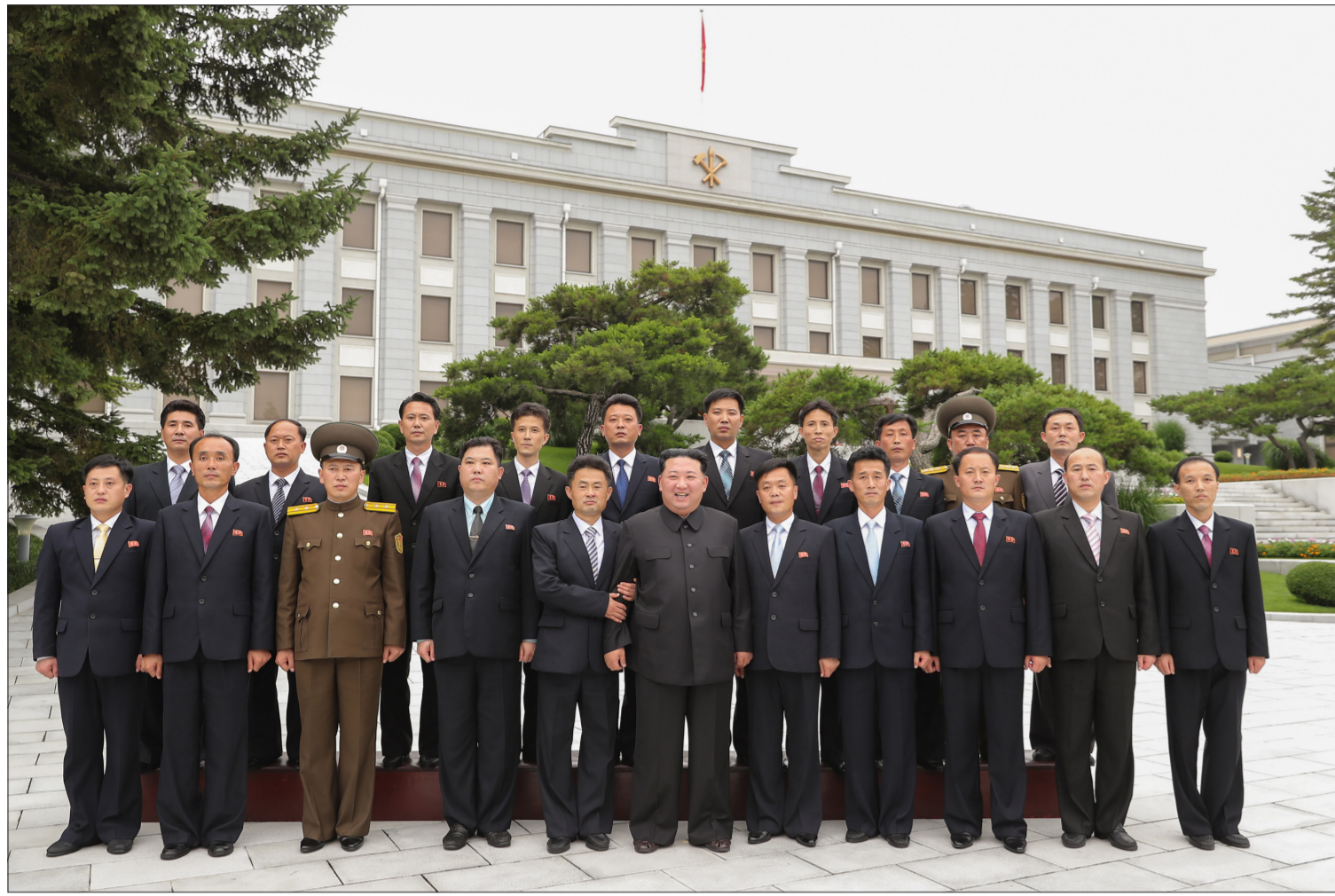
FROM PAGE 9

conscious of the expectations of millions of Party members and all other people, he pointed out that this served as the greatest encouragement to the WPK that is staunchly ushering in the period of overall development of socialism by giving the fullest play to the