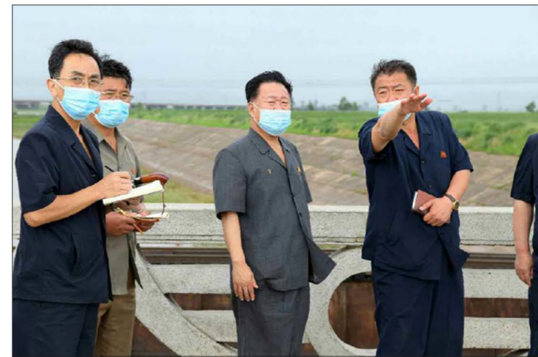
Choe Ryong Hae (third from left), chairman of the Standing Committee of the Supreme People's Assembly, inspects several units in South Phyongan Province.