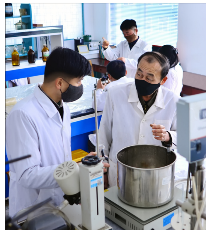
Scientists are engaged in research into projects for the establishment of the C1 chemical industry at the Hamhung branch of the State Academy of Sciences.

Researchers of the branch also developed Tetron rayon yarn spinning and spinning oil and tanning agents and introduced them into several units.