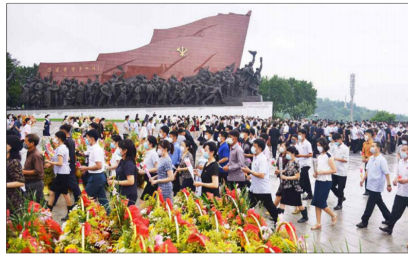
Pyongyang citizens climb up Mansu Hill to pay floral tribute to President Kim Il Sung and Chairman Kim Jong Il.

Officials, working people, service personnel and schoolchildren visited the statues of the President and the Chairman across the country to pay the deepest homage to them.