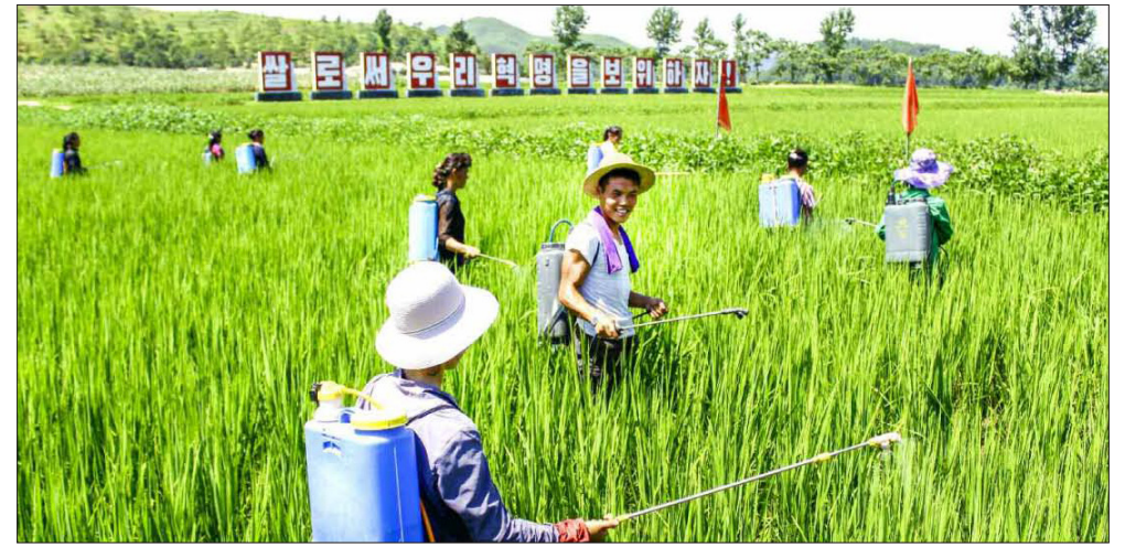
Farmers spray fertilizer in the rice paddy field on the Phunghwa Farm in Anbyon County, Kangwon Province.

their responsibility. The water controllers learn about the growth of paddy rice and occurrence of blight in detail and inform the technicians of the situation. The farm also sufficiently secures agrochemicals needed for exterminating harmful insects and supplies them to workteams. As it frequently rains along with cloudy weather, Jongju City gives priority to raising the photosynthetic capacity of crops. Leaf fertilizing is carried out at intervals of several days by giving precedence to supplying highly-effective nutritive solution. Hwangju County is also controlling rice-paddy water on a scientific and technical way to strengthen the