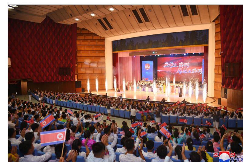
The performance given by the central youth artistic motivational team in celebration of Youth Day (left) and a dance party of youth and students (right).

The DPRK could finally restore peace and stability after exterminating BA.2 virus, which had flowed into its territory, in a matter of some 90 days.