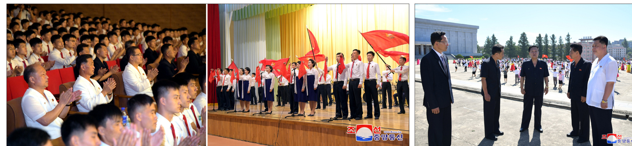
Party and government officials celebrate Youth Day together with young people on August 28.