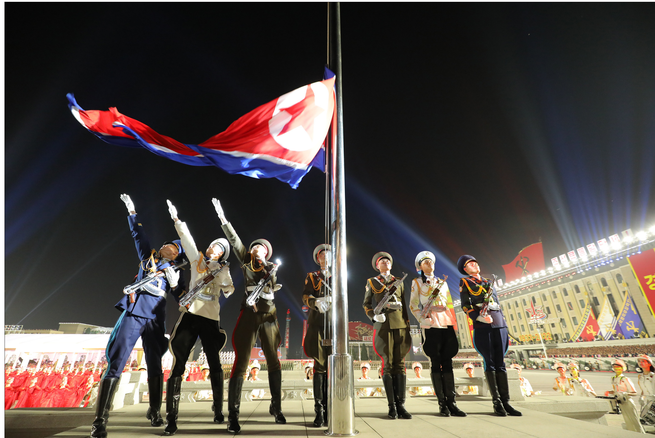
The DPRK flag is raised before the military parade begins in celebration of the 90th founding anniversary of the Korean People's Revolutionary Army.

As independence has defended the dignity of the country and guaranteed their happiness and prosperity, the Korean people pay the highest respect to the great leaders who resolutely embodied the line of independence in the face of all manner of challenges and trials of history and heinous moves of hostile forces and are filled with the enthusiasm to remain faithful to the leadership of General Secretary Kim Jong Un.