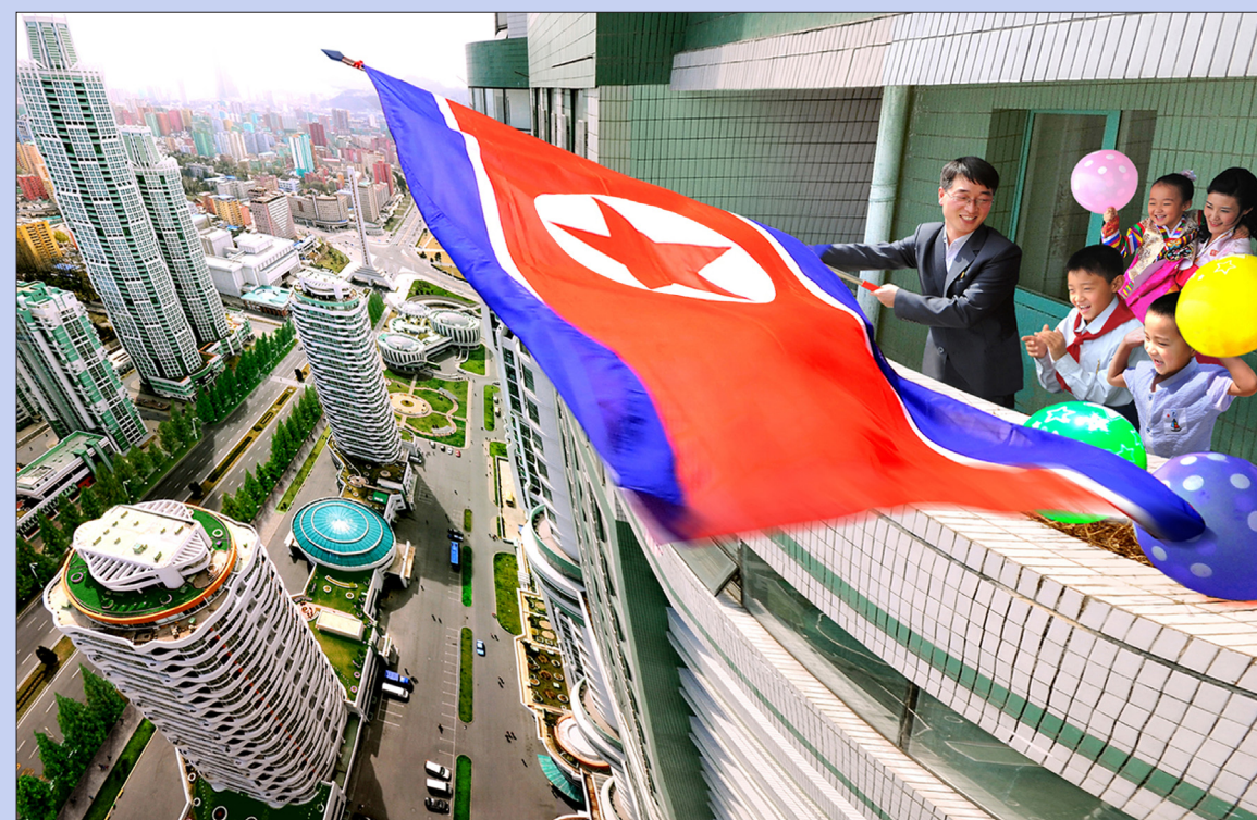
To the Koreans, the flag symbolizes their country they defend with all their heart and soul.

Fighter pilots reverently salute the national flag before sorties, agricultural workers represent the national flag by winning international contests and mothers foster love for the national flag in their children. Because the national flag is not a simple flag for the Koreans, but represents the country they defend with all their heart and soul.