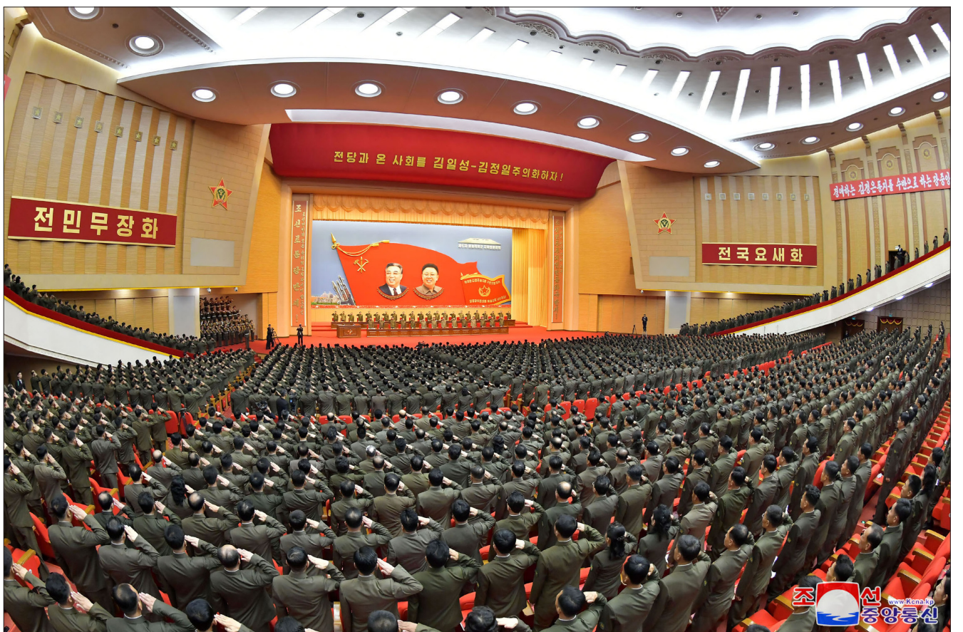
The Sixth Meeting of Active Leading Personnel of the Worker-Peasant Red Guards is held at the April 25 House of Culture in Pyongyang with an eye to perfecting the combat preparations of the paramilitary sector.