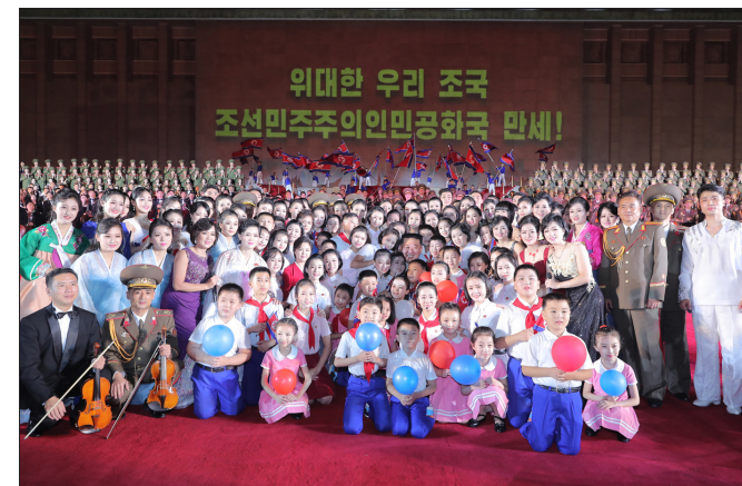
FROM PAGE 11

People's Assembly, the participants in the celebrations, officials of ministries and national agencies, students of the revolutionary schools and citizens in Pyongyang.