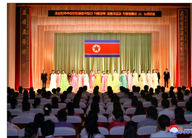
Workers and trade union members get together for poem recital and singing at the Central Hall of Workers in Pyongyang.

KCNA Workers and trade union members held a meeting of poem recital and singing at the Central Hall of Workers in Pyongyang on September 6 in celebration of the 74th anniversary of the founding of the DPRK. The numbers reflected deep reverence for the respected Comrade Kim Jong Un who opened up a new era of self-respect and prosperity, an our-state-first era, and is demonstrating the national power and prestige of the DPRK to the whole world.