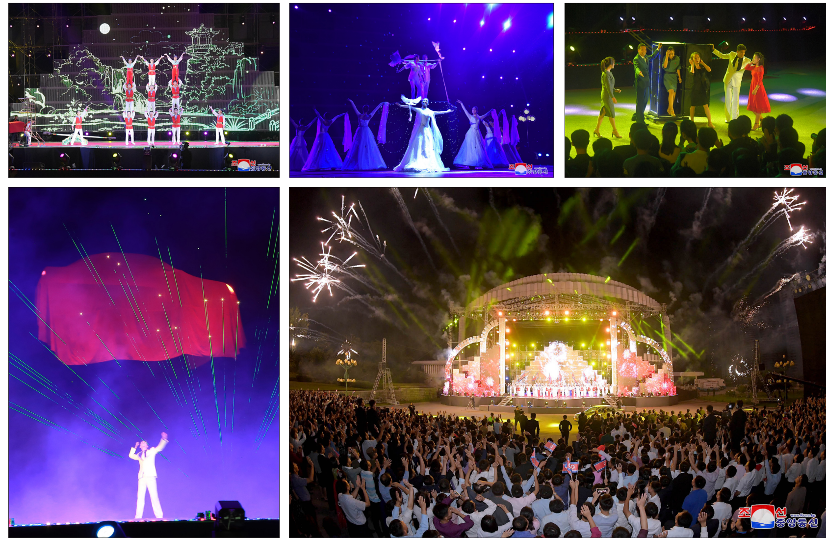
A grand magic and acrobatic performance is put on in front of the People's Theatre in Pyongyang on September 9.

KCNA A grand magic and acrobatic performance in celebration of the 74th anniversary of the founding of the DPRK was given in front of the People's Theatre in Pyongyang on September 9. Members of the diplomatic corps in the DPRK and visiting foreigners and overseas Koreans watched the performance. Marking the birthday of their beloved country which has made dynamic advance on the will and strength of the people, creators and artists of the National Acrobatic Troupe presented special grand magic pieces and acrobatic feats to add to the jubilation of the holiday. Put on the stage were a variety of magic and acrobatic works such as illusionary magic "Disappeared magician", physical acrobatic pieces "Seesaw set", "Dove trick and modelling on roller stakes" and "Horizontal bar and flying from swing" and comic acrobatic piece "Ring trick". The performers displayed high artistic skills and refined technical moves in the fantastic pieces well preserving the characteristics of socialist national acrobatics including those which won gold prizes at international acrobatic festivals. The spectators were