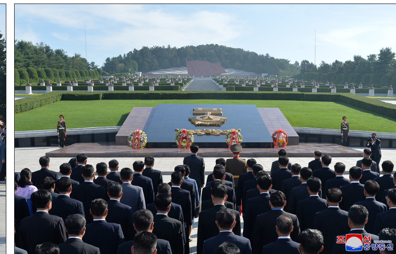
Wreaths are laid at the Revolutionary Martyrs Cemetery on Mt. Taesong on the occasion of the 74th anniversary of the founding of the DPRK.