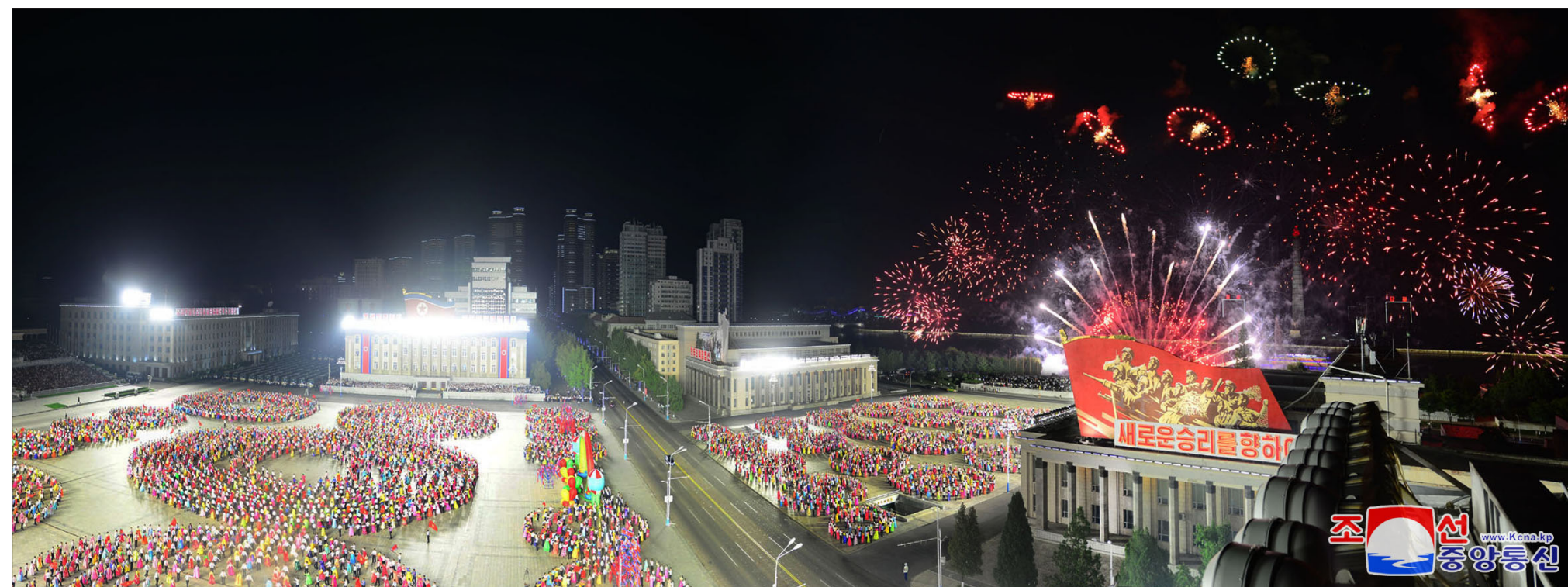
An evening entertainment of youth and students and a firework display take place at Kim Il Sung Square in Pyongyang on September 9 in celebration of the 74th anniversary of the DPRK.

KCNA 9 in celebration of the 74th anniversary of the DPRK. As the melody of song The Glorious Motherland reverberated to signal the beginning of the evening entertainment, a large DPRK flag was unfolded at the centre of the square, followed by a circle dance of youth and students. They danced to the tune of Glory to General Kim Jong Un with the reverence for General Secretary Kim Jong Un who raised the dignity and national power of Juche Korea to the highest level and ushered in a new era of self-esteem and prosperity on this land. Their hearts burned with pride as the youth of a powerful country as they enthusiastically danced to the tune of Looks of Korea and We Started from Scratch . Fireworks displayed in the nocturnal sky along with the thrilling sound of firing revved up the atmosphere of the dancing party.