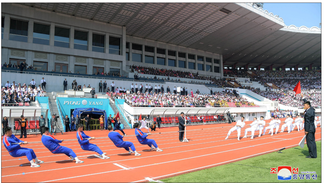
National Inter-Provincial Games-2022 are held in Pyongyang.

of the Political Bureau of the Central Committee of the Workers' Party of Korea, first vice-president of the State Affairs Commission of the DPRK and chairman of the Standing Committee of the Supreme People's Assembly,