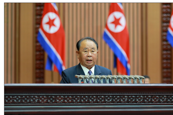
Ri Pyong Chol

Jon Hyon Chol was by-elected as chairman of the Budget Committee of the SPA and Kim Yun Sil and Hwang Man Bok were by-elected as its members. Choe Ryong Hae, chairman of the SPA Standing Committee, made a closing address.