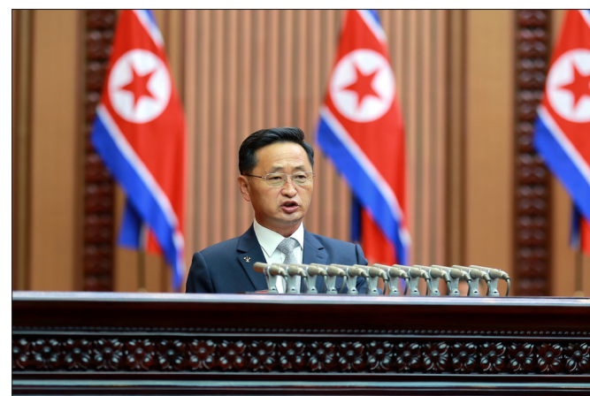
Kim Tok Hun