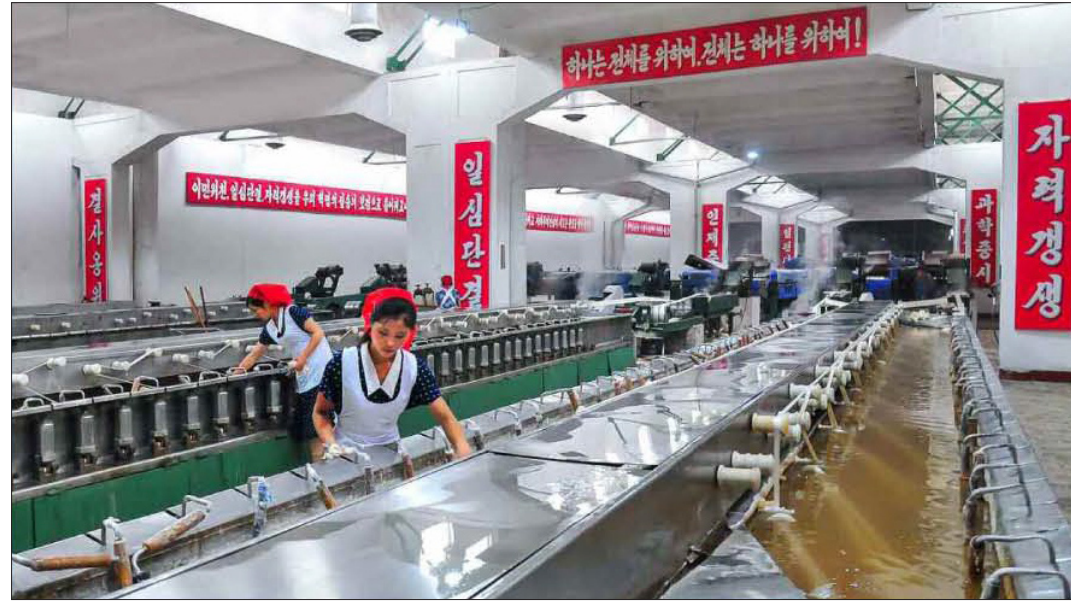
Production and consolidation of its foundations are simultaneously pushed at the February 8 Vinalon Complex.

Technicians and skilled workers introduced a technical innovation plan capable of completing the piping work of over 7 000 metres in