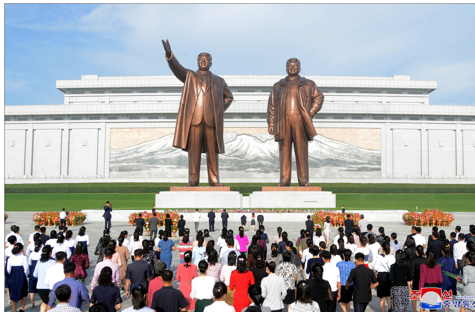
Working people and youth and students visit the statues of President Kim Il Sung and Chairman Kim Jong Il on Mansu Hill.

Working people, service personnel, youth and students laid flower baskets, bouquets and flowers at the statues and the portraits of beaming images of the great leaders