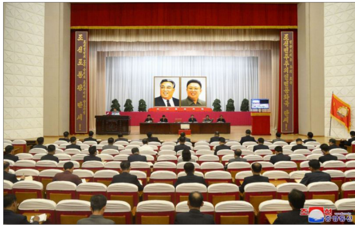
An enlarged meeting of the Fifth Plenary Meeting of the Eighth Central Committee of the General Federation of Trade Unions of Korea takes place on September 20 through videoconferencing.

He referred to the need to continuously intensify the work of modelling the whole union on the revolutionary ideas of the Central Committee of the Workers' Party of Korea and more thoroughly establishing the unified leadership system of the respected Comrade