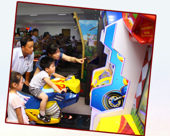
Working people and students spend a good time at the Rungna People's Recreation Ground.