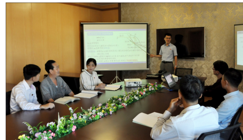
Lecturers evaluate teaching method through broad discussion at the mathematics faculty of Kim Il Sung University.