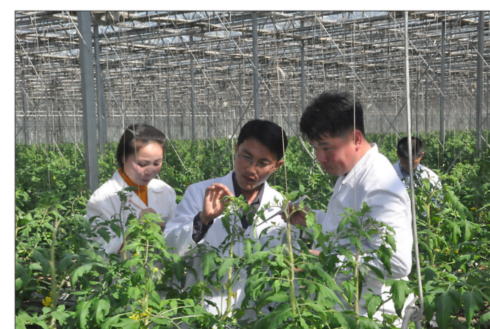
AN YONG CHOL / THE PYONGYANG TIMES

greenhouses across the country, the institute has made a substantial push to the dissemination of sci-tech information about vegetable growing.