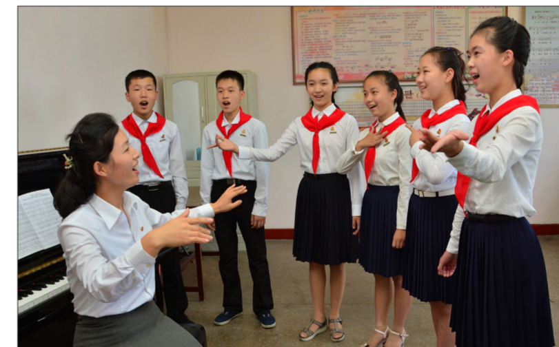
Students undergo ensemble training at school.