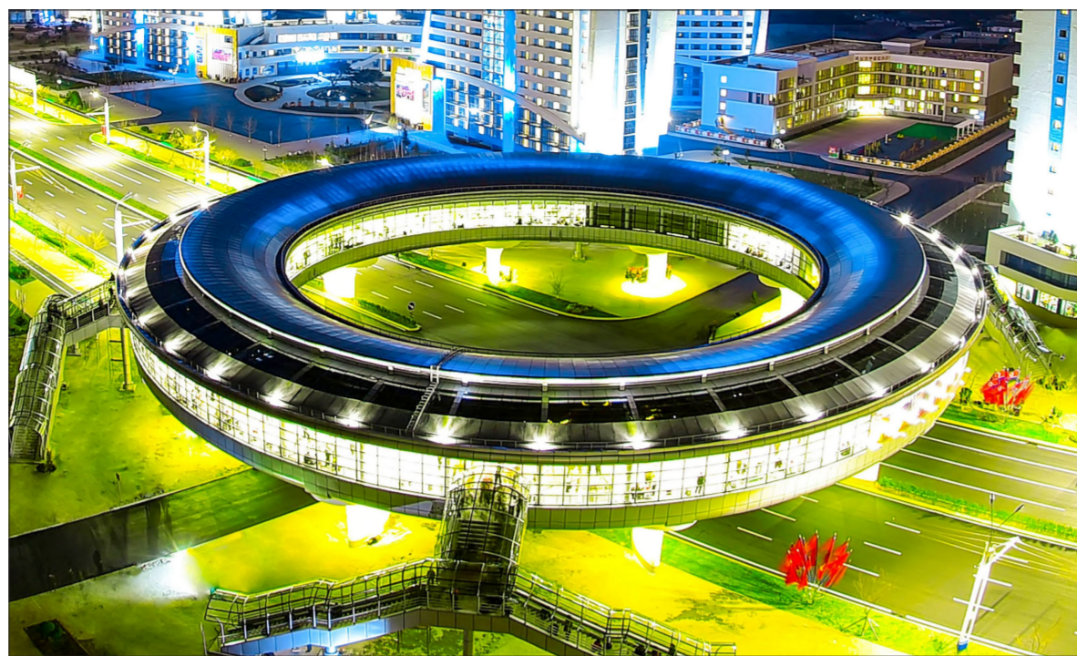
The circular elevated bridge and the cosmetics booth on it.

"We have purchased building parts and daily necessities for a new household and we are very satisfied since they are smart and useful ones made from domestic materials," said a newly married couple living