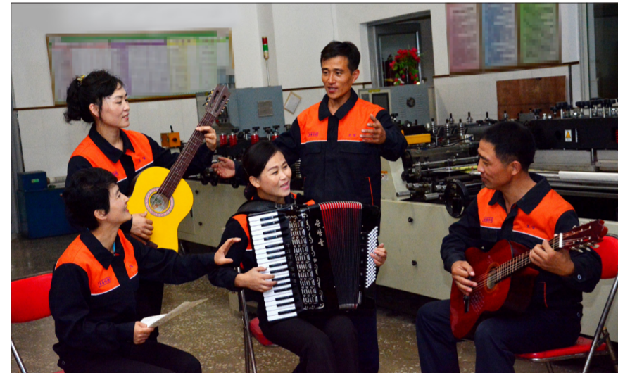
Workers sing at break at the May Day Stadium General Processing Factory.

artistic abilities are improved automatically, he added. An employee created and performed a witty talk to earn the respect of many co-workers as a "master of narrative". The factory provides all conditions for everyone to display their talents in the mass cultural and artistic activities. The production activities and daily schedules are properly organized to suit the characteristics of each workteam and to help employees acquire different artistic skills like literature, sketch and calligraphy as well as singing and playing musical instruments.