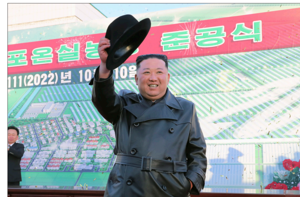
SEE PAGE 4

Repeatedly praising the KPA, saying that to turn the field into a splendid vast