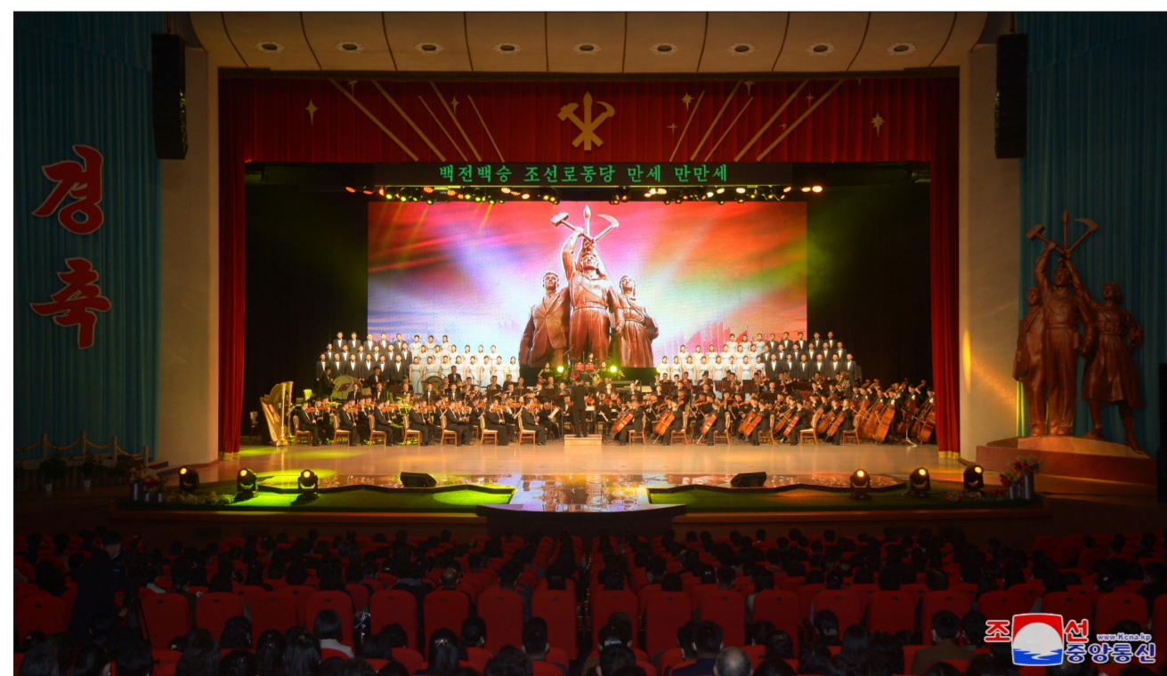
A joint performance is given at the East Pyongyang Grand Theatre on October 9 by the Mansudae Art Troupe and the National Symphony Orchestra.

KCNA 9 to celebrate the 77th anniversary of the Workers' Party of Korea. Working people in Pyongyang saw the performance. Put on the stage were such colourful numbers as famous songs in the era of the Workers' Party, which were resounded in the annals of the revolution, and orchestral music and dance pieces full of national sentiment and optimism. They won enthusiastic applause from the audience as they fired them with great zeal for proudly building up a wonderful socialist country that brings all dreams and ideals of the people into brilliant reality under the leadership of the WPK.