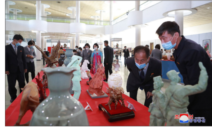
The third national sculpture and handicraft festival is held on October 7 at the Okryu Exhibition Hall.