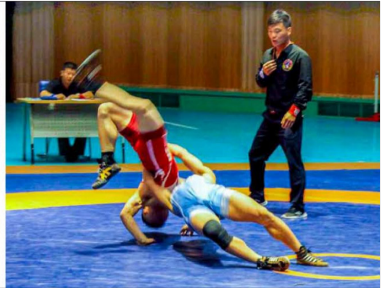
Scenes of matches at the national championships held from September 12 to October 7.