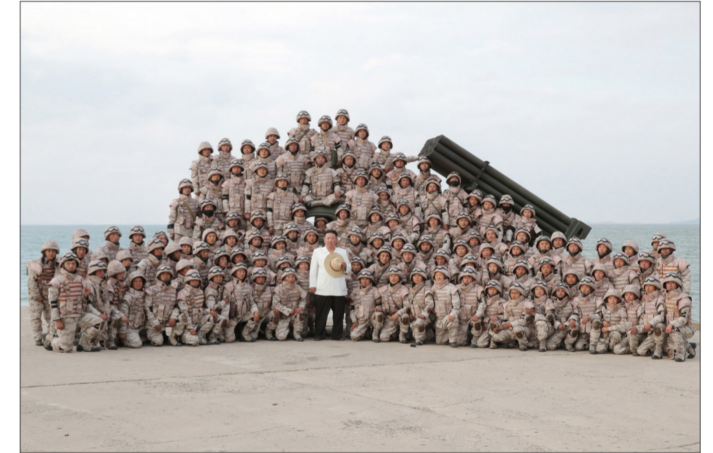
FROM PAGE 12 _____ targets, to become skilful in air and combat pilots for fully displaying the excellent actual war capacity they steadily improved in the days of enhancing the combat power and bravery and patriotism peculiar to the KPA, and he was satisfied with the fact that they are fully prepared ideologically, morally, militarily and technologically so that they can positively and properly cope with a sudden actual war. Noting that in the steadily-deteriorating military situation in the vicinity of our state, the more rapid and proper preparedness for war and the improved military counteraction ability present themselves before our revolution as an essential demand, he underlined the need for all the service personnel to be more fully ready for action in a high alert posture at all times. Calling on all the service personnel to more firmly arm themselves with the thoroughgoing view of principal enemy and the Juche-oriented view of war and to defend as firm as a rock the frontline of the country and its sovereignty with matchless military strength, he had a significant photo session with the soldiers who participated in the drills. All the service personnel are making solemn resolution to perfectly SEE PAGE 14