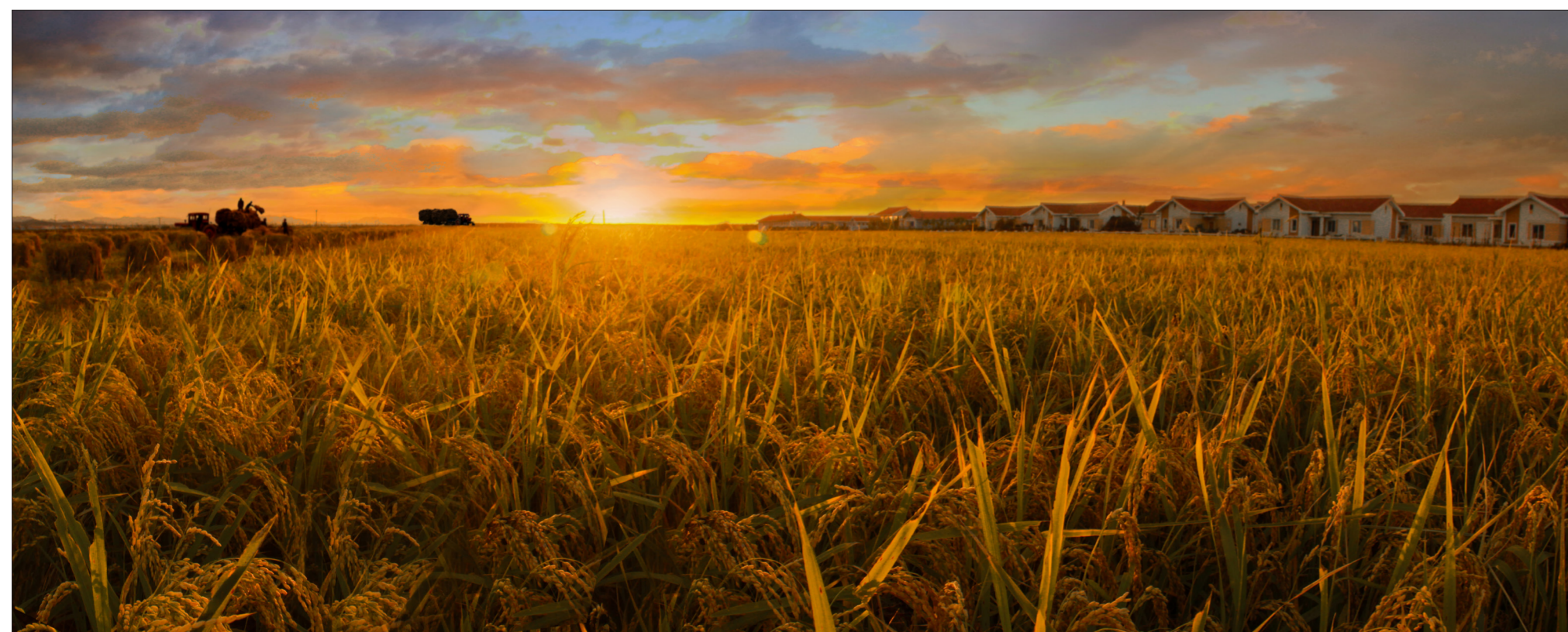
A paddy field of Taechong-ri in Unpha County, North Hwanghae Province.

when the outbreak of harmful insects is the most frequent, but also reduces the damage by various kinds of harmful insects by over 85 percent. It can also reduce a large amount of the agrochemical to be used. Costing low and highly efficient, these agrochemicals were introduced into many farms across the country and fully proved advantageous and effective.