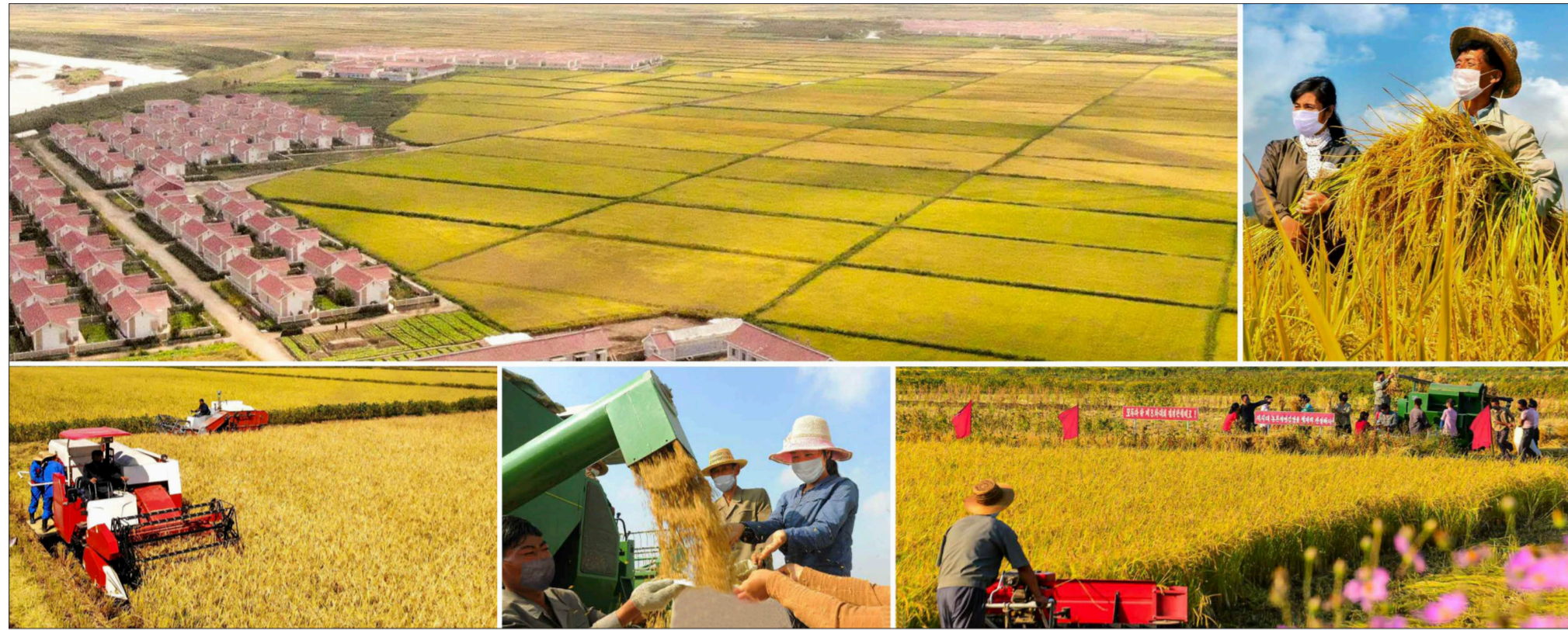
All farms across the country seethe with harvesting and threshing.