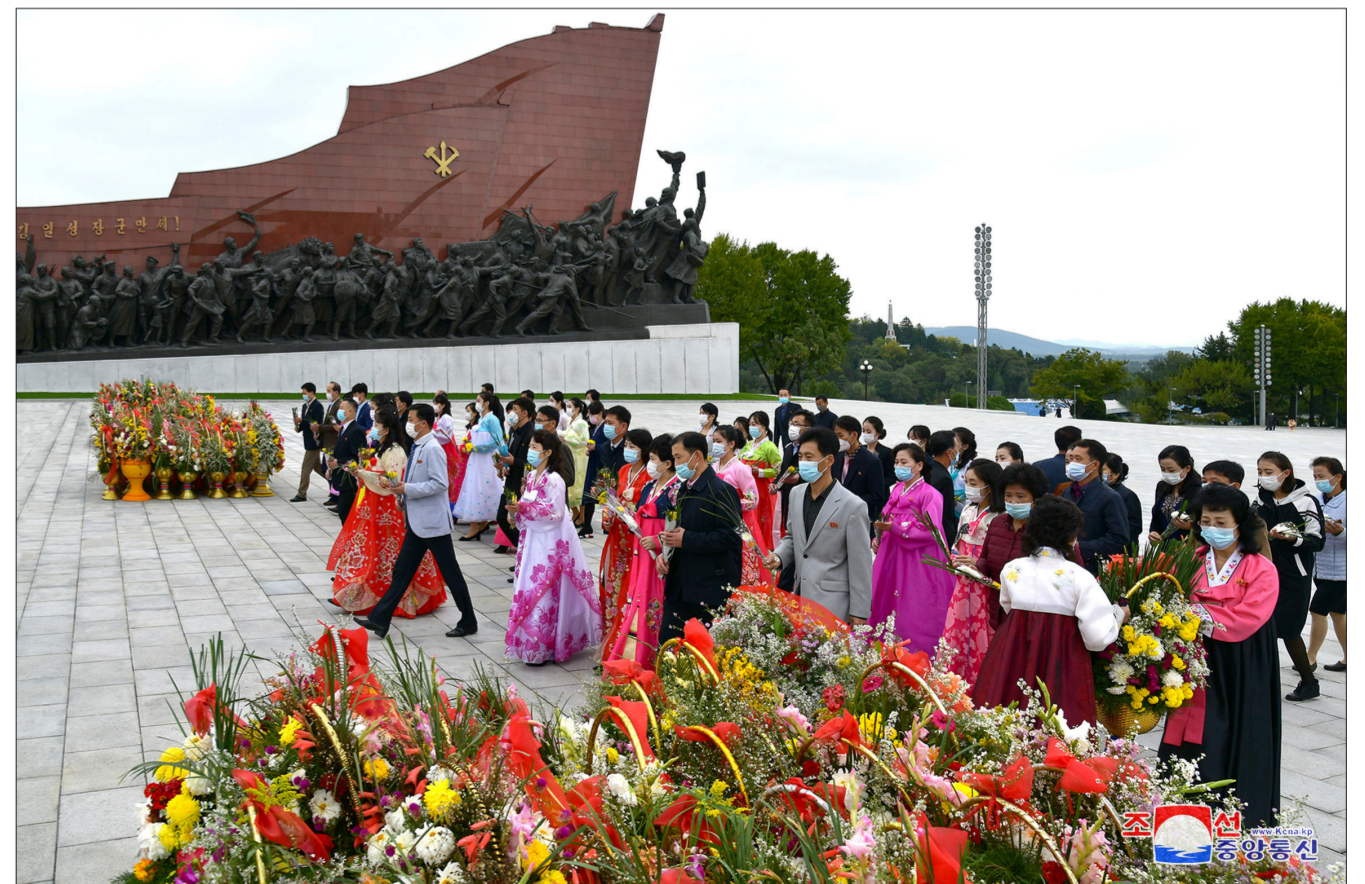
People visit the statues of President Kim Il Sung and Chairman Kim Jong Il on Mansu Hill in Pyongyang.

On the same day there was a men's football match between Ryomyong and Rimyongsu teams at Kim Il Sung Stadium in Pyongyang.