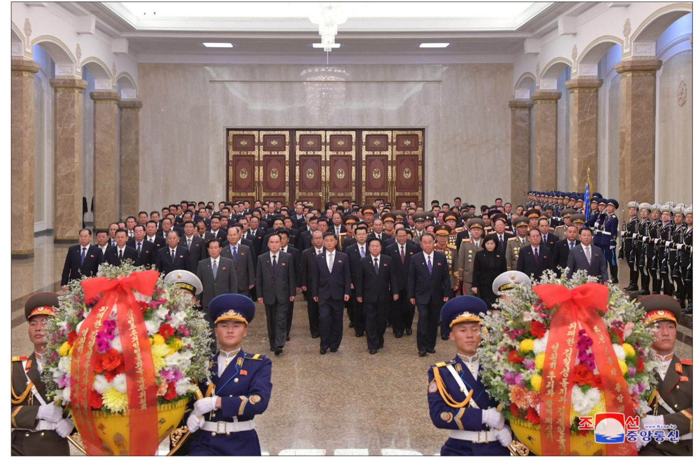
Members of the central leadership body of the Workers' Party of Korea and officials of the Party Central Committee visit the Kumsusan Palace of the Sun at 00:00 on October 10 on the occasion of the anniversary of the WPK.

The visitors entered the palace with ardent yearning and boundless reverence for President