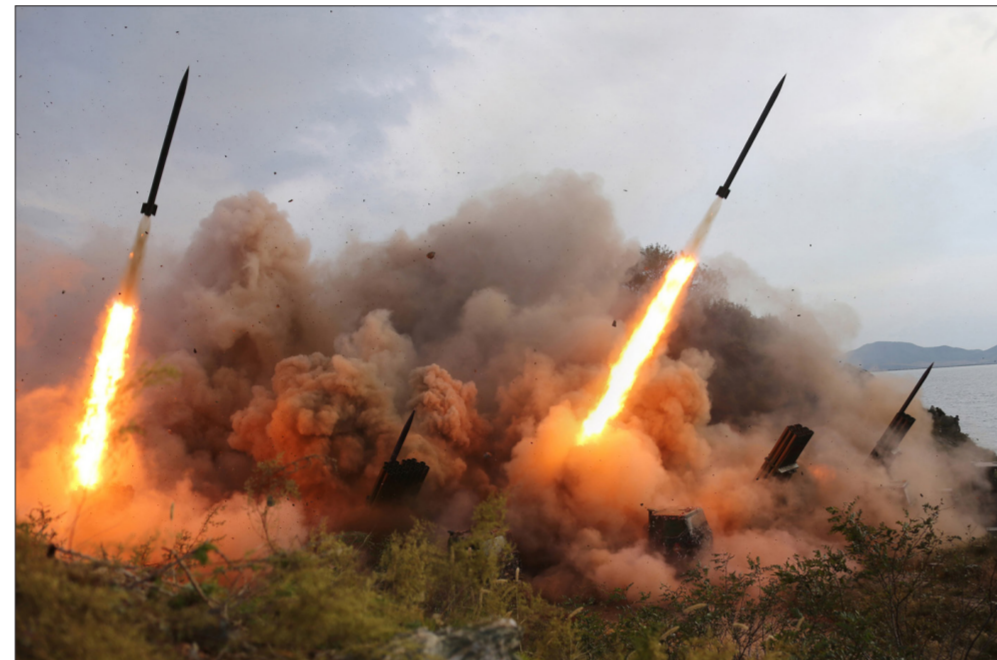
FROM PAGE 11 _____ preparedness for operation to cope war capacity were clearly proved. _____ forces, including an aircraft carrier of a result, the accuracy of the state of _____ with an emergency and the high actual Now that the combined forces' naval SEE PAGE 13