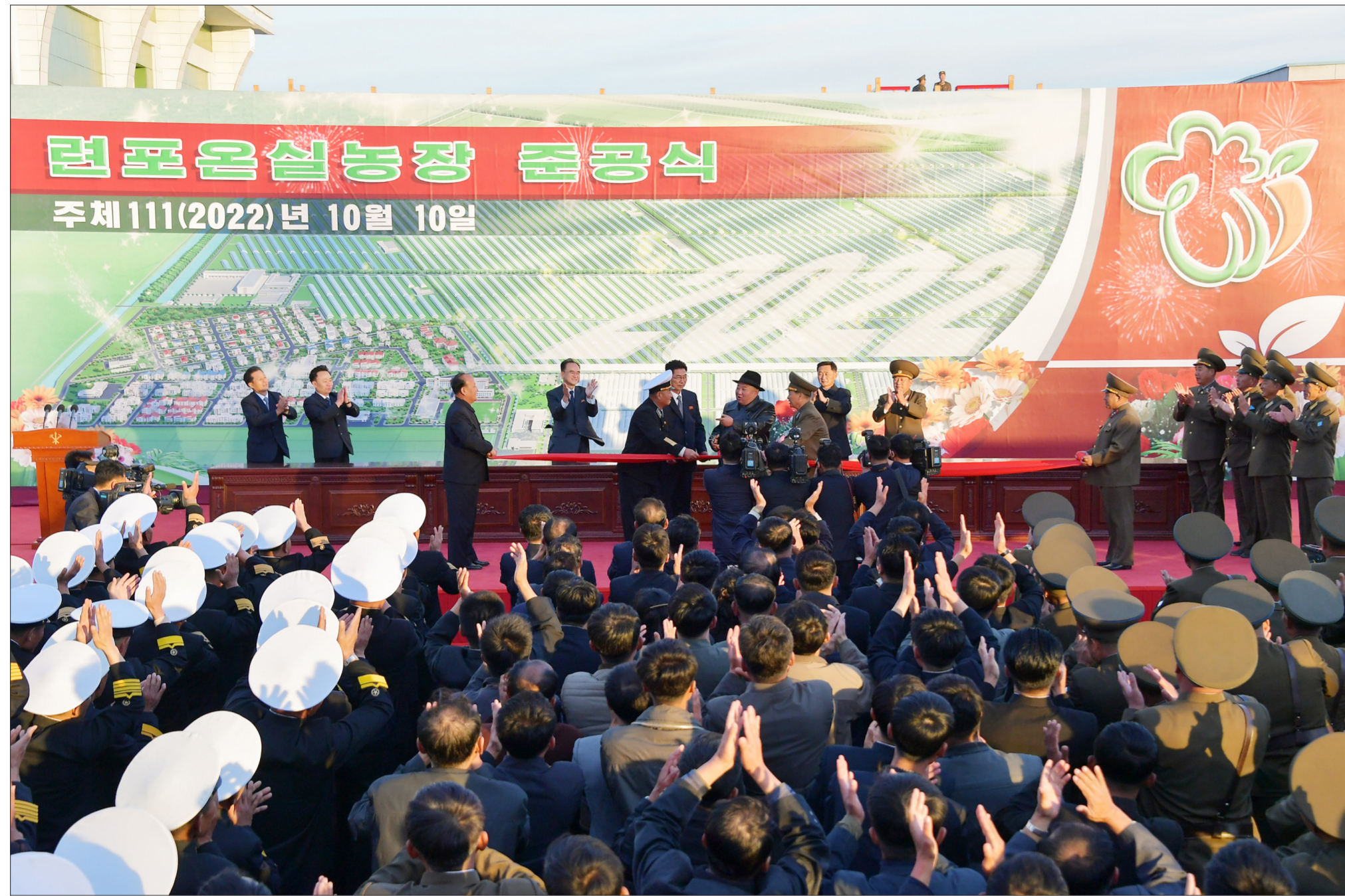
FROM PAGE 1

A grand inauguration ceremony was held on October 10.