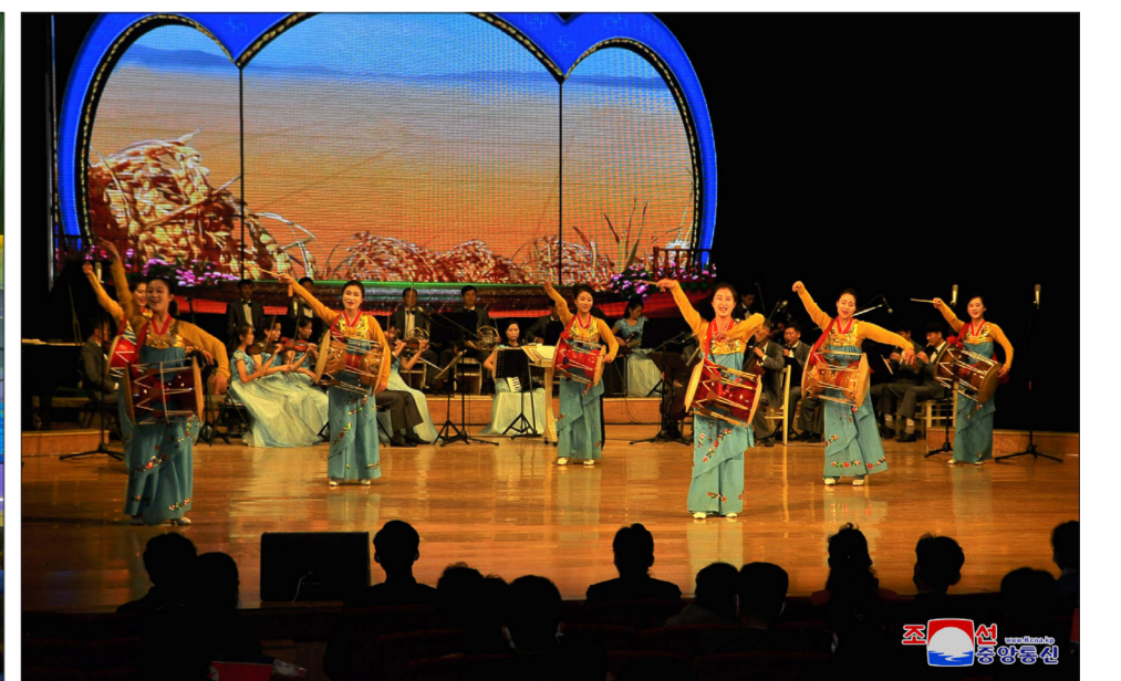
Celebratory performances and dance parties take place in all parts of the country.