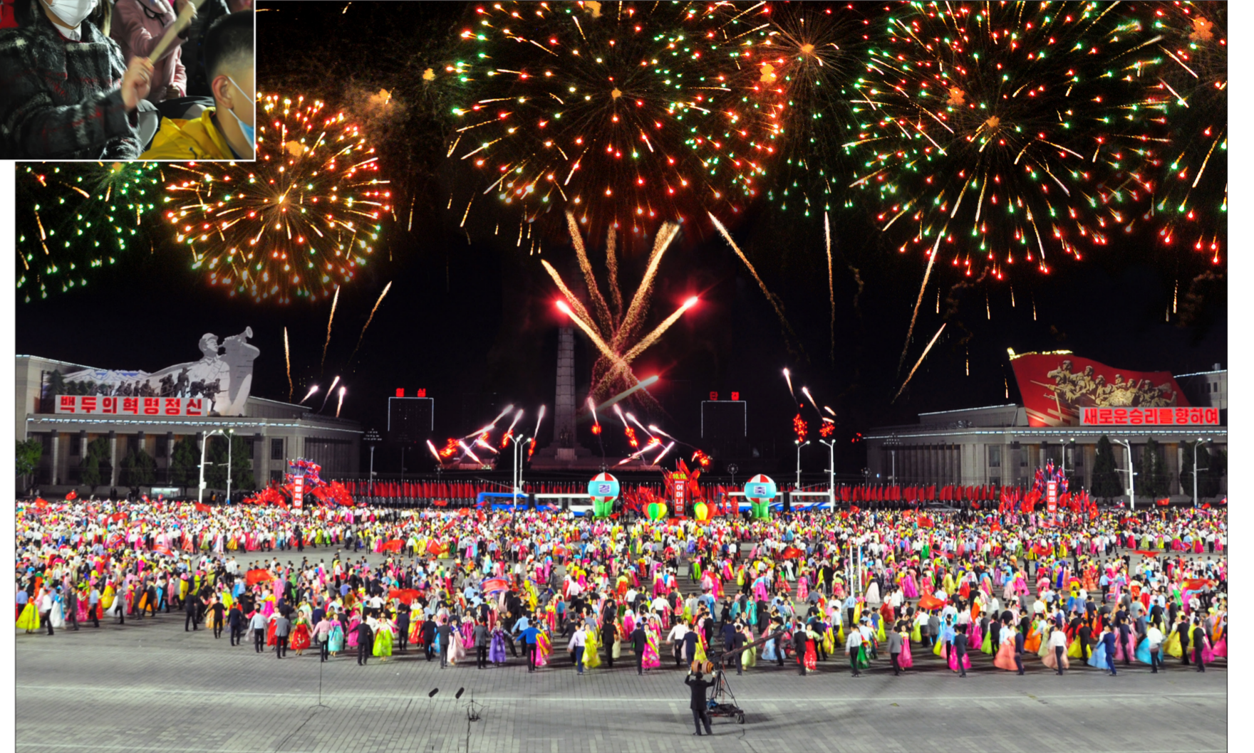
Youth and students hold a gala evening and a firework display takes place at Kim Il Sung Square in Pyongyang.

KCNA Youth and students held a gala evening and a firework display took place at Kim Il Sung Square in Pyongyang on the evening of October 10 to celebrate the 77th anniversary of the Workers' Party of Korea. The venue was full of excitement and joy of young vanguards who lead a worthwhile life as patriotic youth in the embrace of the WPK. They held a huge and joyful dance party, paying the highest tribute to President Kim Il Sung and Chairman Kim Jong Il, founder and builder of the WPK, who had strengthened and developed it into the ever-victorious revolutionary party and led it along the road of victory. The spectacular display of fireworks revved up the atmosphere of the gala evening.