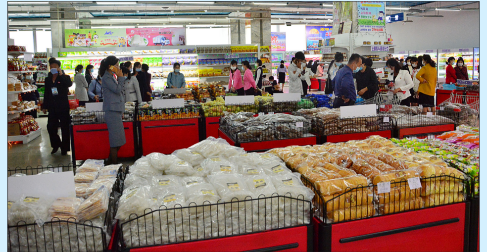
The 13th Pyongyang Department Store No. 1 commodity exhibition takes place in the capital city from October 2 to 11.

ten kinds of new products including hosiery for children, winter and football in which new patterns were introduced. Such footwear factories as the Pyongyang Leather Shoes Factory and Pothonggang Footwear Factory exhibited light and good-looking shoes in various shapes, colours and patterns. A special draw was multi-functional electronic screens "Achim" for public service facilities and household presented by the Achim Computer Joint Venture Company.