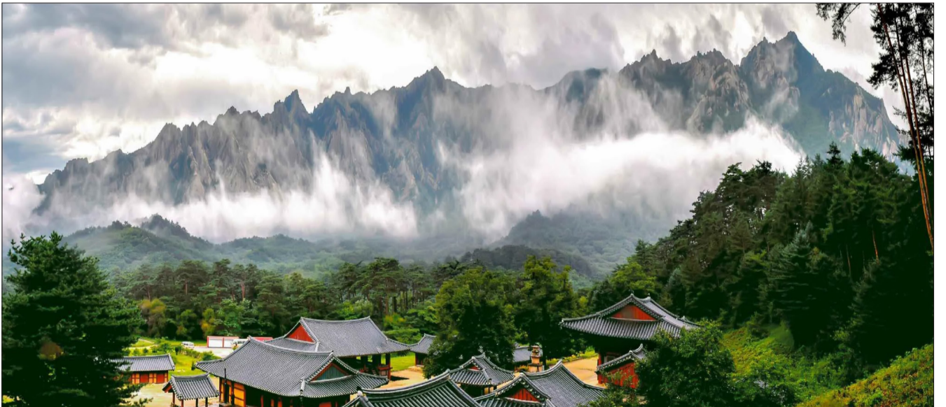
Jipson Peak in Mt Kumgang.

Many fantastic rocks add to the natural beauty of the