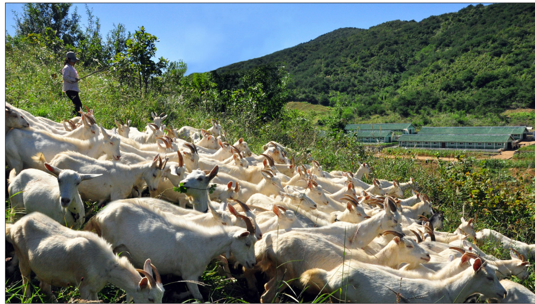
A herd of goats graze in the pasture at the Hwapho branch farm of the Phyongsong City Goat Farm.

Drawing strength from the happy looks of children drinking delicious milk, the city is redoubling efforts to carry out the childcare policy of the Workers' Party of Korea.