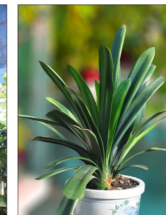
Scarlet Kaffir lily.