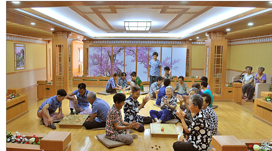
Aged people enjoy themselves with various activities.