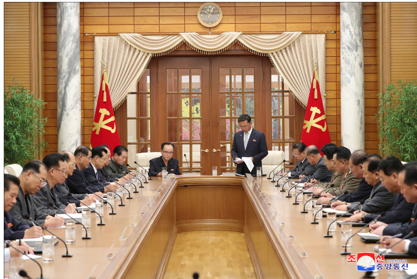
The 10th Meeting of the Political Bureau of the Eighth WPK Central Committee is held on September 25.

Upon authorization of WPK General Secretary Kim Jong Un, Jo Yong Won, member of the Presidium of the Political Bureau of the WPK Central Committee and secretary