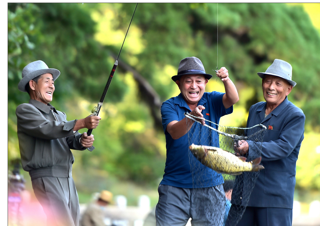
Aged people rejoice in angling at Lake Michon.

I cannot really find the words to correctly express the impression I get when I feel the wriggling motion of the fish I have caught.