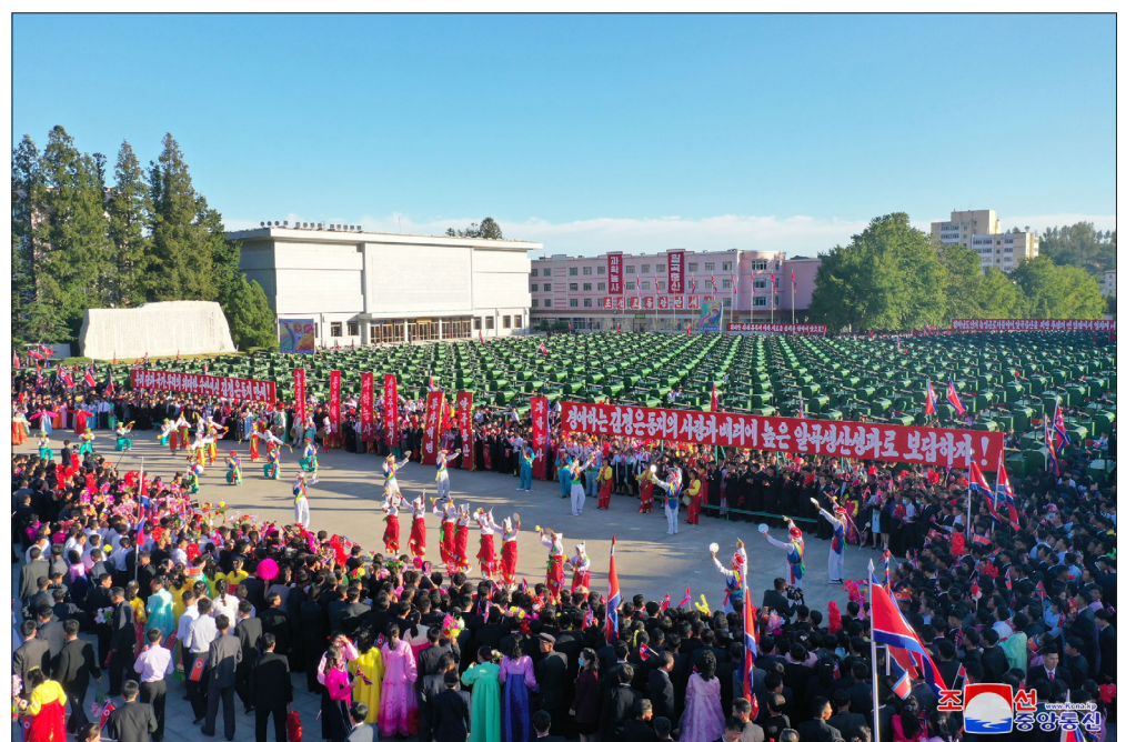
A ceremony takes place at Haeju Square on September 25 to convey farm machines General Secretary Kim Jong Un sent to South Hwanghae Province.