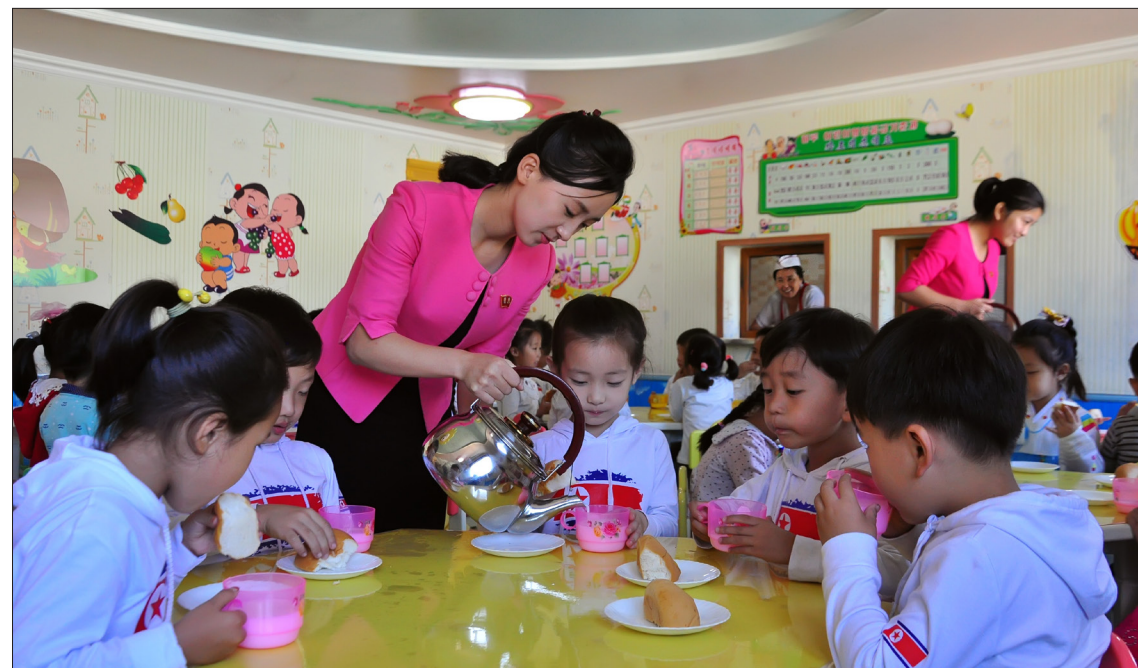
Children drink yoghurt during a snack time at Undok Kindergarten in Phyongsong City.

As a result, it has increased milk output much more than other units this year.