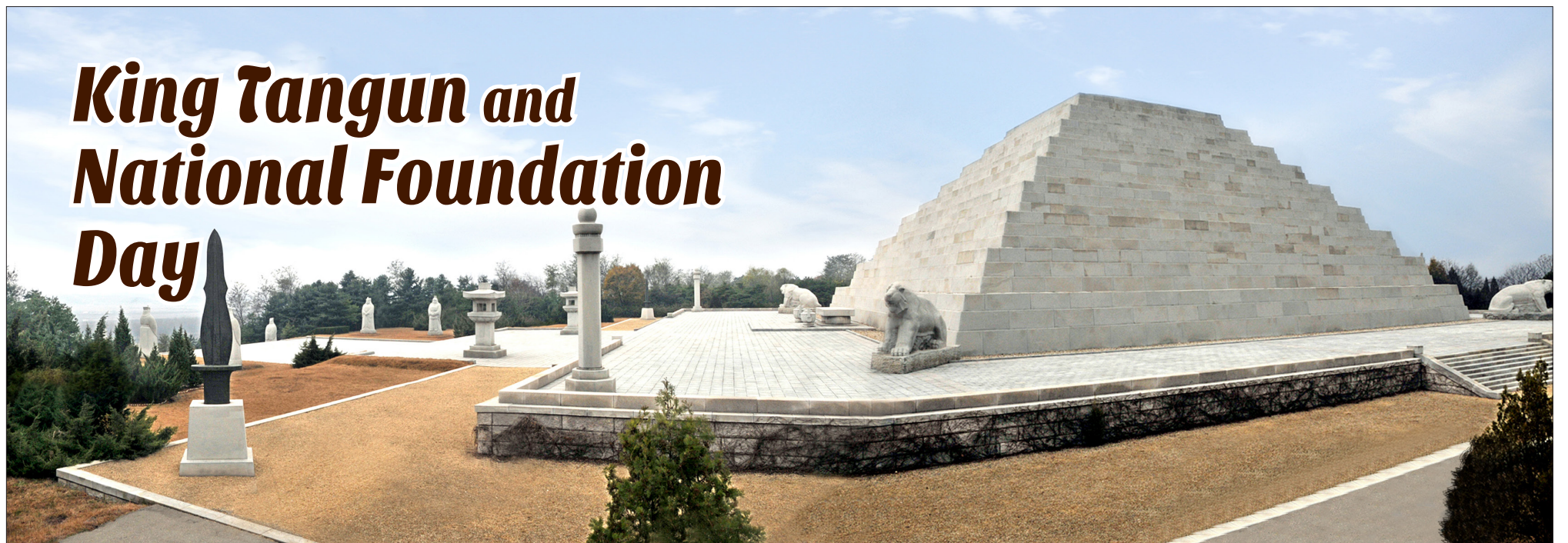
The Mausoleum of King Tangun is located on top of a ridge at the foot of Mt Taebak in Munhung-ri, Kangdong County, Pyongyang.

Tangun is father of the Korean nation who founded Ancient Joseon, the first state in the history of Korea, and created civilization.