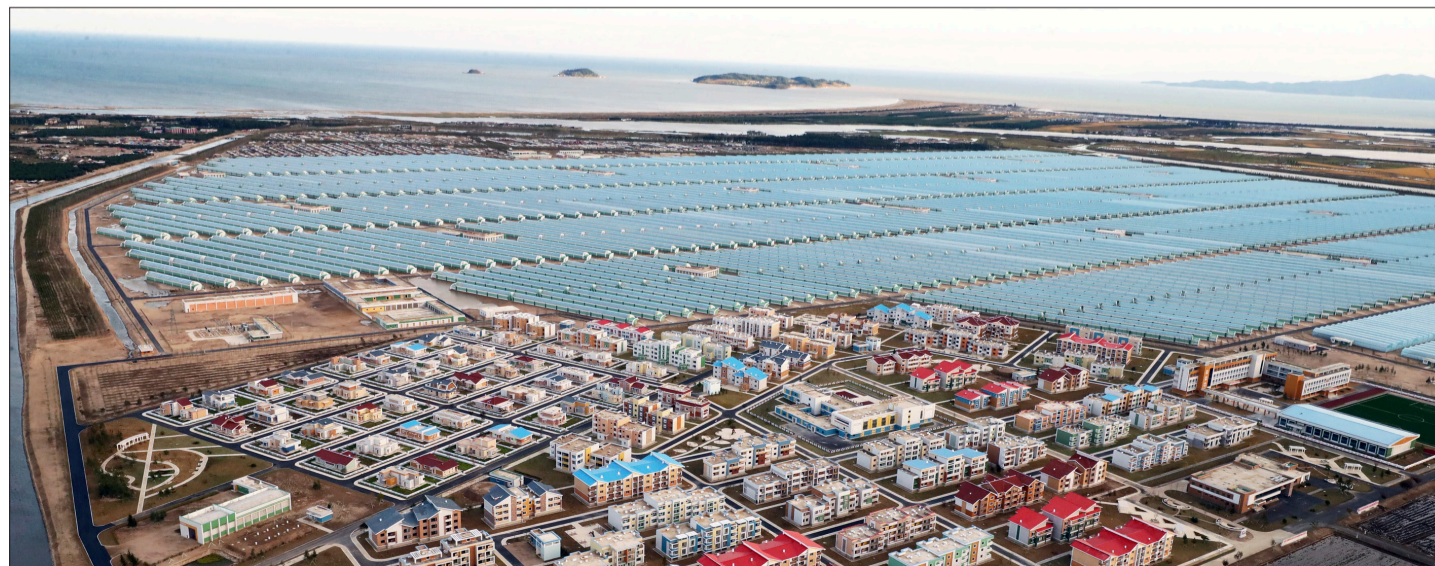
The Ryonpho Greenhouse Farm sprawls over 100 hectares of production area.