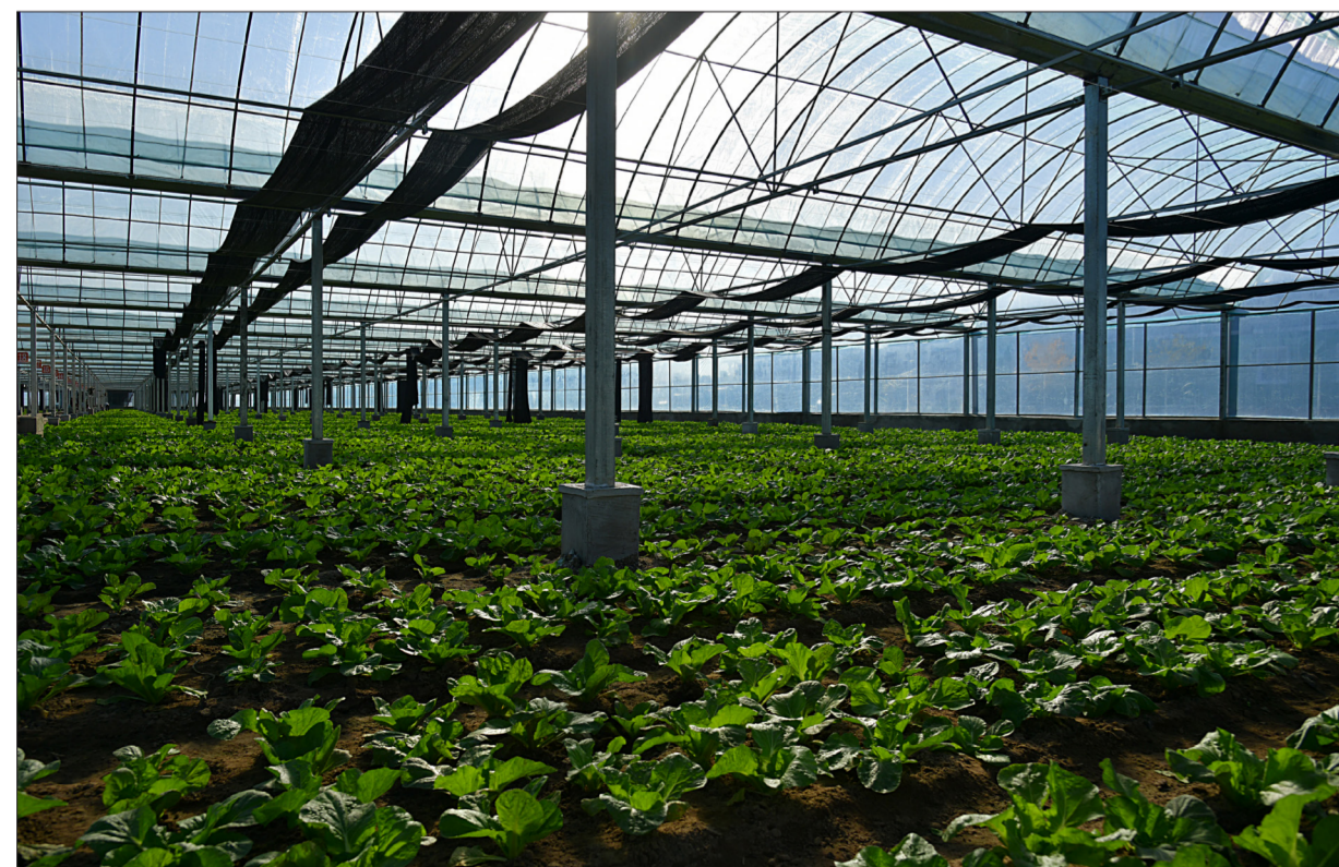
Vegetables grow at a soil greenhouse covered with arched roofs of interconnecting vinyl sheets.

consumption of nutrient solution according to vegetable crops and stages of their growth are measured scientifically and the solution is supplied accordingly. And a high-performance integrated production system with different functions added to it is in operation there. According to Kim Jin Hyok, chief of the vegetable technology laboratory, the temperature, humidity and salinity of all the greenhouses and all other data are measured automatically, and nutrient solution is automatically supplied according to weather and time and the management of environment is done automatically. In particular, the hydroponic greenhouses covered with inclined roofs of glass panes interconnecting with each other are modern ones where everything is done on a scientific, unmanned and automatic footing. The Ryonpho Greenhouse Farm is designed to save much fertilizer and put production on a normal track as its humus soil production process is rationally furnished, the hydroponic greenhouses are fully equipped with a foundation for specially producing cultivation substrates and distributed nutrient solution is sterilized and supplemented with nutritive elements to be reused. "Our farm was built and is in operation for the people both in name and reality. A variety of vegetables produced here will be supplied to residents in Hamhung and other parts of the province in the near future to give them joy," said manager Jo Song Dae.