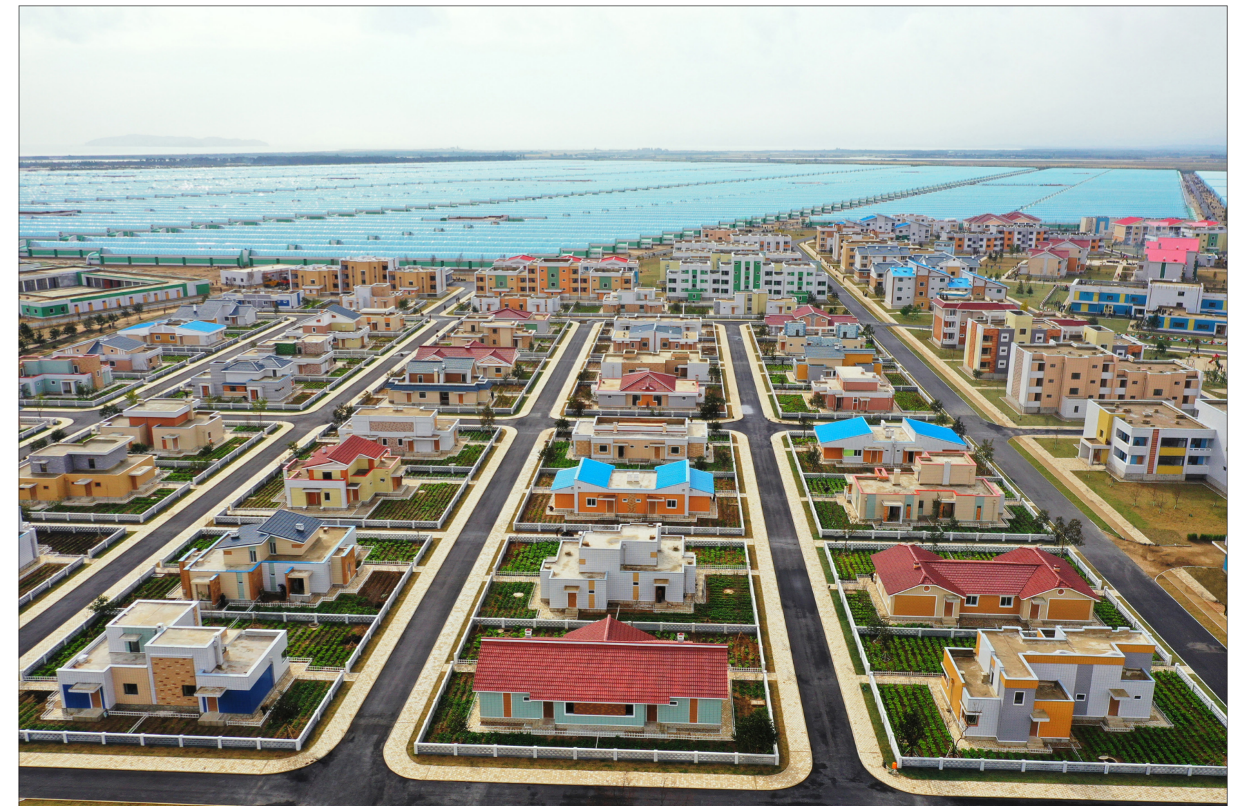
The village of the Ryonpho Greenhouse Farm has 113 blocks of single- and low-storey houses for over 1 000 families built in 99 different styles.