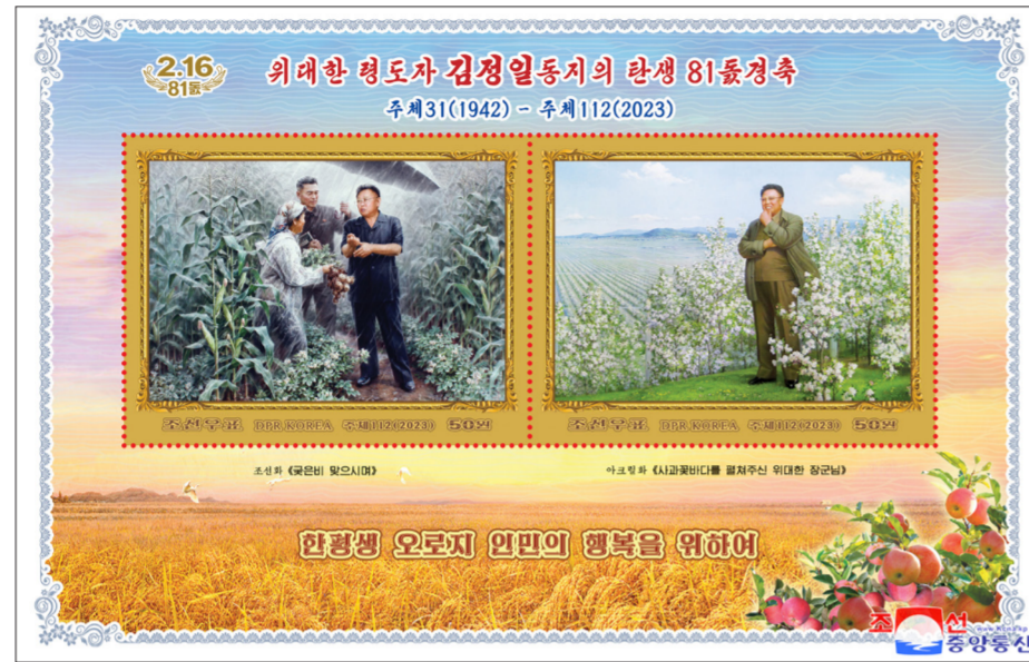
New stamps issued by the State Stamp Bureau of the DPRK.