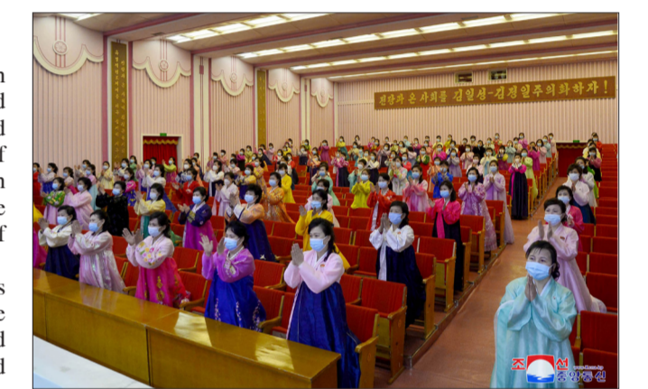
Women's union members hold a celebratory meeting in Pyongyang on February 15.

Agricultural workers and members of the Union of