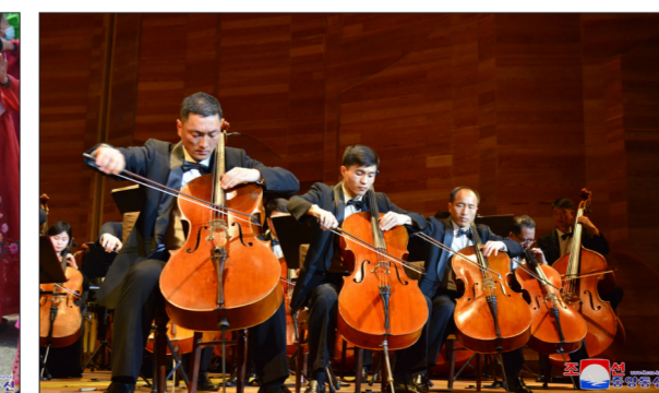
Youth and students and women's union members hold dance parties and colourful performances are given across the country to mark the Day of the Shining Star.