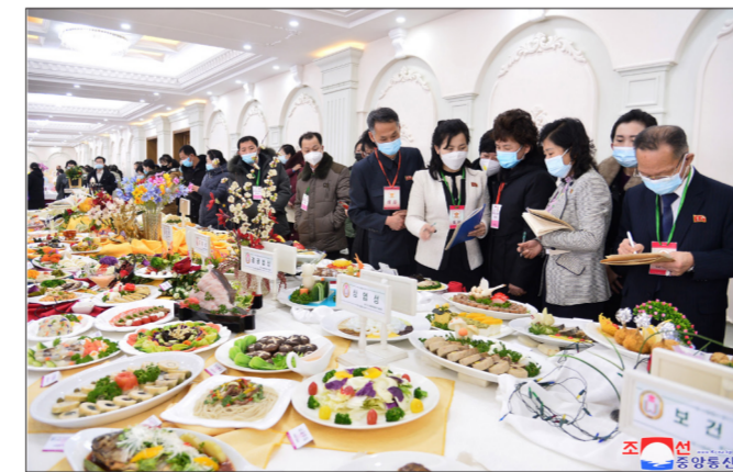
The 11th culinary skill contest in celebration of the Day of the Shining Star is held at the Pyongyang Noodle House between February 12 and 14.

rated in the contest. Meanwhile, similar contests were held at famous restaurants in each province, including Okkye Restaurant in Haeju, South Hwanghae Province, and Kyongsong Tangogi Restaurant in Chongjin, North Hamgyong Province.