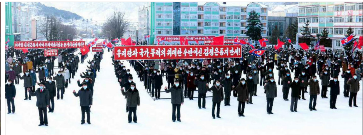
Korean young men and women volunteer to work at the house construction site in the capital city of Pyongyang.