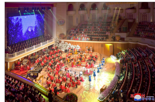
A celebratory performance takes place at the Samjiyon Theatre on February 16 on the occasion of the Day of the Shining Star.

Chairman Kim Jong Il in high esteem as the leader of the revolution and their benevolent father.