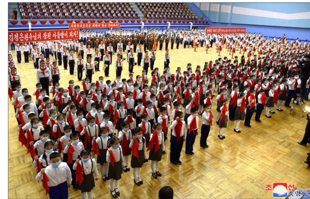
A national meeting of the Korean Children's Union organizations takes place in Pyongyang on February 16 to mark the Day of the Shining Star.

Led by the chief secretary of the Pyongyang Municipal Party Committee, pupils to be admitted to the KCU took an oath.