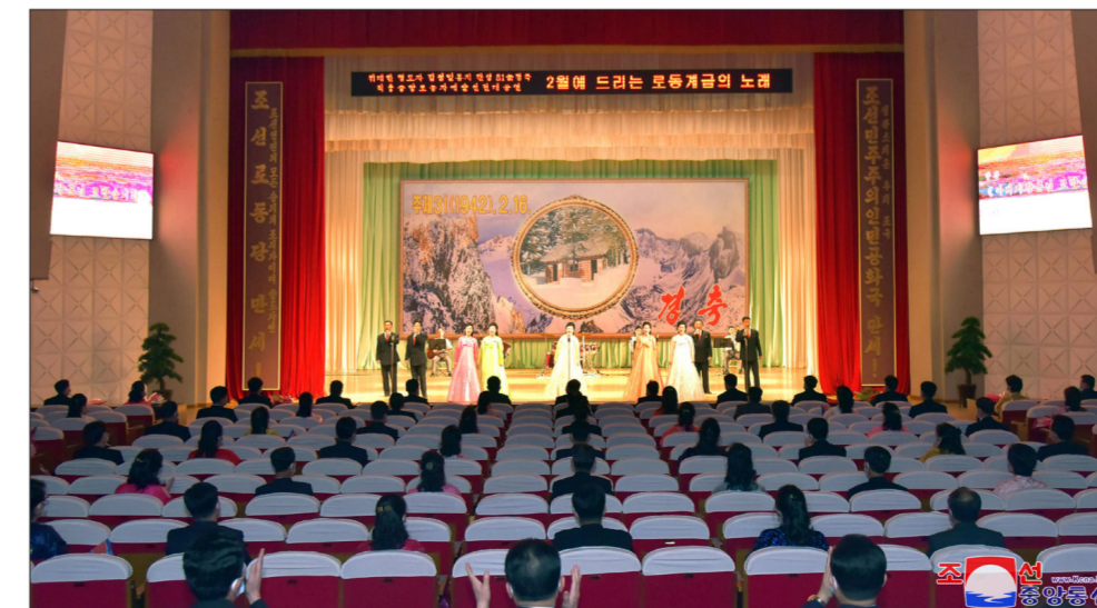
The workers' artistic motivational team of the GFTUK Central Committee gives a performance in celebration of the 81st anniversary of the birth of Chairman Kim Jong Il.

Performers sang highly of the sacred revolutionary life of the Chairman who had performed immortal exploits for the country and revolution, times and history through his tireless revolutionary leadership, regarding "The people are God" as his lifetime motto.