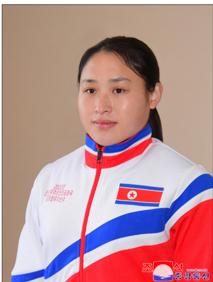
Weightlifter Ri Song Gum