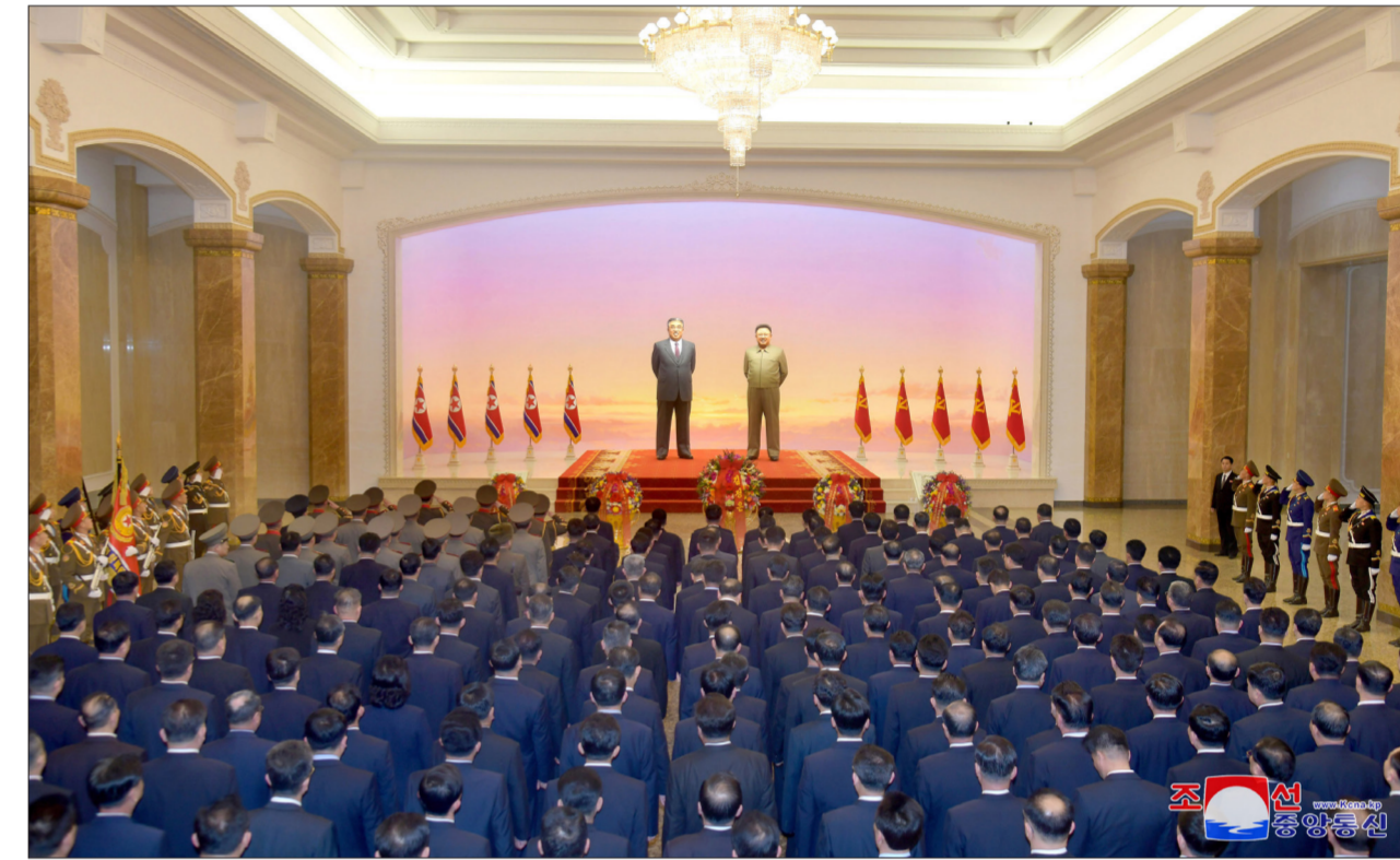
Senior Party and government officials visit the Kumsusan Palace of the Sun on the occasion of the Day of the Shining Star.

A basket of flowers in the name of General Secretary Kim Jong Un was placed before the statues of the