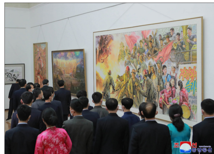
A national art exhibition opens at the Korean National Art Museum on February 13 to mark the 81st birthday of Chairman Kim Jong Il.

the Korean people with a firmer will to vigorously make a new turning point in the development of the state under the leadership of the Party Central Committee, holding the Chairman in high esteem as the Sun of Juche forever. After the ceremony, participants looked round the exhibition hall.