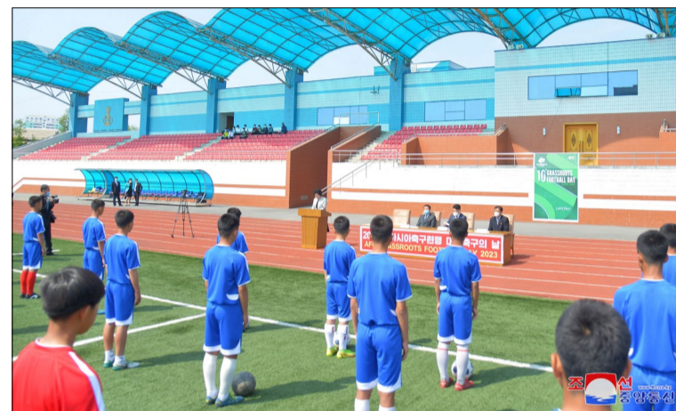
An event takes place at East Pyongyang Stadium on May 15 to commemorate AFC Grassroots Football Day.

The participants, divided into two teams, played an 11-metre penalty kick and a football match and enjoyed themselves as they had their photos taken.