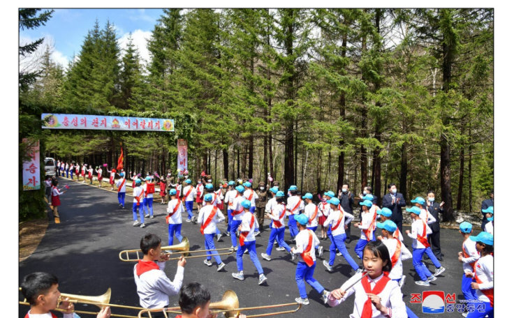
A meeting takes place at the Paektusan Secret Camp on Thursday to start the relay for sending a letter of loyalty by KCU members across the country.