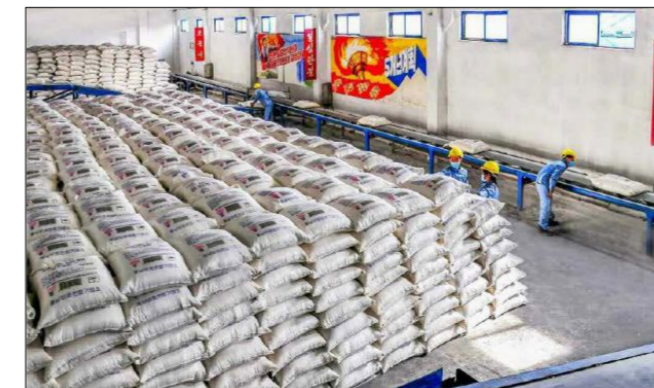
Fertilizer production goes up at the Hungnam Fertilizer Complex.

The team led by the head of the production control room and consisting of technicians of the technology