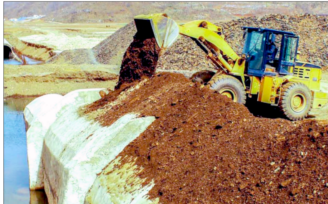
Hwangju Kindung waterway project is progressing apace.