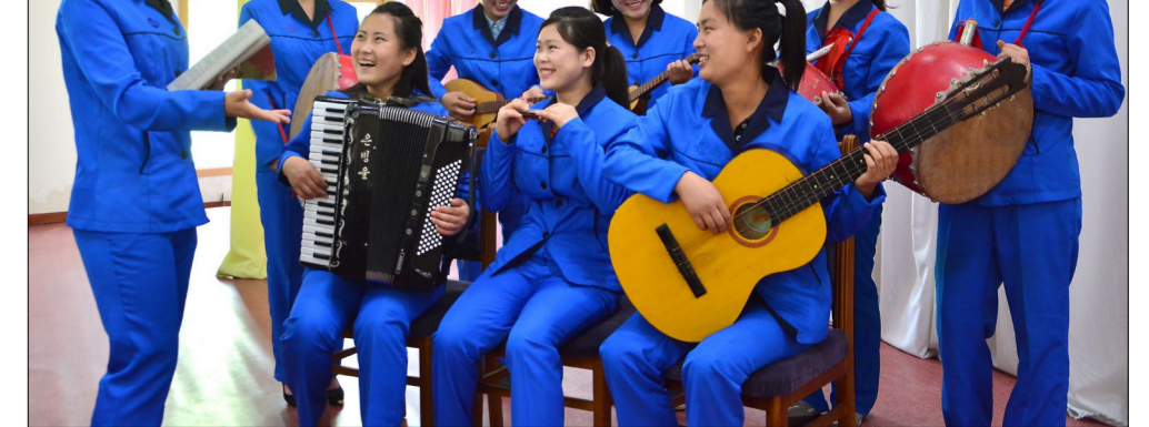
Workers conduct mass artistic activities on a regular basis at the Pyongyang Kim Jong Suk Textile Mill.

"The attachment to the workplace and the working life filled with joy and optimism give me creative inspiration."