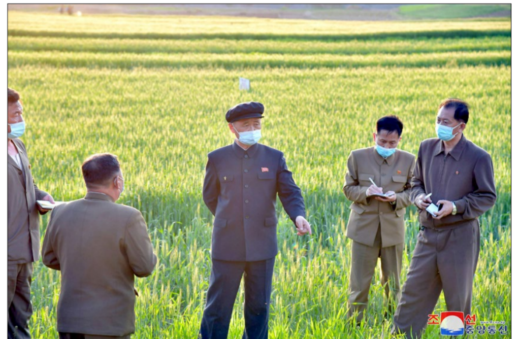
Premier Kim Tok Hun (third from left) visits several farms in North and South Hwanghae provinces to learn about their immediate farming.

Learning about the operation of Nampho Port, he underlined the need to raise the operation rate of harbour cranes and other equipment so as to ensure full promptness in handling freights. The field consultative meetings took measures after discussing the issue of intensifying the agricultural guidance organs' scientific and technological guidance over farming, the issue of giving priority to the supply of farming materials to the countryside and