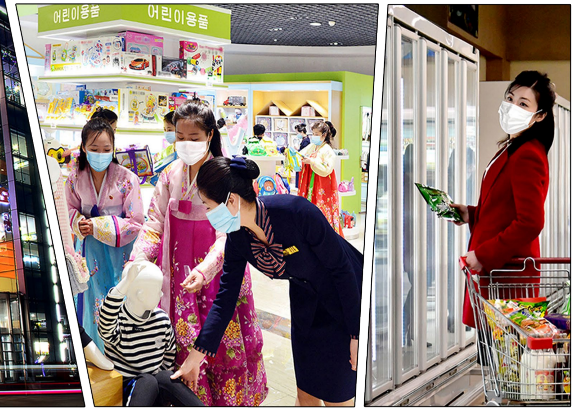
Customers purchase various kinds of goods at the Daesong Department Store.