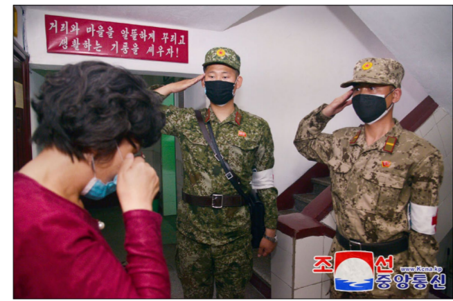
Photos show medics of the Korean People's Army who made selfless, devoted efforts to protect the people's lives and safety during the top-level emergency anti-epidemic campaign in 2022.