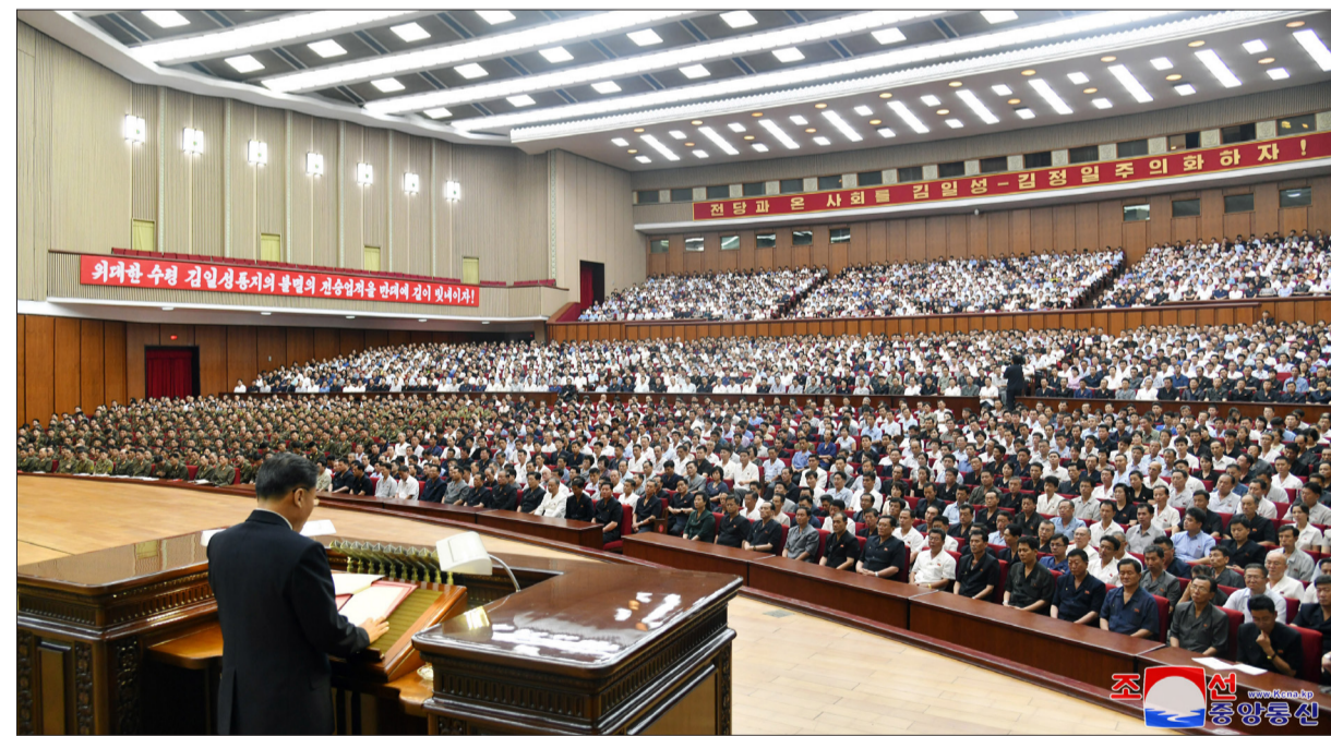
A national symposium takes place at the People's Palace of Culture to mark the 70th anniversary of victory in the Fatherland Liberation War.

The ever-victorious history of the DPRK is being firmly carried forward by the respected Comrade Kim Jong Un, the peerlessly illustrious commander, they said, adding that the great historic cause of building the state nuclear force was successfully realized with the successive victories to be specially recorded in the history of the nation.