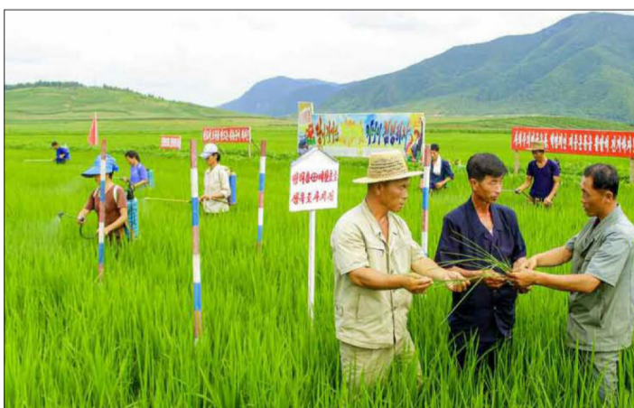
Rice paddies are manured and tended scientifically and technically in Pongsan County.

The Sinuiju Chemical Fibre Factory and other chemical industry bases work to establish new production processes.