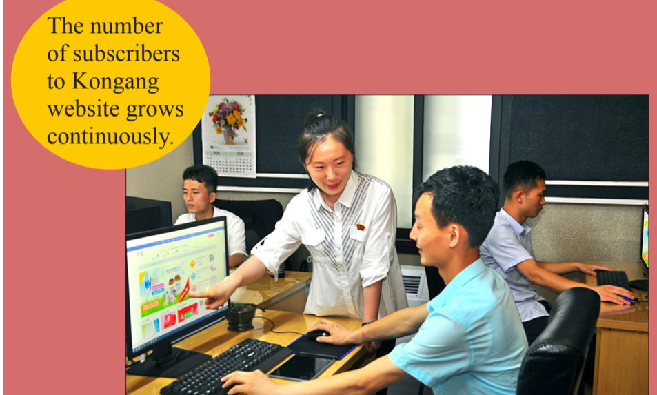
Online medical service is provided at the Kongang Online Pharmacy.