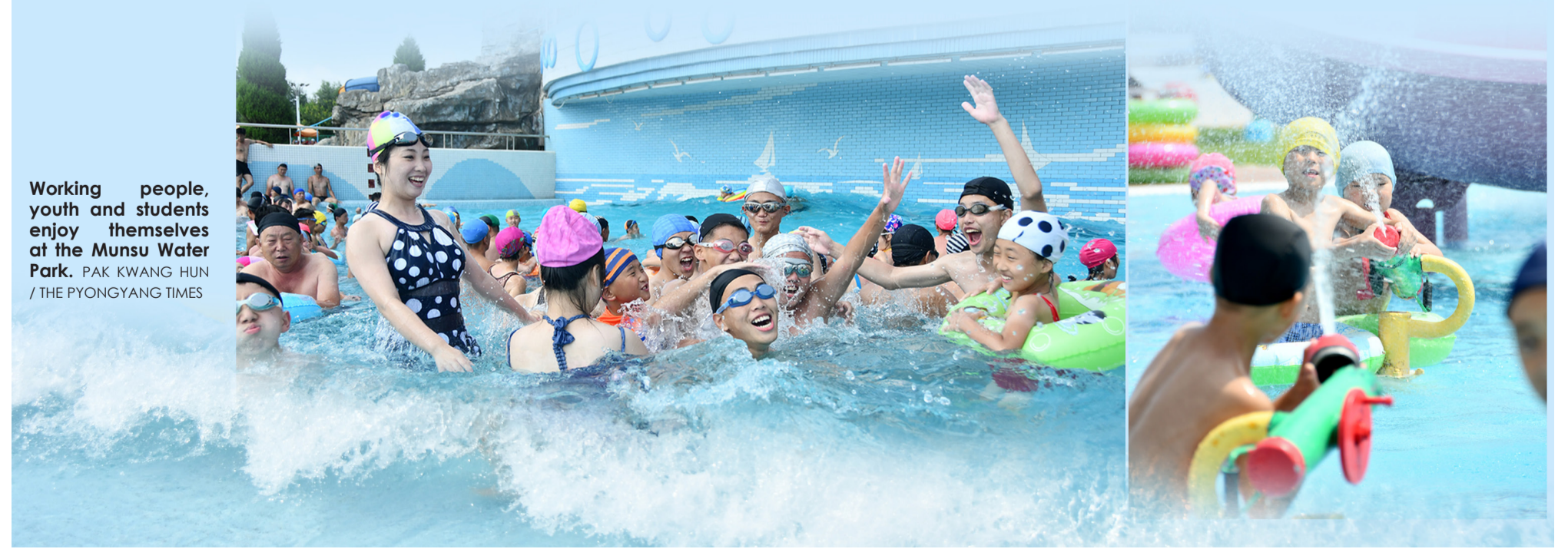
Working people, youth and students enjoy themselves at the Munsu Water Park.