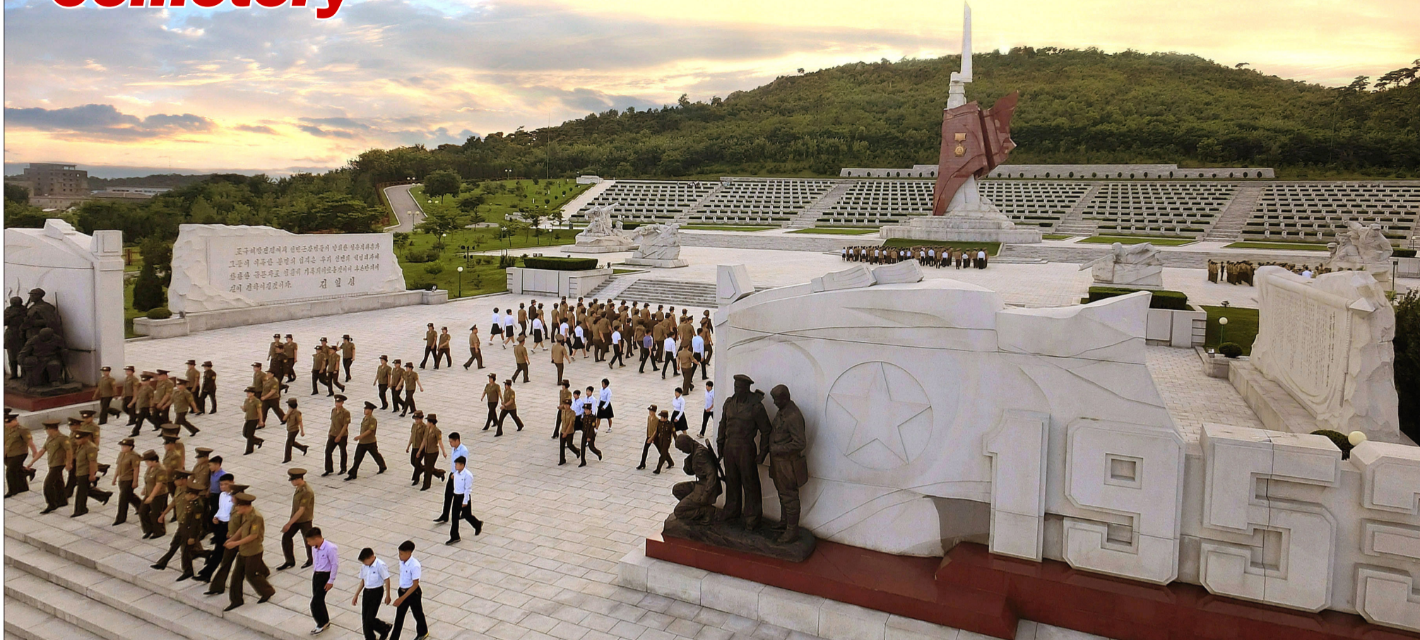
Many people visit the Fatherland Liberation War Martyrs Cemetery on the occasion of war victory day.