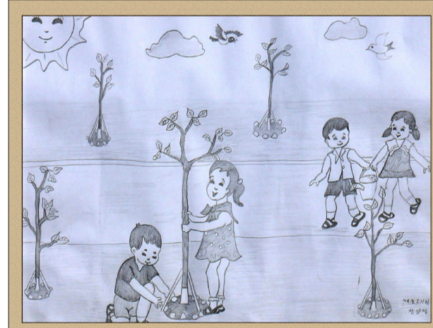
Jang Yong Phyang's pencil drawing "In reflection of our mind"