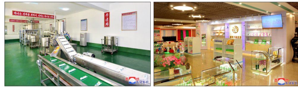
The newly built North Phyongan Provincial Sci-tech Library (top), the North Phyongan Provincial Amnokgang Toothpaste Factory (left) and the Sinuiju Mirae Shop (right).