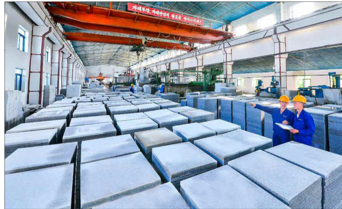
The Osoksan Granite Mine increases production by introducing rational management methods.