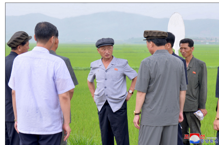
Premier Kim Tok Hun(middle) inspects the Songwan Farm of Unnyul County.