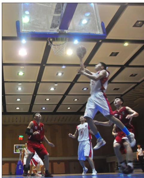
A scene of a match between the April 25 and Pyongyang teams during the 2023 basketball Premier League.