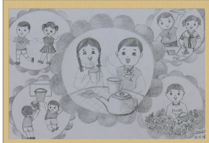
Han Ka Yong's pencil drawing "Kindergarten is nice"