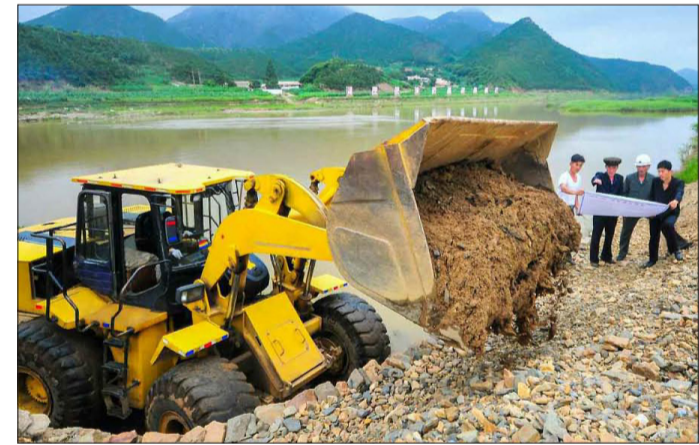
River improvement is under way in Thaethan County. RODONG SINMUN

North Hamgyong Province enhances the role of the emergency disaster response command groups involving senior officials of cities, counties and complexes. Meanwhile, relevant officials are sent to cities, counties and major industrial establishments on coastal areas and in the Tuman River basin to survey all dangerous spots and take immediate measures