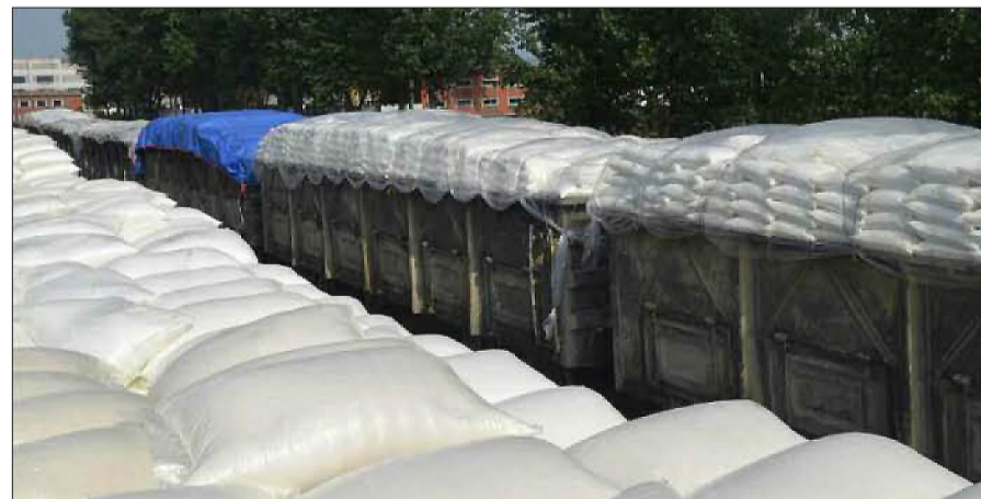
Fertilizer produced by the Namhung Youth Chemical Complex is sent to farms.

The complex also encourages all employees to take the lead in the mass technical innovation drive. A competition of allowing all employees to participate in inventing new ideas shows good results. It set up a system of encouraging all workshops and workteams to use an "idea box", bringing together every innovation plan and judging them every week and month. It also highly appreciates