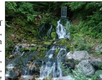
Yangdok Spring Water.

The newly registered Yangdok spring water is drinking water favoured by