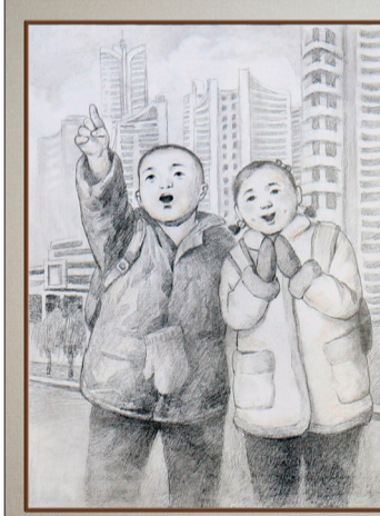
Kim Phyang Hwi's sketch "Wow, splendid!"

children planting young trees with much care took the first place in the kindergarten division of the national fine