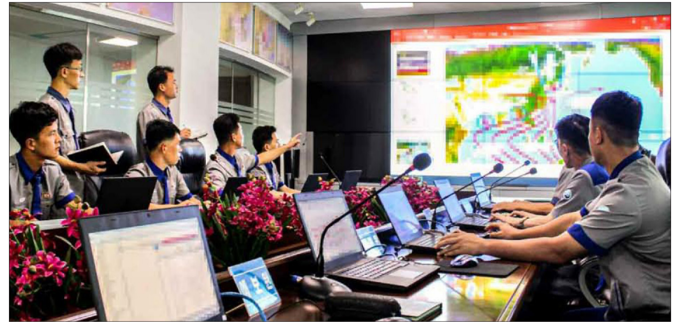
The State Hydro-meteorological Administration timely provides different sectors of the national economy with weather forecasts.

The rail transport sector has tightened the supervision of railways, railway bridges, tunnels and other structures and remedied sections of rockslide risk to ensure the