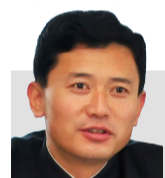
Choe Hung Gwon Deputy department director of the Ministry of Land and Environment Protection

At present, the protection of ecological environment is an issue of extreme urgency.