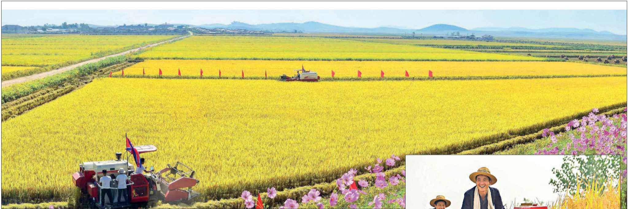
Gratifying harvesting season starts at the farms.