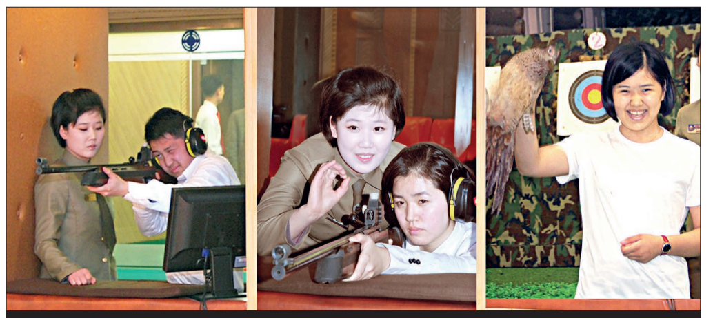
Delight of marksmanship at the indoor rifle shooting range.

"When I was aiming at live pheasants at the outdoor shooting range at the foot of a mountain, I felt as if I was a hunter. It is really regrettable that I cannot fully express the pleasure of live firing," he said, adding that whenever he enjoys himself at such a fine shooting gallery, he feels deep gratitude to the policies of the country that shows great concern and care for the cultural life of the working people.