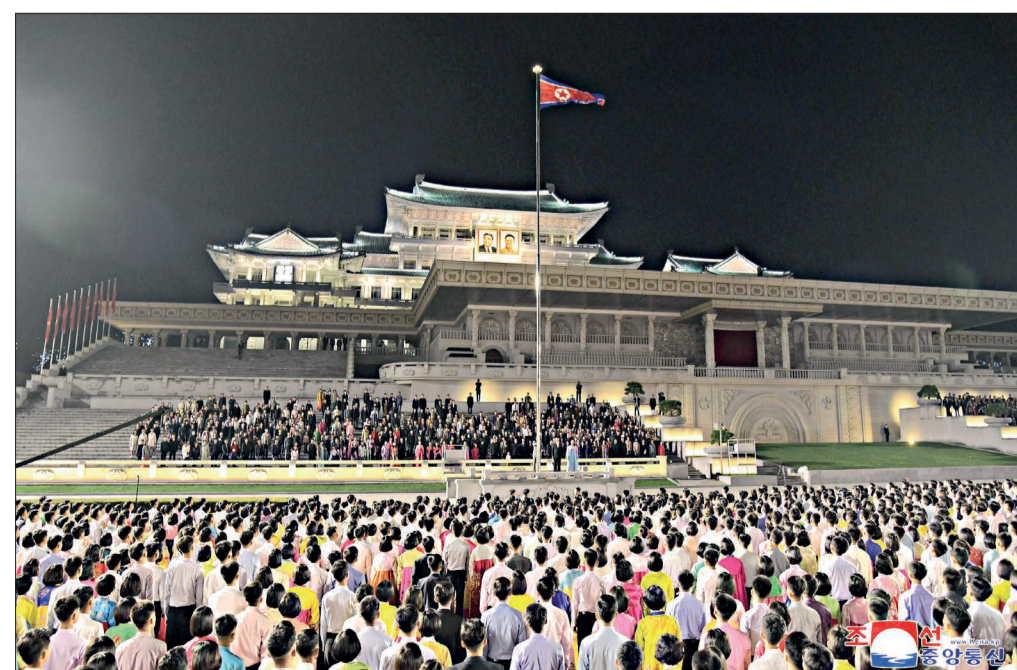
A national flag-hoisting ceremony is held at Kim Il Sung Square at 0:00 on October 10.