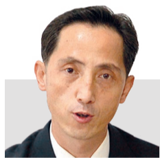
Yun Chang Il chairman of the Central Committee of the Korean Federation for the Protection of the Disabled

The recent Ninth Session of the 14th Supreme People's Assembly of the Democratic People's Republic of Korea adopted the law on ensuring the rights of the disabled stipulating the entitlement of all the rights to the disabled including socio-political, economic and cultural rights.