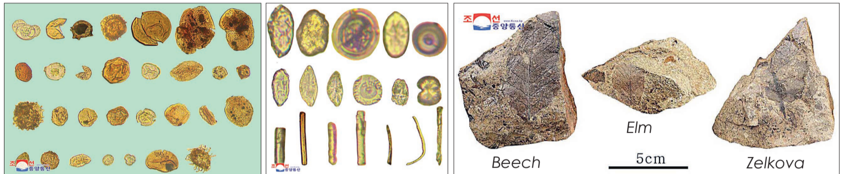
Newly-discovered fossil remains of a whale date back to the Miocene epoch.

diatoms that the then Hosan-ri area had consisted of vast sea and land, with natural weather conditions favourable for the existence of animals