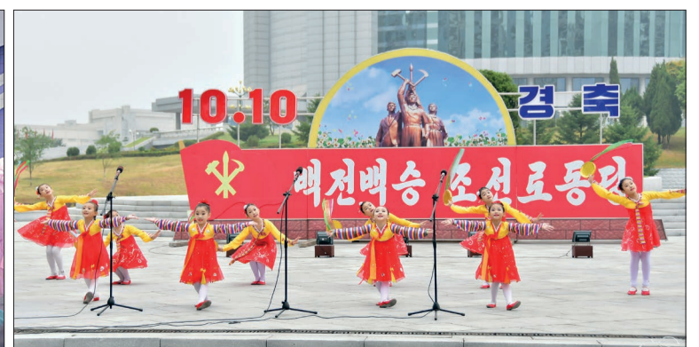
All the people of the country celebrate the 78th birthday of the Workers' Party of Korea with splendour.