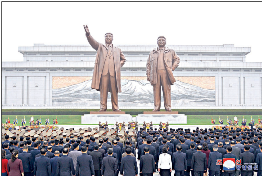
Members of the Party central leadership body place flower baskets before the statues of President Kim Il Sung and Chairman Kim Jong Il on Mansu Hill in Pyongyang.

They climbed the hill of eternal Sun while remembering the immortal Party-building and leadership exploits