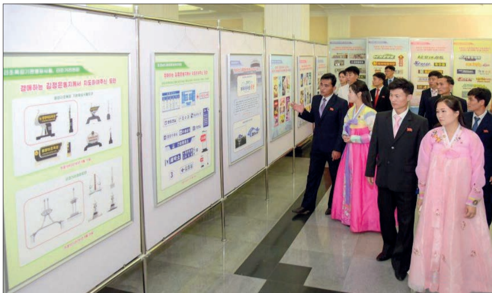
Visitors look round the national industrial design exhibition.

The exhibition will continue until mid-October.