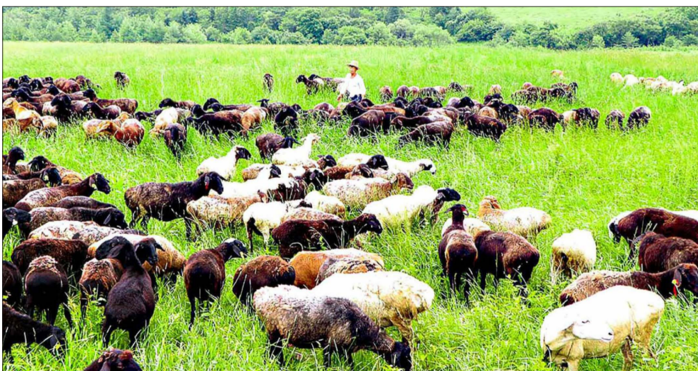
A flock of sheep graze in Changsong County, North Phyongan Province.

In keeping with the increase in the number of sheep, the county is stepping up preparations for improving the people's living standards.