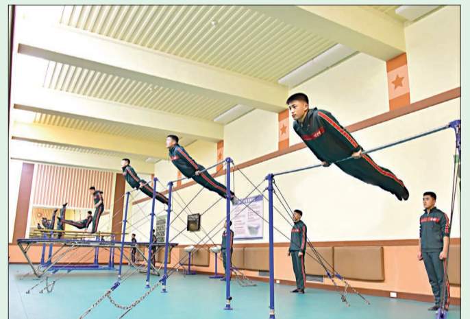
Students of Mangyongdae Revolutionary School study to their heart's content at the place fully equipped with excellent educational conditions.