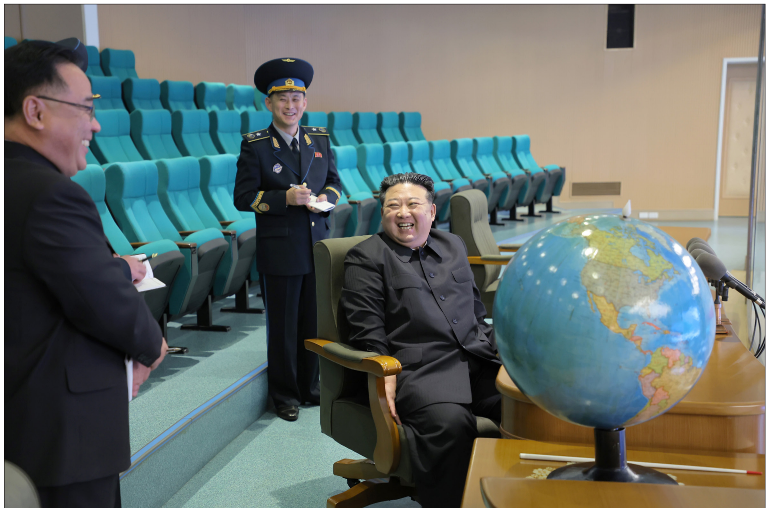
Kim Jong Un visits the NATA Pyongyang General Control Centre to review the operational preparation of the reconnaissance satellite on November 24.