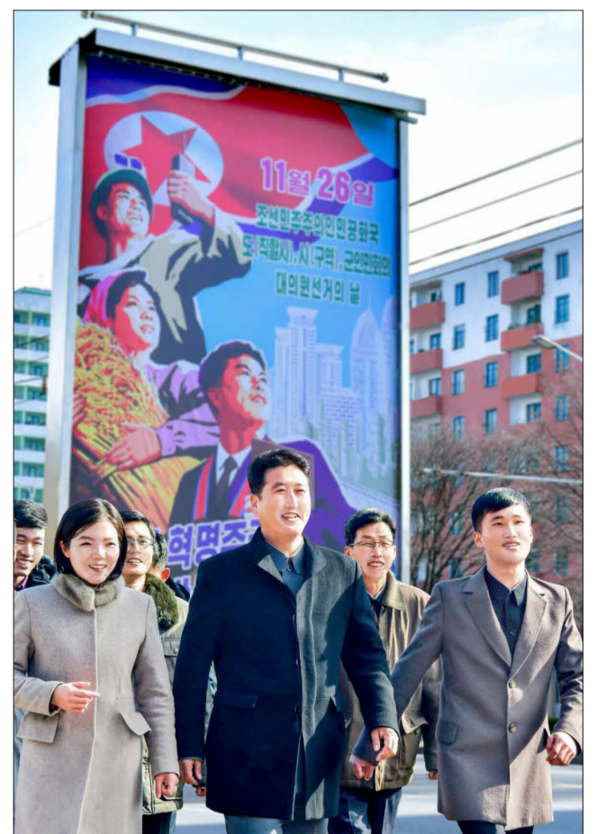
Posters and slogans for the elections of deputies to the local people's assemblies are put up in different places of Pyongyang, adding to the festive mood.