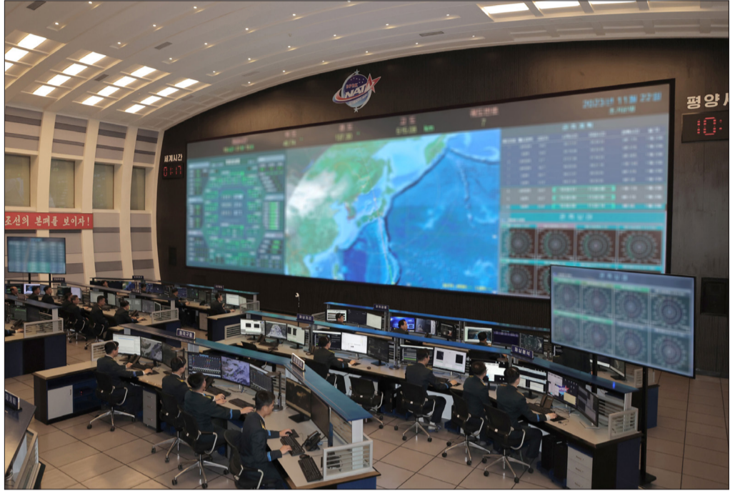
Kim Jong Un, general secretary of the Workers' Party of Korea and president of the State Affairs of the Democratic People's Republic of Korea, visits the Pyongyang General Control Centre of the National Aerospace Technology Administration (NATA) on November 22.