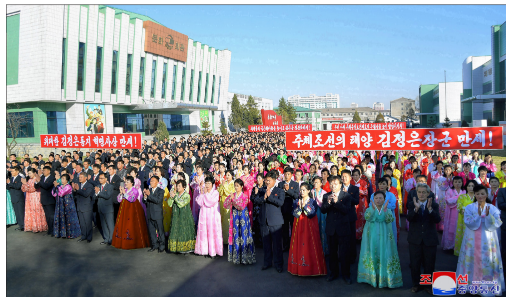
An inaugural ceremony of the Pyongyang Pharmaceutical Factory is held on November 21.

After the ceremony, the participants looked round the factory.