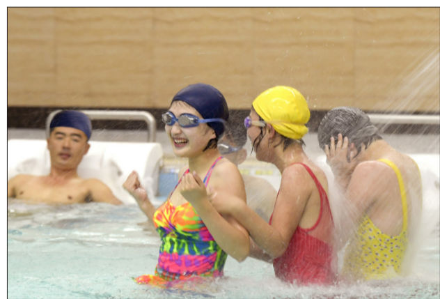
People have a good time at the video game room and underwater ultrasonic pool.

Visitors to the centre are different in age and occupation, but all of them say unanimously that they feel completely free from fatigue after relaxing through sports and enjoying good services and thus return home in a refreshed mood.