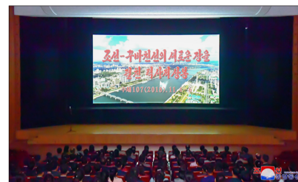
A film show takes place at the Taedongmun Cinema in Pyongyang on November 2 to mark the fifth anniversary of the historic meeting between the DPRK and Cuban leaders.