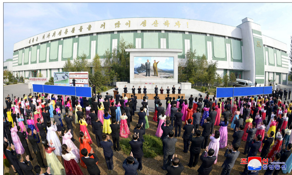
The Pyongyang Dental Hygiene Supplies Factory holds an inaugural ceremony on October 24.