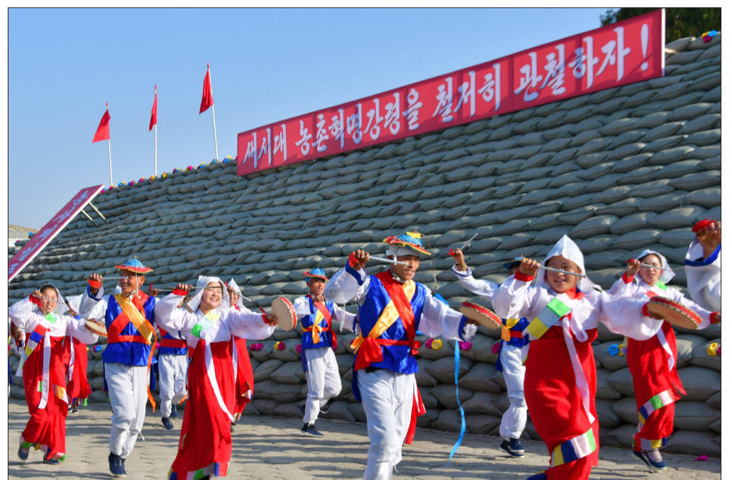
Farmers have a year-end payment gathering in great delight at the Yoltusamchon Farm of Sukchon County, South Phyongan Province, on October 29.

Certificates of commendation were given to more than 70 labour innovators and prizes were awarded to workteams and