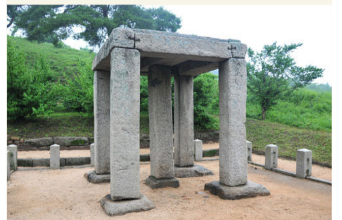
Koryo Chomsongdae Observatory.

On the basis of its own astronomical observation data, Koryo already compiled five kinds of calendars in the 11th century.