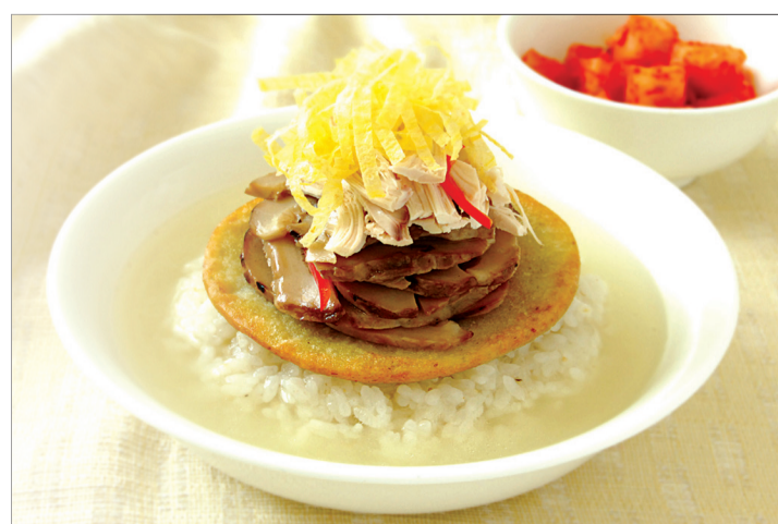
Pyongyang onban, a Korean national food.

The restaurant, which was highly rated and awarded diplomas several times at national and Pyongyang municipal cooking contests, also serves starch noodles garnished with sliced raw fish and other distinctive national foods.