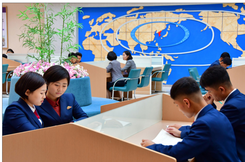
Students of Kim Il Sung University study in the newly renovated Science Library.