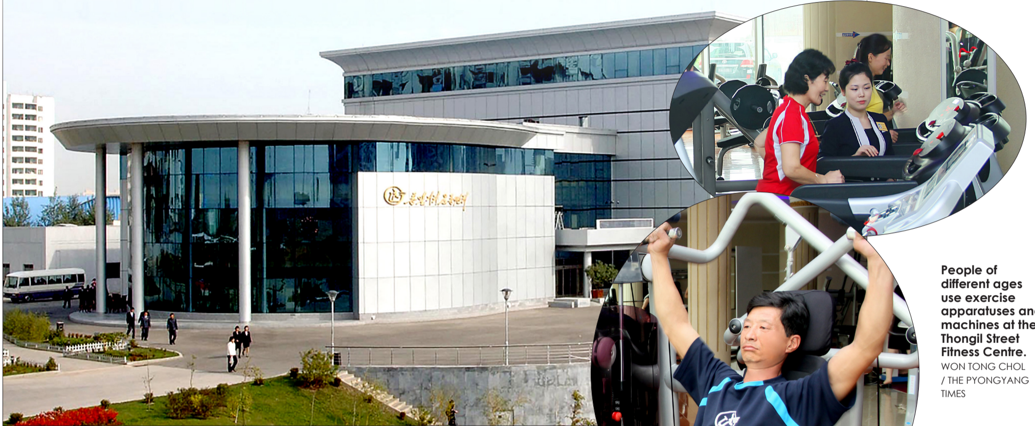
People of different ages use exercise apparatuses and machines at the Thongil Street Fitness Centre.