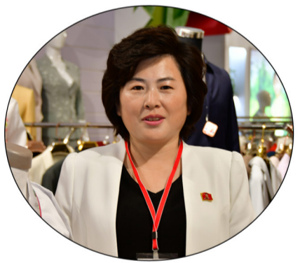
Ri Myong Gum