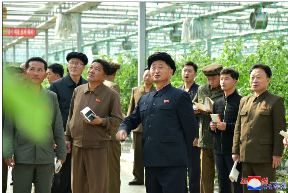
Premier Kim Tok Hun (fifth from right) inspects the Ryonpho Greenhouse Farm.

devoting themselves to implementing the Party's decisions at the Ryongsong Machine Complex and the Ranam Coal-mining Machine Factory, he stressed the need for them to make substantial successes in the manufacture of custom-built equipment of great significance in the development of the self-supporting economy and to produce more highly efficient machines by increasing the processing capacity.