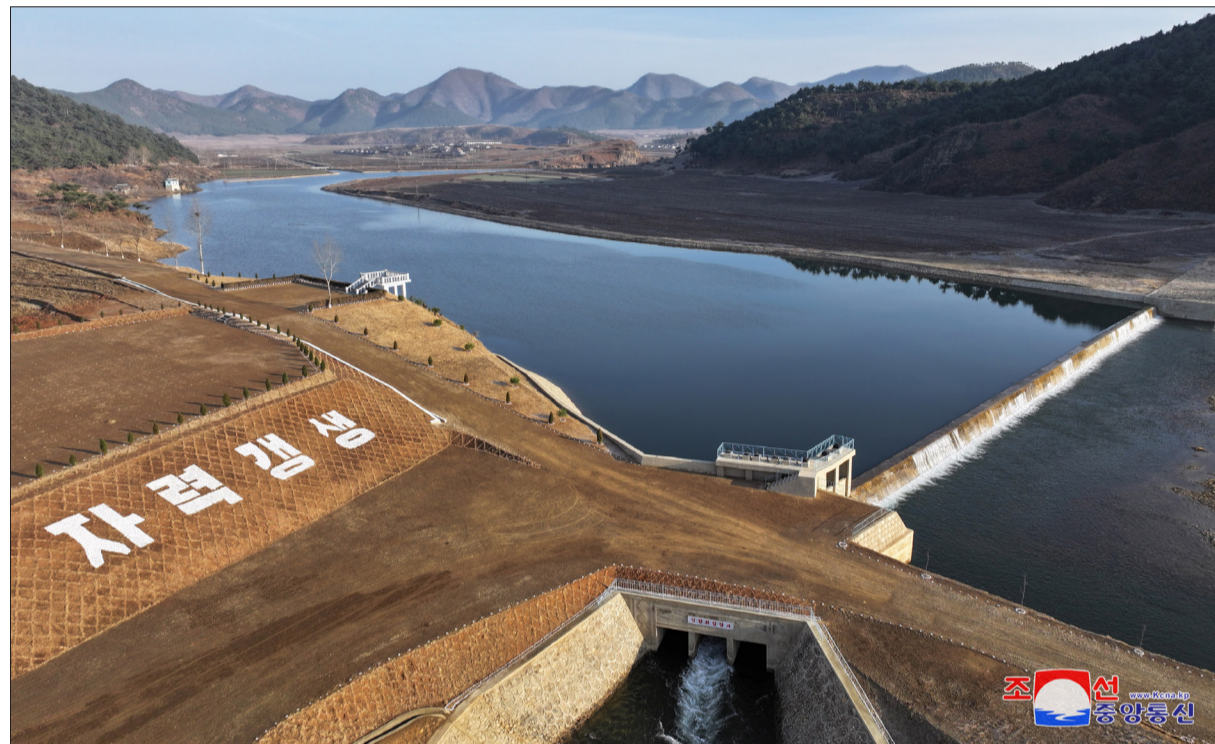
The completed Hwangju Kindung waterway, another large irrigation system in the DPRK, irrigates the vast farm fields in Hwangju and Yonhan counties of North Hwanghae Province.

After the ceremony the participants went round different parts of the waterway.