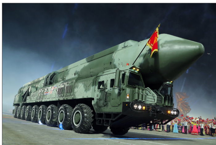
Scenes of the military parades to celebrate the 70th anniversary of the Korean people's victory in the Fatherland Liberation War and the 75th anniversary of the founding of the DPRK.