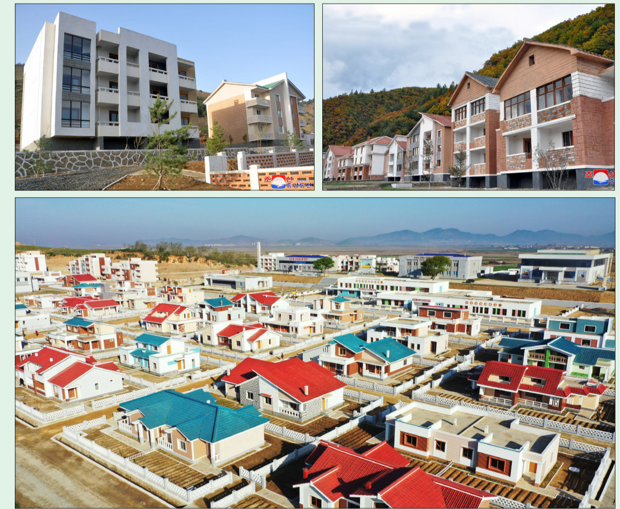
Farmhouses are built to meet the regional characteristics.

concern, the plans of modern and diversified rural houses preserving regional characteristics for coastal, lowland and mountainous areas were completed and introduced, and thus such houses are under construction all across the country.