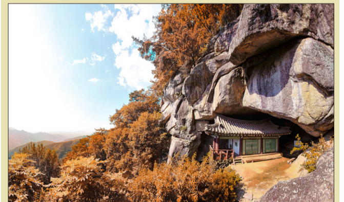
The Tangun Shrine.