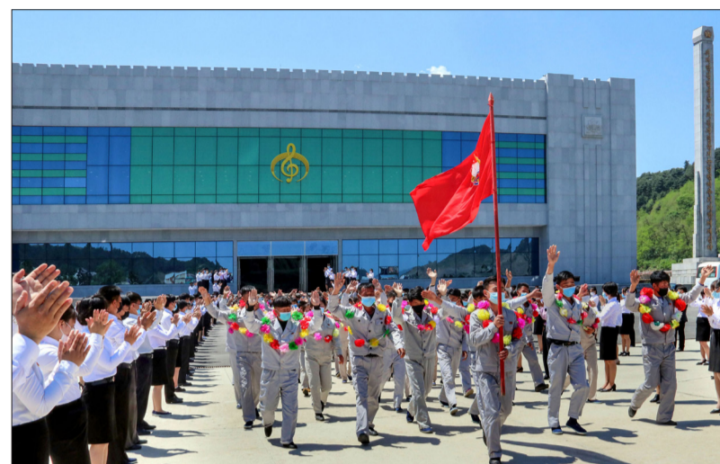
Young people volunteer to work on major fronts of socialist construction.

True to the intention of the Workers' Party of Korea which set the goal of grain production as the first one of the 12 major goals of national economic development, the leading fertilizer producers of the country boosted the