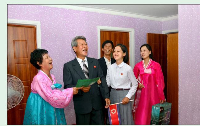
A family moves into their new house in the Taephyong area, Mangyongdae District.