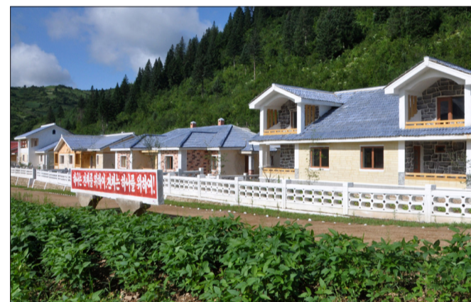
Rural communities are given a facelift.