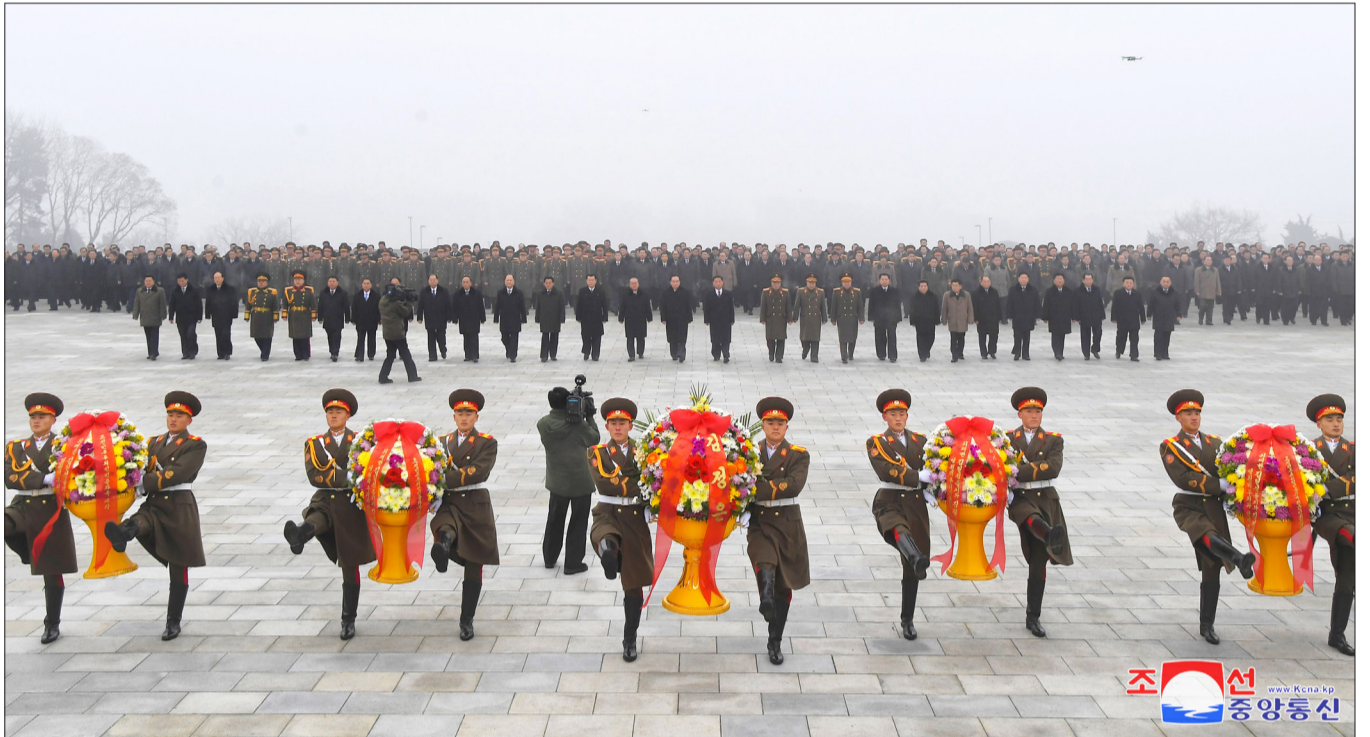
The participants in the Ninth Plenary Meeting of the Eighth Central Committee of the Workers' Party of Korea and those in the celebrations of the New Year lay flower baskets before the statues of President Kim Il Sung and Chairman Kim Jong Il on Mansu Hill in Pyongyang on New Year's Day in 2024.

Officials, working people, service personnel, youth and students across the country visited the statues of the great leaders and their smiling portraits in their residential areas and paid tribute to them.