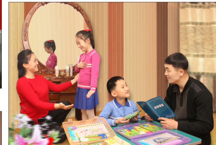
New school uniforms and school things are provided to all the students across the country.