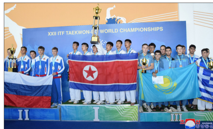
DPRK Taekwon-Doists celebrate after winning the 22nd ITF Taekwon-Do World Championships.