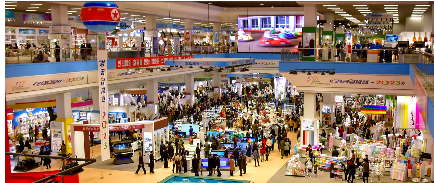
Light industrial goods exhibition "Development of Light Industry-2023".