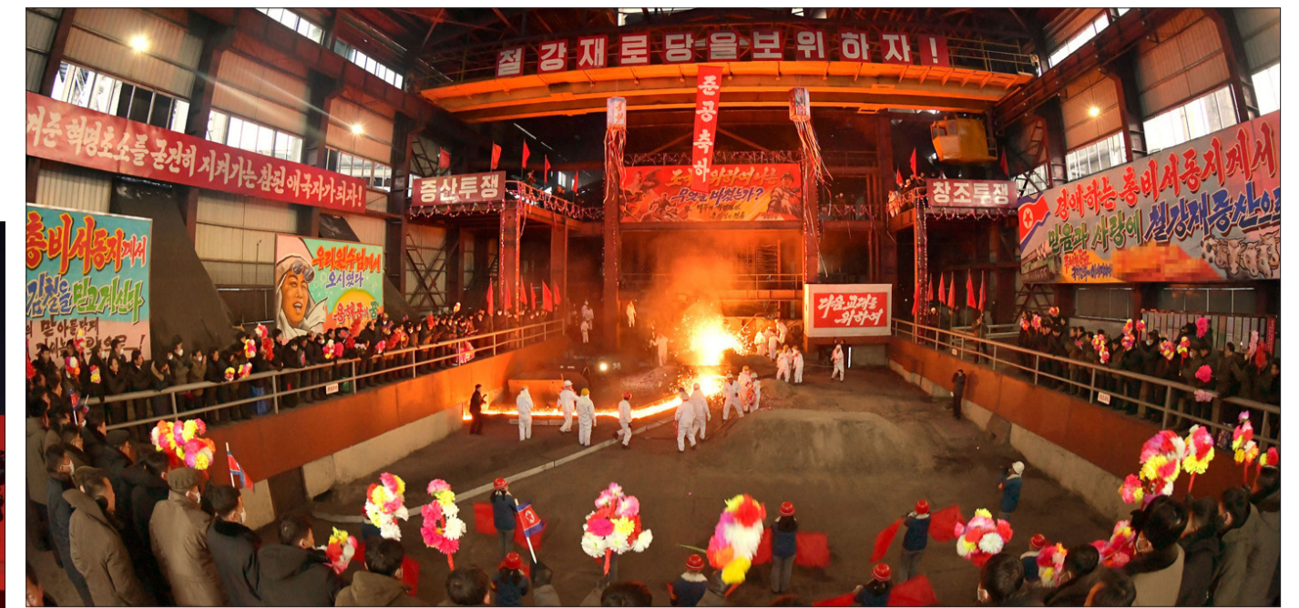
An energy-saving oxygen blast furnace starts operation at the Kim Chaek Iron and Steel Complex.