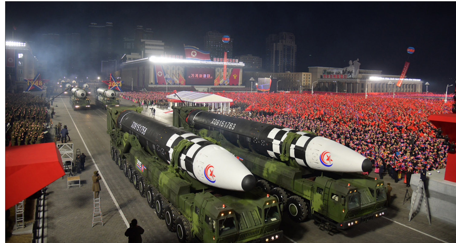
A military parade is held to mark the 75th anniversary of the founding of the Korean People's Army.