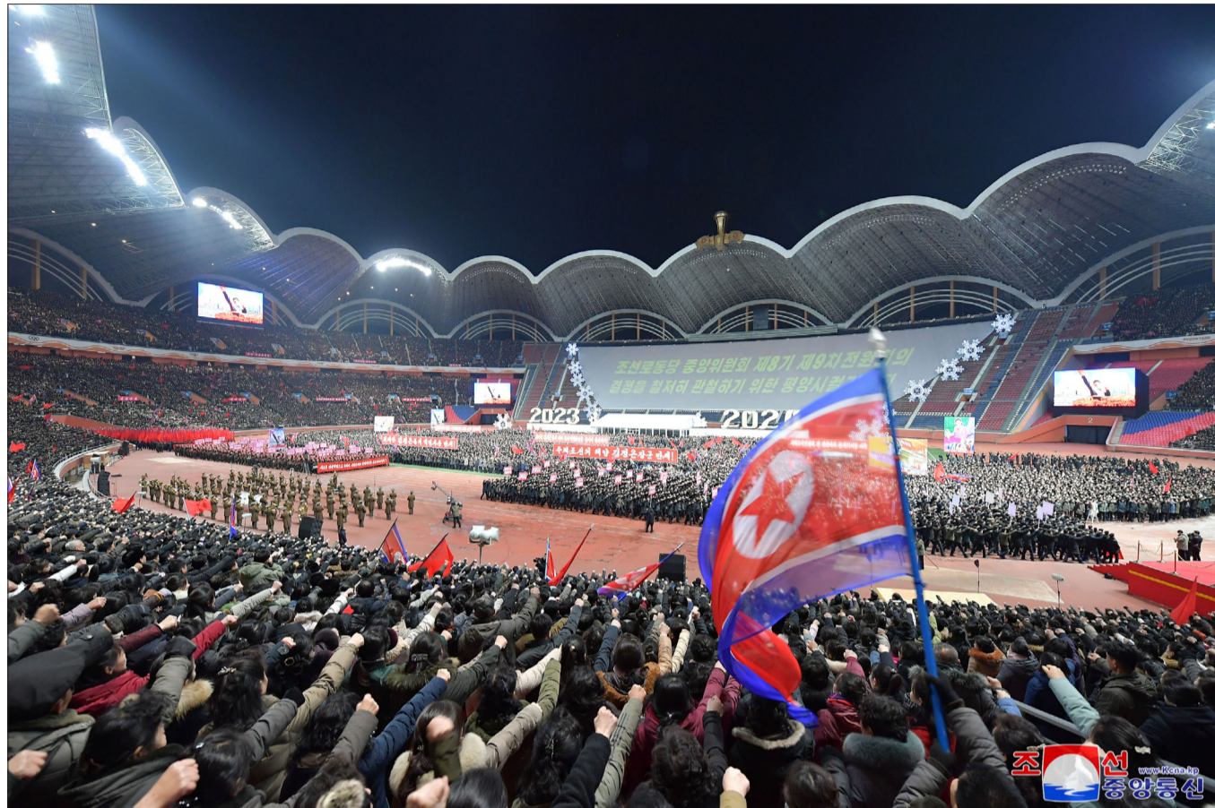
A meeting of Pyongyang citizens takes place at May Day Stadium in Pyongyang on January 5 to pledge themselves to thoroughly implement the decisions of the Ninth Plenary Meeting of the Eighth Central Committee of the Workers' Party of Korea.

Referring to the fact that the Korean people demonstrated the national strength and prestige of the powerful and dignified Juche Korea and made tangible progress and a leap forward under the leadership of the great Party Central Committee last year, he said all the successes they made provide clear evidence to the validity and vitality of the fighting programme of the Eighth Congress of the WPK which called for achieving a great new victory by remarkably strengthening