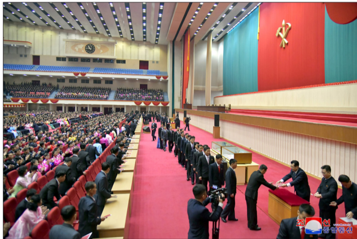
Labour innovators receive the gift list at the Pyongyang Indoor Stadium on New Year's Day.