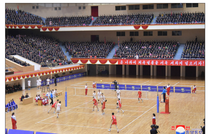
A scene of the volleyball match played at the Pyongyang Indoor Stadium on December 31 2023.