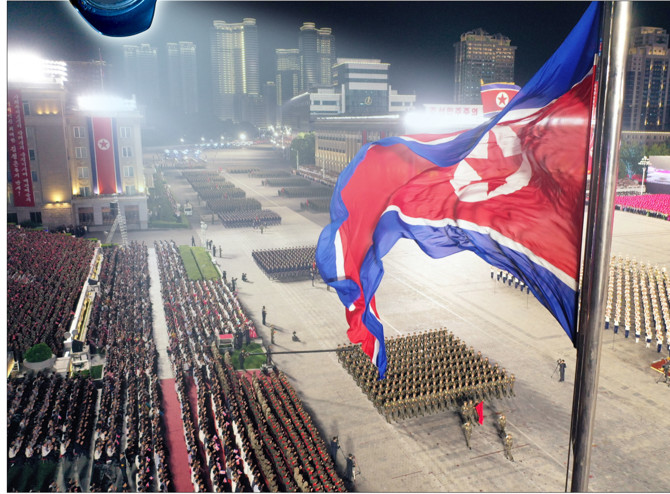
A paramilitary parade is staged at Kim Il Sung Square on the occasion of the 75th birthday of the Democratic People's Republic of Korea.