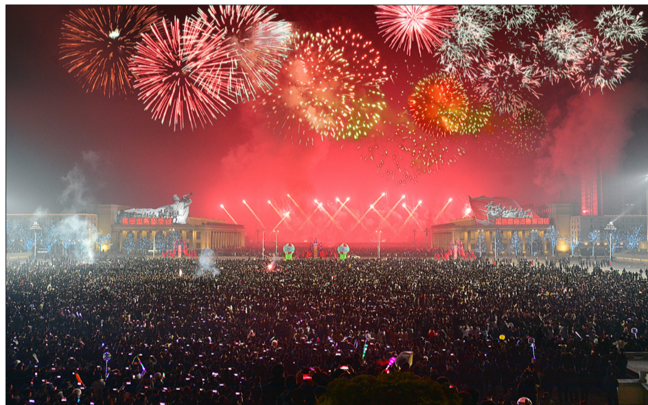
Fireworks light up nocturnal sky over the capital city of Pyongyang to rev up the festive mood on the occasion of New Year.