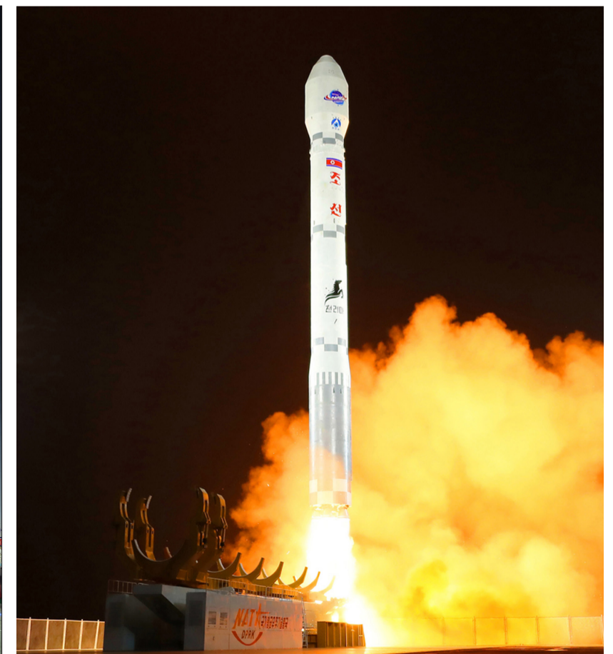
Reconnaissance satellite Malligyong-1 is successfully launched.