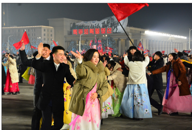
Young Koreans hold an evening gala at Kim Il Sung Square in Pyongyang on December 31 2023 to celebrate the New Year 2024.

The participants were full of honour and pride of being the youth of a powerful country, who are all out to bring earlier the bright future of Korean-style socialism, firmly rallied around the Party Central Committee with loyalty and patriotism.