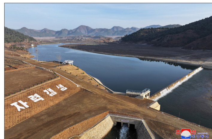
Foundations for agricultural development are laid and a bumper harvest is brought in through irrigation and agricultural mechanization.