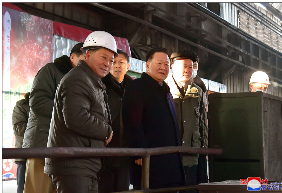
Choe Ryong Hae (fourth from right) inspects the Hwanghae Iron and Steel Complex.

production, carry out phased plans without fail and ensure a timely supply of raw and other materials and fuel in order to attain the iron and steel production goal set by the Party without fail.