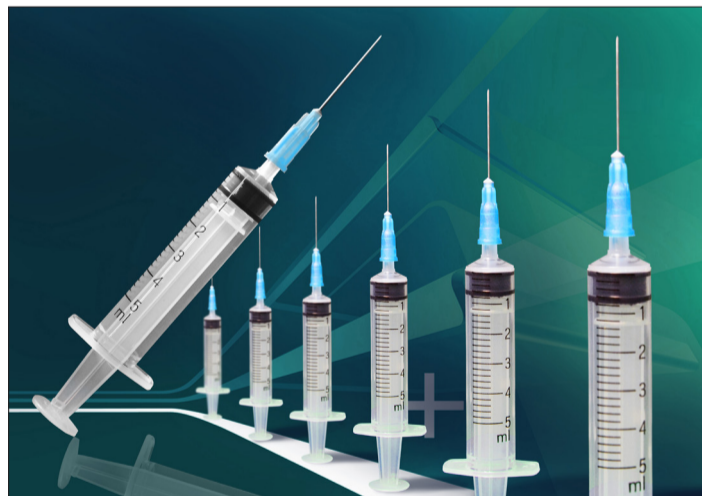
The disposable hypodermic aseptic syringe (5ml) is mass-produced at the Taedonggang Syringe Factory.