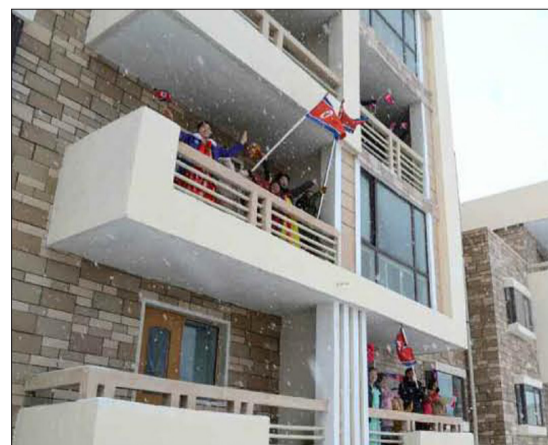
A cheerful dance party is held as miners move into new houses in the Komdok area.