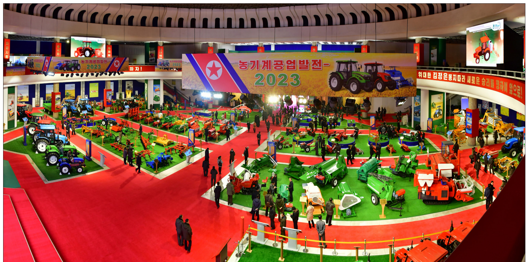
Visitors look round the farm machine exhibition “Development of farm machine industry-2023” at the Agriculture Hall of the Three-Revolution Exhibition House.

The combined thresher of dry field crops has been designed to thresh wheat, barley, maize and soybean by arranging two feeding sections and threshing ribs in a threshing drum in order to increase its utilization rate all the year round. As it has the high fine selection rate and quality, the crops can sell immediately after threshing.