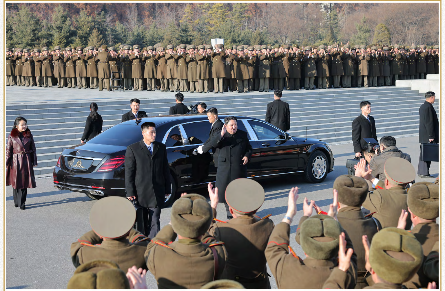
Kim Jong Un, general secretary of the Workers' Party of Korea and president of the State Affairs of the Democratic People's Republic of Korea, pays a congratulatory visit to the DPRK Ministry of National Defence on the occasion of the 76th founding anniversary of the Korean People's Army.

Kim Jong Un, general secretary of the Workers' Party of Korea and president of the State Affairs of the Democratic People's Republic of Korea, paid a congratulatory visit to the DPRK Ministry of National Defence on the afternoon of February 8, on the occasion of the 76th founding anniversary of the KPA.