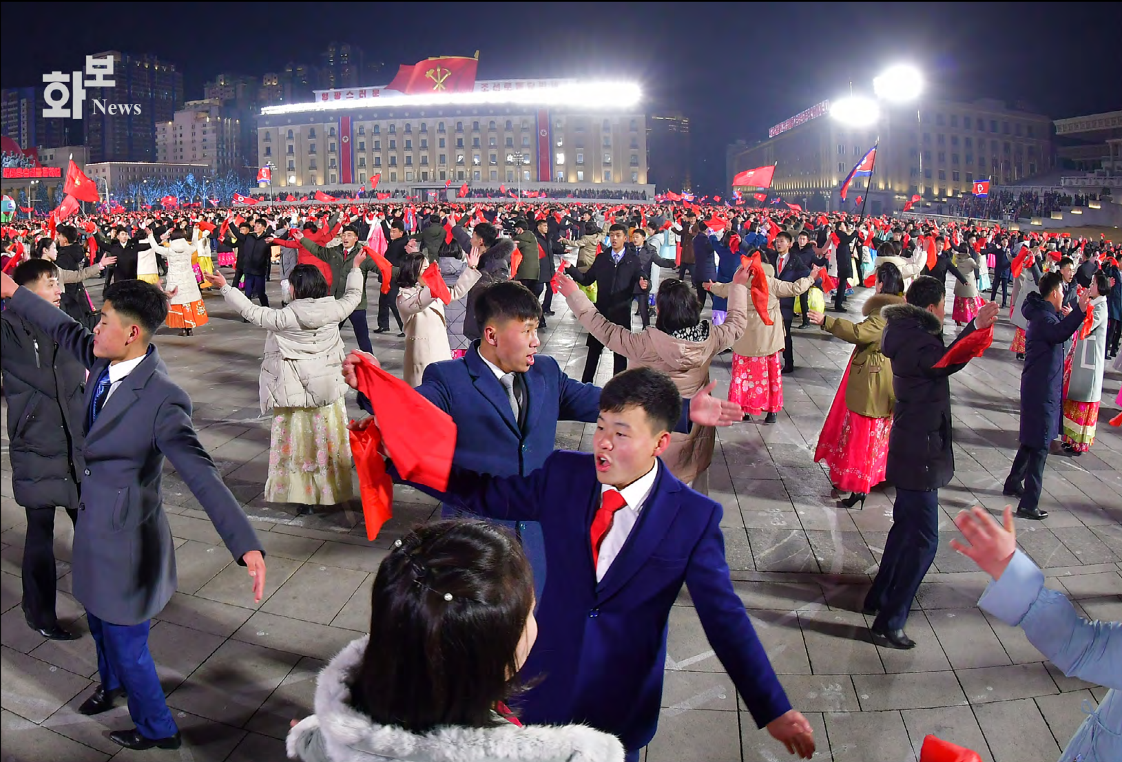
An evening gala of youth and students takes place.