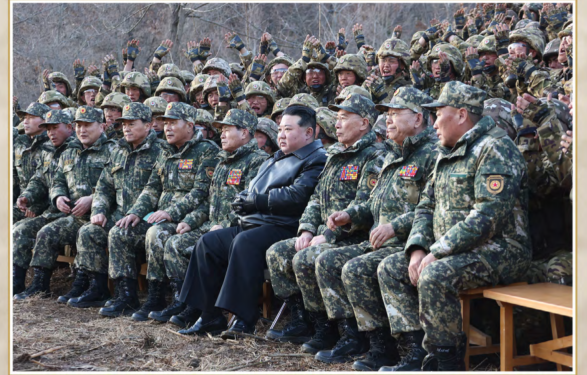
Kim Jong Un has a photo session with the dependable combatants who powerfully demonstrated a match-for-a-hundred fighting efficiency in the drill with their strong will and courage.