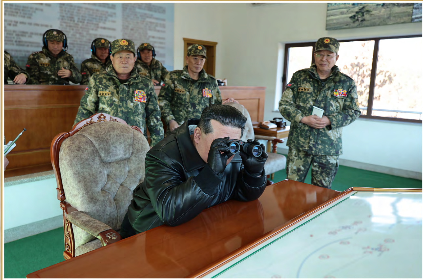
The respected Comrade Kim Jong Un mounts the observation post and receives a report on the program for actual manoeuvres of the units planned that day before guiding the drill.

military policy-oriented tasks set forth before the army by the Party Central Committee. And he stressed the need to make positive use of them so as to practically contribute to strengthening the combat capability of the People's Army, further consolidate the material and