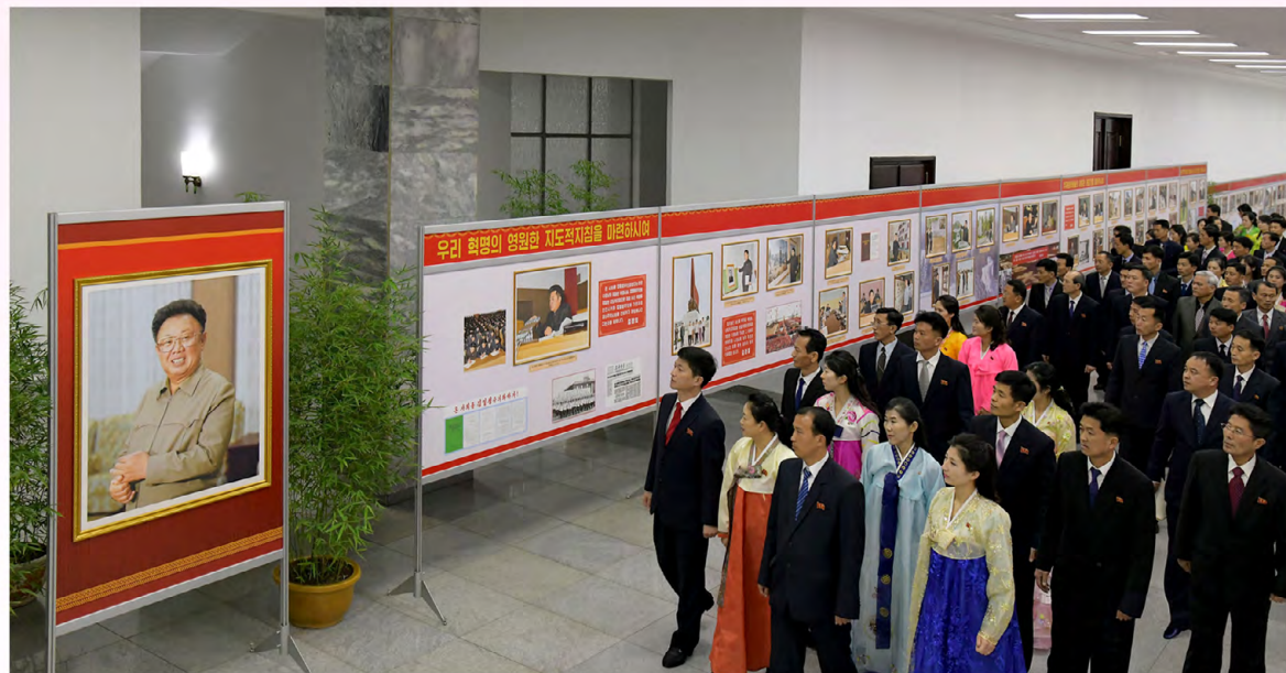
A national photo exhibition "Great leadership, immortal exploits" and a stamp show "Great life" are held.