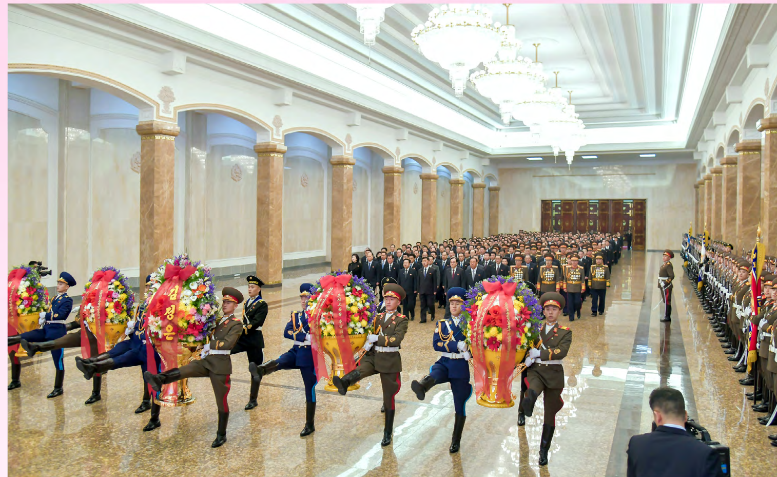
Senior Party and government officials visit the Kumsusan Palace of the Sun to pay homage to the great leaders.