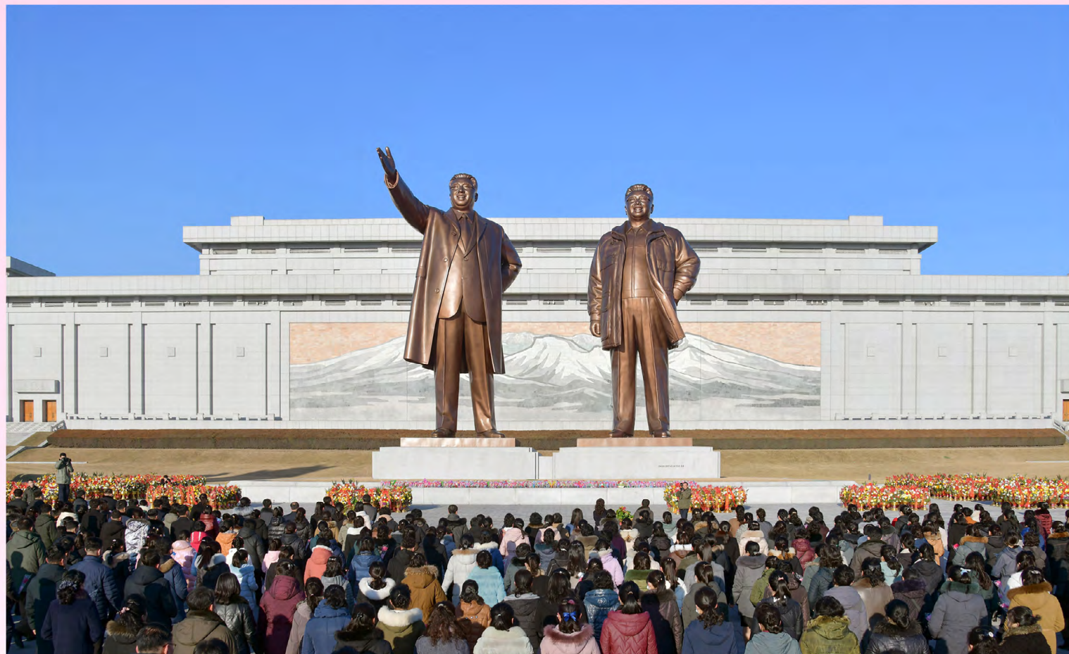
People from all walks of life place floral baskets and flower bouquets before the statues of President Kim Il Sung and Chairman Kim Jong Il on Mansu Hill on the occasion of the auspicious February holiday.