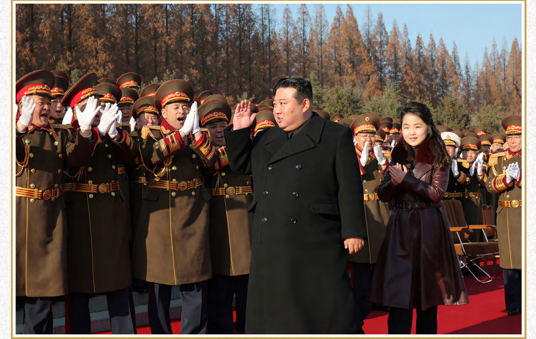
Kim Jong Un has a photo taken with the KPA generals to be recorded in the army-building history.