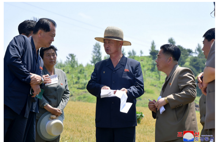
Premier Kim Tok Hun (fourth from left) inspects the Kachang Farm in Sohung County.