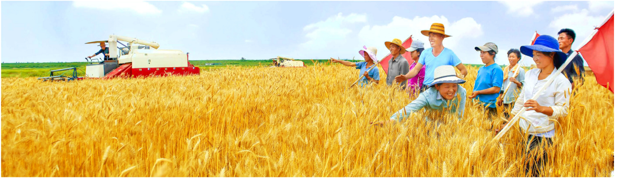
Farmers are happy to have a good crop of wheat and barley in Unpha County, North Hwanghae Province.