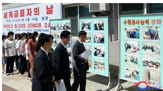
An event takes place at the National Blood Centre under the Ministry of Public Health on June 17.

The participants watched a video on blood transfusion service, looked round photos introducing blood donation and saw an art performance