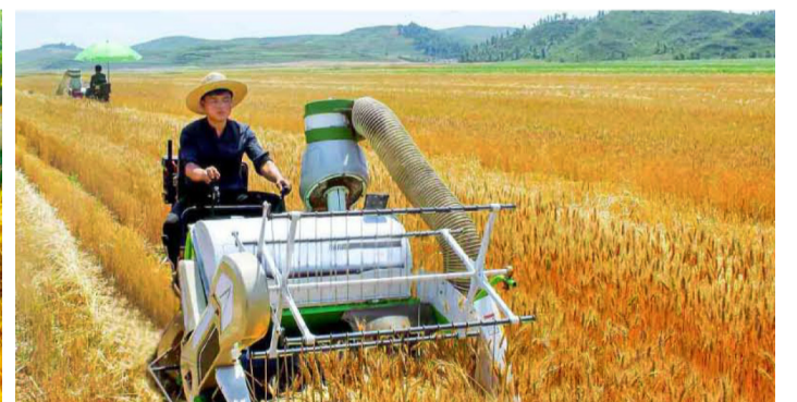
Farms in South Hwanghae Province accelerate wheat and barley harvest with pleasure of having produced a rich crop.