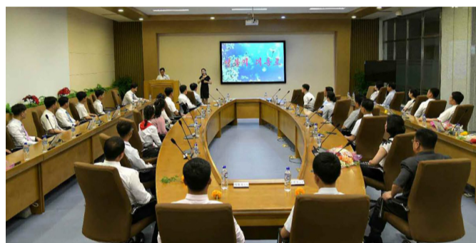
A meeting takes place at the Sci-Tech Complex on June 18 to mark Day of Persons with Disabilities.