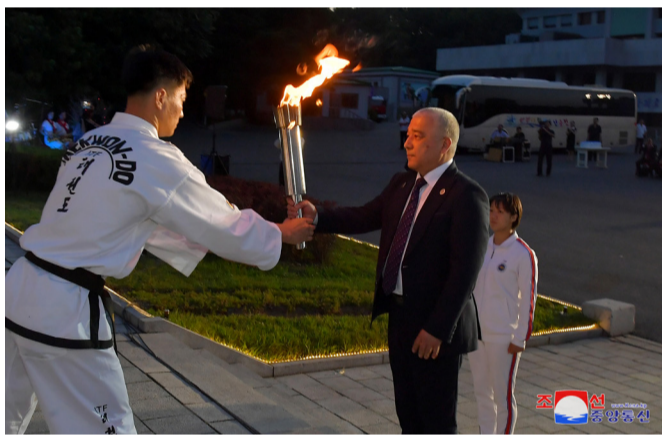
A ceremony of lighting the flame for the Ninth International Martial Arts Games is held at the martial arts torch tower in Pyongyang on June 17.