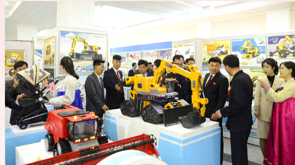
National industrial design exhibition