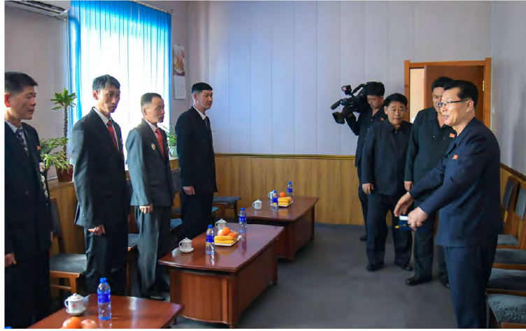
Senior officials of the Party and the government visit factories, enterprises and other places to congratulate the working people on their holiday.

The final match of the men's football between the teams of the chemical industry sector and the land and maritime transport sector and other colourful sports and amusement games were held, revving up the festive mood.