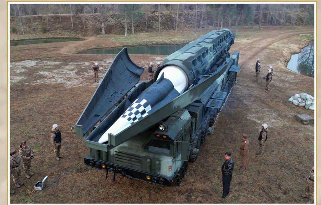
Kim Jong Un, general secretary of the Workers' Party of Korea and president of the State Affairs of the Democratic People's Republic of Korea, guides the first test fire of Hwasongpho-16-Na, a new-type intermediate-range solid-fueled ballistic missile loaded with newly-developed hypersonic gliding warhead, on April 2.

Kim Jong Un, general secretary of the Workers' Party of Korea and president of the State Affairs of the Democratic People's Republic of Korea, guided the first test fire of Hwasongpho-16-Na, a new-type intermediate-range solid-fueled ballistic missile loaded with newly-developed hypersonic gliding warhead, on April 2.