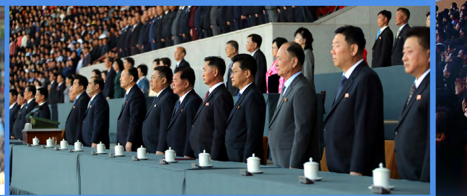
A national meeting takes place at Kim Il Sung Stadium to mark the 134th May Day.

All the people across the DPRK celebrated significantly May Day, the international holiday of the working people all across the world.