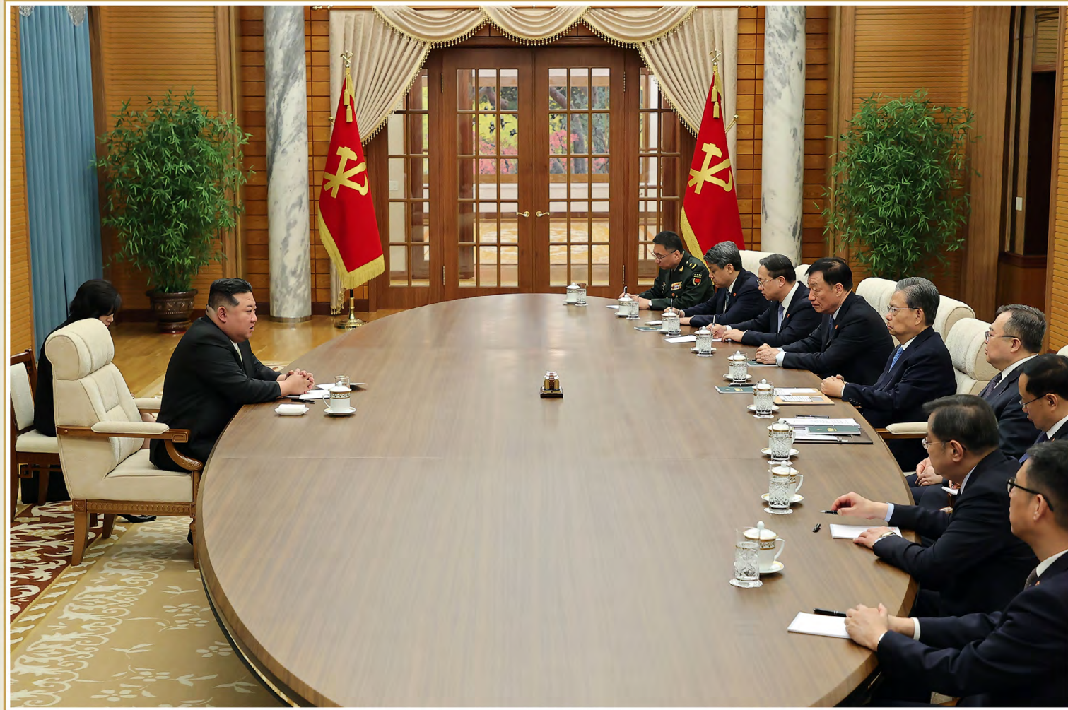
Kim Jong Un candidly discusses with Zhao Leji the issue of boosting the multi-faceted exchanges and cooperation for developing the friendly and cooperative relations, valuable asset of the two parties and two countries, into more viable ties, occasioned by the Year of DPRK-China Friendship, and other important issues of mutual concern.