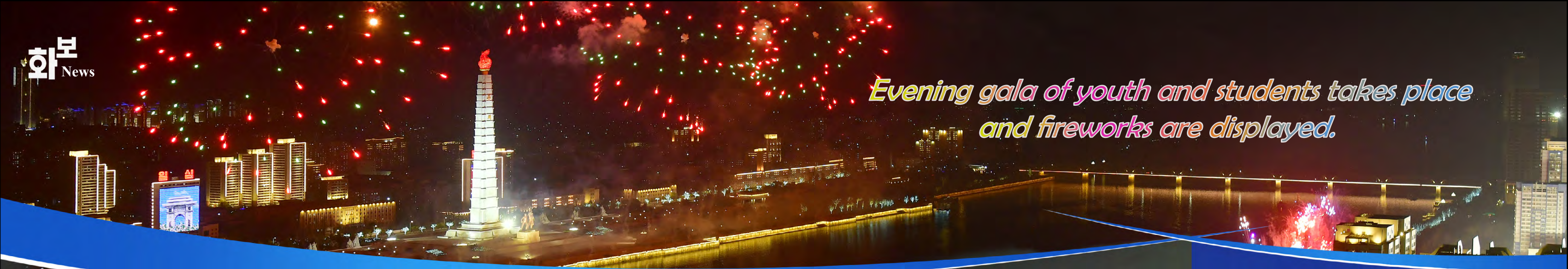
Evening gala of youth and students takes place and fireworks are displayed.