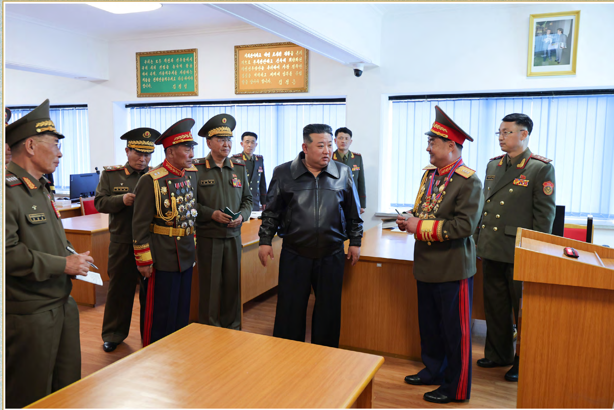
Kim Jong Un says that the mightiness and invincibility of the KPA, for which the country has firmly held the position of a world-class military power, would be unthinkable apart from this academy, the elite academy reputed for training highest-ranking military and political cadres, which has adorned its 50-odd-year history with glory and feats, adding that it is a source of pride of our Party and state to have such a “pedigree farm” for training military and political activists.