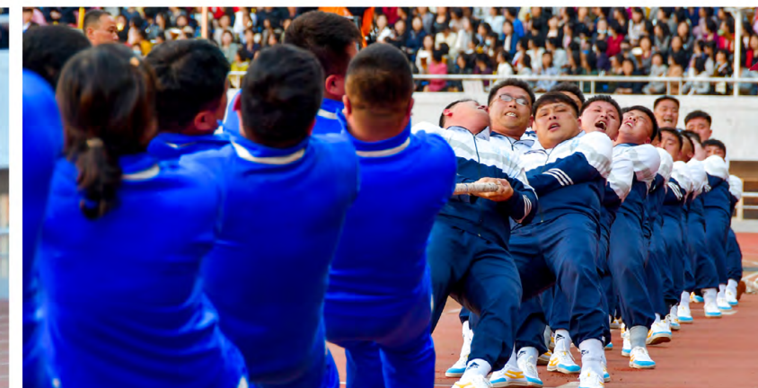
The final matches of the Sports Contest of Workers in Major Industrial Sectors-2024 take place.