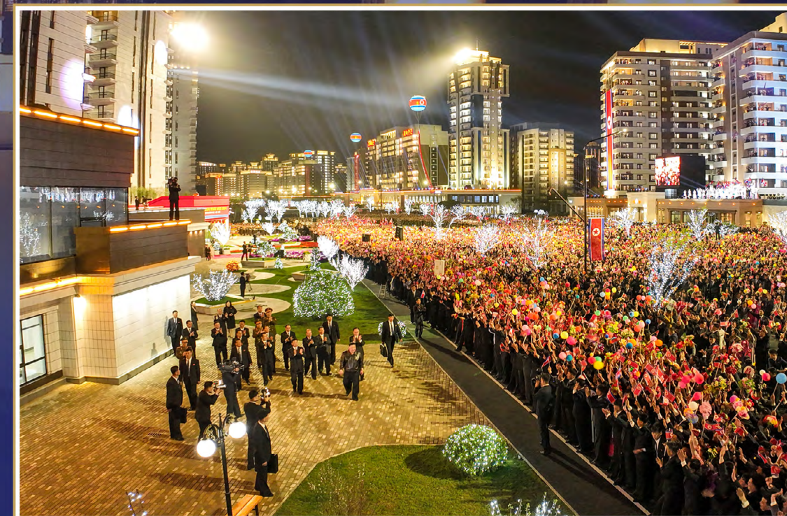
Kim Jong Un warmly wishes happiness to all the families who have received new flats in Rimhung Street in auspicious April.

The owners of the new street and all other participants, who are deeply moved by the loving care of the motherly Party, extended deep gratitude to Kim Jong Un, who is working heart and soul, day and night, to provide the people with the highest civilization and the greatest wellbeing in the world.