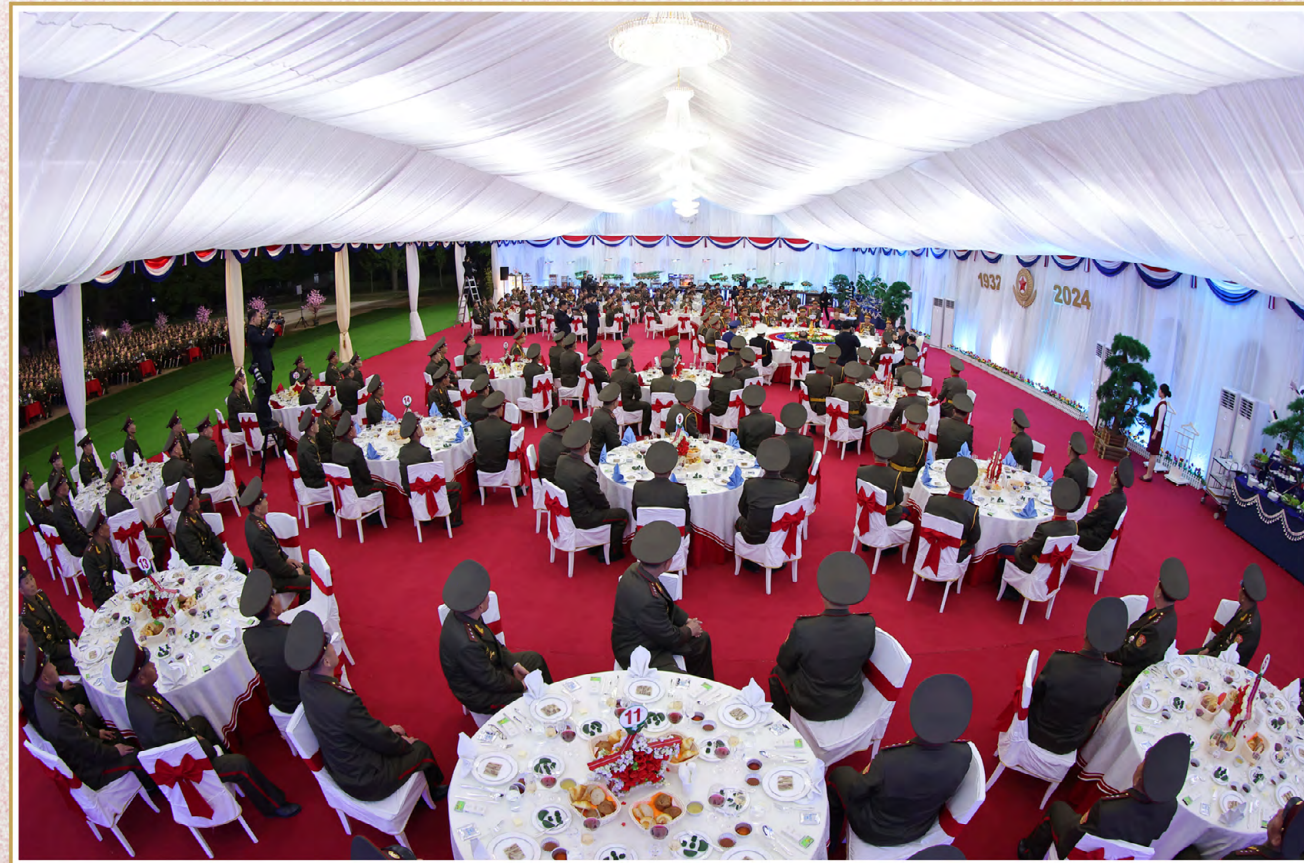
The Ministry of National Defence of the DPRK hosts a reception in congratulation of the teaching staff of Kim Il Sung Military University greeting the holiday.