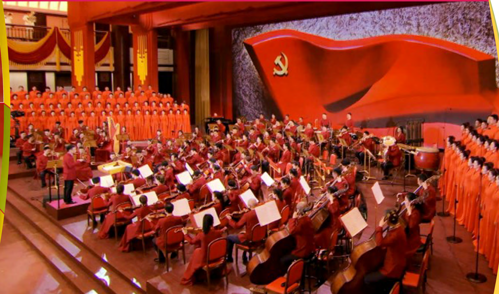
Sun Yeli, minister of Culture and Tourism of the People's Republic of China

Esteemed artistes, comrades and friends from different countries,