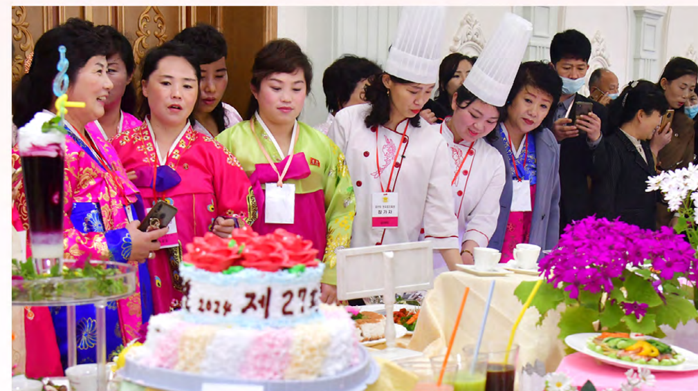
27th national cooking festival

industrial design exhibition and 27th national cooking festival and joint national meeting of the Korean Children's Union organizations took place in the capital city of Pyongyang.