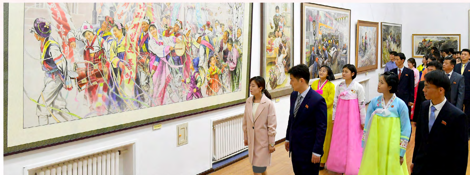
National art exhibition