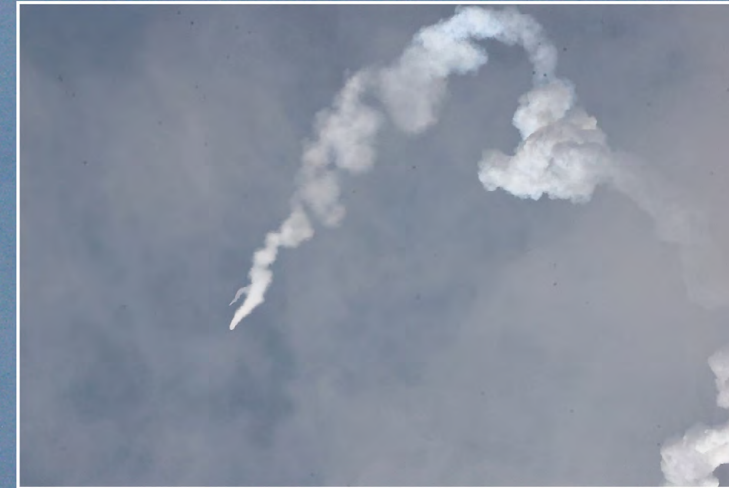
The hypersonic gliding vehicle reached its first peak at the height of 101.1km and the second peak at the height of 72.3km while making 1 000-km-long flight as scheduled, and accurately landed on the waters of the East Sea of Korea.

He set forth the strategic tasks for making a continued leap forward and innovations in the development of ultra-modern weapons by more signally strengthening the self-supporting and modern character of the Juche-oriented military industry.