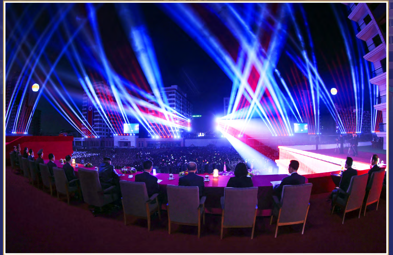
The Hwasong area resounds with the songs sung by the people in praise of the great Workers' Party of Korea which is building a flower garden of all blessings on the basis of the idea of believing in the people as in Heaven while taking care of them in the sacred red flag.