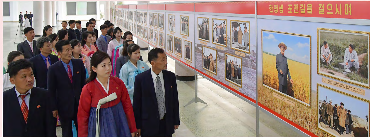
National photo show