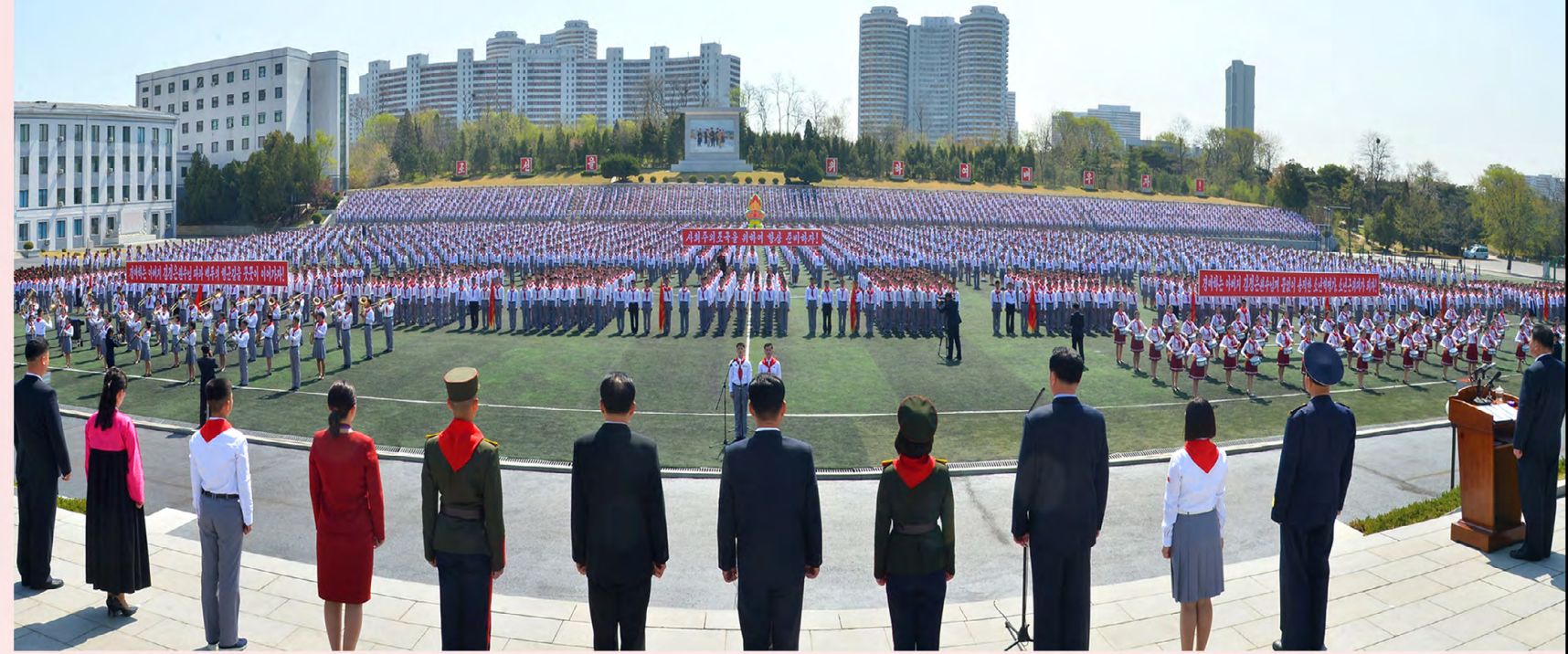
Joint national meeting of the Korean Children's Union organizations