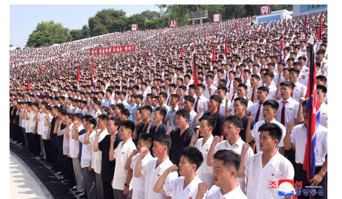
Young vanguard of Pyongyang Municipality meet at the Youth Park Open-Air Theatre to volunteer to take part in the reconstruction campaign of flood-hit areas.

Flags were awarded to young people who volunteered to the front for repairing flood damage.