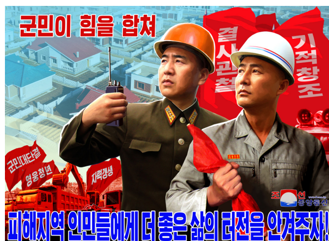
Poster "Let's provide flood victims with better living places with concerted efforts of the army and people!"

Among them are slogans and posters reflecting the WPK's intention to turn the flood-stricken areas into the people's ideal lands, where they enjoy all blessings under socialism, not merely to rehabilitate them.