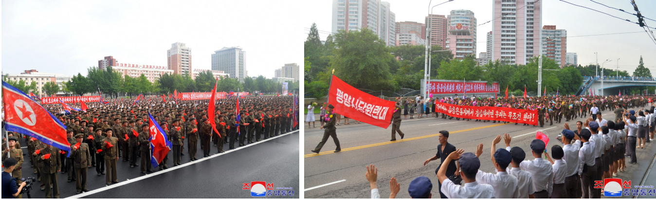
The Pyongyang Municipal Regiment of Party Members leaves for the rehabilitation projects in the flood-hit areas on August 5 after a meeting at the plaza of Pyongyang Indoor Stadium.