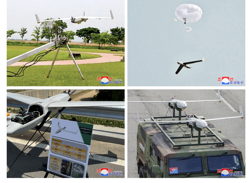
Photos showing the "light drone for long-range reconnaissance" equipped with by the "Drone Operation Command" of the ROK military gangsters.