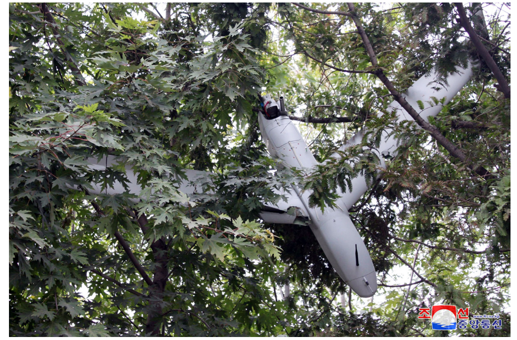
The crashed enemy drone when it was discovered.

of violating the DPRK's Security Bureau of the while intensively searching Ministry of Public Security of the DPRK on October 13 discovered the remains and an objective and scientific of a crashed drone in the area of neighborhood unit According to him, the No. 76, Sopho-dong No. Municipal 1, Hyongjesan District,