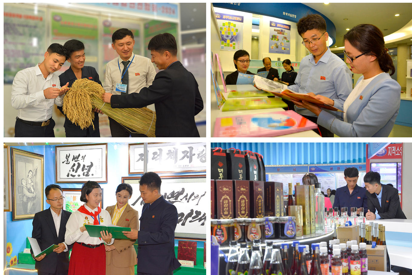
The Intellectual Property Development Exhibition-2024 is held by way of products show at the Sci-Tech Complex between October 2 and 11.

always taken the top place in the country's IT products sales by making a good use of intellectual property