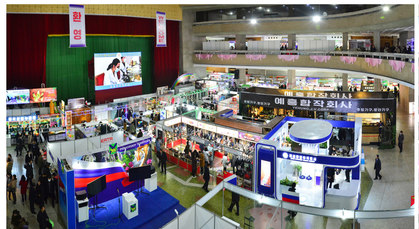
The 16th Pyongyang Autumn International Trade Fair takes place at the Central Youth Hall between November 19 and 25.