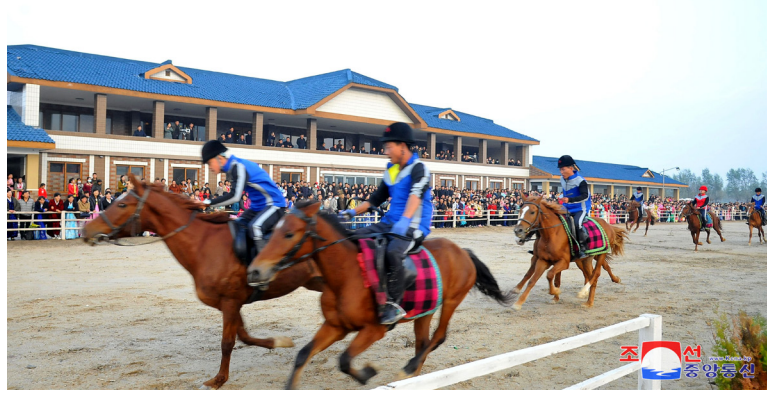
People ride horses at the riding club (above) and cycle down the cycling course in a forest(left).