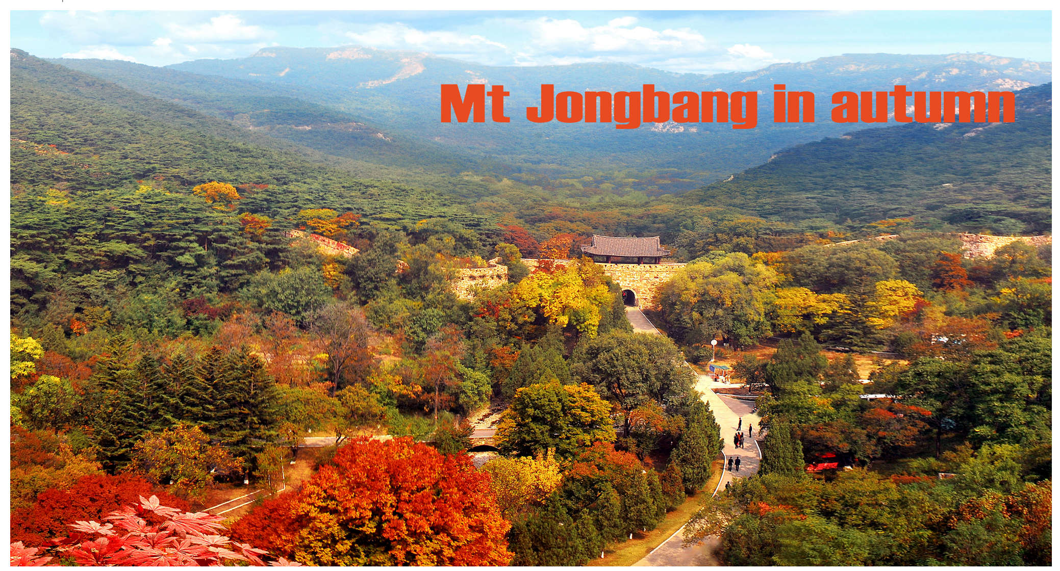
Autumn-tinted thick forests of Mt Jongbang in Sariwon, North Hwanghae Province, unfold a beautiful scenery.