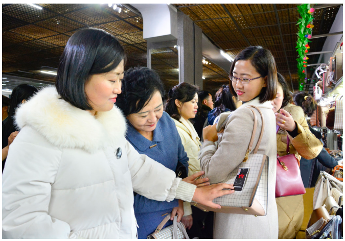
The 2024 autumn commodity exhibition of the Pyongyang Underground Store is held from November 15 to 21.