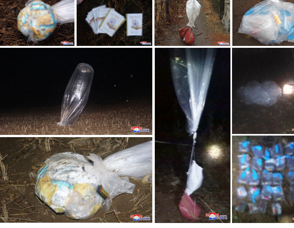
Various kinds of political agitation leaflets and dirty things dropped again by the ROK scum in different areas near the southern border of the DPRK on November 26.