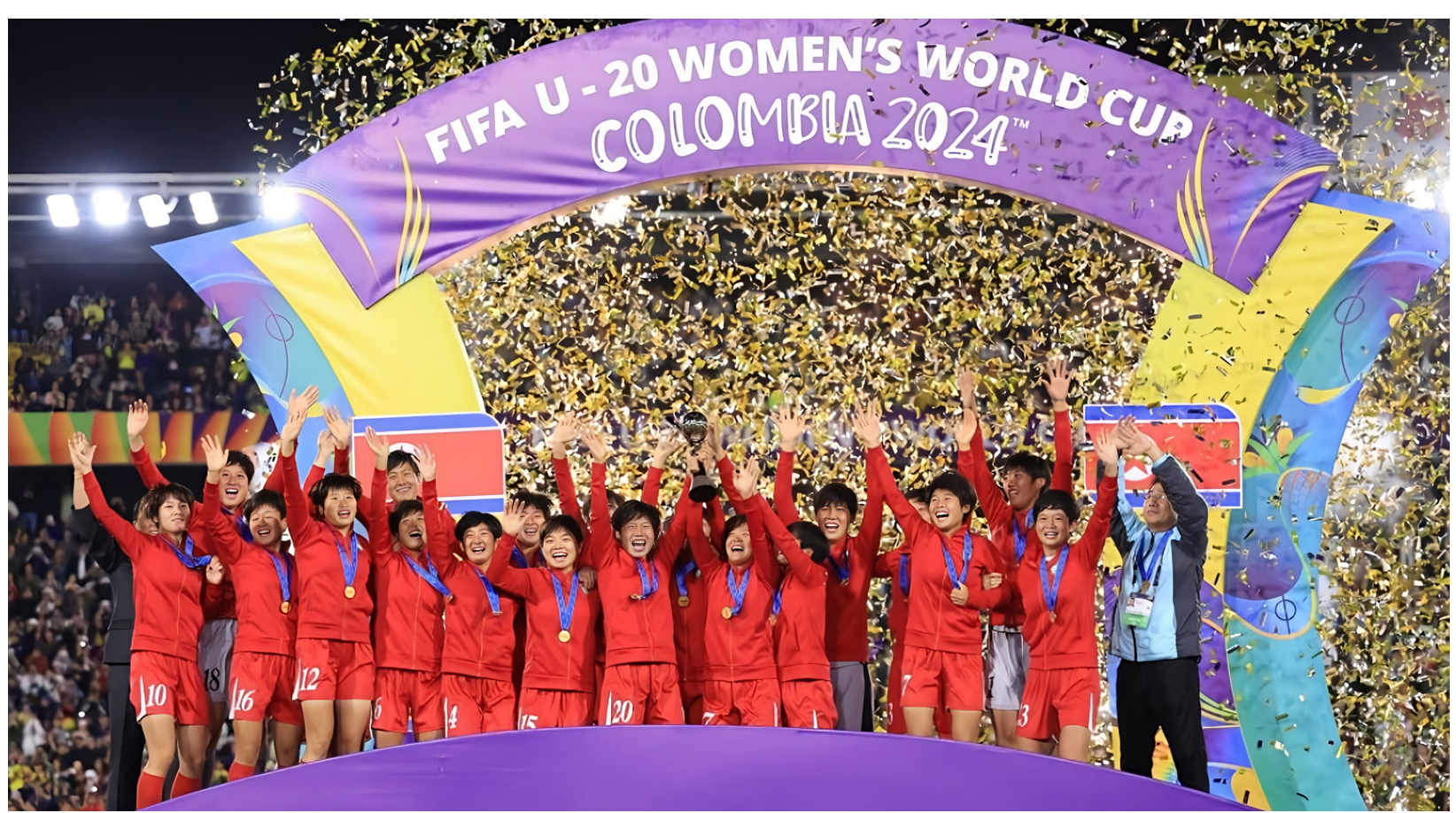
DPRK women footballers celebrate after winning the 2024 FIFA U-20 Women's World Cup.

Thus the DPRK's U-20 women's football team became one of the three top teams which won the trophy three times in the history of the