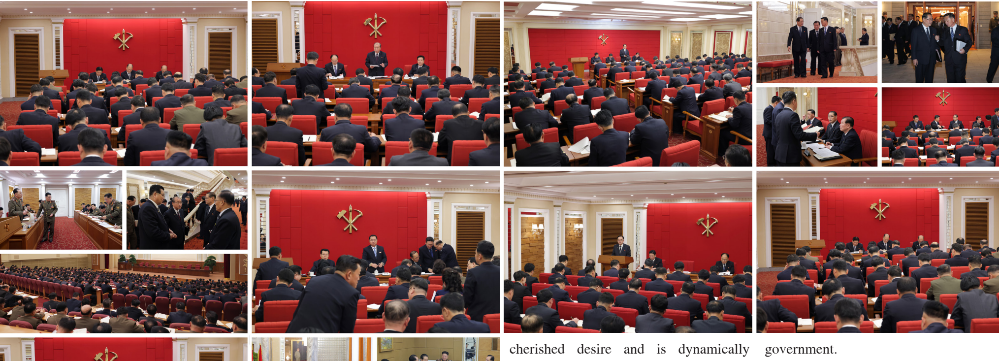
FROM PAGE 4

called on all the participants to remain true to their heavy duty and responsibility they have assumed for the times and revolution and the country and people, and wage a bolder struggle with higher confidence in the vanguard of the general offensive for a great victory and glory in 2025.