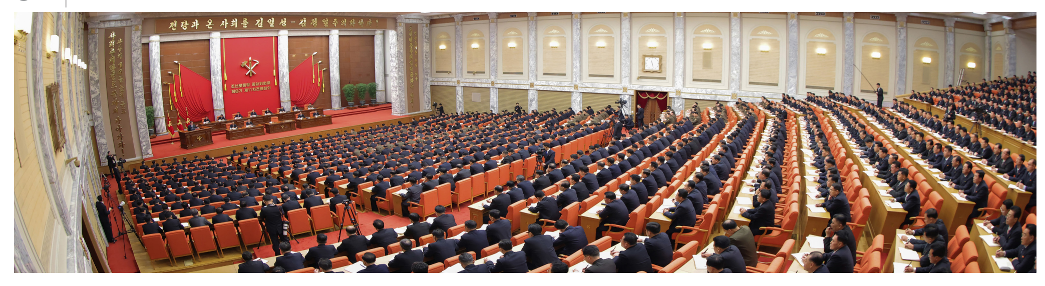
FROM PAGE 5