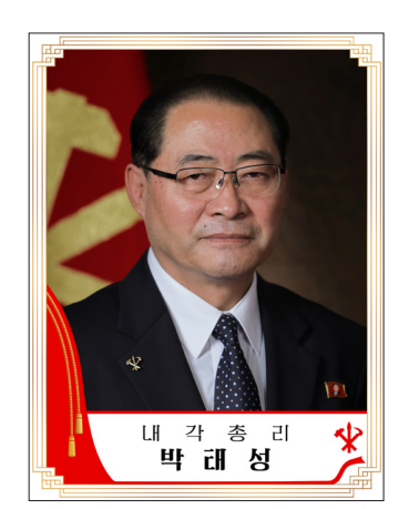
Pak Thae Song

Secretaries of the WPK Central Committee elected at the Eleventh Plenary Meeting of the Eighth Central Committee of the WPK are as follows: