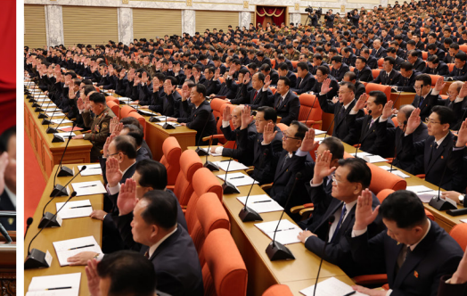
FROM PAGE 2

This year, too, we have channelled continuous efforts into the development of the political and military fields, further raising the absolute prestige of the country and firmly guaranteeing the defence of its sovereignty and development of socialism.