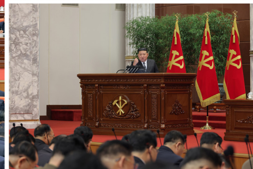
FROM PAGE 3

and promptness of flood warning so as to minimize disaster.