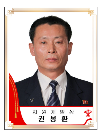
Kwon Song Hwan

Minister of Natural Resources Development Kwon Song Hwan and Minister of Commerce Kim Yong Sik