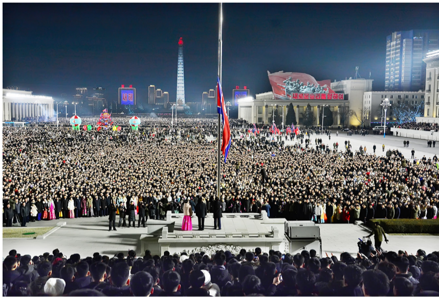
The national flag-hoisting ceremony is held at Kim Il Sung Square in Pyongyang on January 1 2025.

Displaying the pride and joy of the people of a powerful state who have grown up under the national flag of glory, the magnificent and bright fireworks redoubled all the people's revolutionary will to dynamically accelerate the new historic advance for vigorously hastening the era of comprehensive prosperity of the state, praying for the good fortune of the country.