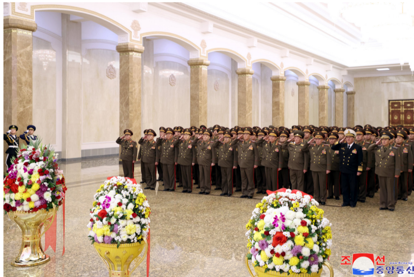
Senior Party and government officials including members of the Presidium of the Political Bureau of the WPK Central Committee and commanding officers of military organs visit the Kumsusan Palace of the Sun on January 1 2025.

Seen before the statues of Kim Il Sung and Kim Jong Il there was a flower basket bearing the name of the respected Comrade Kim Jong Un.