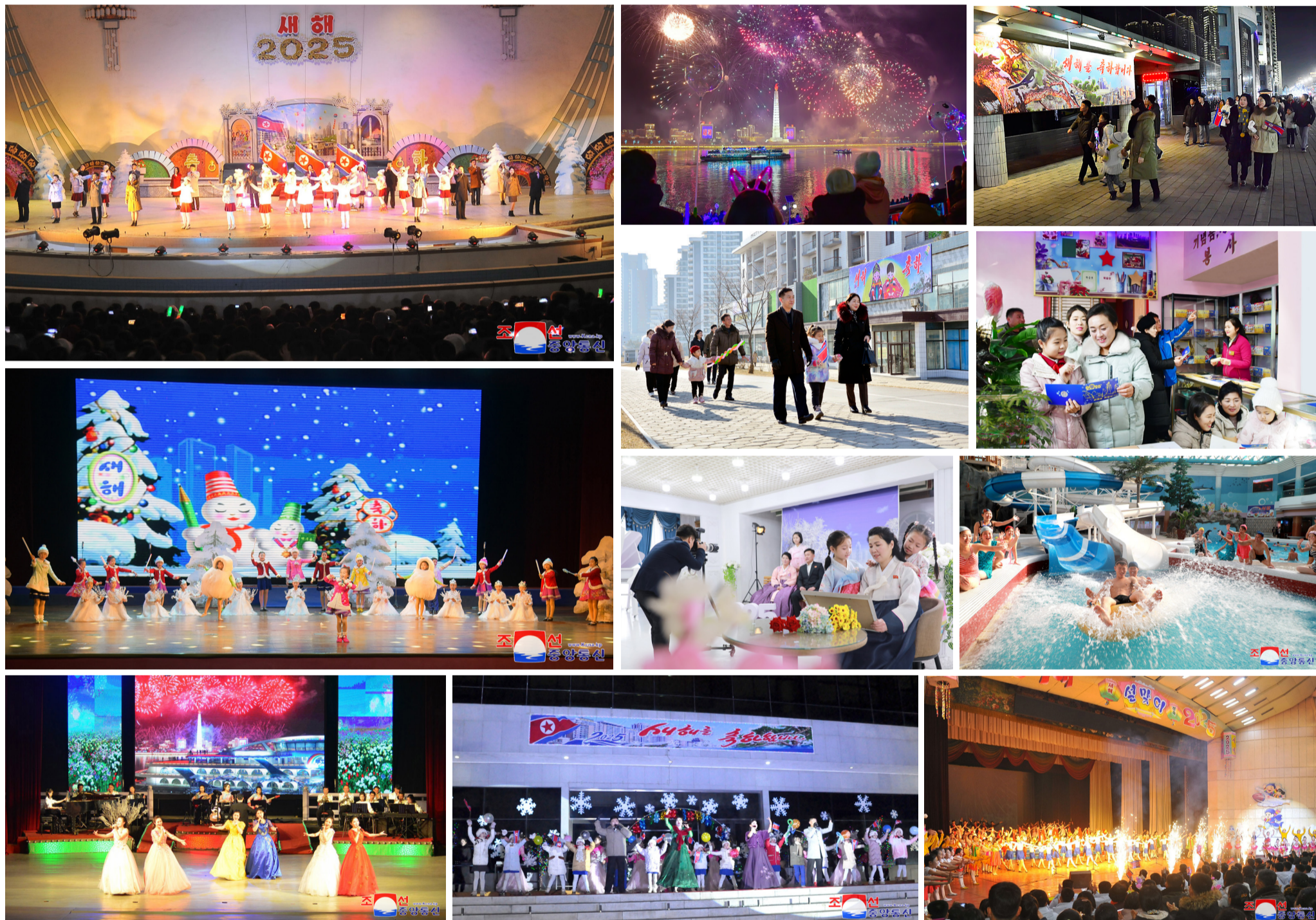
The Korean people spend New Year holiday in Pyongyang and the provinces.

The streets of Pyongyang and the provinces were decorated with majestic and colourful illuminations.