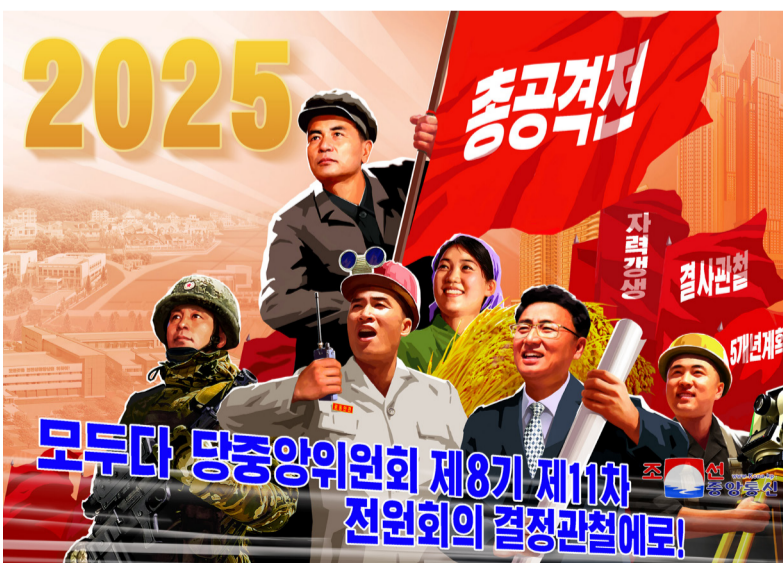
Poster "All out for the implementation of the decisions of the Eleventh Plenary Meeting of the Eighth Party Central Committee!"

Other posters call for conducting fish farming and aquaculture on a large scale, pushing ahead with the forest restoration