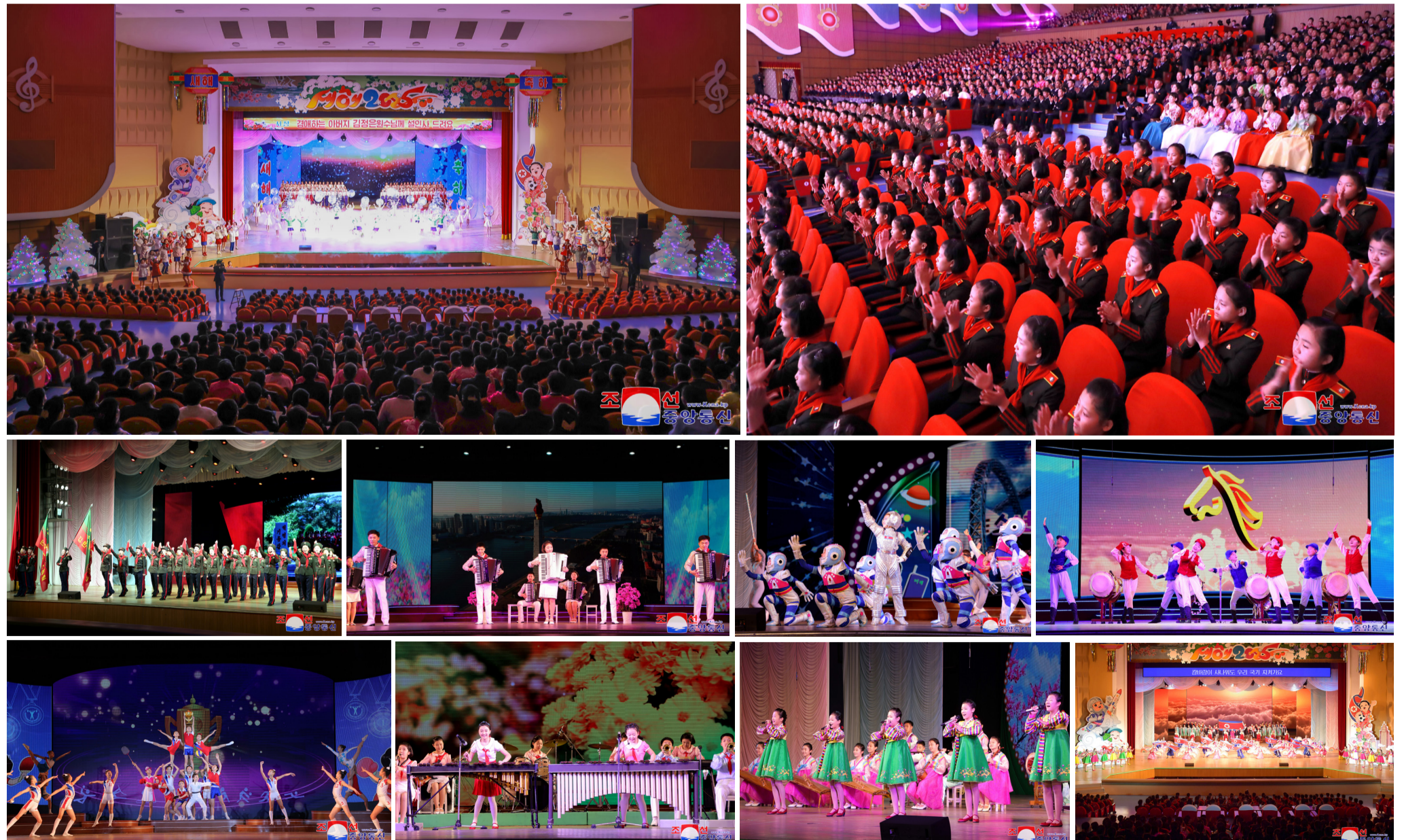
A schoolchildren's performance in celebration of the New Year 2025 is given at the Mangyongdae Schoolchildren's Palace in Pyongyang on January 1.

The performance was acclaimed by the audience as it artistically represented the aspirations and determination of the young revolutionaries and patriots.