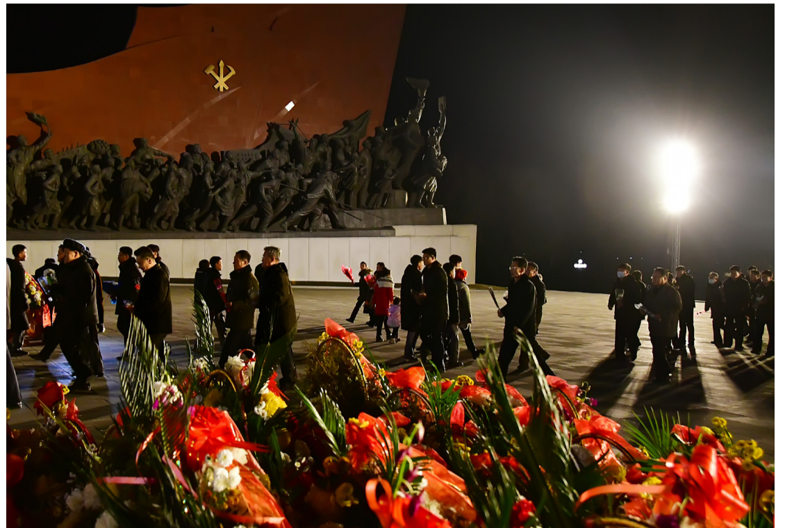
Pyongyang citizens pay floral tribute at the statues of President Kim Il Sung and Chairman Kim Jong Il on Mansu Hill.

Officials, working people, service personnel and youth and schoolchildren across the country visited the statues of the great leaders in their residential areas to pay tribute to them.