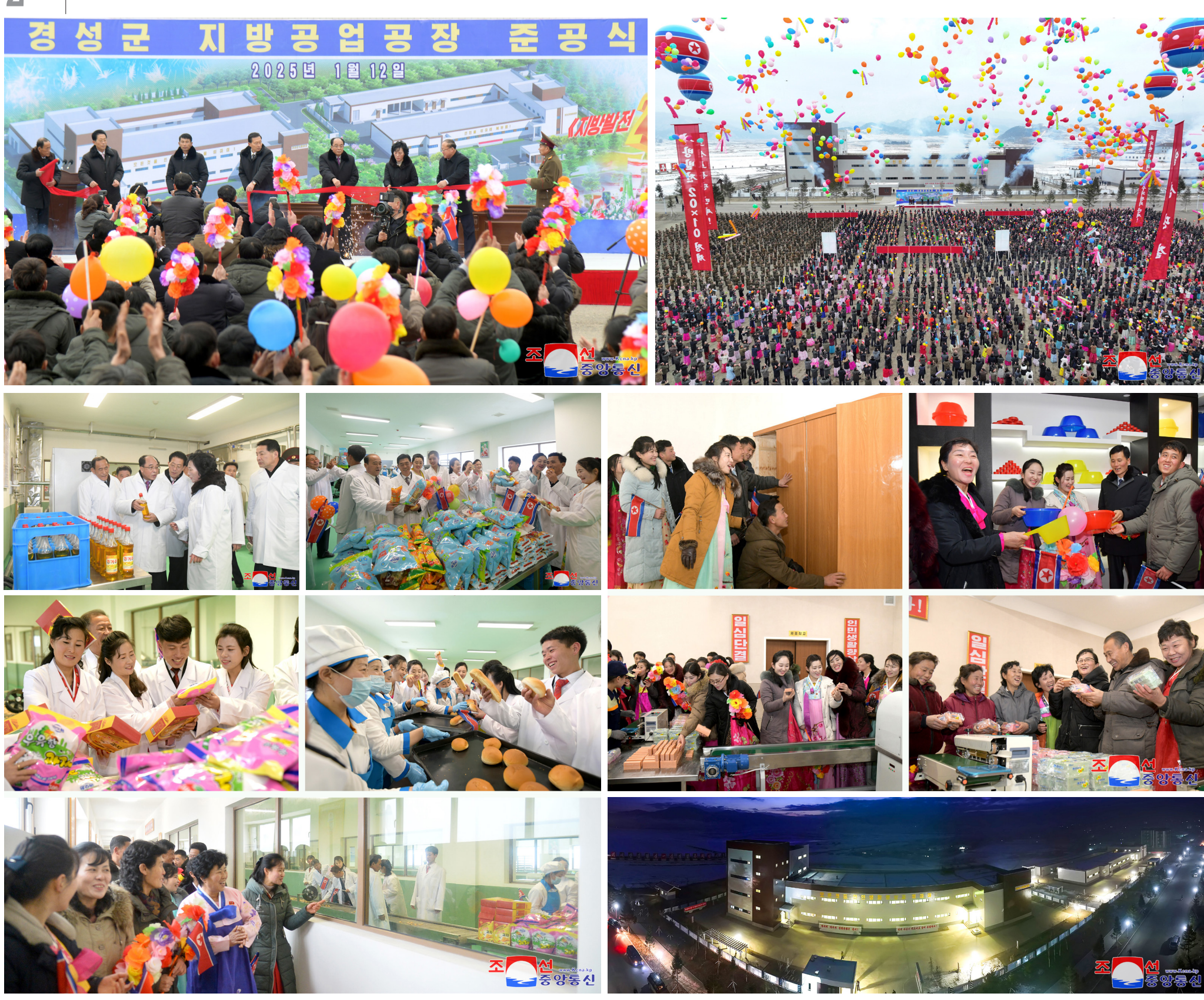
An inauguration ceremony of the regional-industry factories in Kyongsong County is held on January 12.