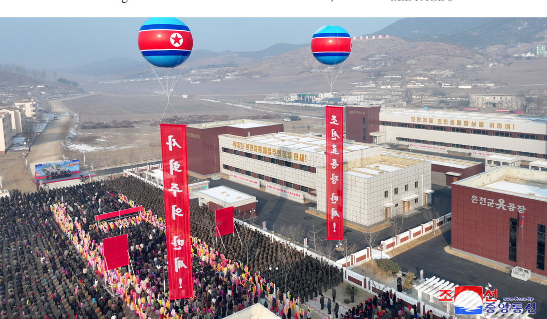
Unchon County of South Hwanghae Province celebrates the completion of its regional-industry factories as a great auspicious event on January 14.