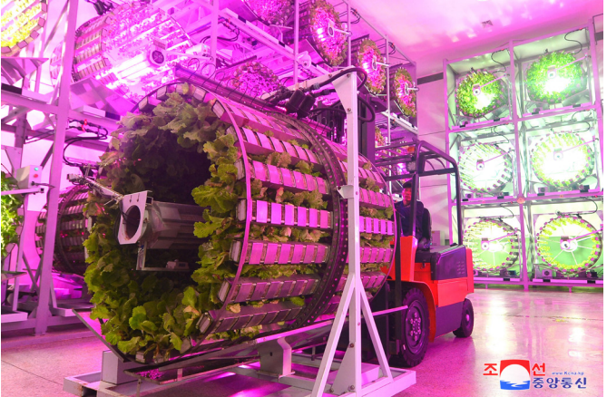
The Kangdong Combined Greenhouse Farm built in March 2024 contributes to improving the people's livelihood.