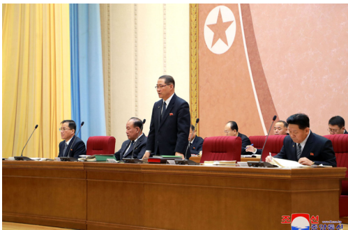
An enlarged plenary meeting of the Cabinet Committee of the Workers' Party of Korea takes place on January 13-14.