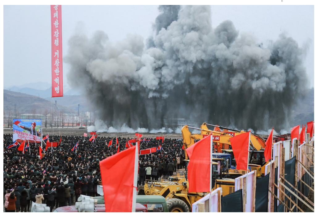
A ground-breaking ceremony takes place with splendour on February 28 2024 for the construction of regional-industry factories in Songchon County as part of the project to implement the Regional Development 20×10 Policy.

The successes and experience gained last year serve as a great encouragement and steppingstone to the agricultural workers who have entered the straight course of attaining the goal set by the Eighth Congress of the Party for the agricultural sector.