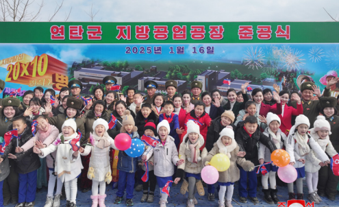
An inauguration ceremony of regional-industry factories is held in Yonthan County on January 16.