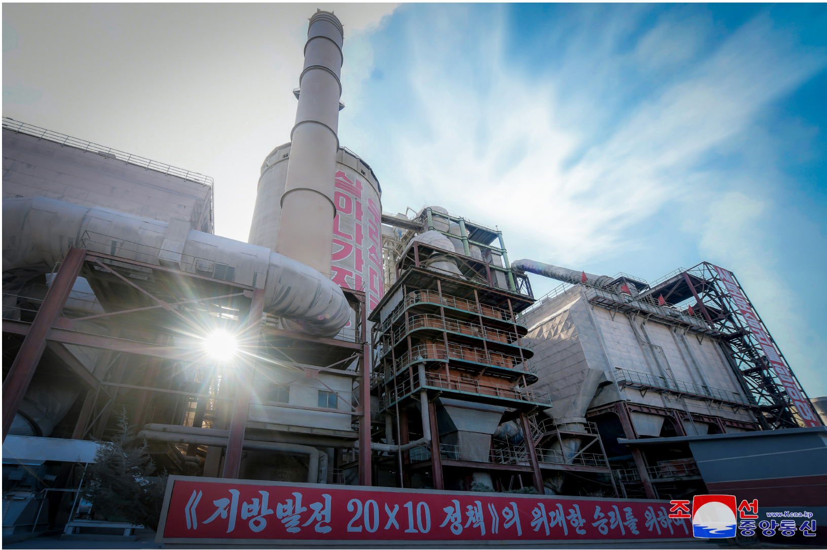
The Sangwon Cement Complex increases its output every day from the outset of the year up to now as compared with the same period of last year when it surpassed the peak year level.