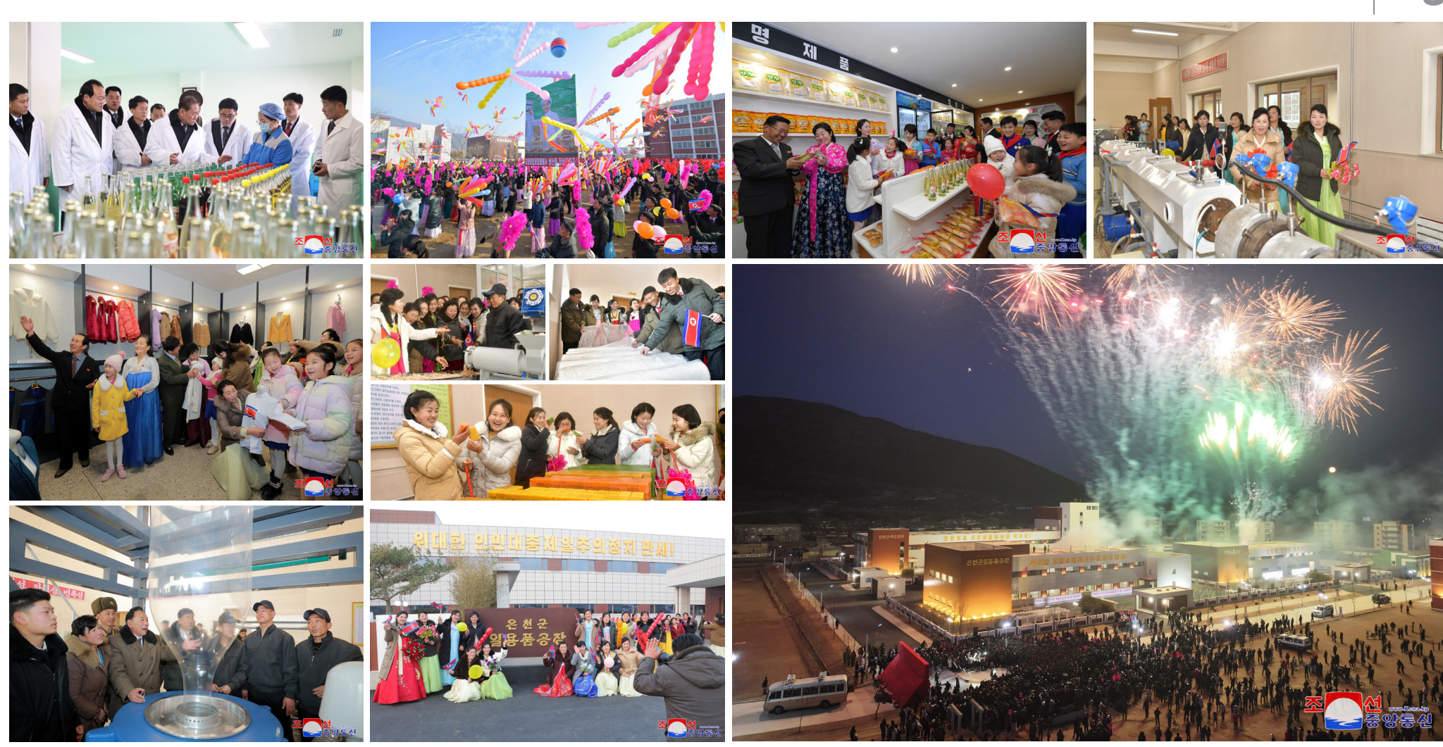
Regional-industry factories are inaugurated with a public event in Unchon County of South Hwanghae Province.