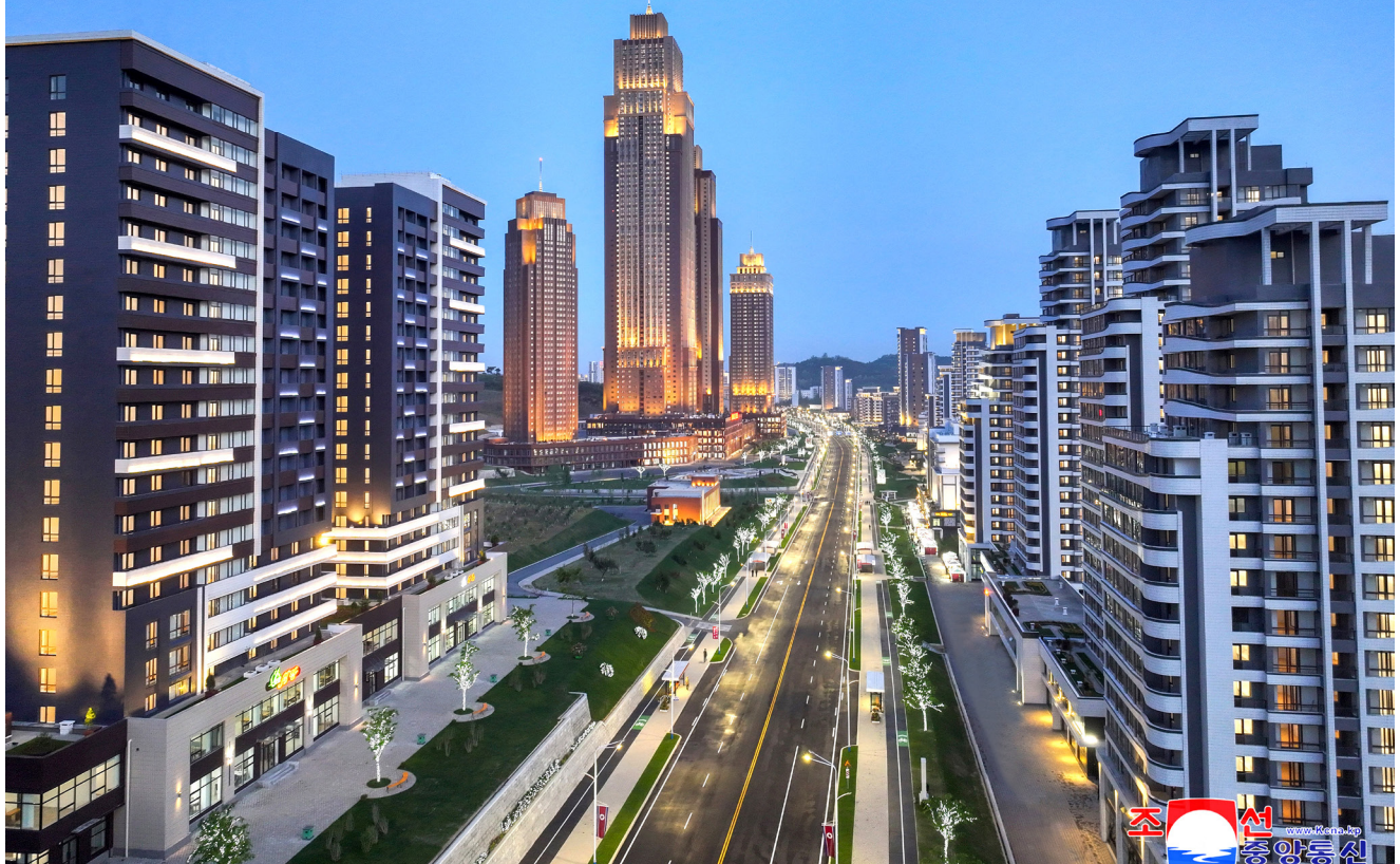
New streets and houses are built in the capital city and regions.