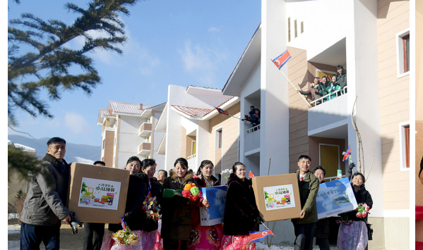
Flood victims move into new houses with joy.