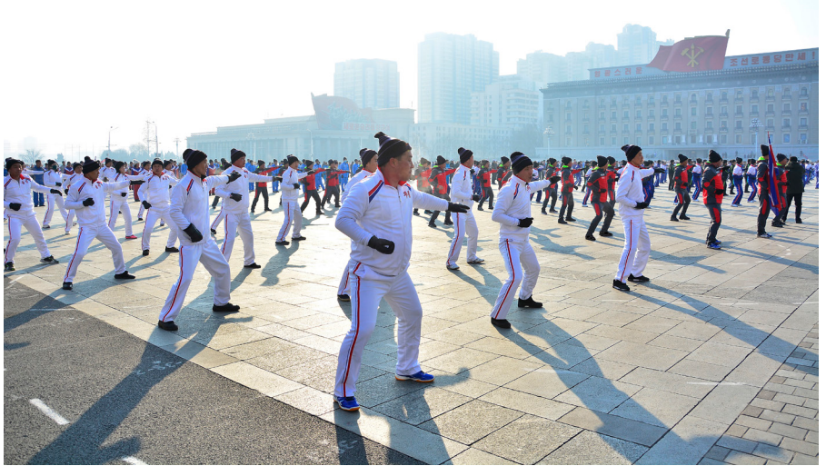
First sports day of new year observed