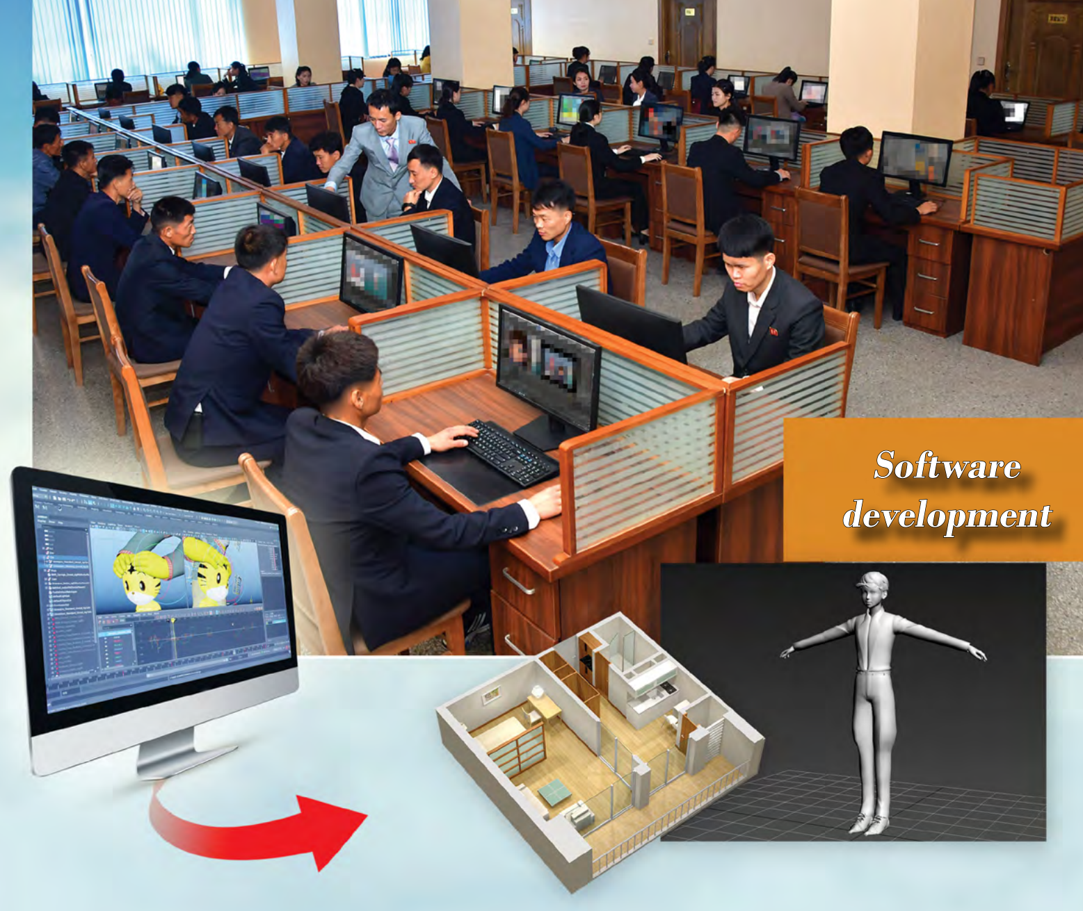
2D, 3D multimedia development to order