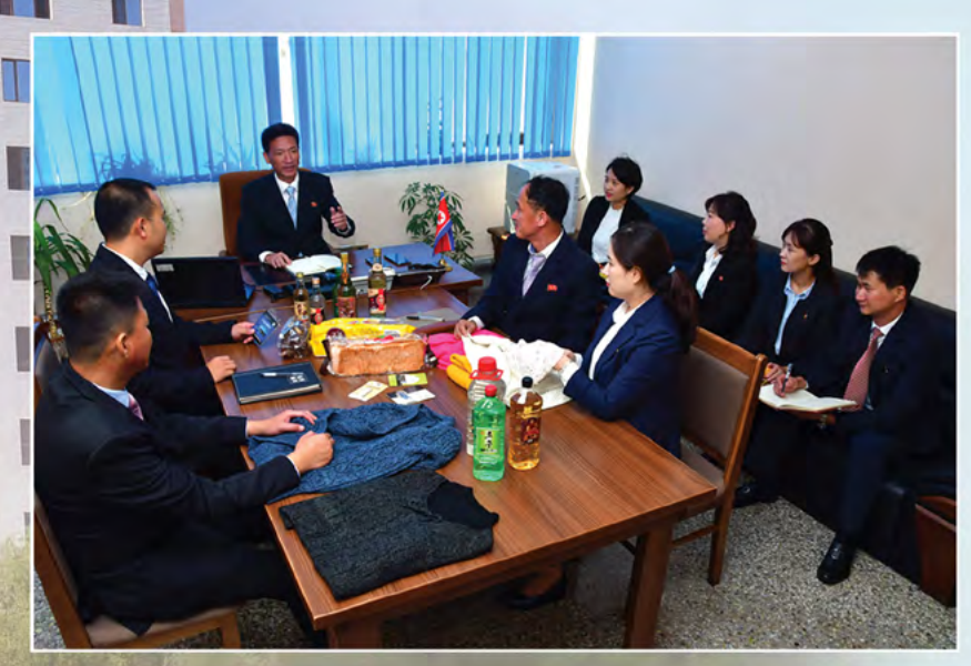
They are conducting a consultative meeting to improve the quality of products

It will constantly update itself and advance by dint of cutting-edge technologies and conduct brisk exchanges and cooperation with foreign countries on the credit-first principle.