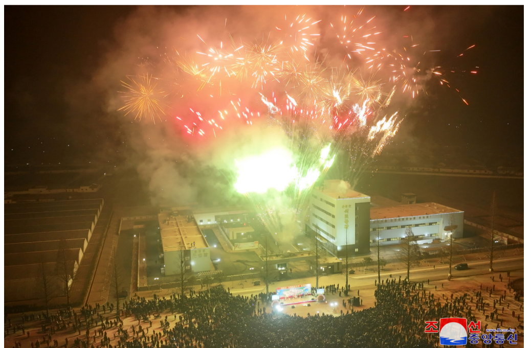
Residents of Onchon County celebrate the inauguration of regional-industry factories.