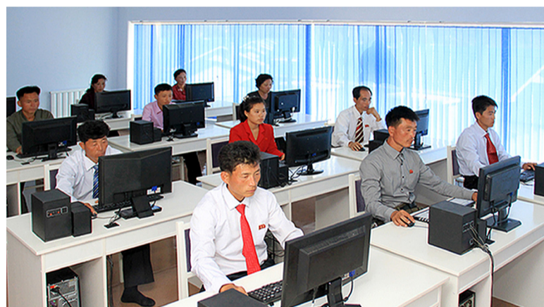
Modern science and technology are quickly disseminated among working people in regions. The photo was taken in Sinchang-ri of Sinchang County, South Hwanghae Province.

users of Hwanggumyolmae (golden fruit), a website called a "close companion of scientific farming" and "guide to high yield", has increased markedly, and the agricultural workers have widened the horizons of their knowledge and got more enthusiastic about scientific farming.