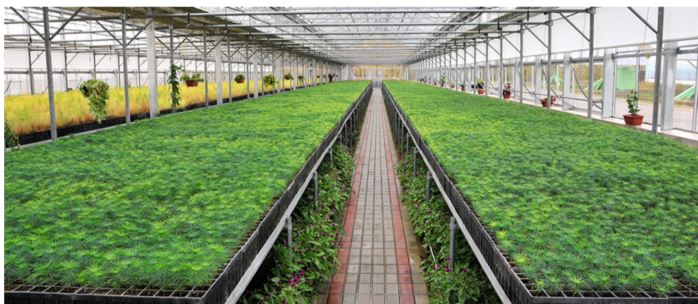
Saplings of good species of trees are produced in a greenhouse of the Central Tree Nursery.

The modernly-built Unjong Teahouse on Changjon Street in Pyongyang serves green, black, Cholgwanum and other teas by preserving their original tastes.