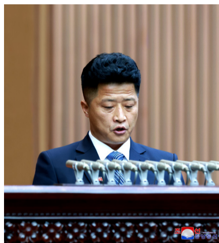
Finance Minister Ri Myong Guk delivers a report on the state budget.

The funds needed for the recovery from flood damage, the construction of regional-industry factories, the project for building 10 000 flats at the third stage in the Hwasong area, the construction of the Sinpho City Offshore Farm, the modernization of the Ryongsong Machine Complex