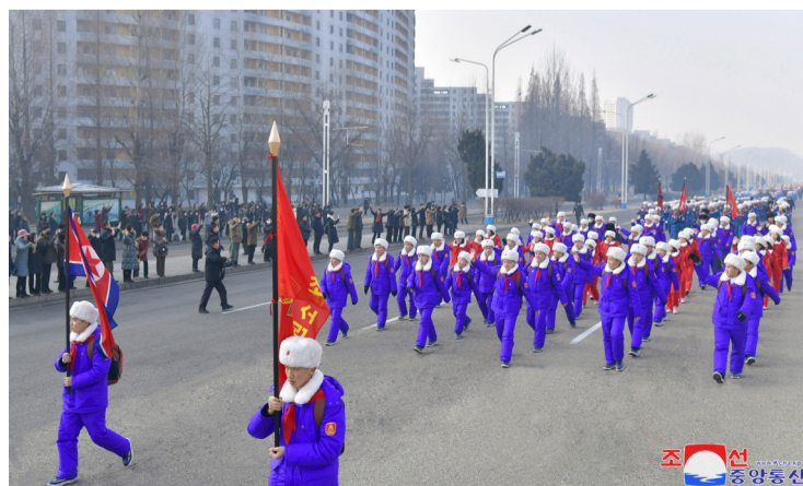
A meeting of schoolchildren takes place on January 22 to start study tour of the 1 000-ri Journey for National Liberation.