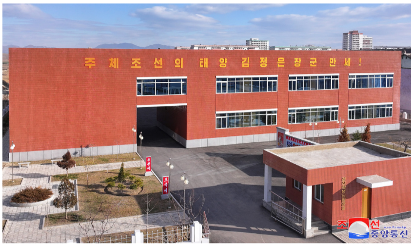
School uniform and students' footwear factories spring up and start operation one after another in all provinces.