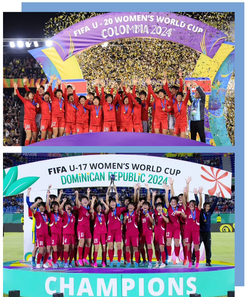
DPRK players celebrate their win at FIFA U-20 (top) and U-17 (above) women's World Cup finals.

The incredible spiritual strength, high team spirit and the sense of organization and unity of the Korean women footballers in the team sport were the key to success in the events. The ideological and spiritual superiority over the opponents was the trait peculiar to the Korean women's football and a decisive guarantee for winning victories in the two events.