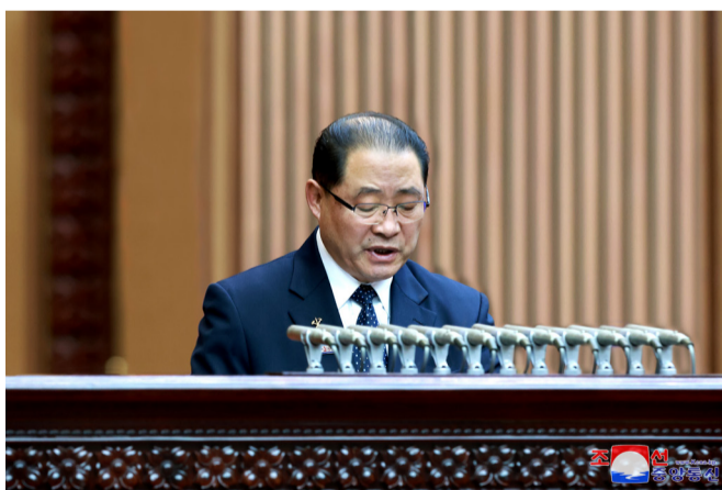
Premier Pak Thae Song delivers a report on the work of the Cabinet.

Our people achieved remarkable successes in the struggle for economic development and improvement of the people's living standards, overcoming all sorts of unprecedented challenges and threats last year under the wise