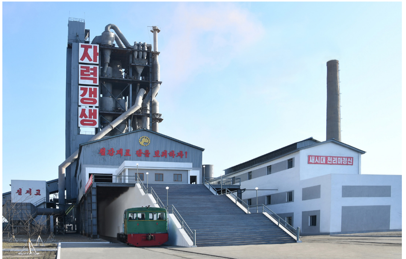
A Korean-style energy-saving oxygen blast furnace built at the Hwanghae Iron and Steel Complex.

This has laid a solid foundation for making a great stride in the economic development of the country and the improvement of the people's living standards with locally-available