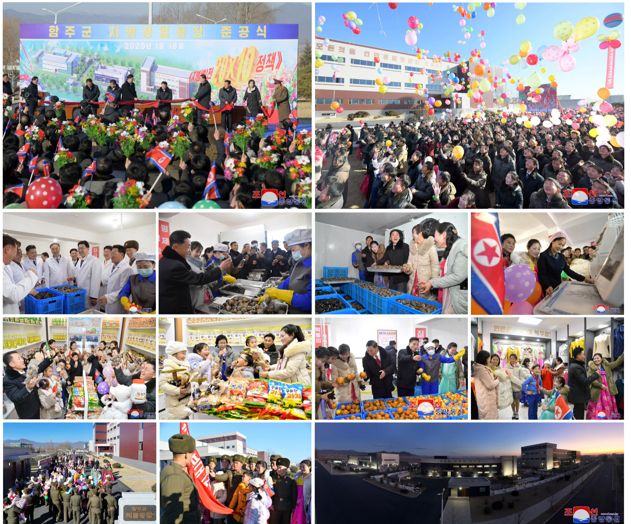
An inauguration ceremony of the regional-industry factories in Hamju County takes place on January 18.

Modern factories rise up in succession to contribute to improving material and cultural life of people in Hamju and Onchon counties