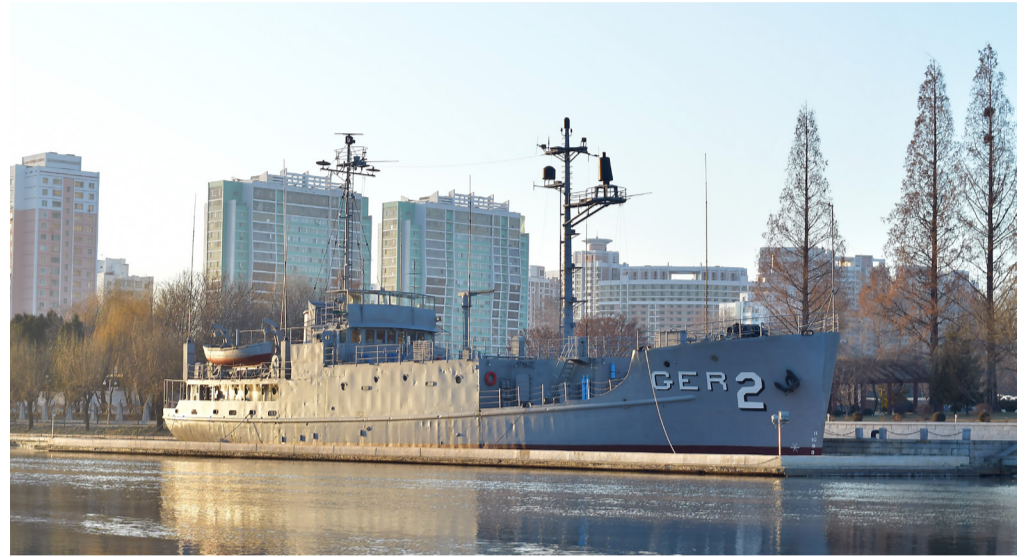
The US armed spy ship Pueblo bound to the Pothong River in the captured weapons exhibition section of the Victorious Fatherland Liberation War Museum in Pyongyang.

moves for confrontation with the DPRK: Any force will surely be annihilated if it seeks military confrontation with the DPRK.