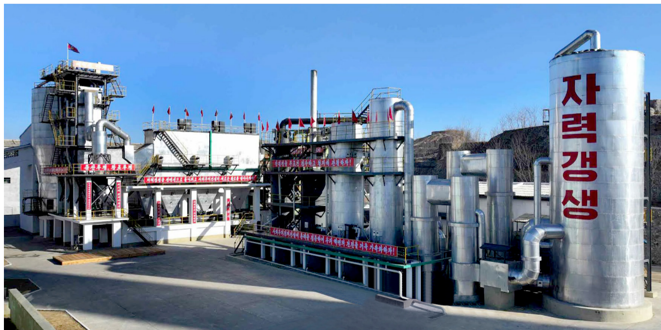
The roasting-sulphuric acid process reconstructed at the Munphyong Smeltery. It will be helpful to the development of the nonferrous metal industry of the country.

With the national production system of school uniforms, bags and shoes being in operation, an institutional guarantee