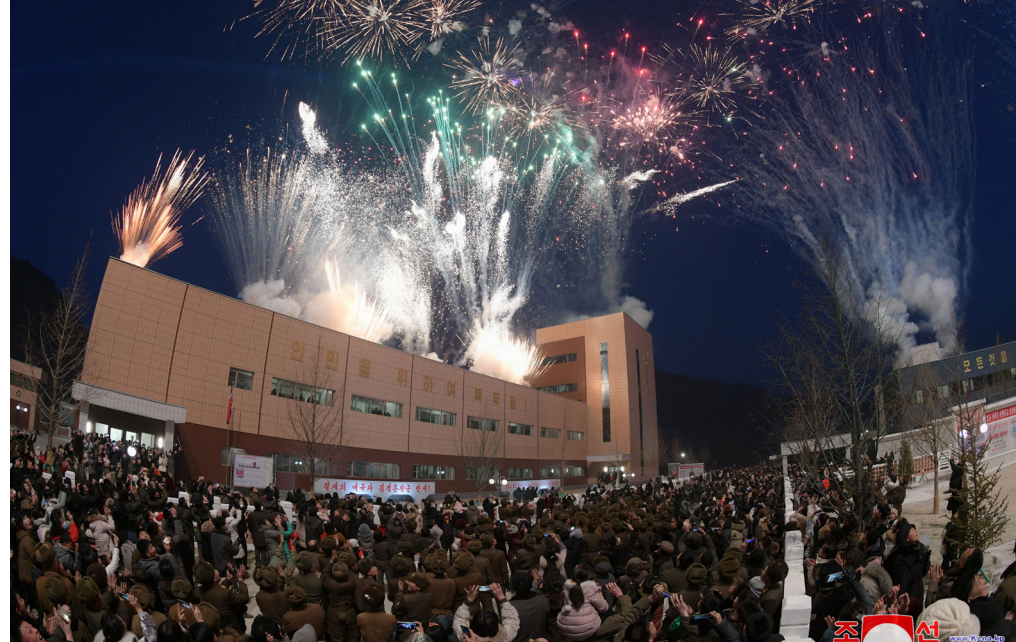
Local people are happy as they take part in the inaugural ceremony of the regional-industry factories in Usi County.