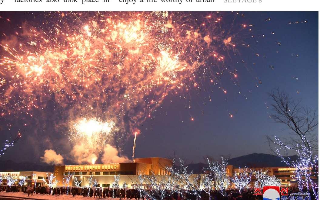
Participants look round the new regional-industry factories in Kosan County after the inauguration ceremony.