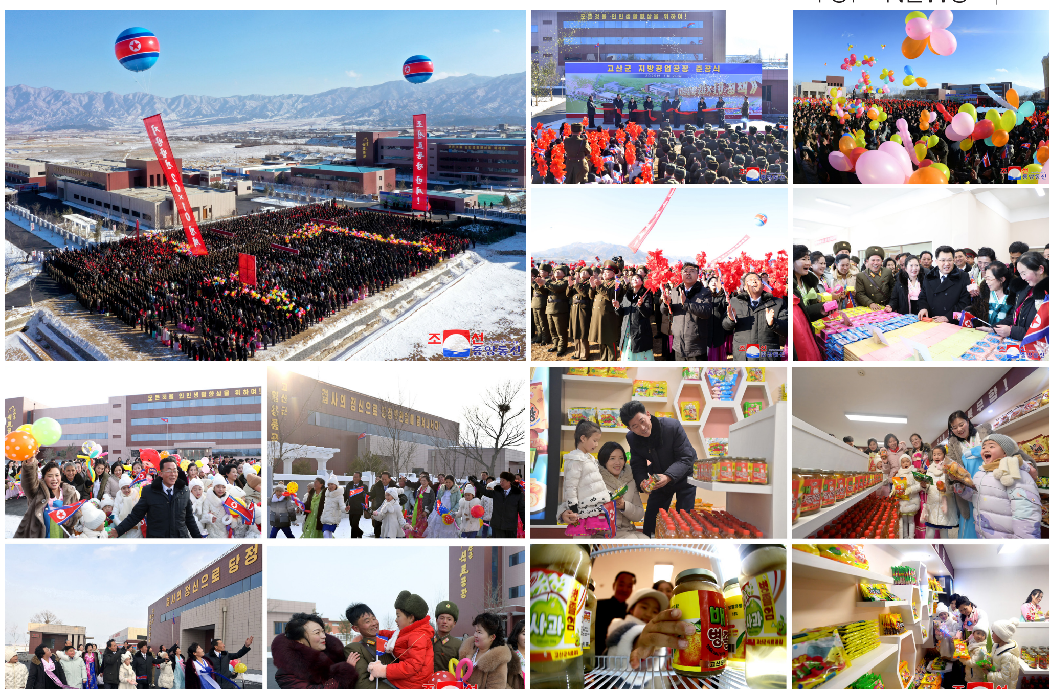
An inauguration ceremony of regional-industry factories takes place in Kosan County on January 29.