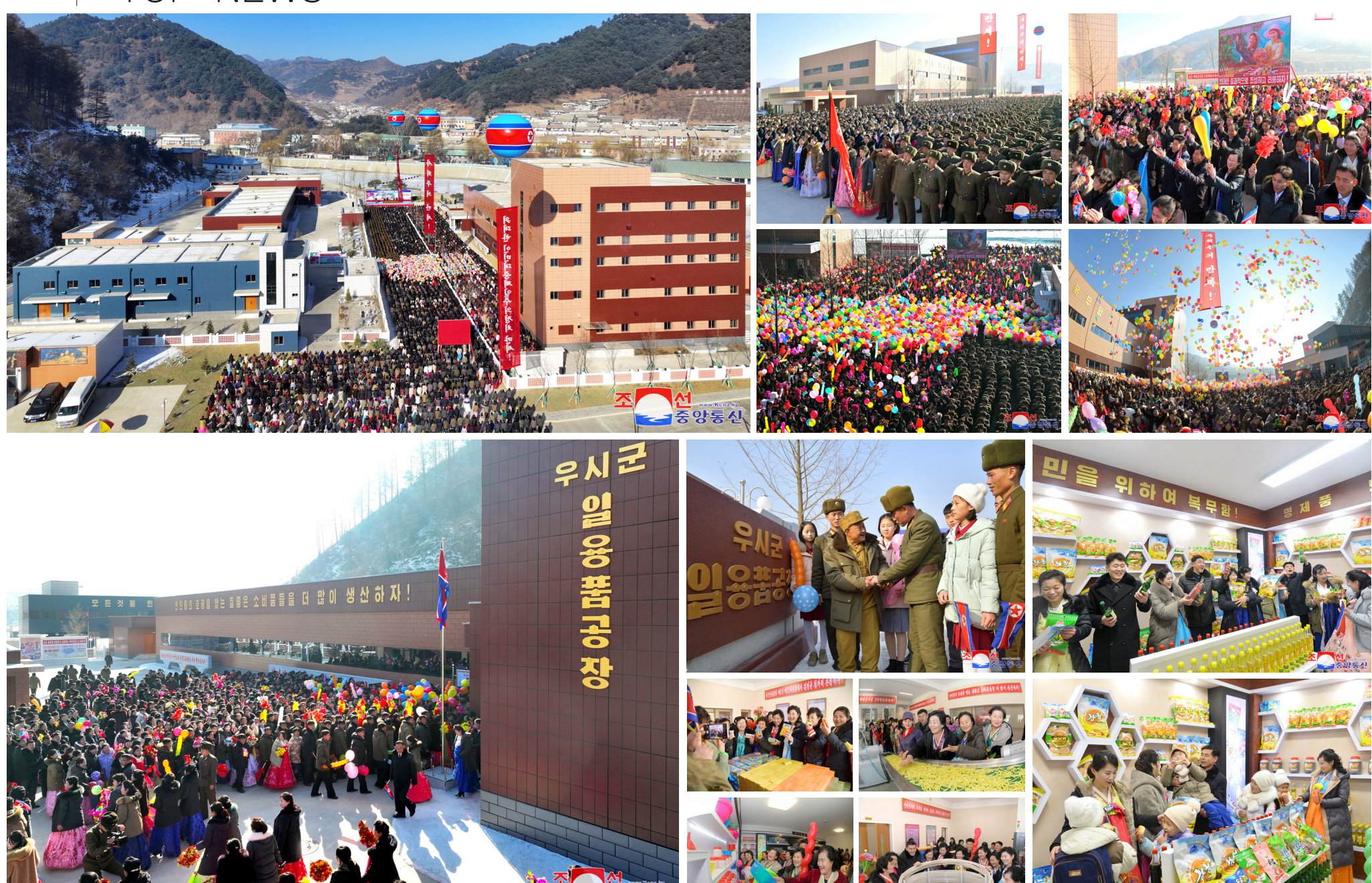
An inaugural ceremony of regional-industry factories takes place in Usi County on January 25.