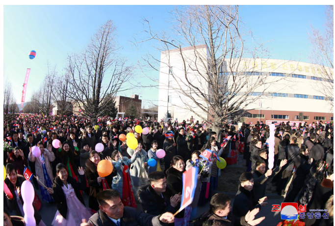
An inauguration ceremony of regional-industry factories is held in Kujang County on January 24.