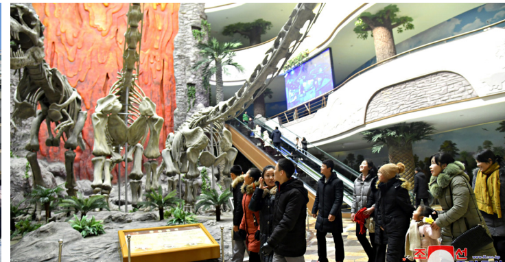
Working people and schoolchildren joyfully spend lunar New Year's Day across the country.