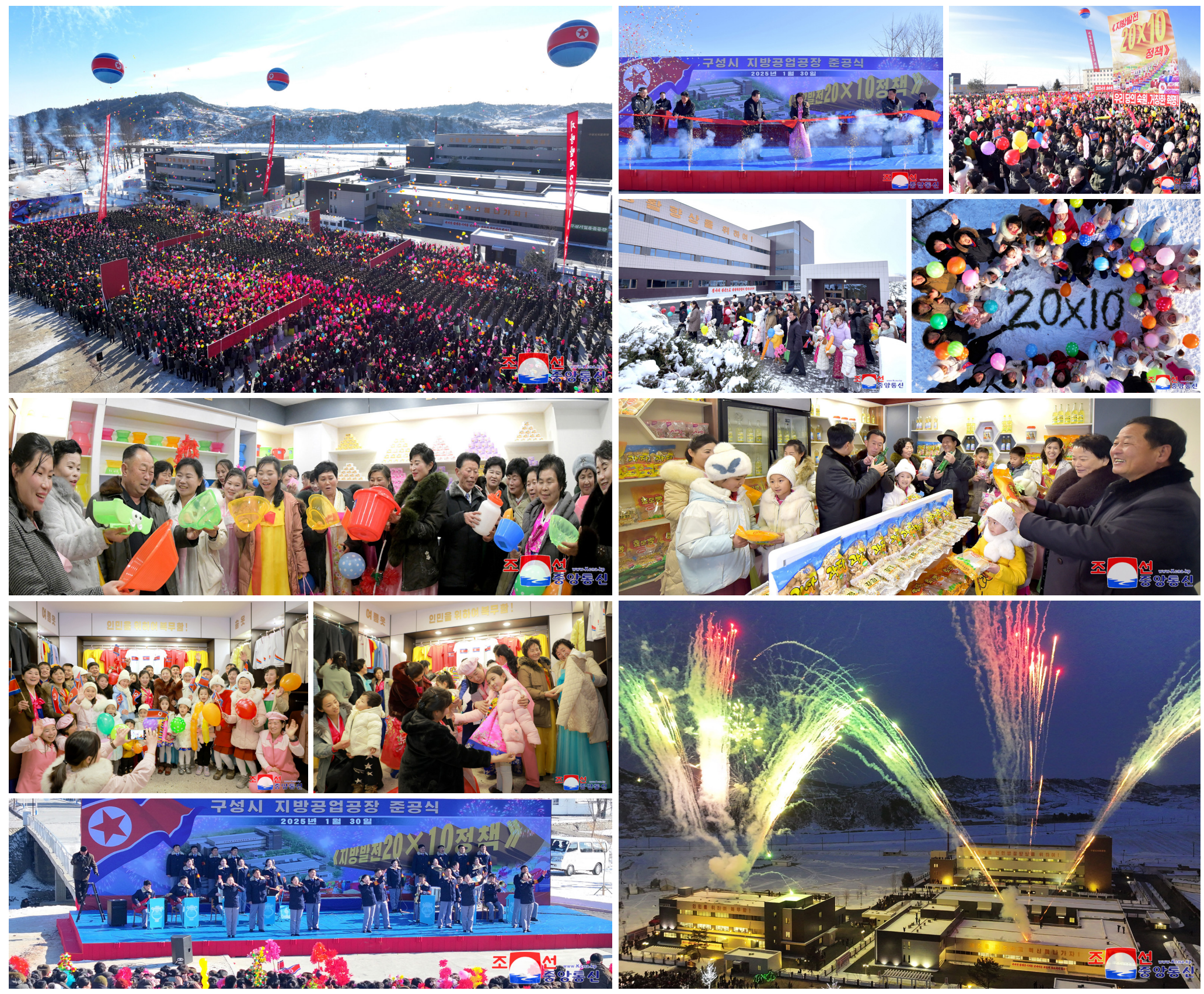
An inauguration ceremony of regional-industry factories is held in the city of Kusong on January 30.