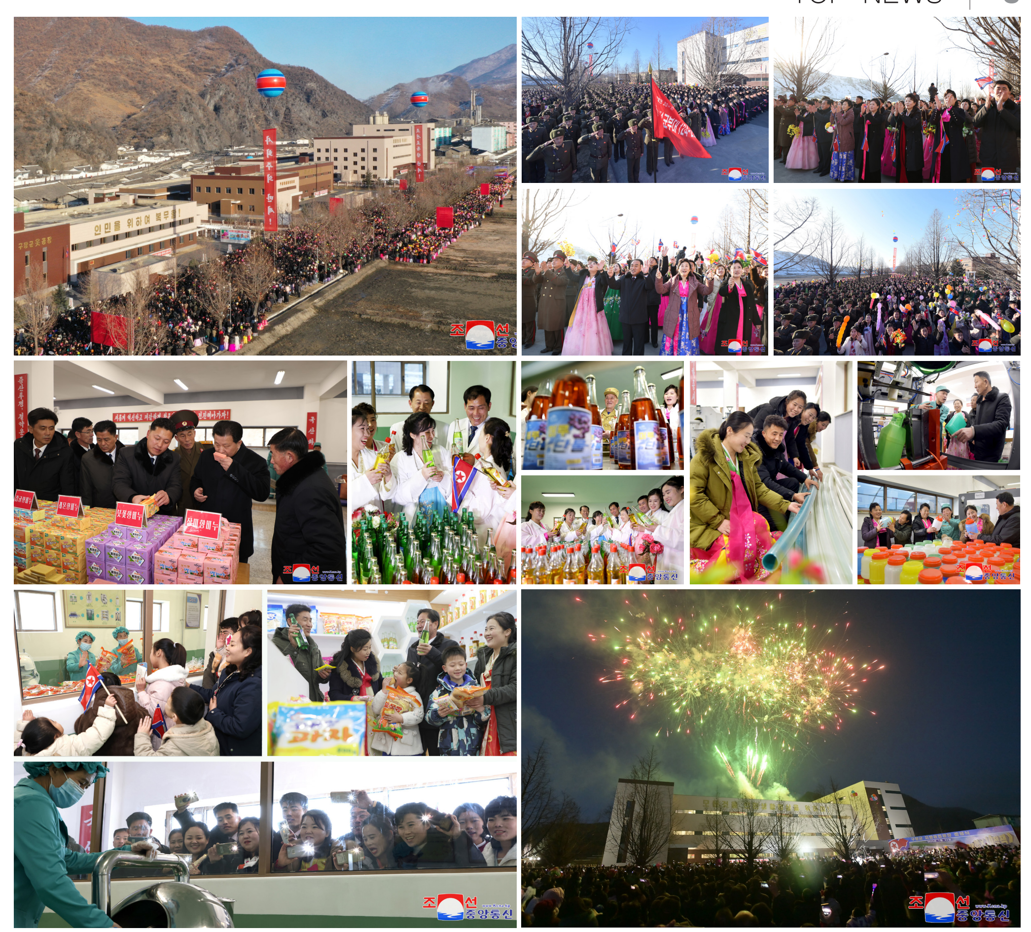
Residents celebrate the inauguration of regional-industry factories in Kujang County.