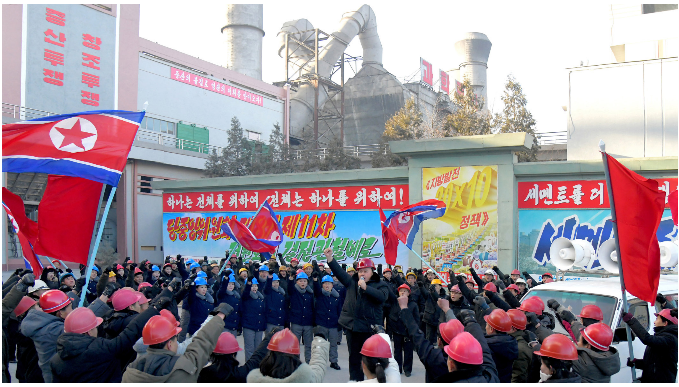
Workers pledge to attain the goal for increasing cement production at the Sangwon Cement Complex.

Bearing in mind that the way for increased production to attain the ambitious goal with the existing capacity is to attach importance to science and technology, officials of the complex have worked out detailed monthly, daily and shift plans and are pushing ahead with their implementation by relying on