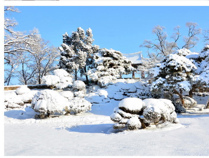
Snowscape shots taken in different parts of Pyongyang present the scenic beauty of the capital city.