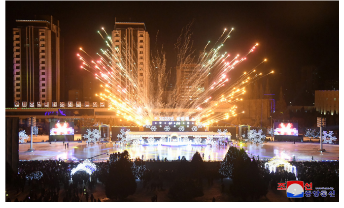
A variety of elegant ice-skating pieces is staged in the performance in celebration of lunar New Year's Day.