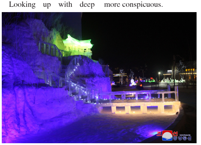
The Ice Sculpture Festival-2025 in Celebration of February 16 goes on in the city of Samjiyon.

Spectacular are other sculptures on various themes and decorative visual aids going well with the distinctive illuminations around them, making the scenery of the modern mountainous city more conspicuous.