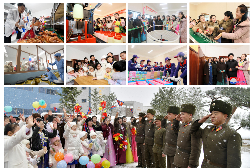
An inaugural ceremony of regional-industry factories is held in Orang County.