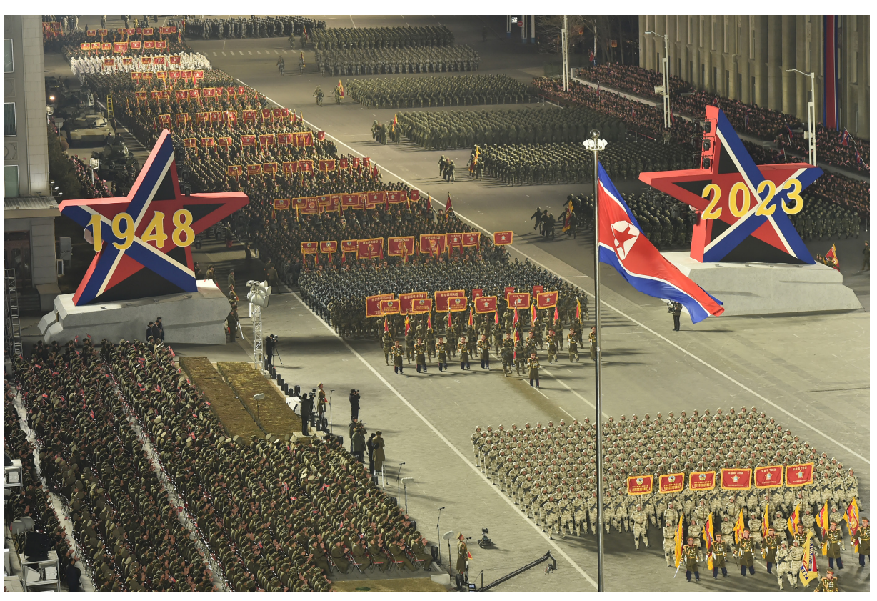
A military parade is held to celebrate the 75th anniversary of the Korean People's Army in February 2023.

Lots of military miracles it worked during the war are still on every Korean's lips like legends. In particular, the KPA beat off the enemy's armed invasion through an immediate counterattack, occupied the enemy's capital in 72 hours after the war broke out, destroyed the Smith-led special attack unit, sank the enemy's heavy cruiser Baltimore with only four torpedo boats, damaged a light cruiser, held up the enemy's landing on Inchon as many as three days with only four artillery pieces, although the enemy mobilized 50 000 troops and a large number of warships and aircraft in the landing operation, and won the battle to liberate Taejon which is