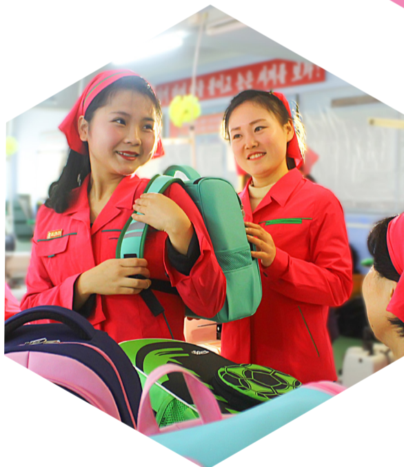
At the Pyongyang Bag Factory.

Working people across the country produce essential goods for students with sincerity