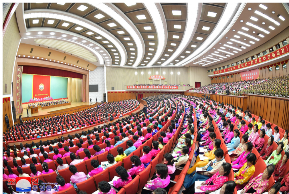
The third national meeting of active neighbourhood unit leaders is held in Pyongyang on March 16-17.