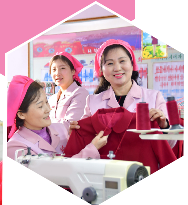
At the Pyongyang School Uniform Factory.