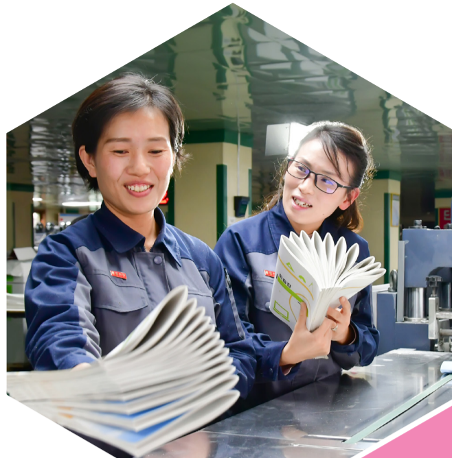
At the Mindulle Notebook Factory.

The happy laughter of children and their song "We Are the Happiest in the World" are resounding far and wide on this land as the most beautiful and wonderful hymn to the great Kim Jong Un's era and the motherly Party.