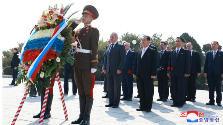
The delegation of the Security Council of the Russian Federation led by Secretary Sergei Shoigu lays a wreath at the Liberation Tower in Pyongyang on March 21.