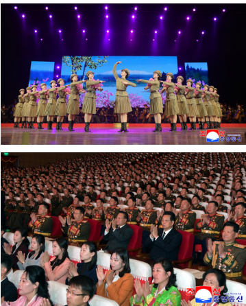
The Song and Dance Ensemble of the Ministry of National Defence puts on a music and dance performance "Eternal echo from Paektu campus" at the April 25 House of Culture in Pyongyang on April 25 in celebration of the 93rd founding anniversary of the KPRA.