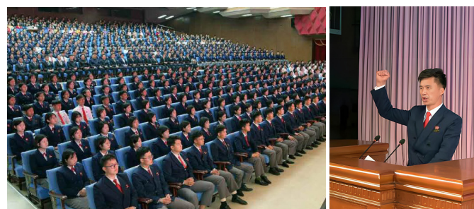
A meeting of youth and students is held at the Central Youth Hall in Pyongyang on April 24.

The dance party ended with the song of "We Will Defend General Kim Jong Un with Our Lives".