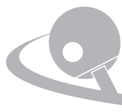
TABLE-TENNIS PLAYERS AMONG TOP 10 PLAYERS OF DPRK