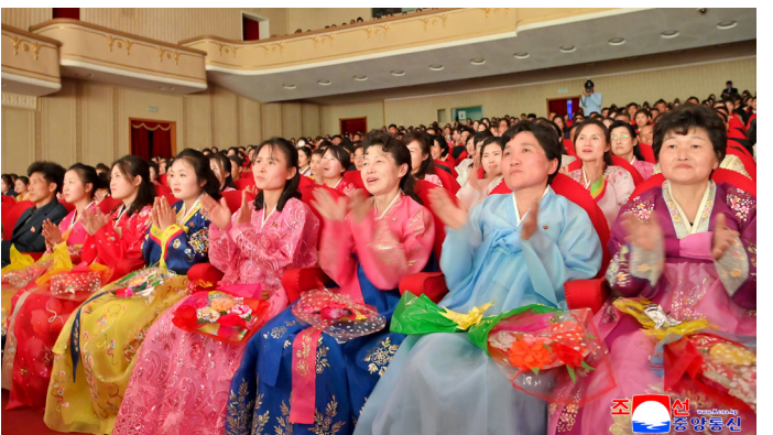
The Ninth April Spring People's Art Festival is held with splendour at theatres and halls in the capital city of Pyongyang.