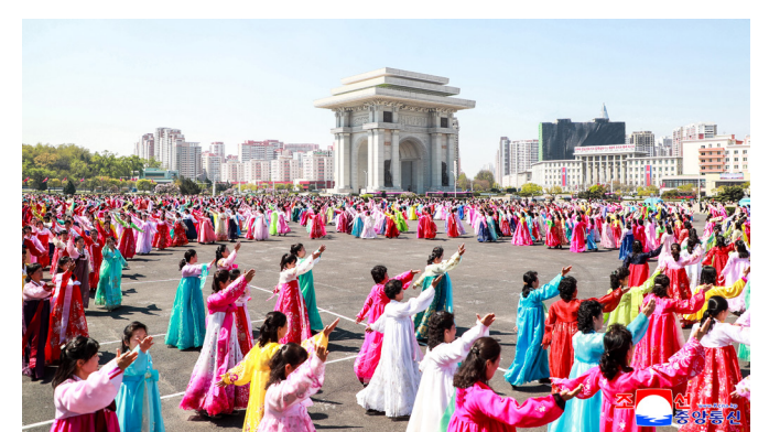
A dance party of women's union officials and members takes place at the plaza of the Arch of Triumph in Pyongyang on April 25.

They called for making a positive contribution to consolidating in every way the military muscle of the country, keeping in mind the pride that no one in the world can match the Korean People's Army thanks to Kim Jong Un who is glorifying forever the outstanding military ideas of the peerlessly great men and ushering in a golden age of building the revolutionary armed forces.