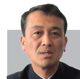
Han Song II, department head of the Intellectual Property Administration of the DPRK

April 26 is World Intellectual Property Day.