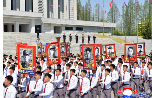
A commemorative march of successors takes place in Pyongyang on April 25.