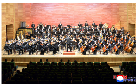
The 93rd anniversary of the KPRA is significantly celebrated throughout the country.

establishments throughout the country provided diverse holiday services. The happy